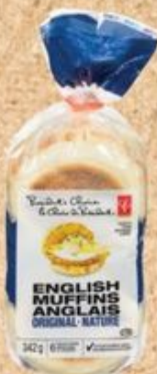
PC® English Muffins, 6's, selected varieties