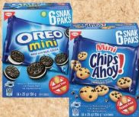
Christie Mini Cookies, Snack Packs Selected Varieties, 150-200 g