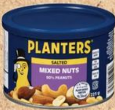
Planters salted mixed nuts, 225 g