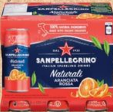
San Pellegrino Italian sparkling drinks, Selected varieties, 6x330 mL