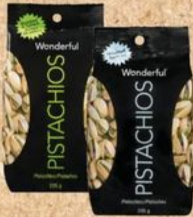
Wonderful Pistachios, salted or unsalted, 225 g, product of U.S.A.