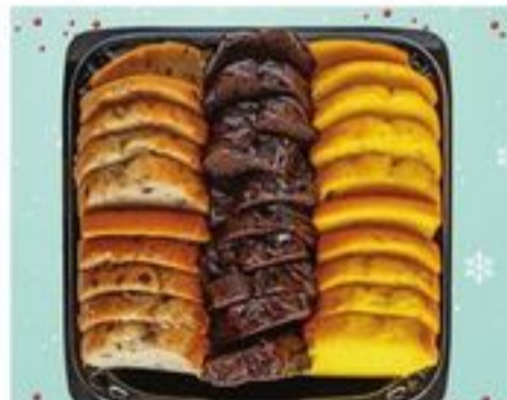
30 COUNT Cream Cake Tray $19 99