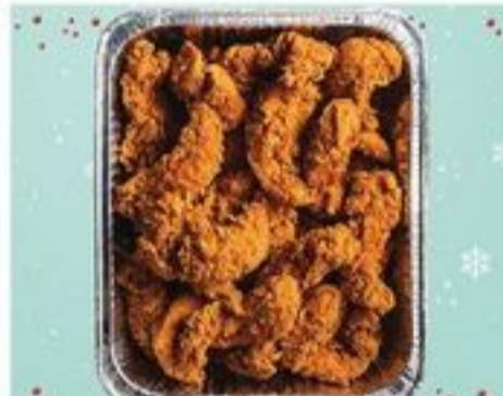
25 COUNT Fried Chicken Tenders $39 99