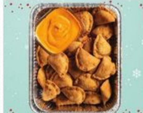
25 COUNT Mini Meat Pies Tray $25 99