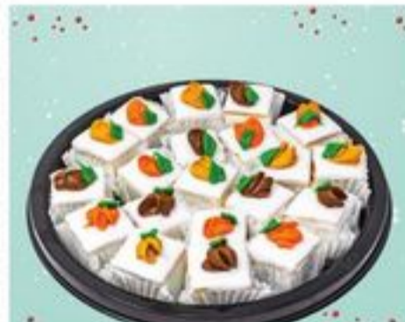
LARGE 20 CT White Almond Petit Fours $24 99