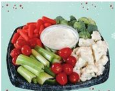
FRESH MADE IN OUR PRODUCE DEPT 12 INCH Vegetable Tray With Dip $19 99