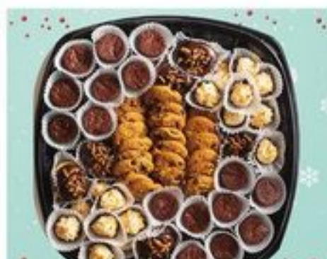
66 COUNT Cookie & Brownie Tray $29 99