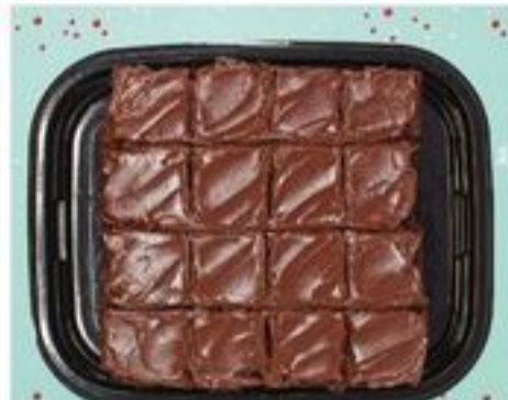
16 COUNT Brownie Tray $14 99