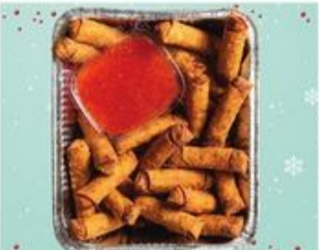
25 COUNT Eggroll Tray $27 99