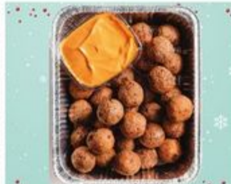
40 COUNT Pepper Jack Boudin Balls $39 99