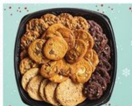
24 COUNT Gourmet Cookie Tray $32 99