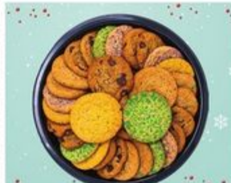
36 COUNT Cookie Party Tray $19 99