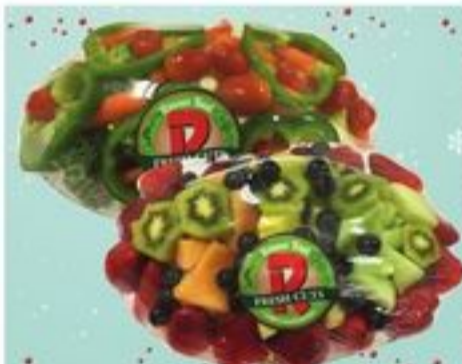
FRESH MADE IN OUR PRODUCE DEPARTMENT Vegetable or Fruit Luau Bowl $6 79 LB