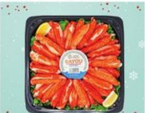
SURIMI BLEND OF CRAB MEAT AND ALASKA POLLOCK Alaska Snow Leg Platter $18 99