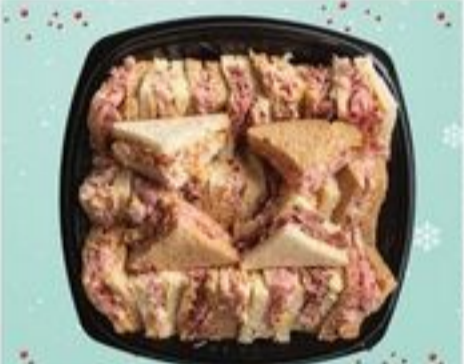
24 COUNT Finger Sandwich Tray $18 99