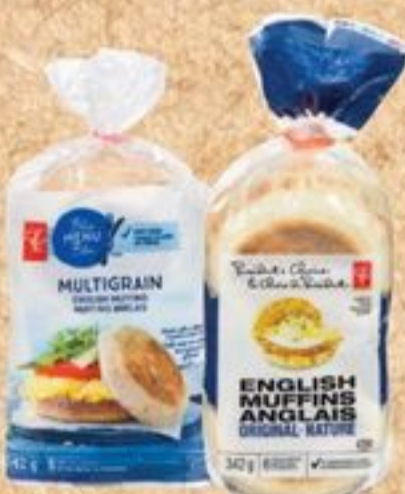
PC® or PC® Blue Menu English Muffins, Selected varieties, 6s, 342 g 20810879_EA/20810796_EA