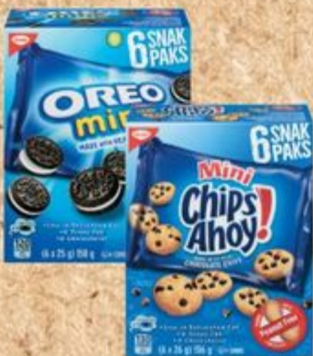
Christie Mini Cookies, Snak Paks Selected varieties, 150-200 g 21585155_EA/21585047_EA