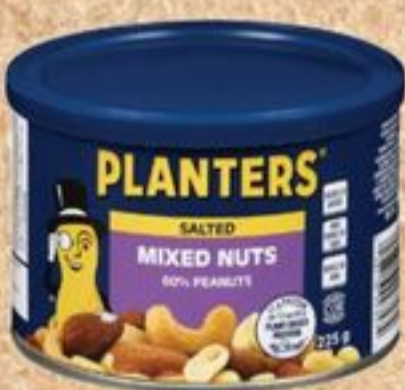
Planters salted mixed nuts, 225 g 21620001_EA