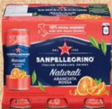
SanPellegrino Naturali Italian sparkling drinks Selected varieties, 6x330 mL 21433206_EA