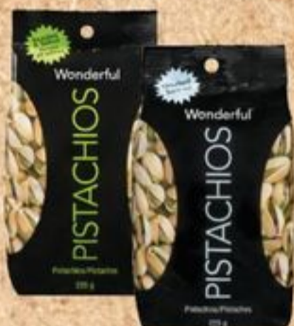
Wonderful Pistachios, Salted & Unsalted, 225 g 21018439_EA/21085963001_EA