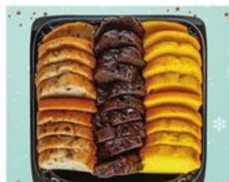
30 COUNT Cream Cake Tray $19 99