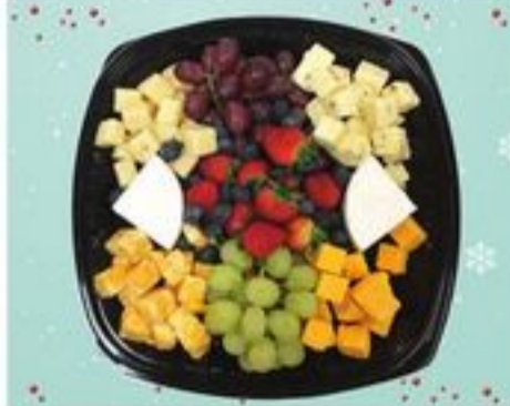
12 INCH Fruit & Cheese Tray $29 99