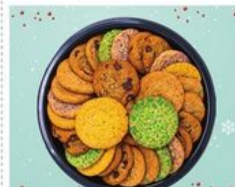
36 COUNT Cookie Party Tray $19 99