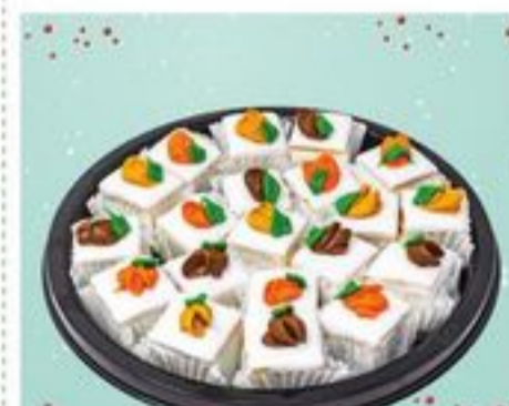
LARGE 20 CT White Almond Petit Fours $24 99