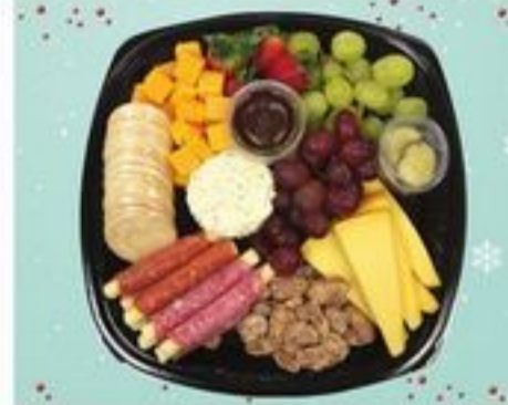
12 INCH Sampler Charcuterie Tray $29 99