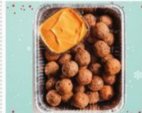
40 COUNT Pepper Jack Boudin Balls $39 99