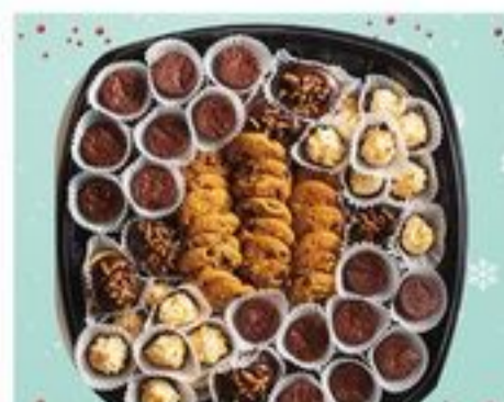
66 COUNT Cookie & Brownie Tray $29 99