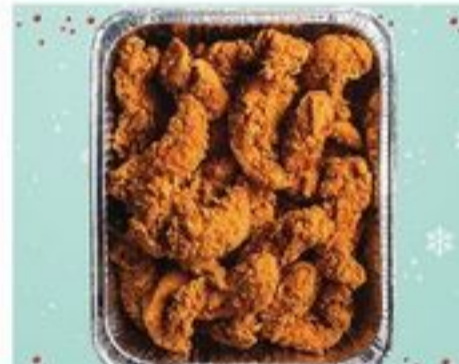
25 COUNT Fried Chicken Tenders $39 99