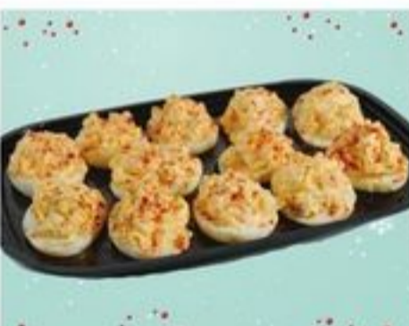
FRESH MADE IN OUR SEAFOOD DEPARTMENT ONE DOZEN Cajun Shrimp or Cajun Crab Deviled Eggs $9 99