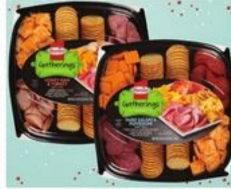
28 OZ Hormel Gatherings Party Tray $14 99