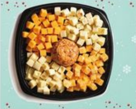
12 INCH Cheese Tray $24 99