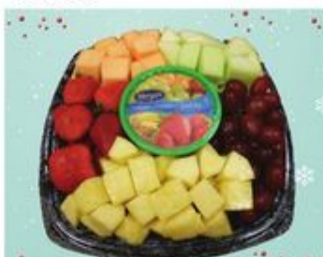
FRESH MADE IN OUR PRODUCE DEPT 12 INCH Fruit Tray With Dip $23 99