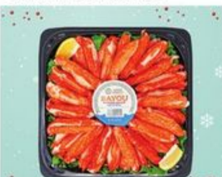
SURIMI BLEND OF CRAB MEAT AND ALASKA POLLOCK Alaska Snow Leg Platter $18 99