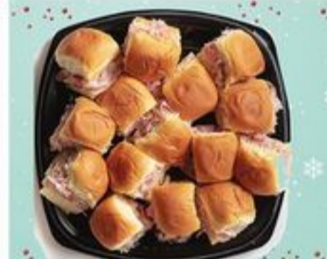
15 COUNT King's Hawaiian Ham & Swiss Tray $23 99