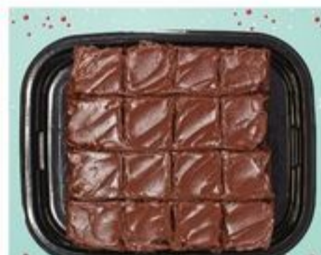
16 COUNT Brownie Tray $14 99