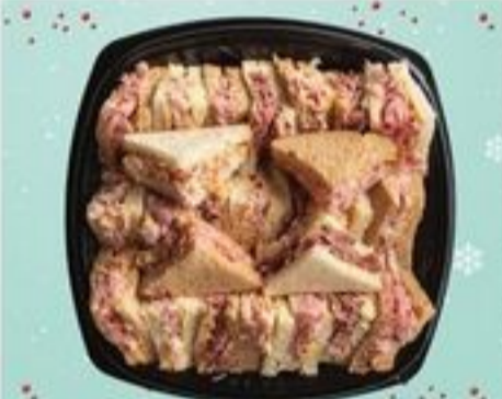
24 COUNT Finger Sandwich Tray $18 99