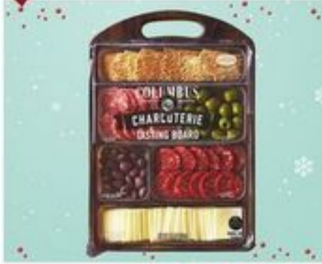
12.5 OZ Columbus Charcuterie Tasting Board $14 99

Please contact your local Rouses or email catering@rouses.com to place an order.