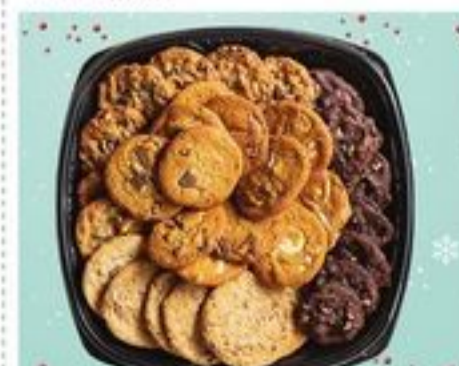
24 COUNT Gourmet Cookie Tray $32 99