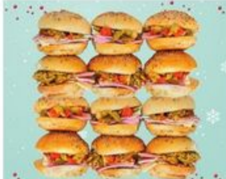
12 COUNT Mini Muffaletta Tray $20 99