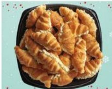
25 COUNT Chicken Salad Croissants $33 99