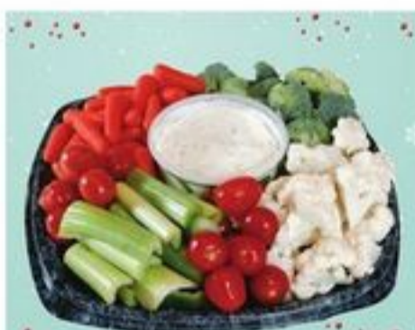
FRESH MADE IN OUR PRODUCE DEPT 12 INCH Vegetable Tray With Dip $19 99