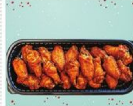
20 COUNT Chicken Wings $17 99