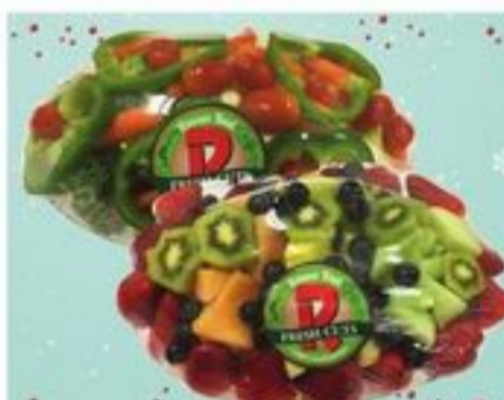
FRESH MADE IN OUR PRODUCE DEPARTMENT Vegetable or Fruit Luau Bowl $6 79 LB