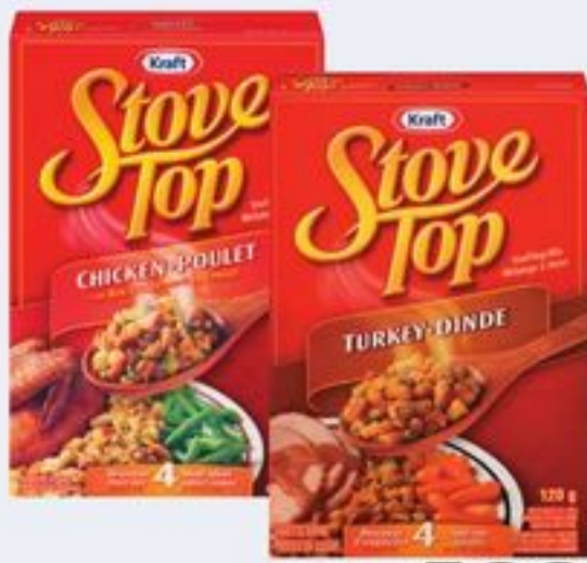
STOVE TOP STUFFING SELECTED VARIETIES 120 G 2009598001_EA/20310507001_EA