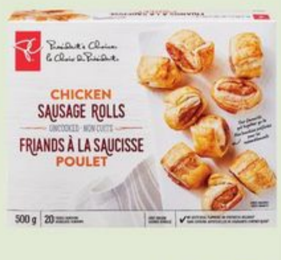
PC ® CHICKEN SAUSAGE ROLLS FROZEN 500 G 21439588_EA