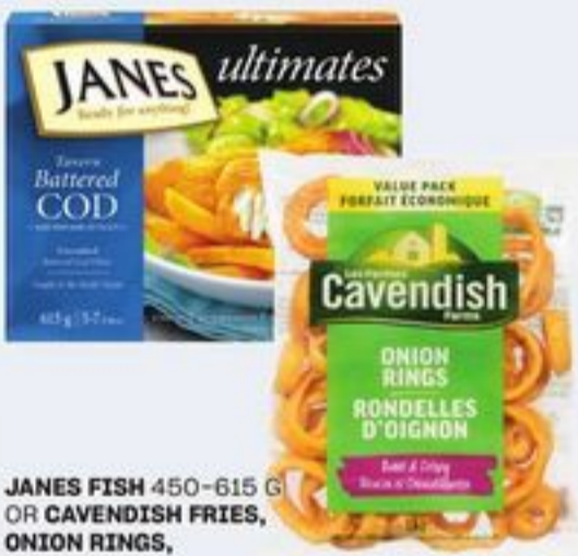
JANES FISH 450-615 G OR CAVENDISH FRIES, ONION RINGS, WEDGES OR HASHBROWNS 1-2.25 KG SELECTED VARIETIES FROZEN 20048538_EA 20827761_EA