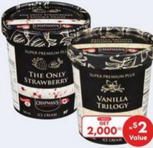
CHAPMAN'S SUPER PREMIUM PLUS ICE CREAM SELECTED VARIETIES FROZEN 500 ML 21511087_EA/21511200_EA