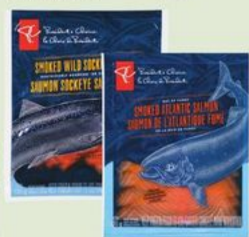
PC® SMOKED SALMON SELECTED VARIETIES FROZEN 125/150 G 20055009_EA 20108286_EA