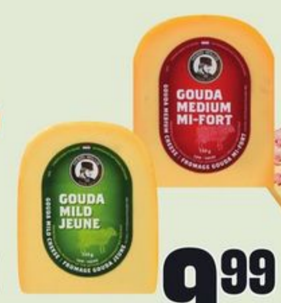
HENRI WILLIG GOUDA 350 G 21345046_EA