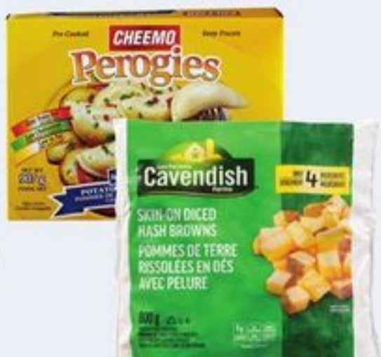
CHEEMO PEROGIES 745-907 G OR CAVENDISH HASHBROWNS 800 G SELECTED VARIETIES FROZEN 20527369_EA/21604103_EA