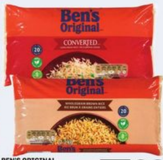
BEN'S ORIGINAL CONVERTED, WHOLE GRAIN OR LONG GRAIN RICE SELECTED VARIETIES 1.6/2.2 KG 21535549_EA 21535571_EA