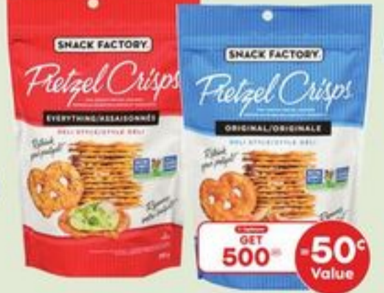
SNACK FACTORY PRETZEL CRISPS SELECTED VARIETIES 200 G 20948904_EA 20948940_EA