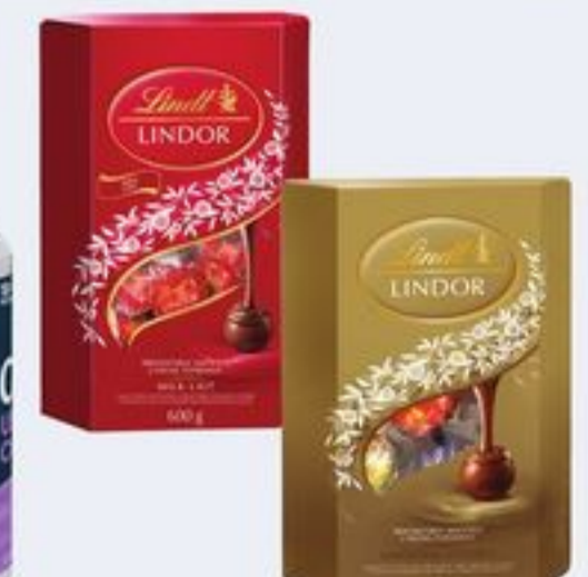
LINDT CORNET SELECTED VARIETIES 600 G 20215793001_EA 20215793002_EA