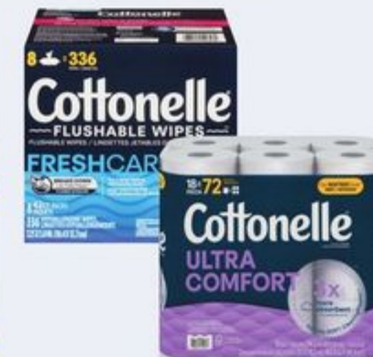
COTTONELLE BATHROOM TISSUE 18-72 ROLLS OR FLUSHABLE WIPES 8'S SELECTED VARIETIES 21315428_EA/21594688_EA