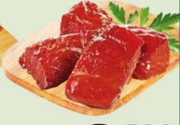
SMOKED SALMON NUGGETS PREVIOUSLY FROZEN 48.48/KG 21513259_KG