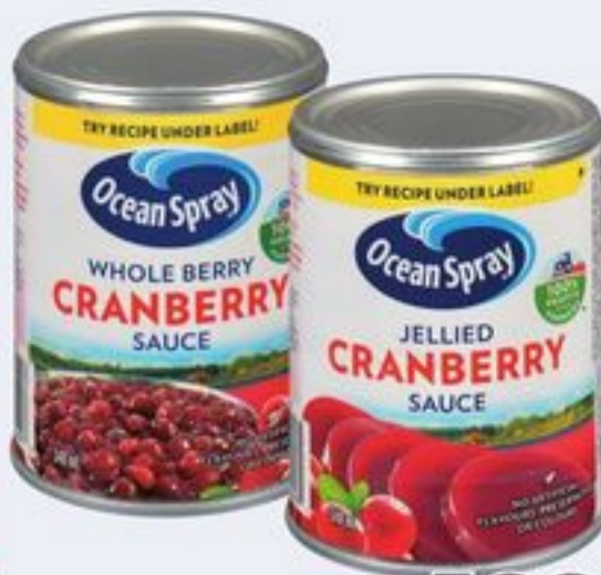
OCEAN SPRAY CRANBERRY SAUCE WHOLE OR JELLIED 348 ML 20022893001_EA/20022893002_EA