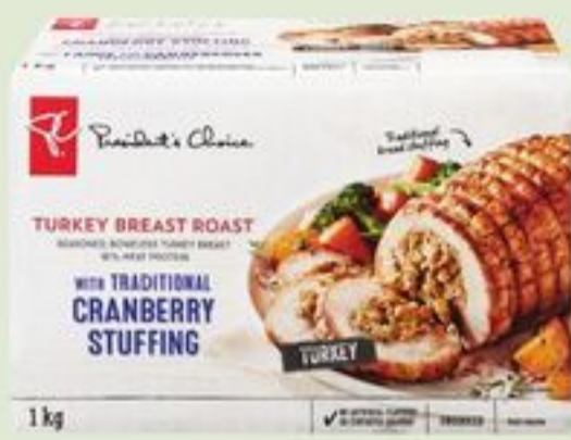
PC ® TURKEY STUFFED ROAST FROZEN 1 KG 20822446_EA