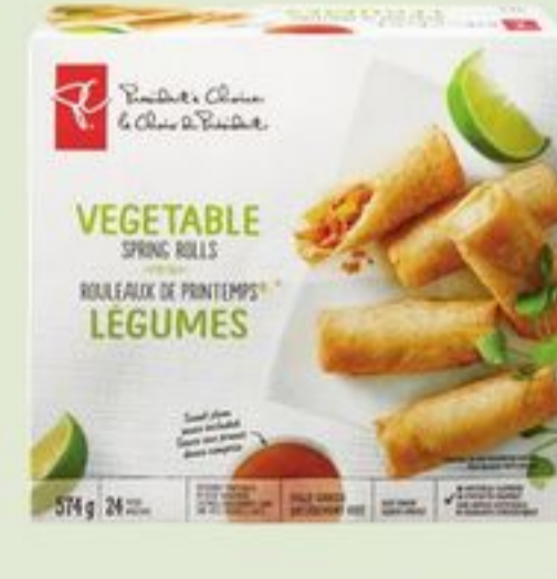
PC ® VEGETABLE SPRING ROLLS FROZEN 574 G 20698096_EA