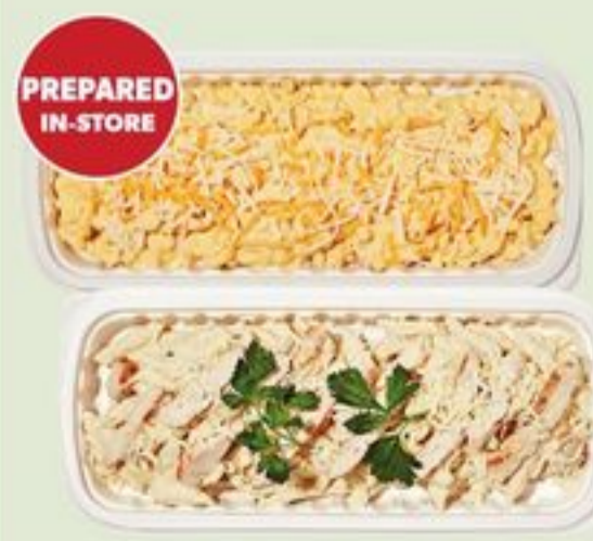
IN-STORE PREPARED PASTA TRAY 1-1.2 KG 21395979_EA 21630204_EA