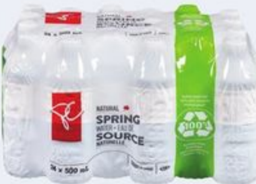
PC® SPRING WATER 24X500 ML 20137898_C24