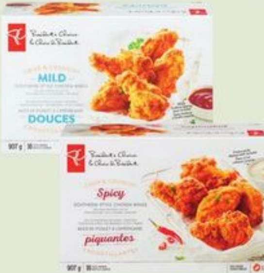
PC ® WINGS SELECTED VARIETIES, FROZEN 700-907 G 20708932_EA/20708933_EA