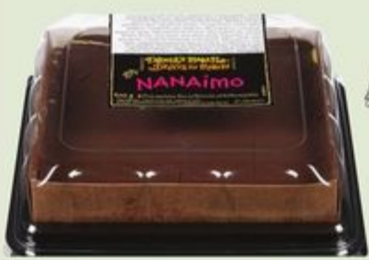
FARMER'S MARKET SQUARES SELECTED VARIETIES 400/450 G 21216501_EA