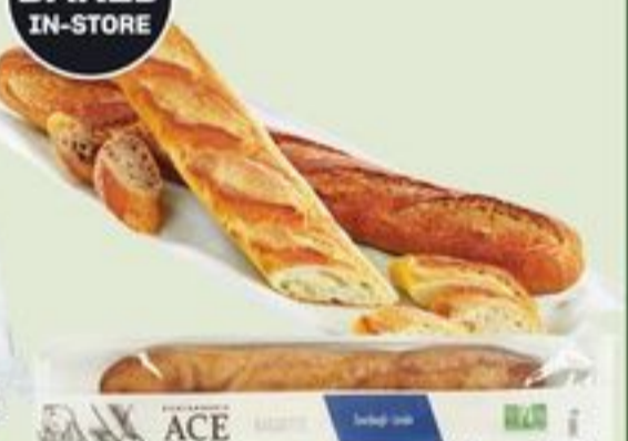
ACE BAKERY BAGUETTE SELECTED VARIETIES 325-400 G 20171171_EA 21314348_EA