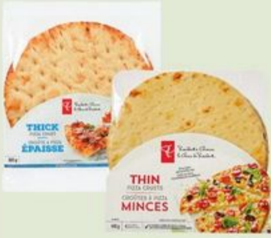
PC PIZZA CRUST SELECTED VARIETIES 300/440 G 20896528_EA 21416545_EA