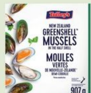
TALLEY'S NEW ZEALAND GREENSHELL MUSSELS FROZEN 907 G 21557953_EA