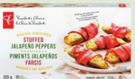
PC ® BACON WRAPPED STUFFED JALAPENO PEPPERS FROZEN 225 G 21048989_EA