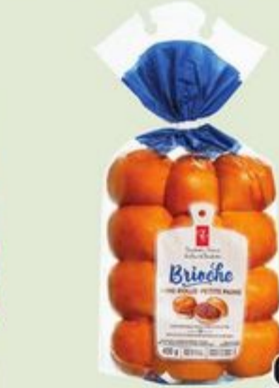
PC BRIOCHE MINI ROLLS 400 G 21410779_EA