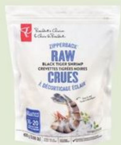
PC® BLACK TIGER SHRIMP RAW ZIPPERBACK® 16-20 PER LB 400 G FROZEN 20801192_EA