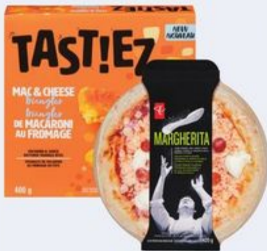
PC® BLACK LABEL PIZZA 370-420 G OR TASTIEZ SHAREABLES 400 G SELECTED VARIETIES FROZEN 21531415_EA/21564489_EA