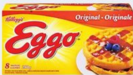
KELLOGG'S EGGO WAFFLES SELECTED VARIETIES FROZEN 8'S 20302779_EA