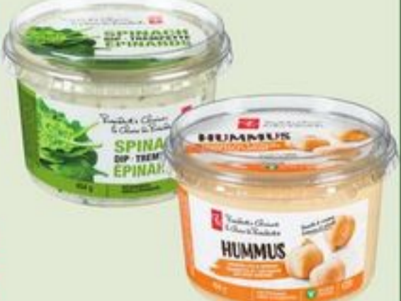
PC DIPS OR HUMMUS SELECTED VARIETIES 454 G 20584098_EA 20583725_EA