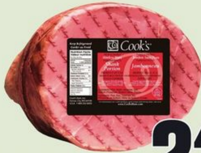
COOK'S PORTION HAM SHANK OR BUTT 5.49/KG 20555641_KG