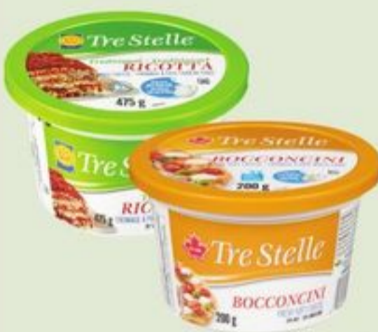
TRESTELLE BOCCONCINI 200 G OR RICOTTA 475 G SELECTED VARIETIES 20093652_EA 20318663_EA