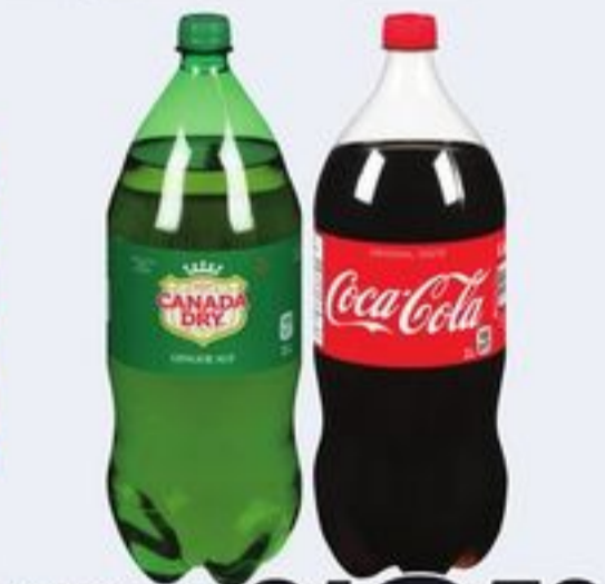
COCA-COLA OR CANADA DRY SOFT DRINKS SELECTED VARIETIES 2 L 20316026002_EA