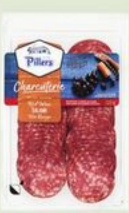
PILLER'S SLICED MEATS 125 G OR CASTELLO HAVARTI, CHEDDAR OR BLUE CHEESE 125-200 G SELECTED VARIETIES 20428574_EA 20574963_EA

GET 2,000 + Value when you spend "10" on