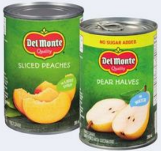
DEL MONTE CANNED FRUIT SELECTED VARIETIES 398 ML 20109862_EA/20296567008_EA