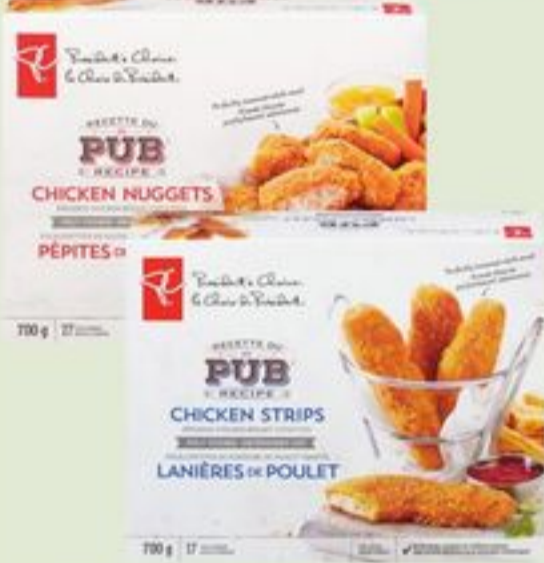
PC ® PUB RECIPE ™ OR GLUTEN-FREE CHICKEN SELECTED VARIETIES FROZEN 600/700 G 21201320_EA/21201321_EA