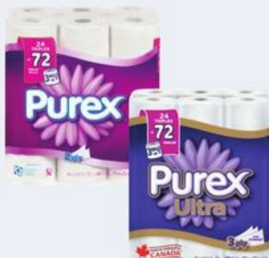
PUREX BATHROOM TISSUE SELECTED VARIETIES 24-72 ROLLS 21189854_EA/21443672_EA