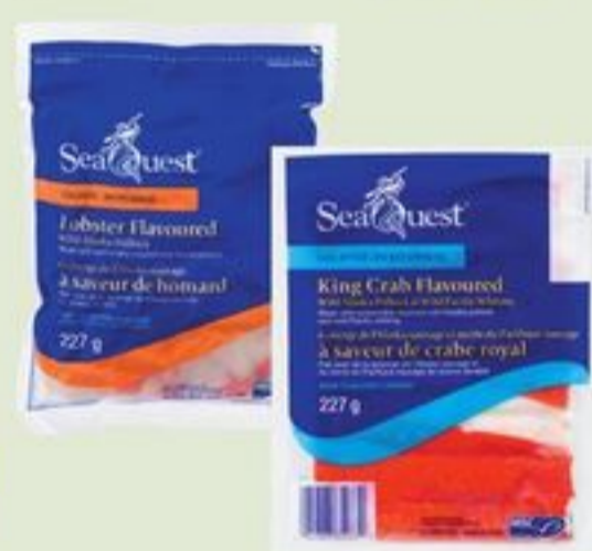
SEAQUEST® CRAB OR LOBSTER FLAVOURED POLLOCK FLAKES OR CHUNKS SELECTED VARIETIES READY-TO-EAT 227 G 20749798_EA/20749901_EA