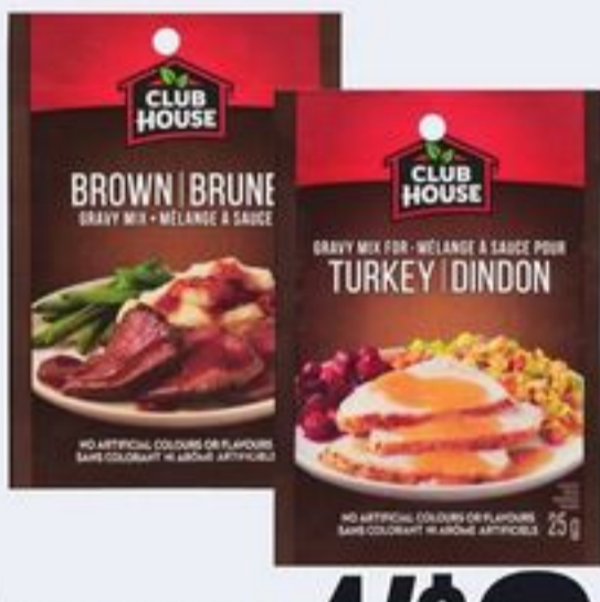
CLUB HOUSE GRAVY OR DRY SAUCE MIXES SELECTED VARIETIES 21-47 G 20302816001_EA 20302816004_EA