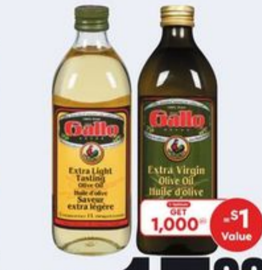
GALLO EXTRA VIRGIN OR LIGHT OLIVE OIL SELECTED VARIETIES 1 L 20069755_EA 20105368_EA