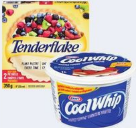
TENDERFLAKE PASTRY 255-397 G OR COOL WHIP DESSERT TOPPING 1 L SELECTED VARIETIES FROZEN 20030369001_EA/20303840001_EA