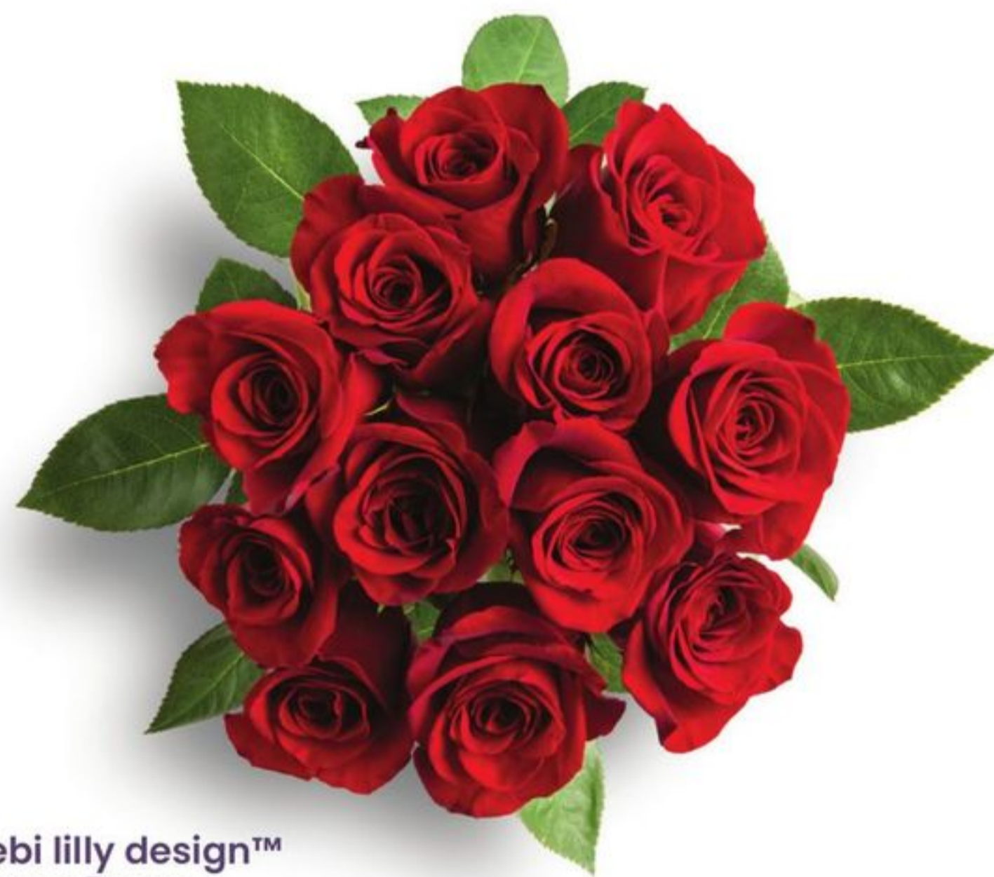
debi lilly design™ Dozen Roses