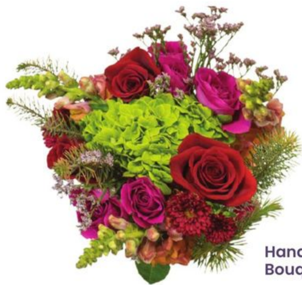
Hand Crafted Bouquet