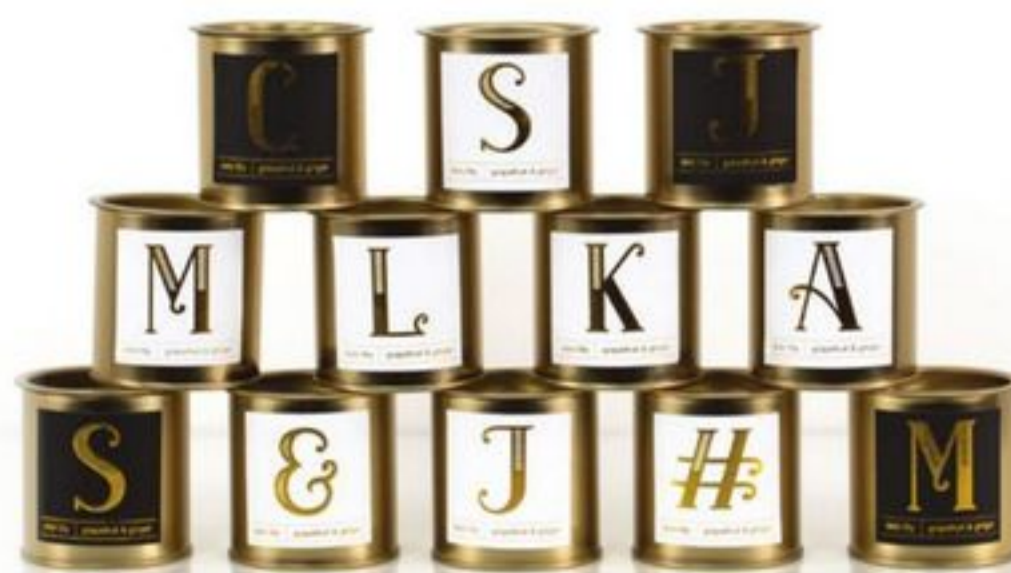
debi lilly design™ DL Everyday Alphabet Candle