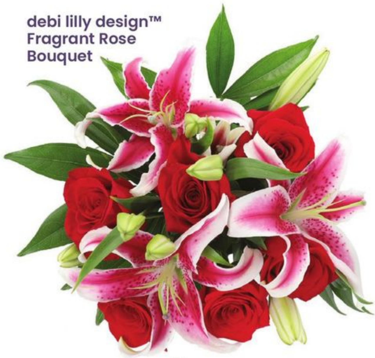
debi lilly design™ Fragrant Rose Bouquet