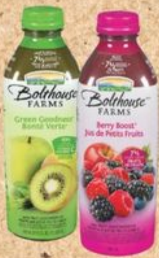
Bolthouse Farms Smoothies or Juice Selected varieties, 946 mL, Product of U.S.A.