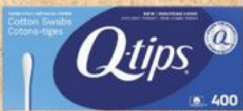
Q-tips Cotton Swabs 400's