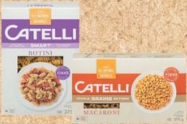
Catelli Smart or Healthy Harvest Pasta Selected varieties, 340 g/375 g