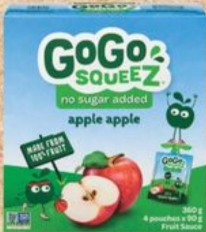
GoGo SqueeZ Fruit Sauce Selected varieties, 360 g