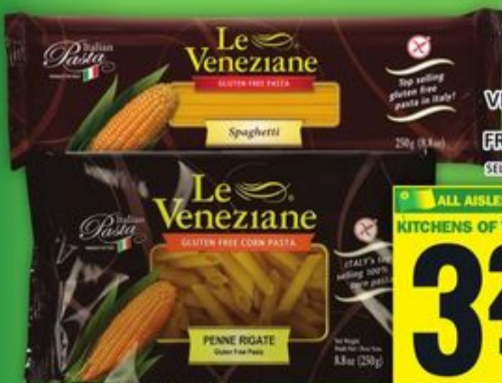
LE VENEZIANE GLUTEN FREE PASTA 250 G SELECTED VARIETIES

ALL AISLES LEAD HOME KITCHENS OF THE WORLD 4.49 EACH