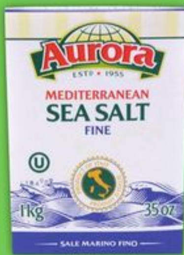
AURORA BOUILLON CUBES OR SEA SALT 66 G SELECTED VARIETIES

ALL AISLES LEAD HOME KITCHENS OF THE WORLD 3.29 EACH