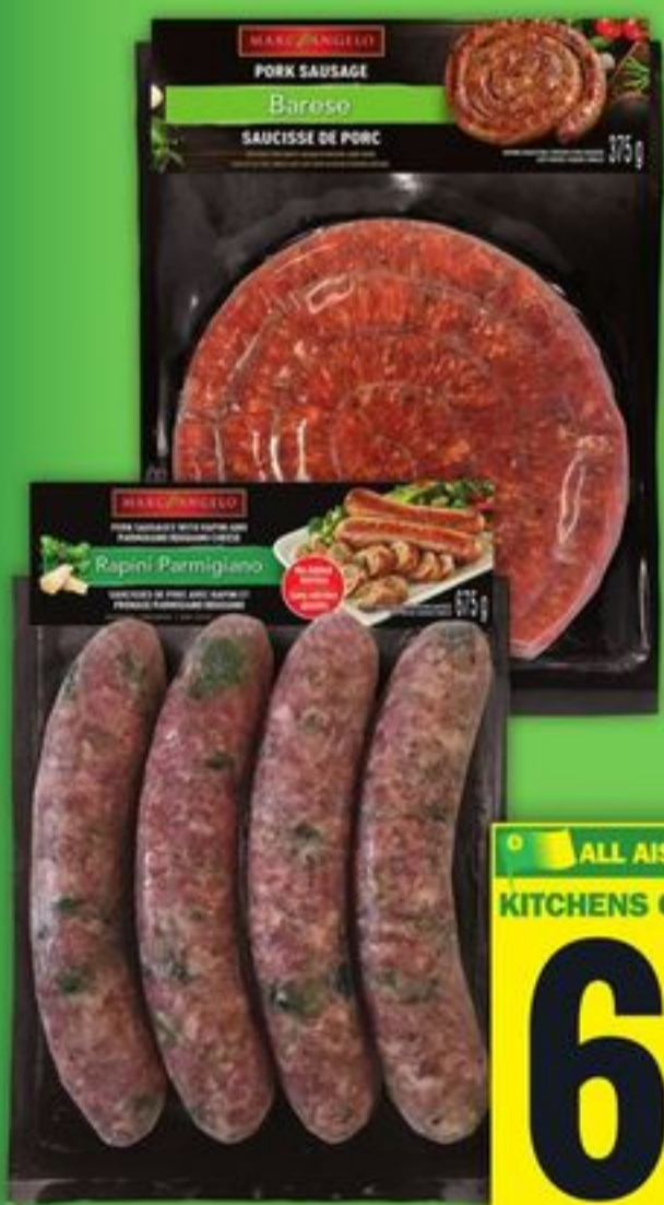
MARC ANGELO JUMBO PORK SAUSAGES 375 - 675 G FROZEN SELECTED VARIETIES

ALL AISLES LEAD HOME KITCHENS OF THE WORLD 4.99 EACH