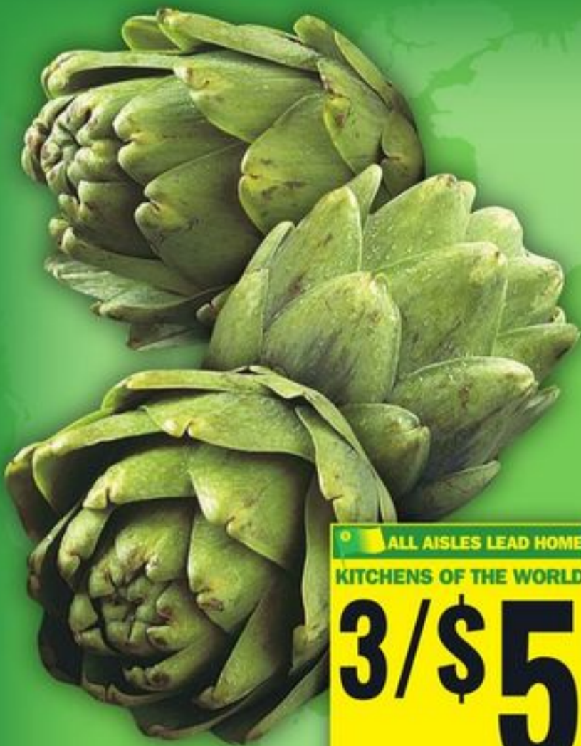
ARTICHOKES PRODUCT OF U.S.A.

ALL AISLES LEAD HOME KITCHENS OF THE WORLD 3/$5