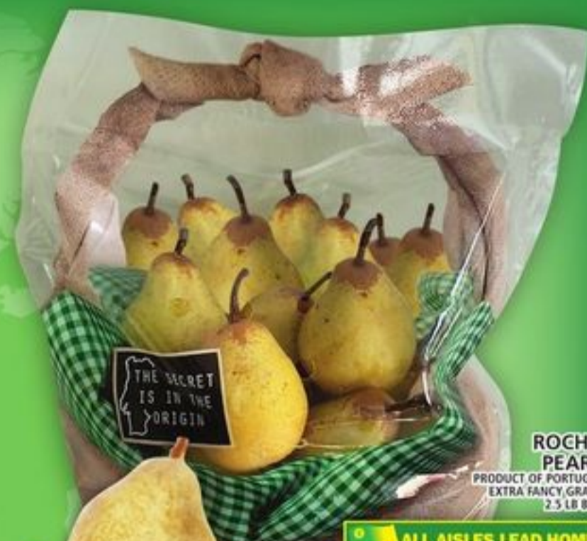
ROCHA PEARS PRODUCT OF PORTUGAL EXTRA FANCY GRADE 2.5 LB BAG

ALL AISLES LEAD HOME KITCHENS OF THE WORLD 3/$5