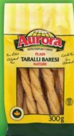
AURORA TARALLI 300 G SELECTED VARIETIES

ALL AISLES LEAD HOME KITCHENS OF THE WORLD 4.99 EACH