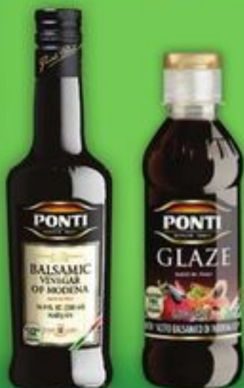
PONTI BALSAMIC VINEGAR OR GLAZE 200 / 500 ML SELECTED VARIETIES

ALL AISLES LEAD HOME KITCHENS OF THE WORLD 1.49 EACH