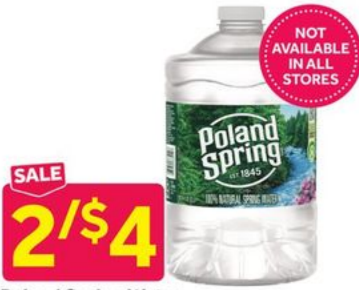
Poland Spring Water Selected Varieties, 101.4 fl. oz. btls., Plus Deposit Where Applicable 6929117