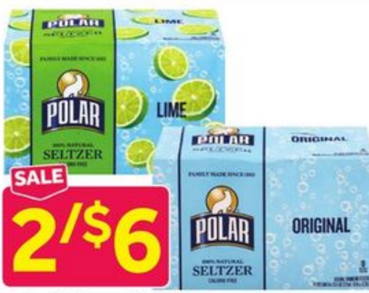
Polar Seltzer 6 Pack Selected Varieties, 6/7.5 fl. oz. cans, Plus Deposit Where Applicable 6913480