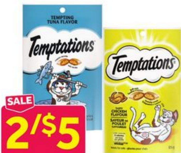
Temptations Cat Treats Selected Varieties, 2.1-3 oz. pkg. 6994194