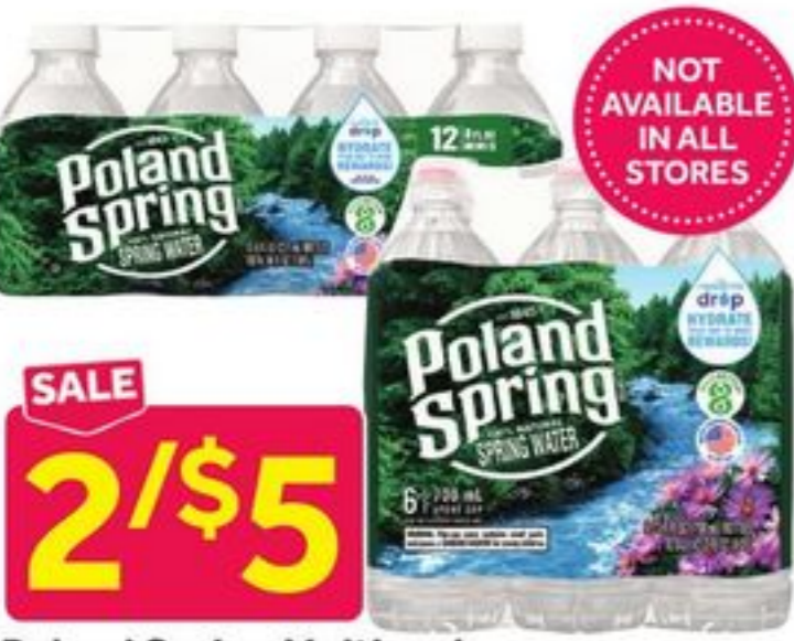
Poland Spring Multipack Selected Varieties, 6/23.7 fl. oz. btls or 12/8 fl. oz. btls., Plus Deposit Where Applicable 6929035