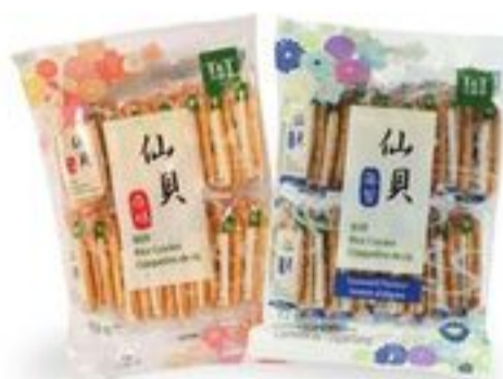
Rice Cracker (Original/Seaweed)