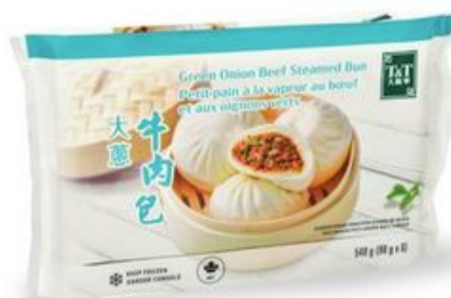
Green Onion Beef Steamed Bun