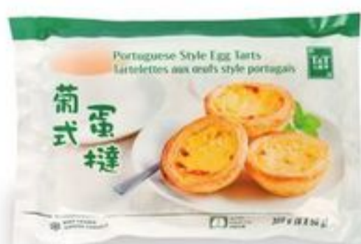
Portuguese Style Egg Tarts