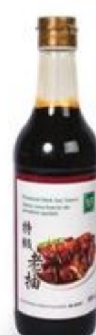
Premium Dark Soy Sauce