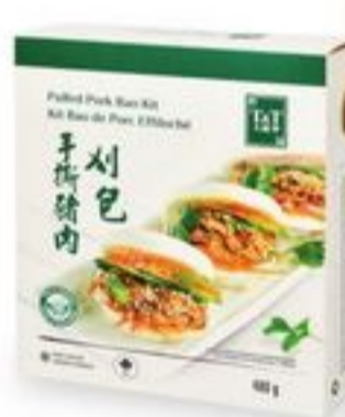
Pulled Pork Bao Kit