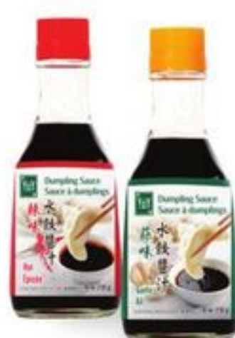
Dumpling Sauce (Hot/Garlic)