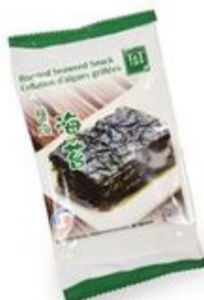
Roasted Seaweed Snack