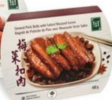
Stewed Pork Belly with Mustard Green