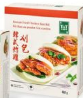
Korean Fried Chicken Bao Kit