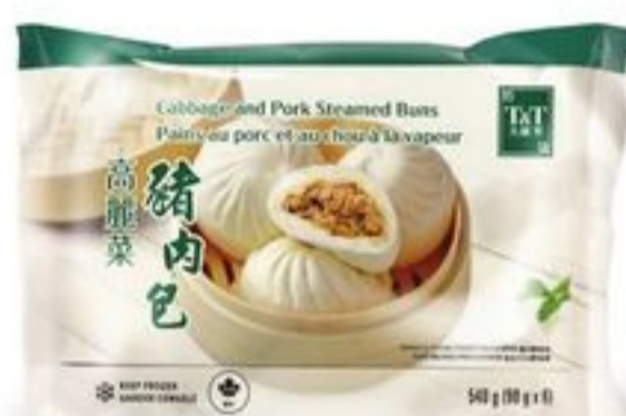
Cabbage and Pork Steamed Buns