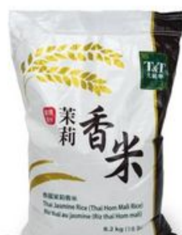
Thai Jasmine Rice