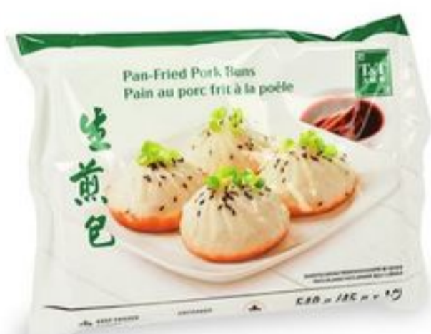
Pan-Fried Pork Buns