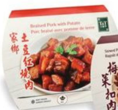
Braised Pork with Potato