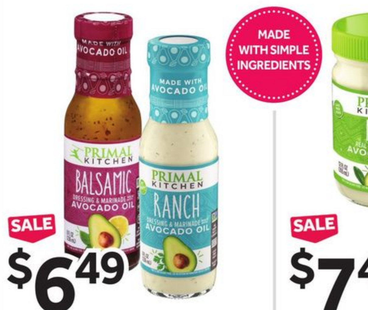
SALE $6.49 Primal Kitchen Salad Dressing Selected Varieties, 8 fl. oz. btl. 6967986