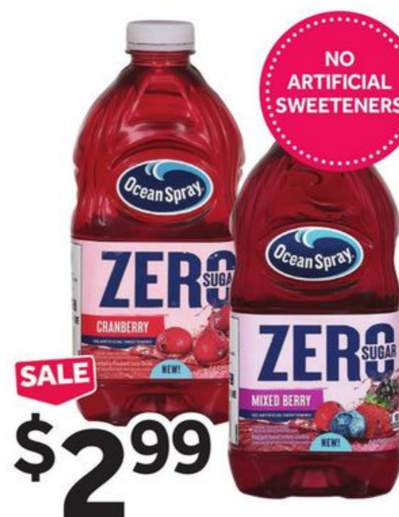
SALE $2.99 Ocean Spray Zero Sugar Juice Selected Varieties, 64 fl. oz. btl., Plus Deposit Where Applicable 6997505