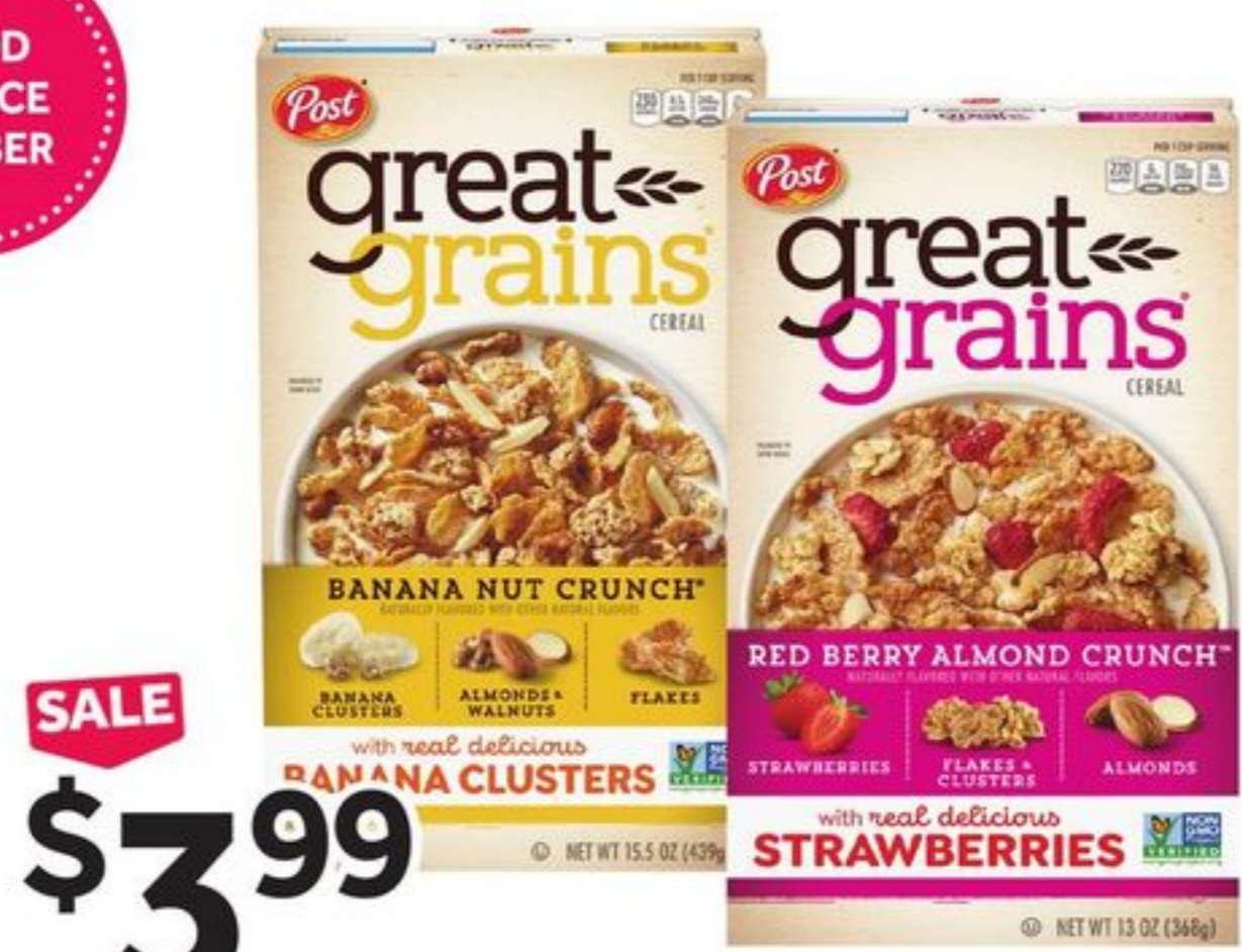
SALE $3.99 Post Great Grains Cereal Selected Varieties, 13.5-16 oz. box 7015172