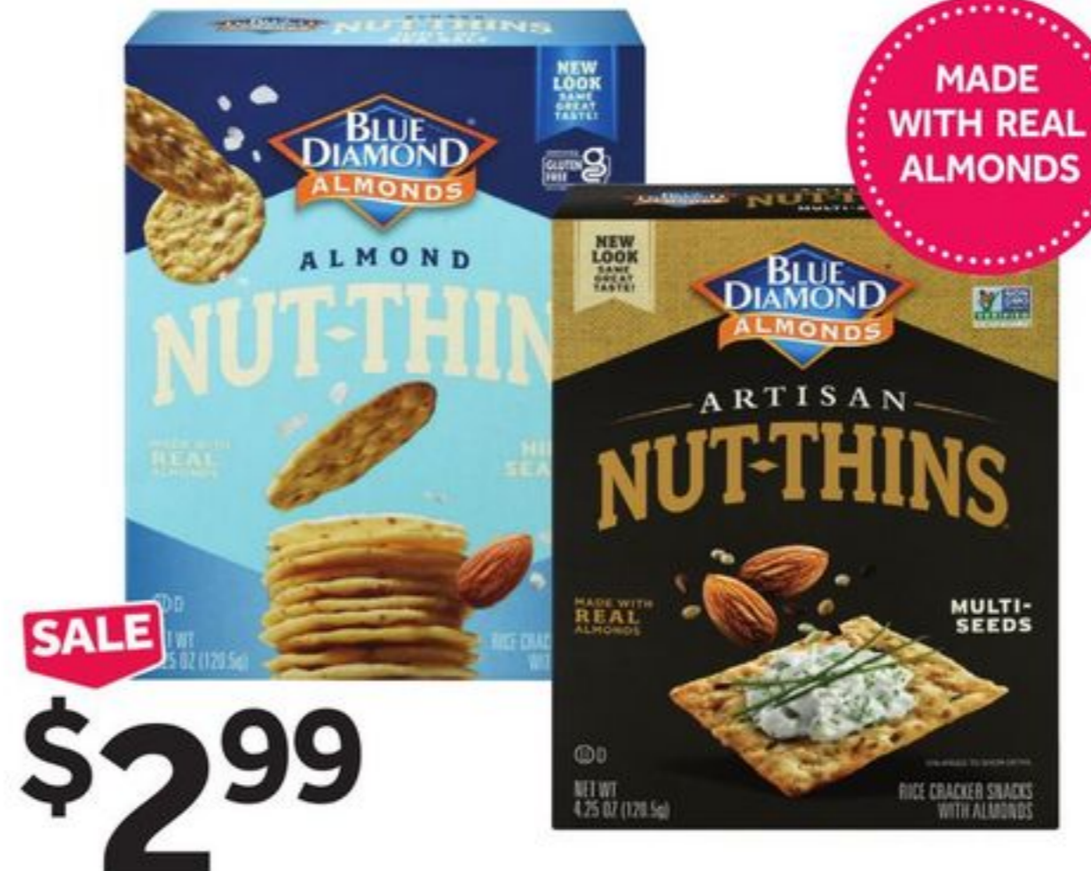
SALE $2.99 Blue Diamond Nut-Thins Crackers Selected Varieties, 4.25 oz. pkg. 6977842