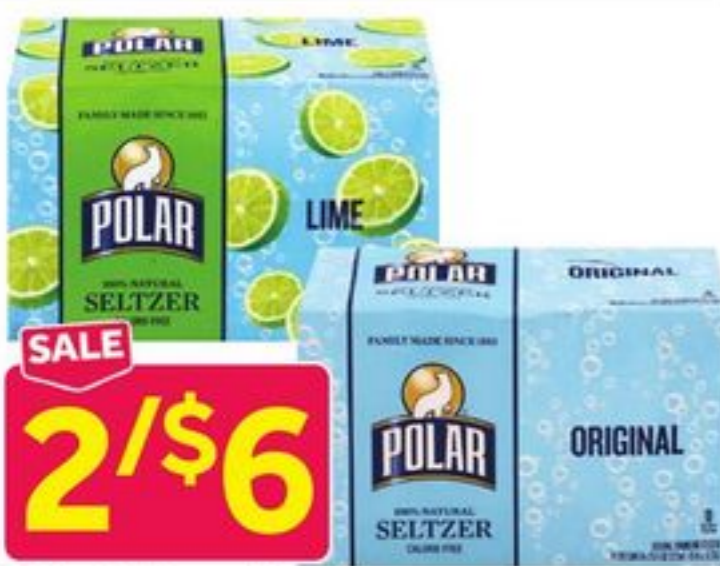
Polar Seltzer 6 Pack Selected Varieties, 6/7.5 fl. oz. cans, Plus Deposit Where Applicable 6913480