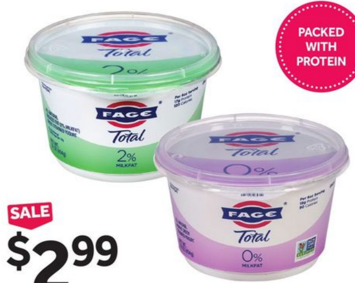
SALE $2.99 Fage Total Yogurt Selected Varieties, 16 oz. cont. 6977577