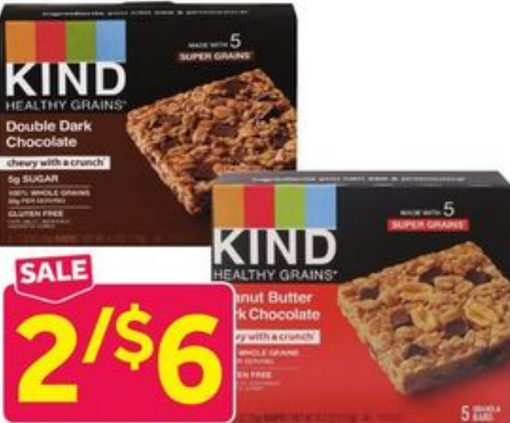
Kind Healthy Grains Granola Bars Selected Varieties, 5 ct. box 6982263