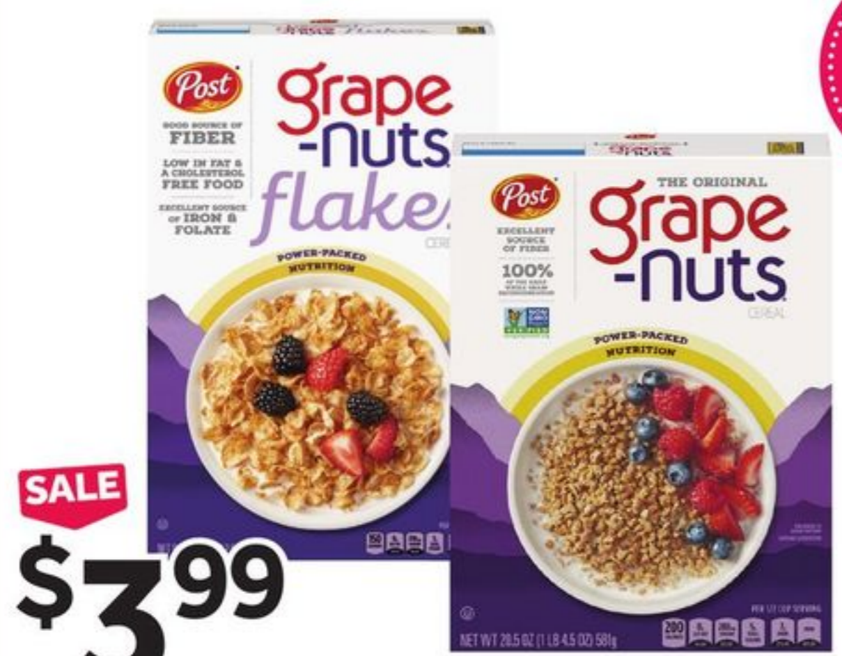
SALE $3.99 Post Grape Nuts Cereal Selected Varieties, 18-20.5 oz. box 7015172