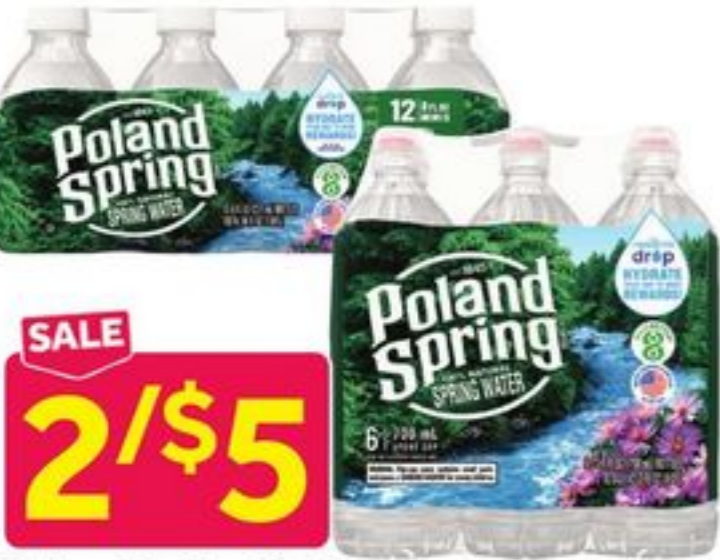
Poland Spring Multipack Selected Varieties, 6/23.7 fl. oz. or 12/8 fl. oz. btl., Plus Deposit Where Applicable 6929035