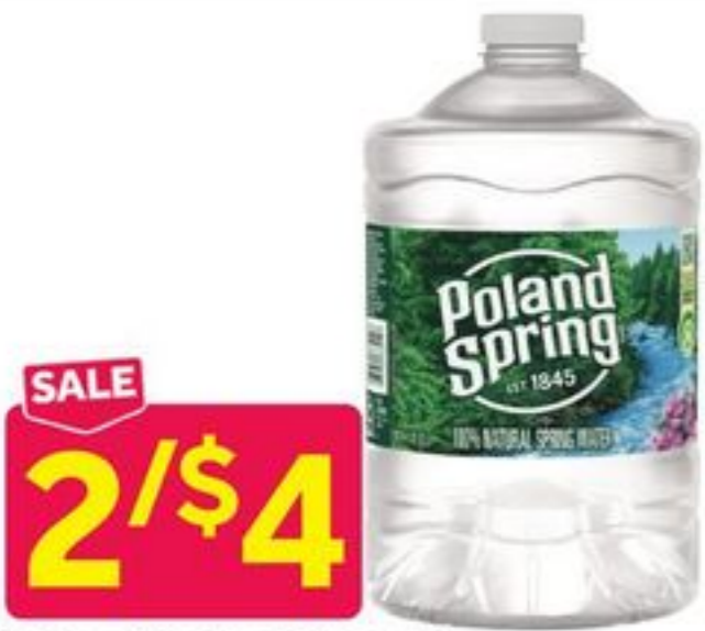
Poland Spring Water 3L Selected Varieties, 101.4 fl. oz. btl., Plus Deposit Where Applicable 6929117