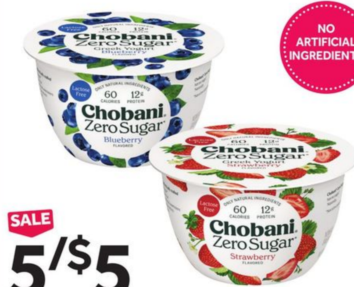
SALE 5/$5 Chobani Zero Sugar Selected Varieties, 5.3 oz. cup 6976788