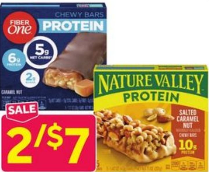
Nature Valley or Fiber One Protein Bars Selected Varieties, 5.85-8.85 oz. box 6984665