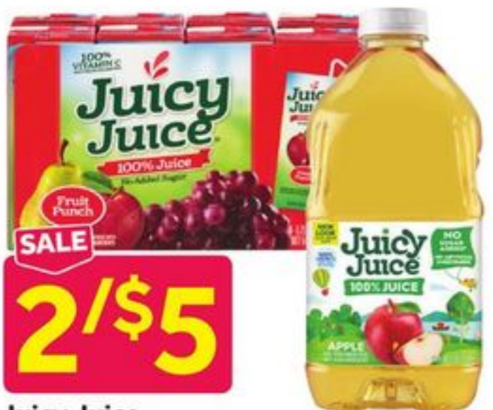
Juicy Juice Selected Varieties, 64 fl. oz. btl. or 8/6.75 fl. oz. boxes, Plus Deposit Where Applicable 6969725