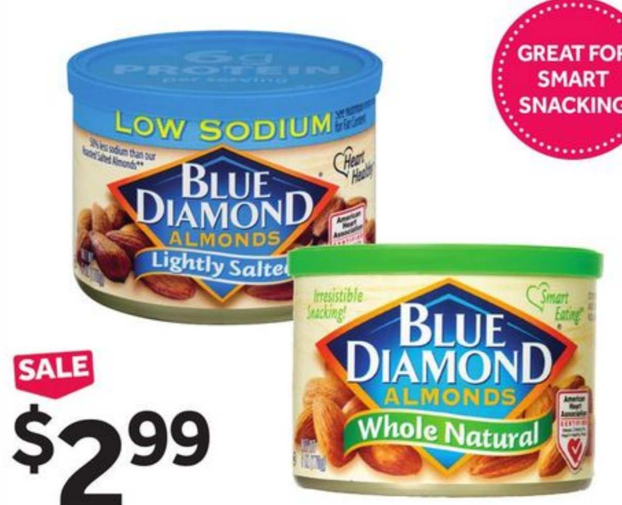
SALE $2.99 Blue Diamond Almonds Selected Varieties, 6 oz. can 6968708