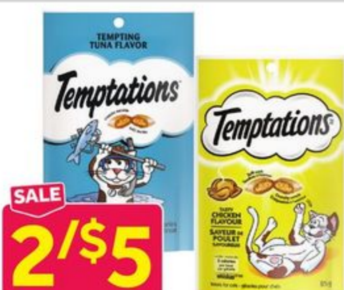
Temptations Cat Treats Selected Varieties, 2.1-3 oz. pkg. 6994194