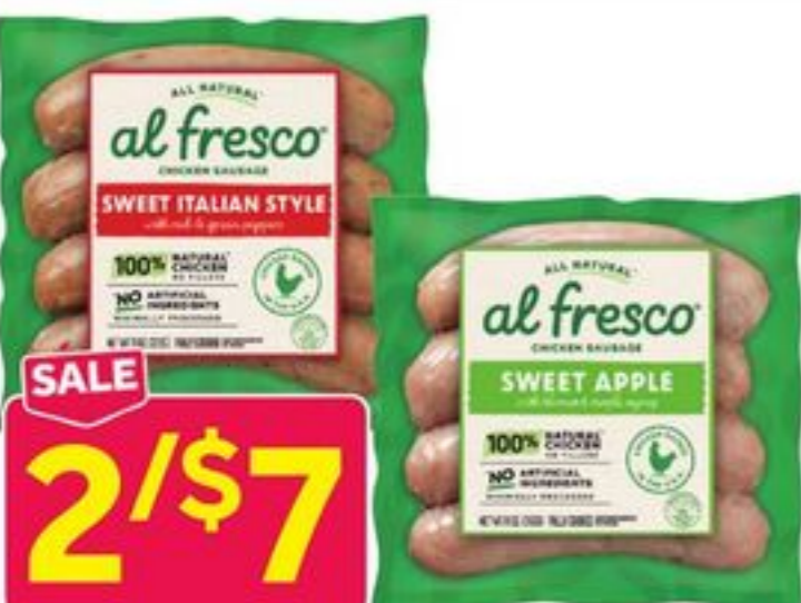
Al Fresco Chicken Sausage Selected Varieties, 11 oz. pkg. 6759778