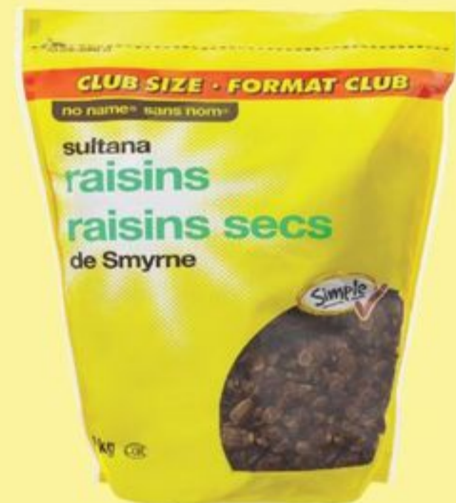
no name® sultana raisins club size, 2 kg 20647527_EA