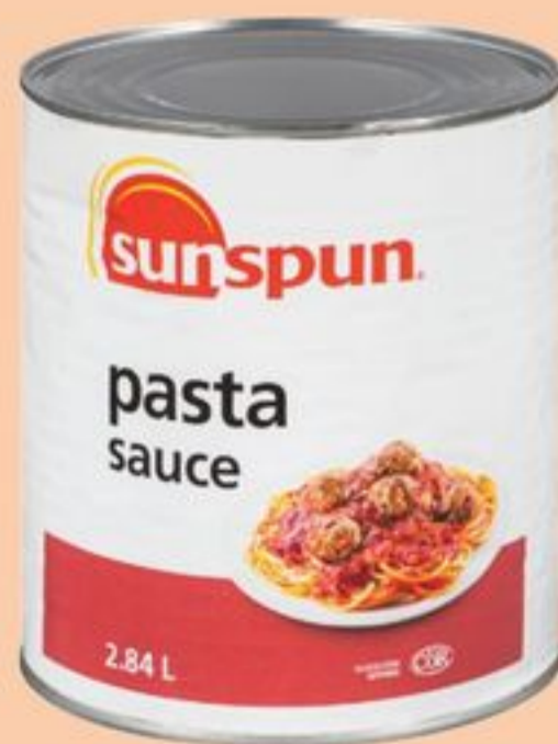
sunspun™ pasta or pizza sauce 2.84 L 20090059001_EA