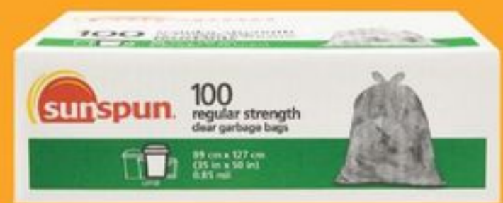
sunspun™ clear garbage bags 100 ct 21607973_EA