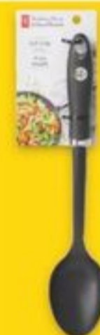
PC® SOFT GRIP NYLON SPOON 21331908 SA