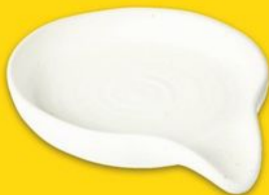
LIFE AT HOME™ RIBBED SPECKLE SPOON REST 21481723 SA