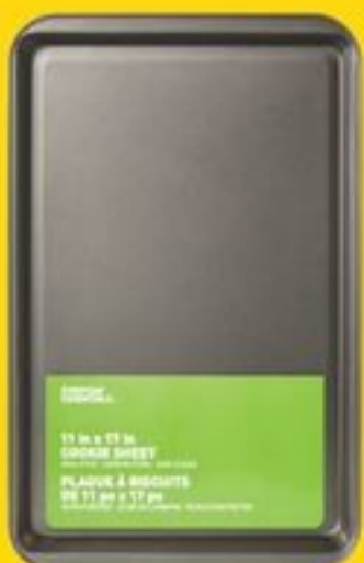
EVERYDAY ESSENTIALS™ LARGE COOKIE SHEET 20649142 SA