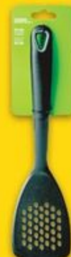
EVERYDAY ESSENTIALS™ NYLON SLOTTED TURNER 2121462 SA