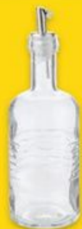
EVERYDAY ESSENTIALS™ OIL AND VINEGAR BOTTLE 21140647 SA