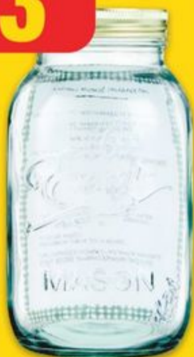
PC® MASON JAR 1.0 L 2093222 SA