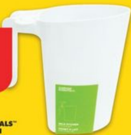
EVERYDAY ESSENTIALS™ MILK PITCHER WITH BAG OPENER 2083237 SA