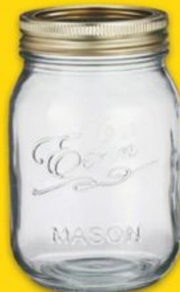
PC® MASON JAR 0.5 L 2093222 SA