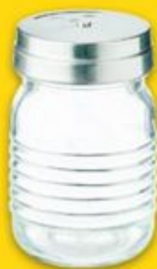
EVERYDAY ESSENTIALS™ SMALL SPICE SHAKER 2114054 SA