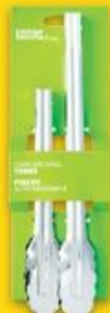
EVERYDAY ESSENTIALS™ STAINLESS STEEL TONGS 2-pack 21421491 SA