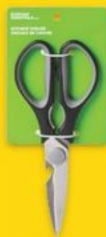
EVERYDAY ESSENTIALS™ KITCHEN SHEARS 20291314 SA