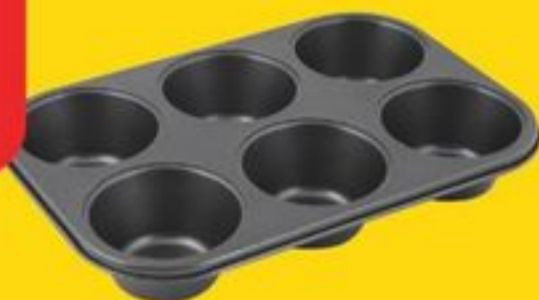
EVERYDAY ESSENTIALS™ JUMBO MUFFIN PAN 2089750 SA