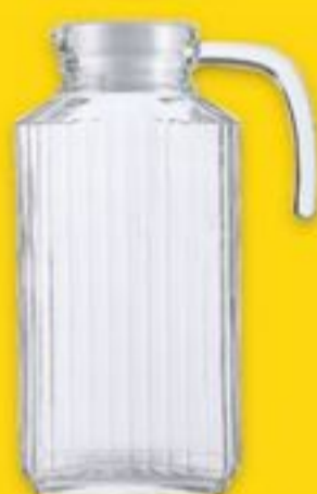
EVERYDAY ESSENTIALS™ FRIDGE PITCHER 20654809 SA