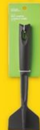
EVERYDAY ESSENTIALS™ NYLON MEAT CHOPPER 2149904 SA