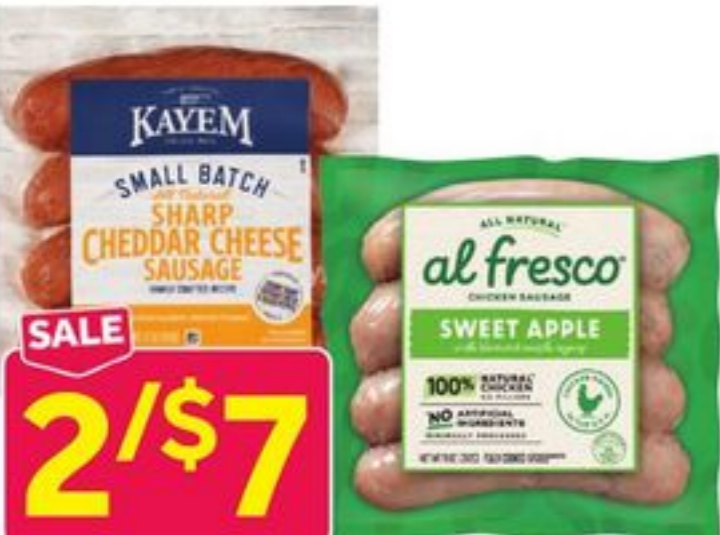
Al Fresco Chicken Sausage or Kayem Smoked Sausage Selected Varieties, 11–14 oz. pkg. 6891566