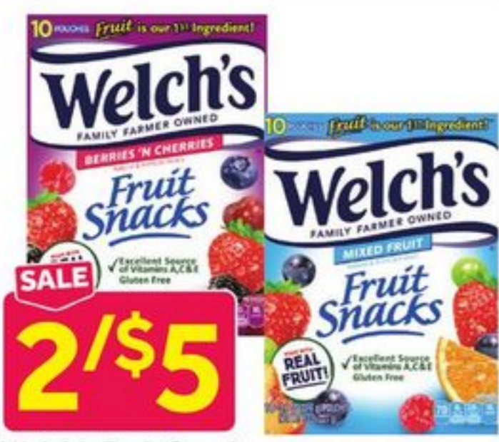
Welch's Fruit Snacks Selected Varieties, 5.6–9 oz. box 6967133