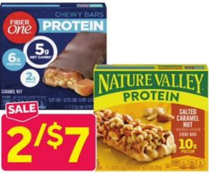
Nature Valley or Fiber One Protein Bars Selected Varieties, 5.85–8.85 oz. box 6984665