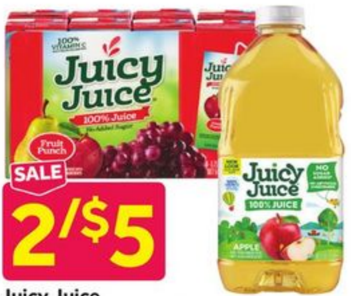
Juicy Juice Selected Varieties, 64 fl. oz. btl. or 8/6.75 fl. oz. boxes, Plus Deposit Where Applicable 6969725