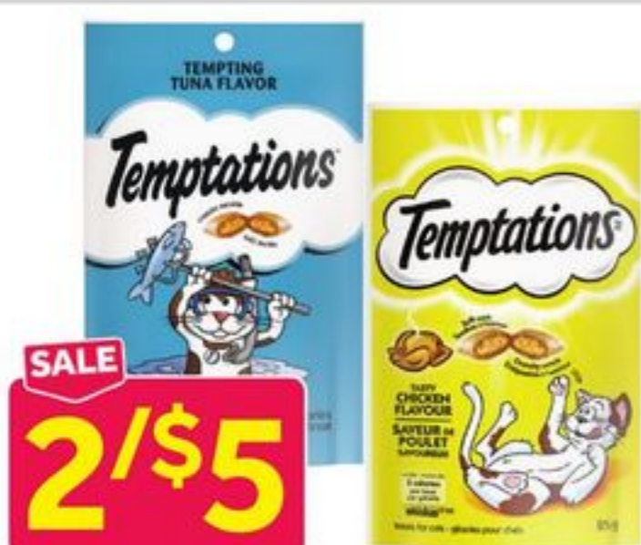
Temptations Cat Treats Selected Varieties, 2.1-3 oz. pkg. 6994194