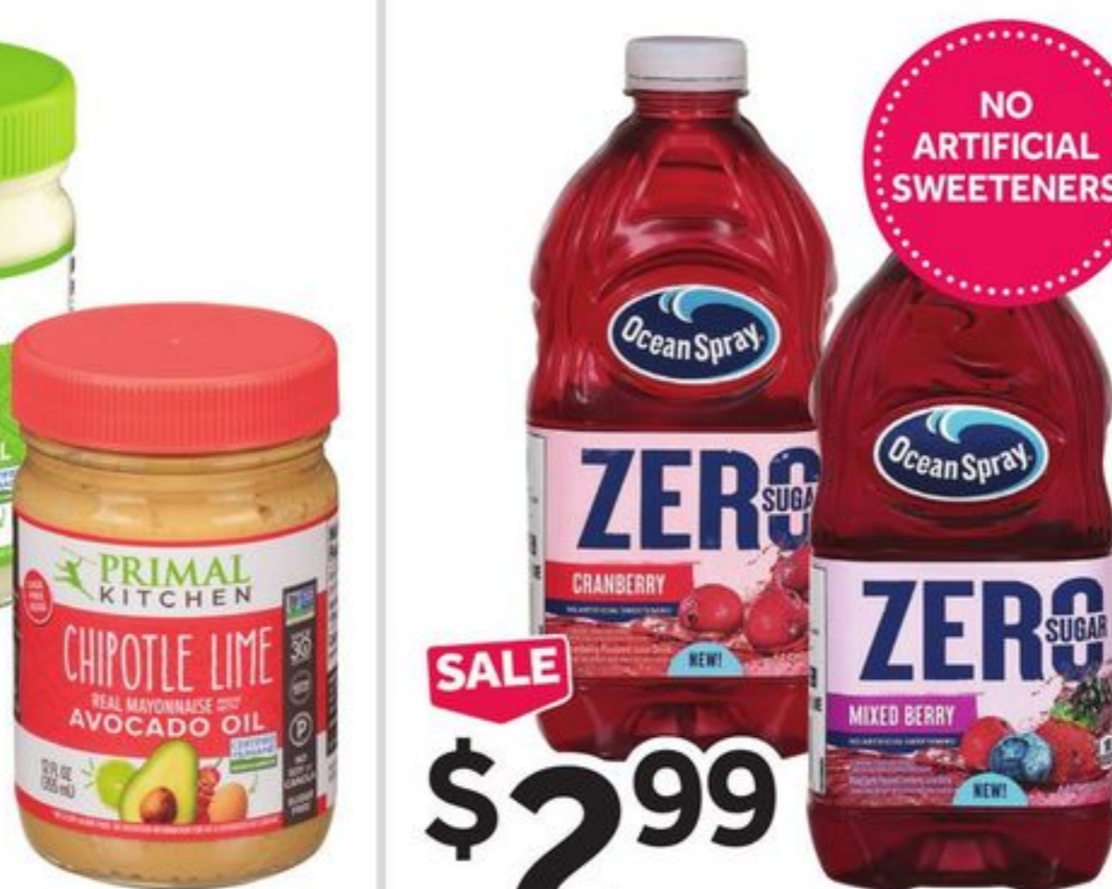
SALE $7.49 Primal Kitchen Mayonnaise Selected Varieties, 12 oz. jar 6967986