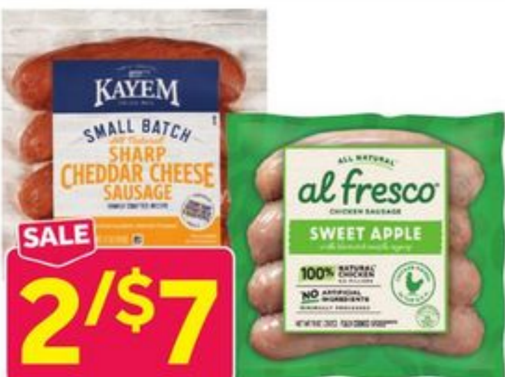
Al Fresco Chicken Sausage or Kayem Smoked Sausage Selected Varieties, 11-14 oz. pkg. 6891566