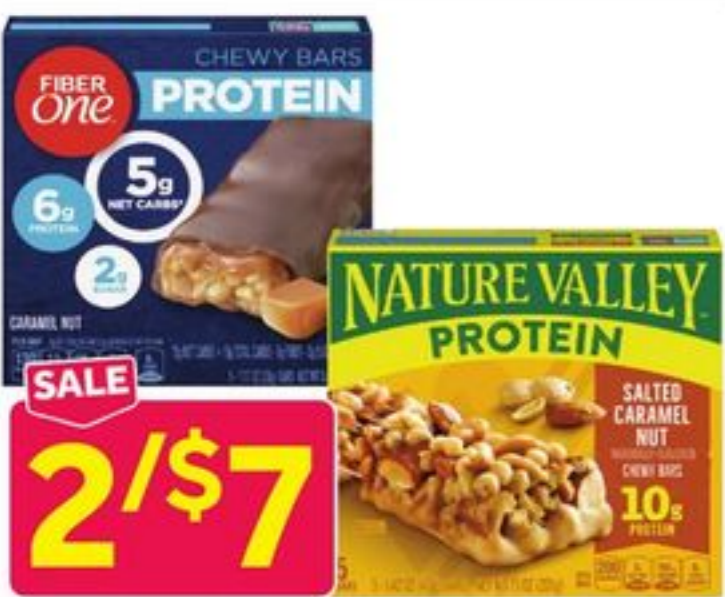
Nature Valley or Fiber One Protein Bars Selected Varieties, 5.85-8.85 oz. box 6984665