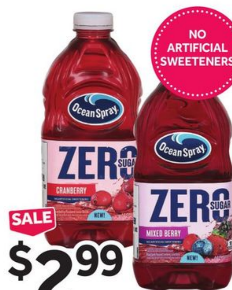
SALE $2.99 Ocean Spray Zero Sugar Juice Selected Varieties, 64 fl. oz. btl., Plus Deposit Where Applicable 6997505