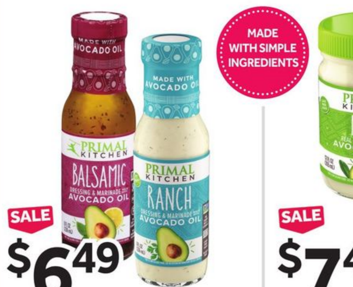
SALE $6.49 Primal Kitchen Salad Dressing Selected Varieties, 8 fl. oz. btl. 6967986