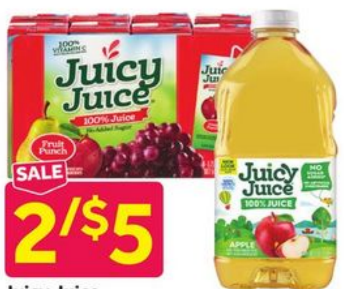
Juicy Juice Selected Varieties, 64 fl. oz. btl. or 8/6.75 fl. oz. boxes, Plus Deposit Where Applicable 6969725