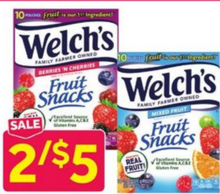
Welch's Fruit Snacks Selected Varieties, 5.6-9 oz. box 6967133