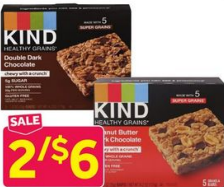
Kind Healthy Grains Granola Bars Selected Varieties, 5 ct. box 6982263