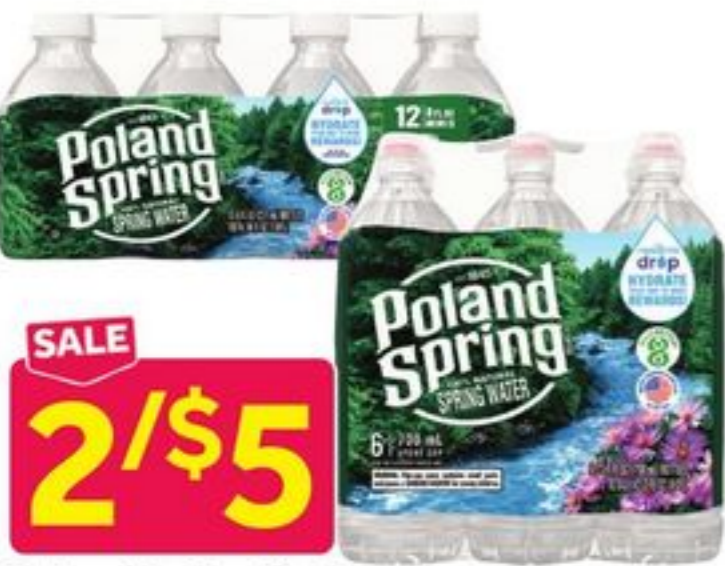
Poland Spring Multipack Selected Varieties, 6/23.7 fl. oz. or 12/8 fl. oz. btl., Plus Deposit Where Applicable 6929035