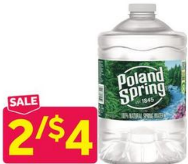
Poland Spring Water 3L Selected Varieties, 101.4 fl. oz. btl., Plus Deposit Where Applicable 6929117