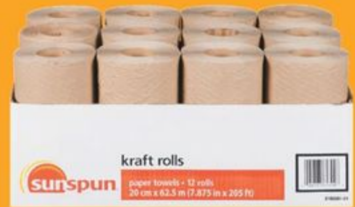
sunspun™ kraft rolls paper towels 12 rolls 20102855_EA