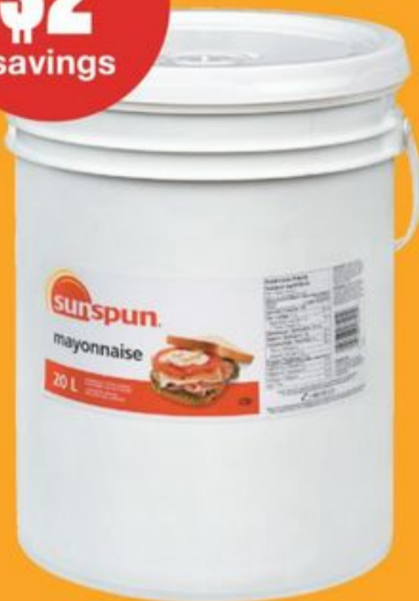
sunspun™ mayonnaise 20 L 21123869_EA