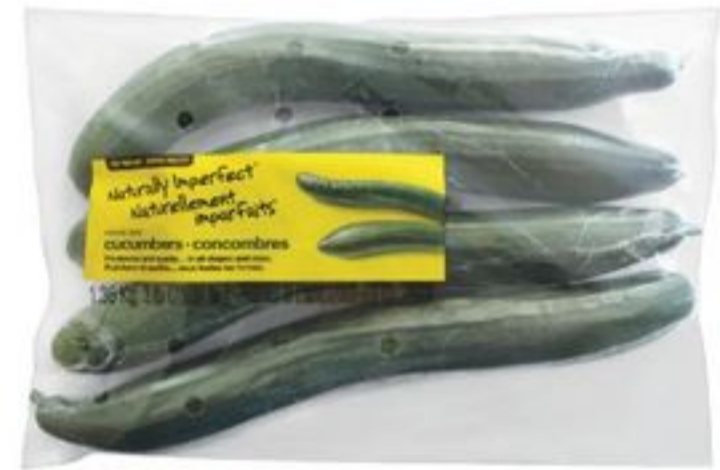
no name® Naturally Imperfect™ English cucumbers product of Canada 3 lb 21046471001_EA