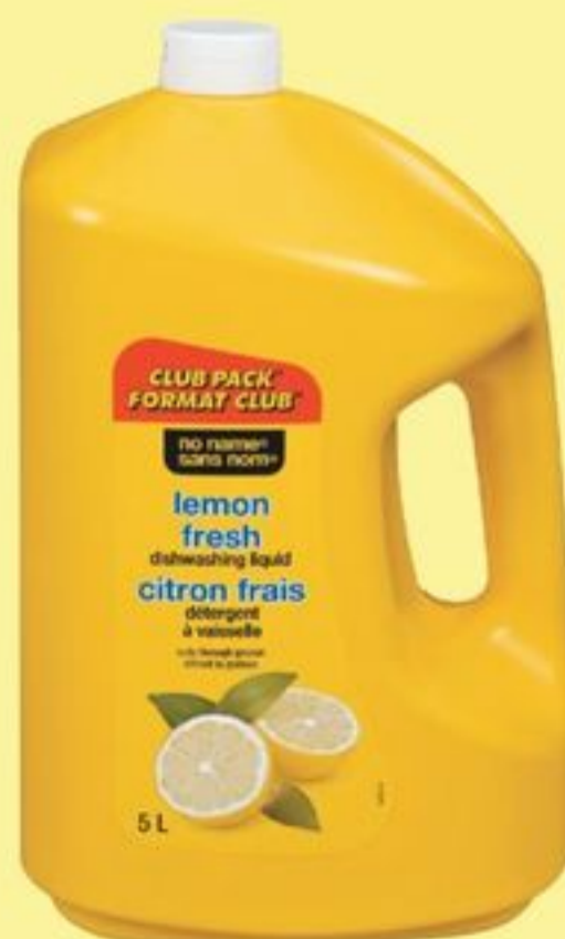
no name® dishwashing liquid lemon, club size, 5 L 21012774_EA