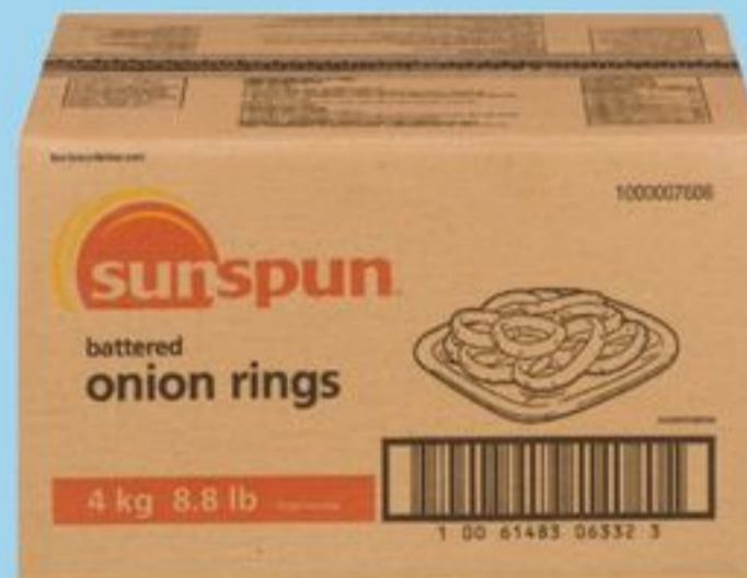
sunspun™ battered onion rings frozen, 4 kg 21209854_EA