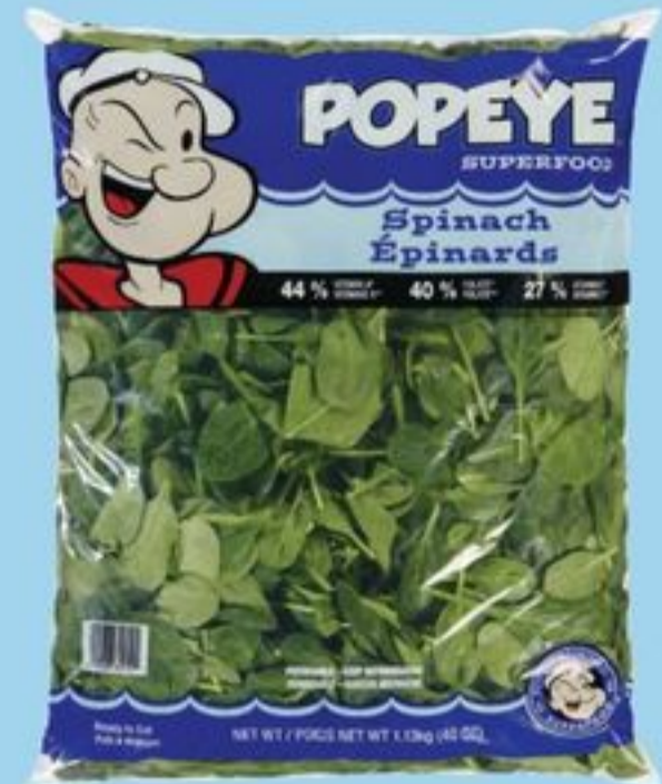
Popeye spinach product of U.S.A. selected varieties 1.13 kg 20104062_EA