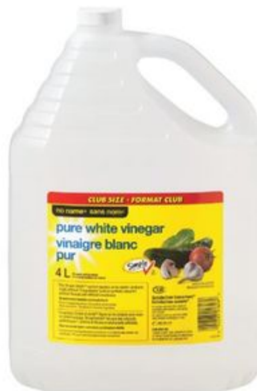
no name® white vinegar club size, 4 L 20102756_EA