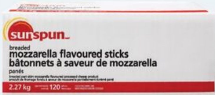
sunspun™ breaded mozzarella cheese sticks frozen, 2.27 kg 20158056_EA