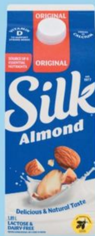
Silk dairy-free beverages selected varieties refrigerated, 1.75/1.89 L 20315090001_EA