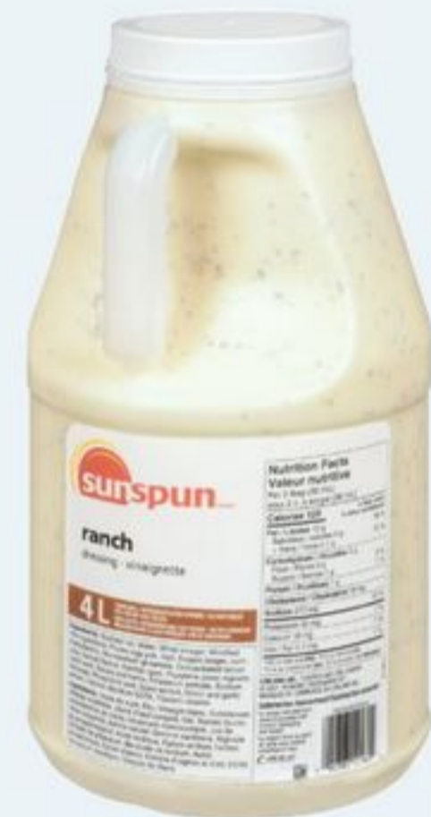
sunspun™ ranch salad dressing 4 L 20297350_EA