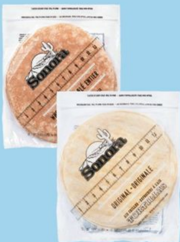
Sonora 12" tortillas selected varieties 12 ct 20958203_EA 20958204_EA