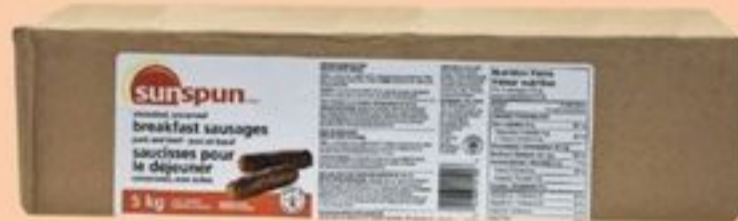
sunspun™ pork and beef sausages frozen, 5 kg 20096302_C01