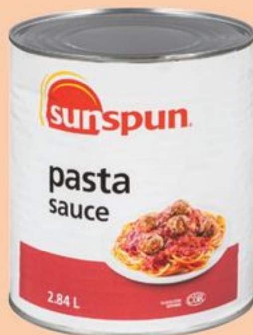
sunspun™ pasta or pizza sauce 2.84 L 20090059001_EA