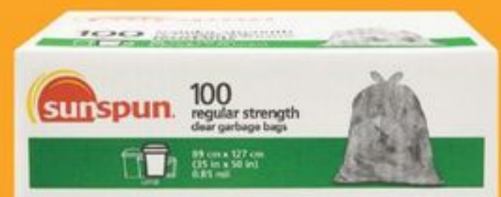
sunspun™ clear garbage bags 100 ct 21607973_EA