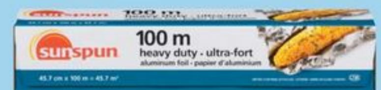
sunspun™ aluminum foil heavy duty 100 m 21119966_EA