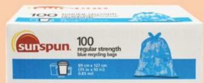
sunspun™ recycling bags 100 ct 21607985_EA