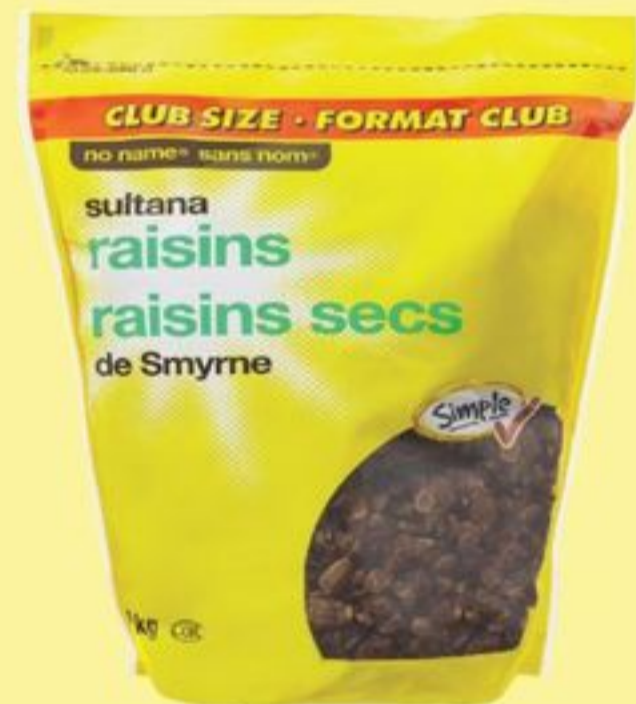
no name® sultana raisins club size, 2 kg 20647527_EA