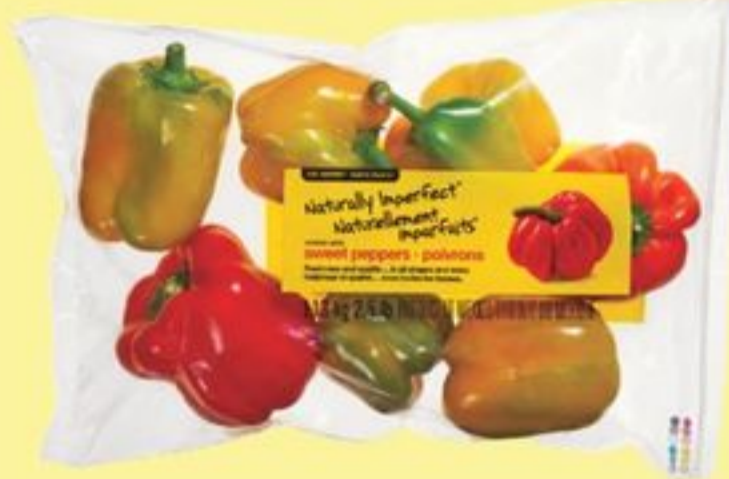
no name® Naturally Imperfect™ mixed sweet peppers product of Mexico 2.5 lb 20921434001_EA