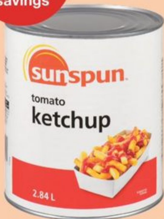
sunspun™ ketchup 2.84 L 20105015_EA