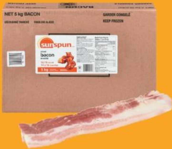
sunspun™ sliced bacon selected varieties frozen, 5 kg 20035903_EA