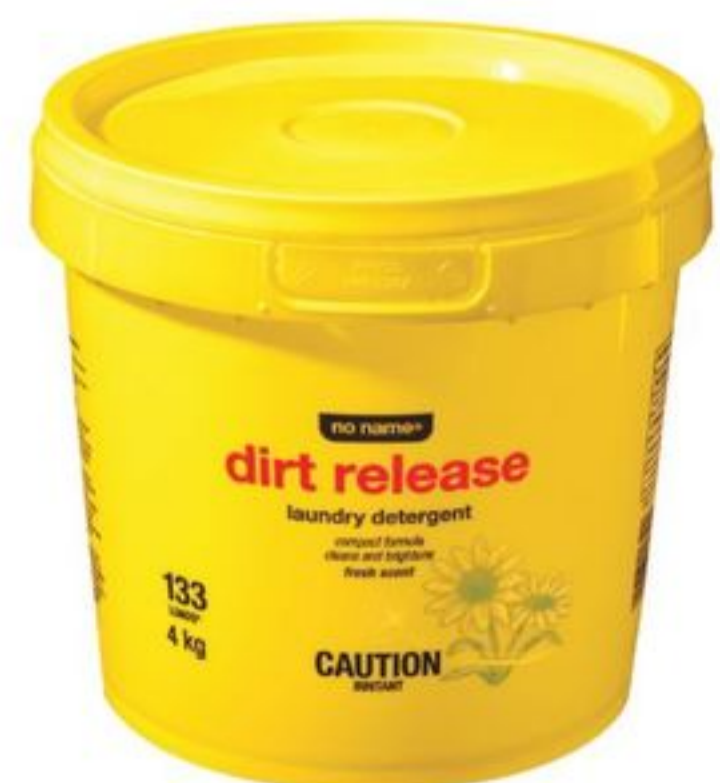
no name® laundry powder 4 kg 21315345_EA