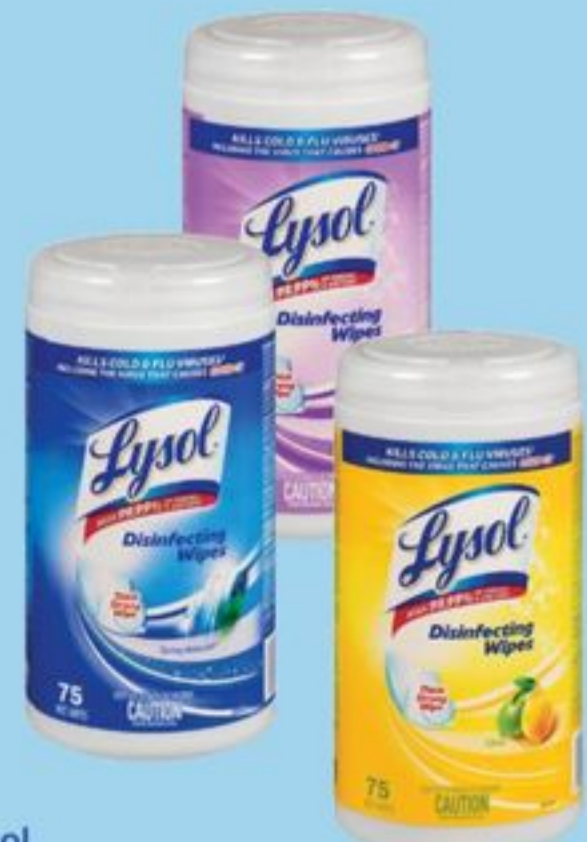
Lysol disinfecting wipes selected varieties 75 ct 21449822_EA 21449826_EA 21449829_EA