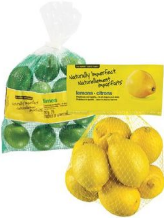
no name® Naturally Imperfect™ lemons 3 lb bag product of South Africa or limes 2 lb bag product of Mexico 21124368001_EA/21124487001_EA