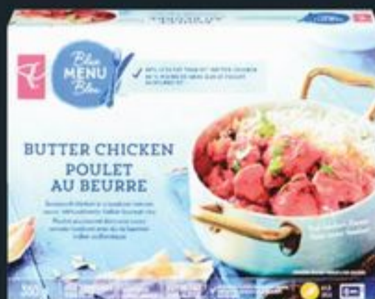
PC® SINGLE SERVE ENTREES selected varieties frozen 212-265 g plats cuisinés 20204192001 EA