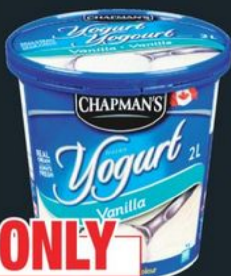
CHAPMAN'S FROZEN YOGURT or SORBET selected varieties, frozen 2 L yogourt surgelé ou sorbet ou bonbonnes glacées 2014434021 EA