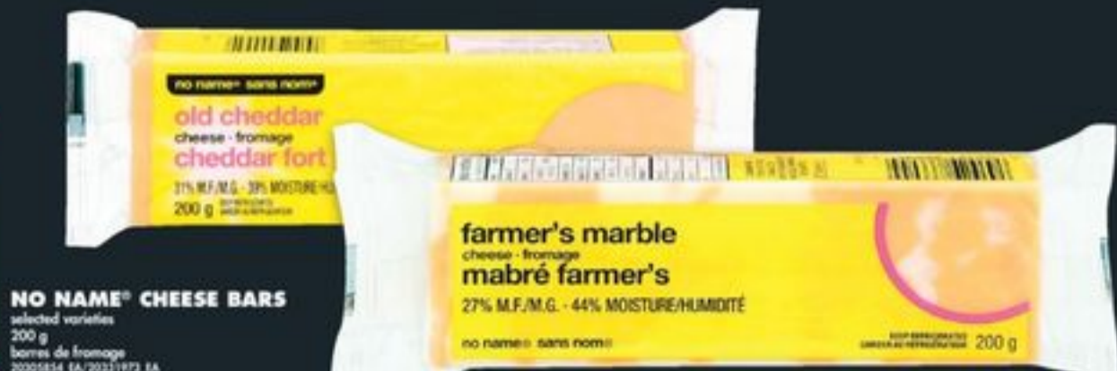
NO NAME® CHEESE BARS selected varieties 200 g barres de fromage 2020564 EA/20211973 EA