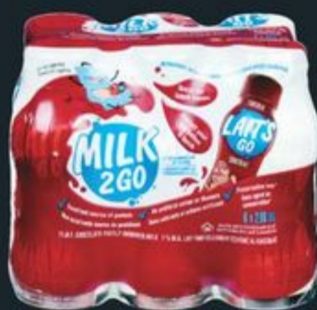
MILK2GO MULTIPACK selected varieties 6x200 mL lait 21045263 EA