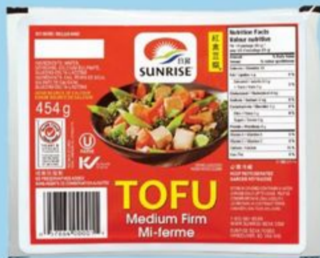
Sunrise medium firm tofu 454 g 20022239_EA