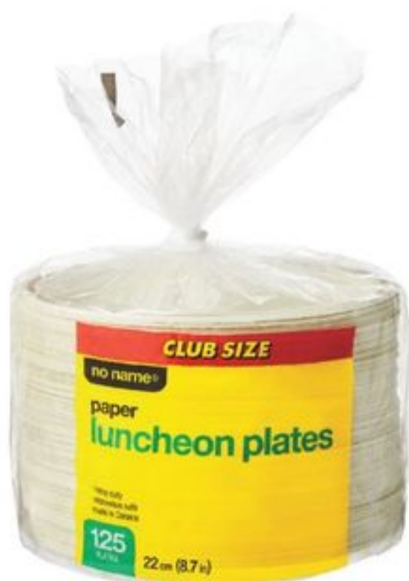
no name® paper luncheon plates 125 ct 21384159_EA