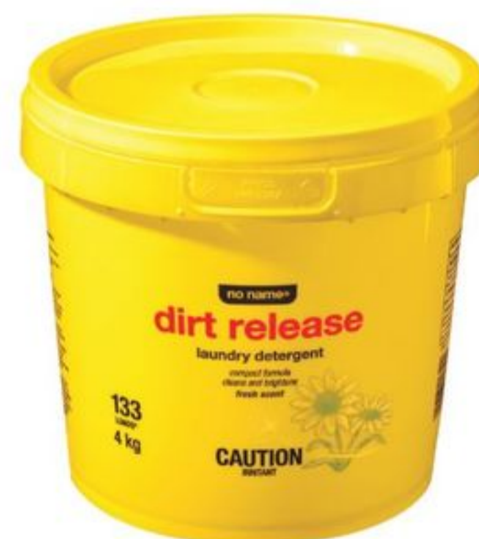
no name® laundry powder 4 kg 21315345_EA