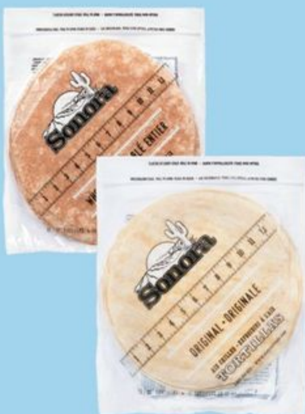
Sonora 12" tortillas selected varieties 12 ct 20958203_EA 20958204_EA