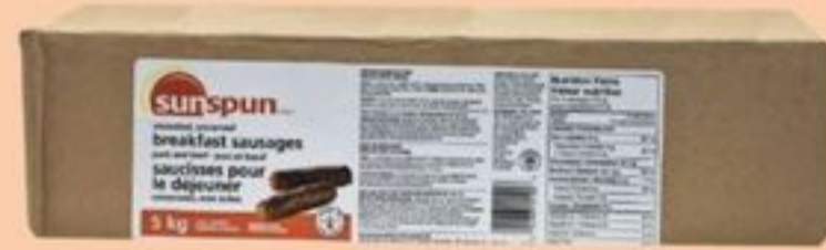
sunspun™ pork and beef sausages frozen, 5 kg 20096302_C01