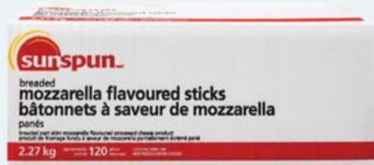
sunspun™ breaded mozzarella cheese sticks frozen, 2.27 kg 20158056_EA