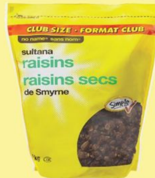
no name® sultana raisins club size, 2 kg 20647527_EA