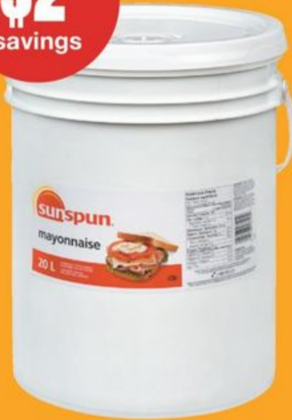
sunspun™ mayonnaise 20 L 21123869_EA