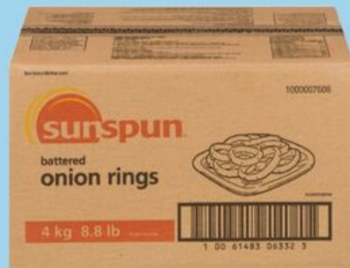
sunspun™ battered onion rings frozen, 4 kg 21209854_EA