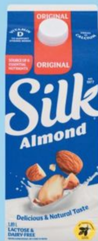
Silk dairy-free beverages selected varieties refrigerated, 1.75/1.89 L 20315090001_EA