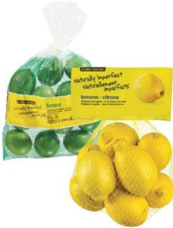
no name® Naturally Imperfect™ lemons 3 lb bag product of South Africa or limes 2 lb bag product of Mexico 21124368001_EA/21124487001_EA