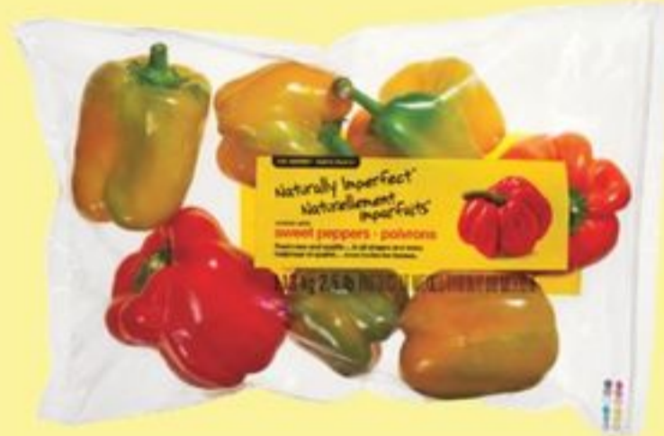
no name® Naturally Imperfect™ mixed sweet peppers product of Mexico 2.5 lb 20921434001_EA