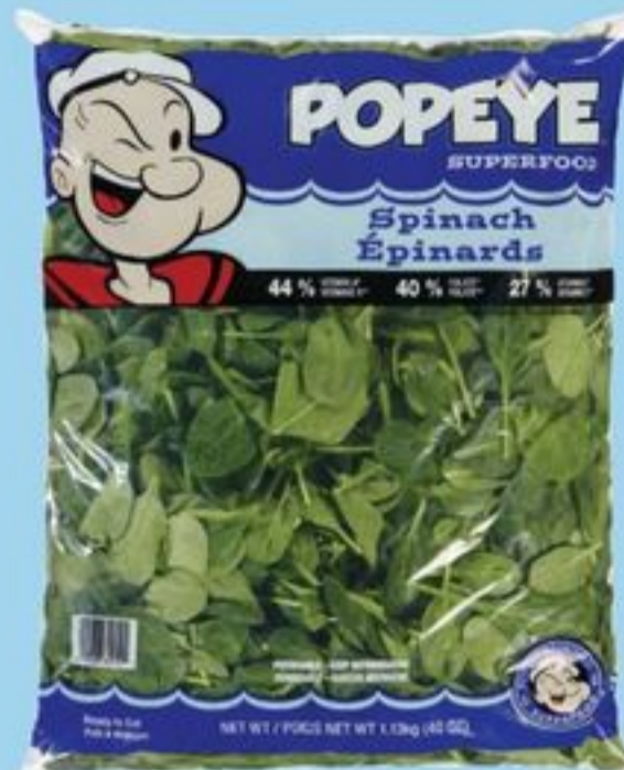
Popeye spinach product of U.S.A. selected varieties 1.13 kg 20104062_EA