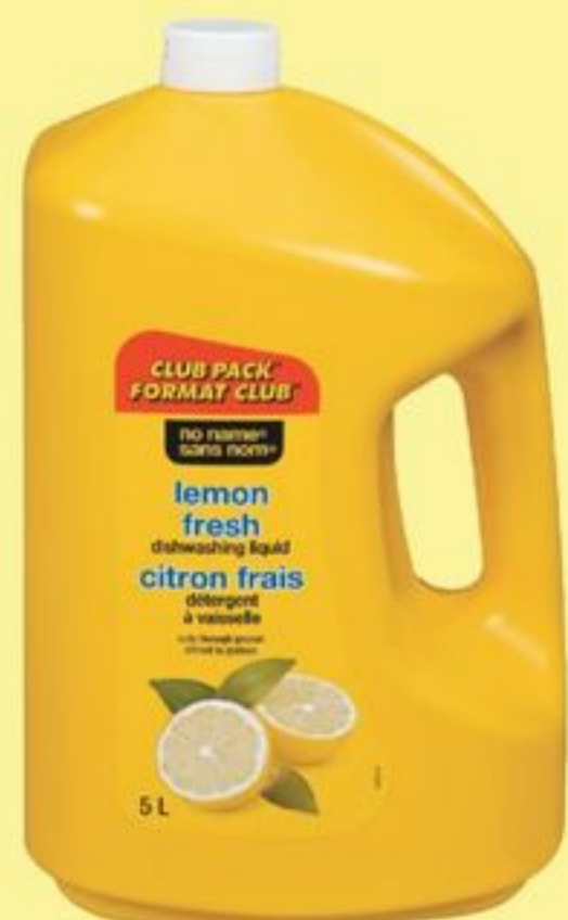
no name® dishwashing liquid lemon, club size, 5 L 21012774_EA