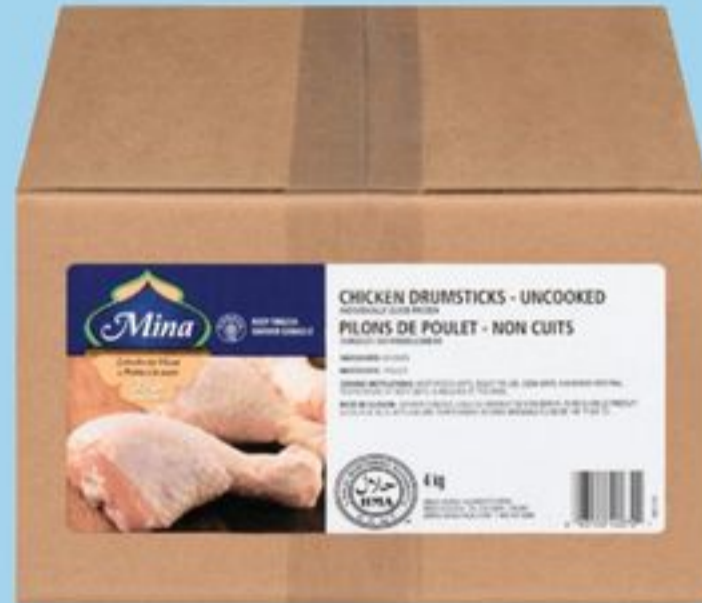
Mina Halal chicken drumsticks frozen, 4 kg 21549956_C01