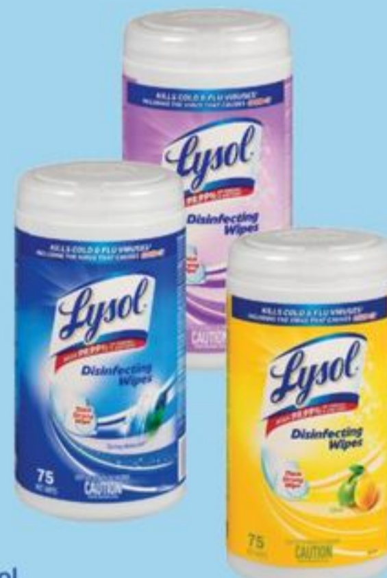
Lysol disinfecting wipes selected varieties 75 ct 21449822_EA 21449826_EA 21449829_EA