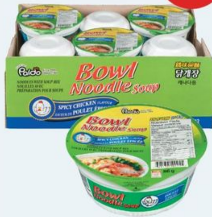
Paldo bowl noodle soup selected varieties 12 x 86 g 20311560002_C12