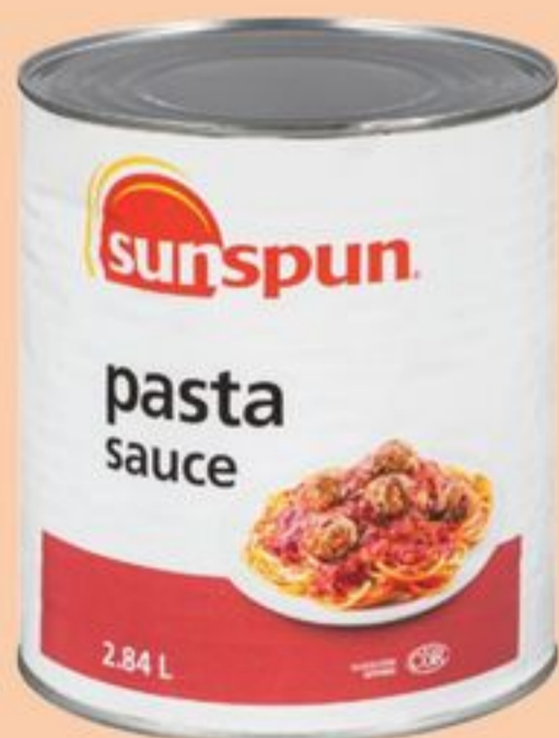
sunspun™ pasta or pizza sauce 2.84 L 20090059001_EA