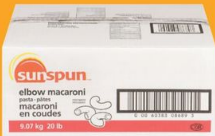
sunspun™ pasta 9.07 kg 20554926_EA