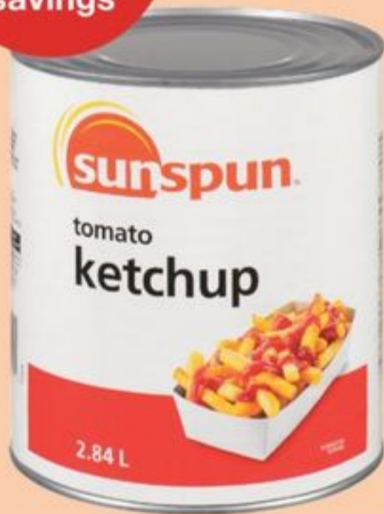
sunspun™ ketchup 2.84 L 20105015_EA