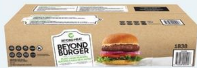
Beyond Burger plant-based burgers frozen, 4.53 kg 21219840_C01