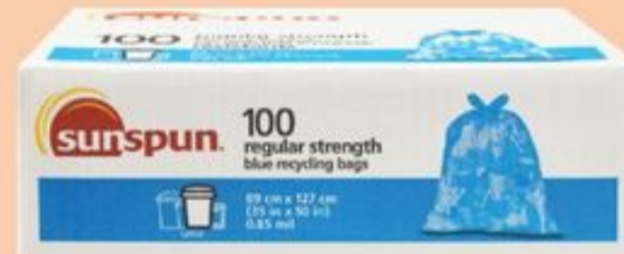
sunspun™ recycling bags 100 ct 21607985_EA