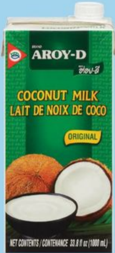
Aroy-D coconut milk 1 L 21517148_EA