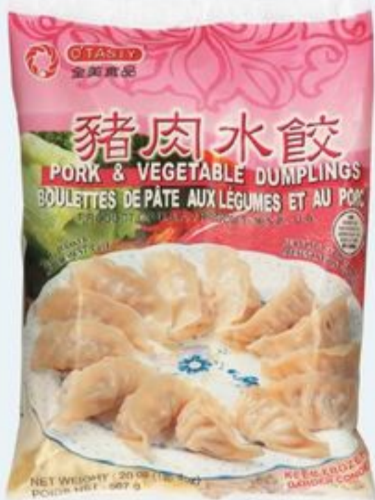
O'Tasty dumplings selected varieties frozen, 567 g 20319243001_EA