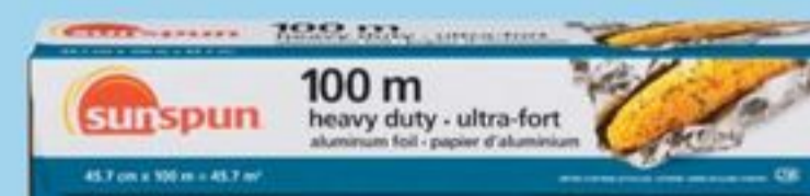
sunspun™ aluminum foil heavy duty 100 m 21119966_EA