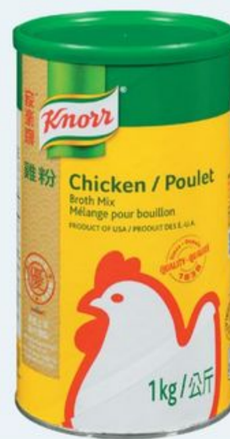
Knorr chicken bouillon mix 1 kg 20154074_EA