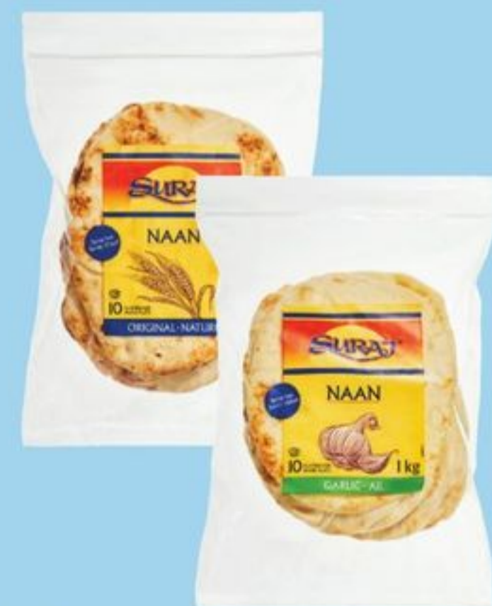
Suraj® naan selected varieties 10 ct 20342261_EA 20343319_EA