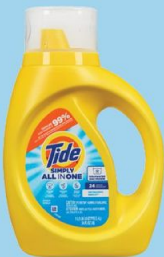
Tide simply liquid laundry detergent 1 L 21589966_EA