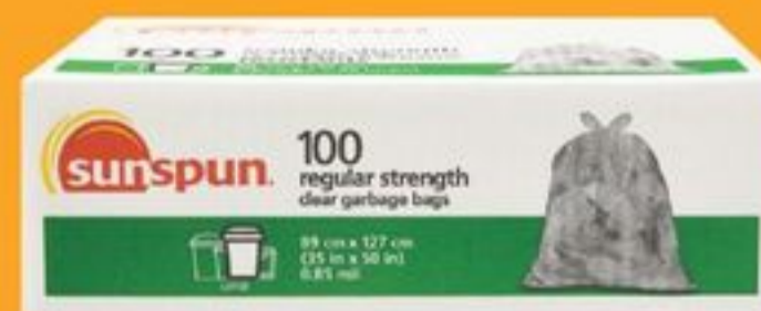
sunspun™ clear garbage bags 100 ct 21607973_EA