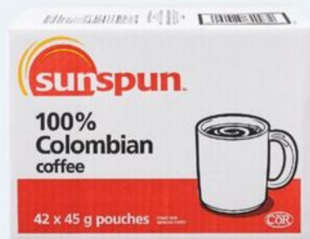
sunspun™ coffee 1.3-2.1 kg 20050931_EA