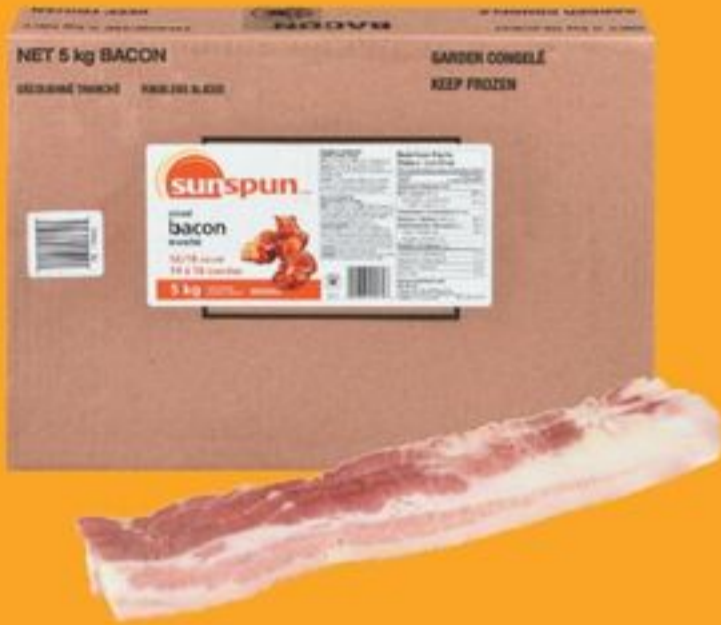
sunspun™ sliced bacon selected varieties frozen, 5 kg 20035903_EA