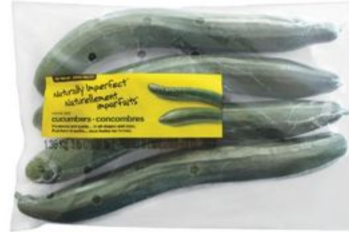
no name® Naturally Imperfect™ English cucumbers product of Canada 3 lb 21046471001_EA