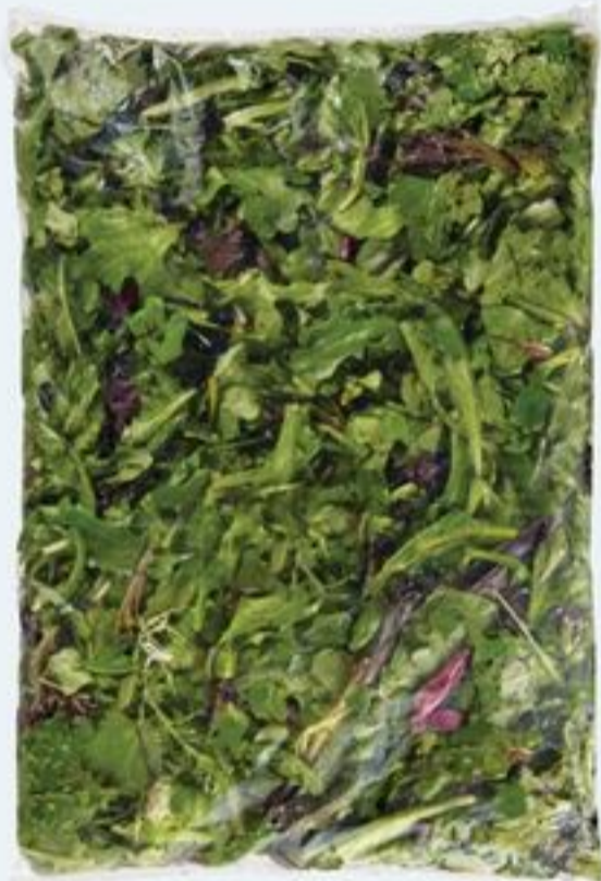
spring mix product of U.S.A. 3 lb 20964168_C01