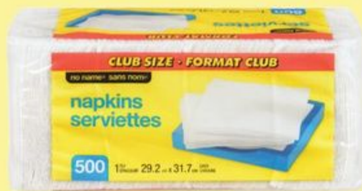
no name® napkins club size, 500 ct 20306897_EA