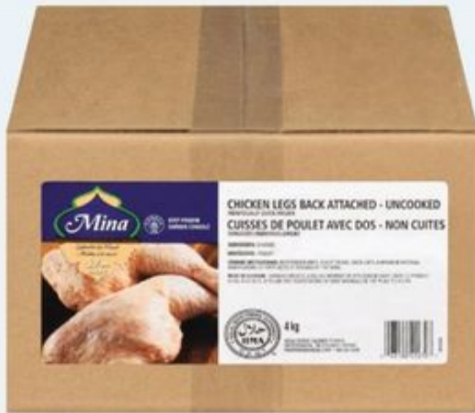
Mina Halal chicken legs frozen 4 kg 21549860_C01