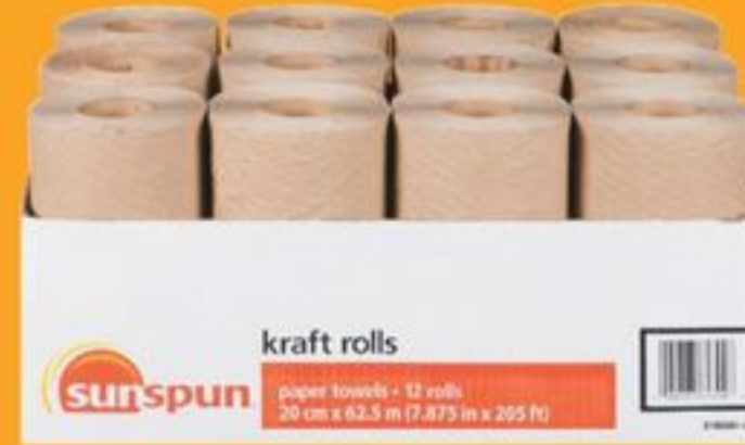
sunspun™ kraft rolls paper towels 12 rolls 20102855_EA