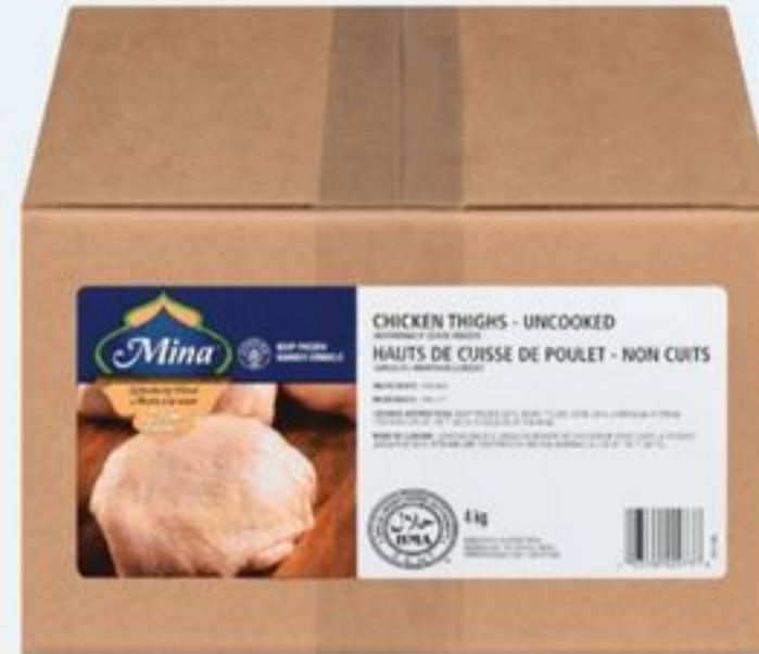
Mina Halal chicken thighs frozen, 4 kg 21549892_C01