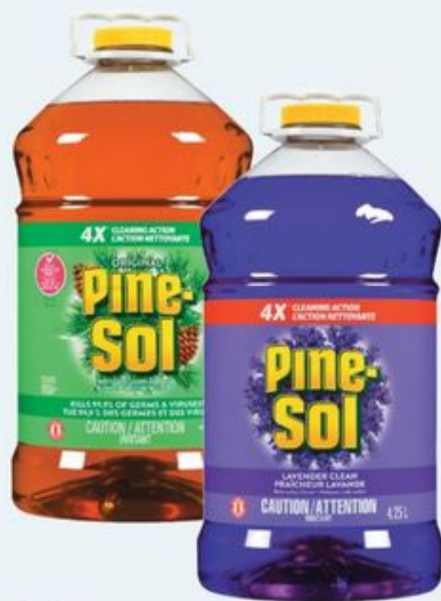
Pine-Sol cleaner selected varieties 4.27 L 20021491_EA 21008748_EA