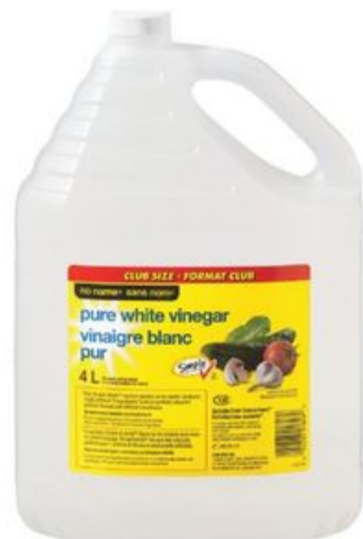
no name® white vinegar club size, 4 L 20102756_EA