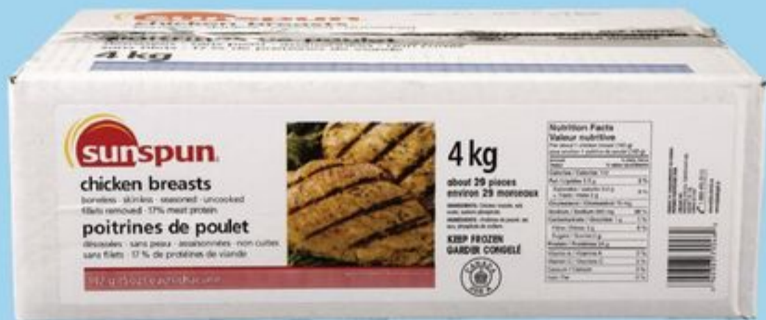
sunspun™ chicken breasts 4-6 oz, frozen selected varieties 4 kg 20054405_EA