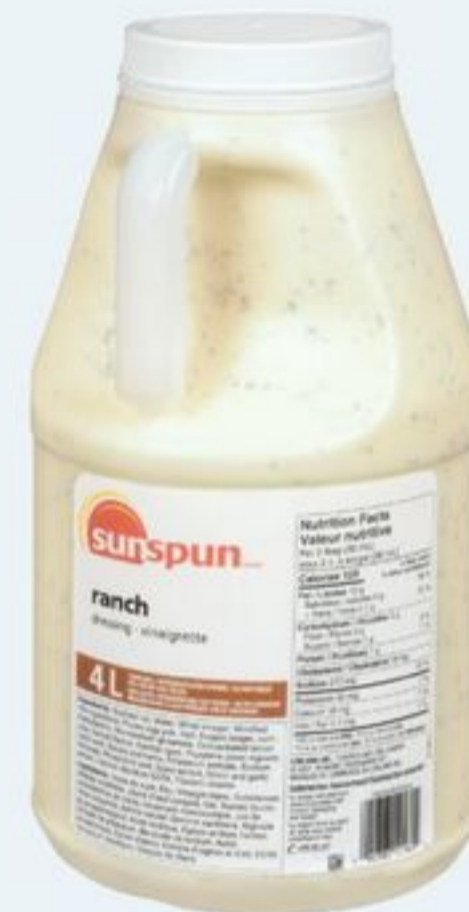
sunspun™ ranch salad dressing 4 L 20297350_EA