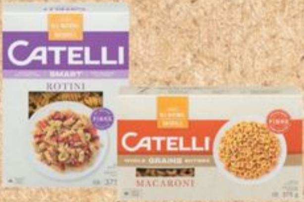
Catelli Smart or Healthy Harvest Pasta Selected varieties, 340 g/375 g 20527265_EA/20299819001_EA