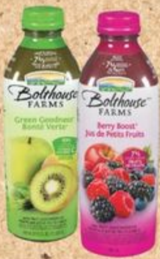
Bolthouse Farms Smoothies or Juice Selected varieties, 946 mL, Product of U.S.A. limit of 6, after limit $6 20301788_EA/20325816_EA