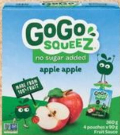
GoGo SqueeZ Fruit Sauce Selected varieties, 360 g 20322697002_EA