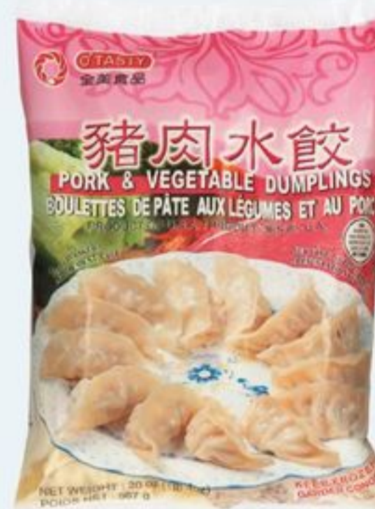
O'Tasty dumplings selected varieties frozen, 567 g 20319243001_EA