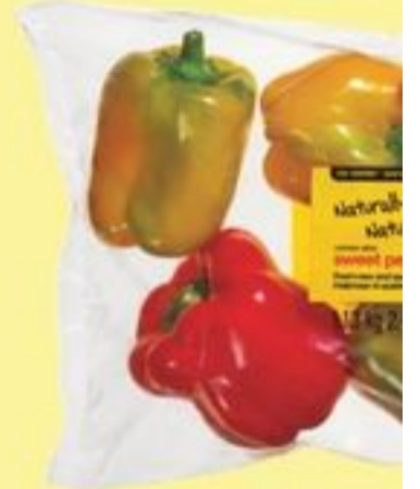
no name® Naturally Imperfect™ mixed sweet peppers product of Mexico 2.5 lb 20921434001_EA