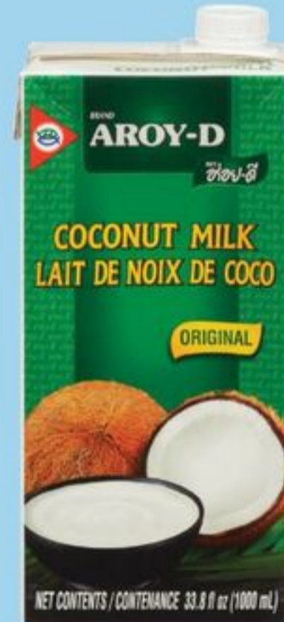
Aroy-D coconut milk 1 L 21517148_EA