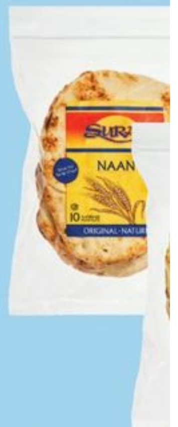
Suraj® naan selected varieties 10 ct 20342261_EA 20343319_EA