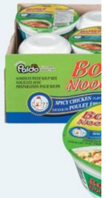
Paldo bowl noodle soup selected varieties 12 x 86 g 20311560002_C12