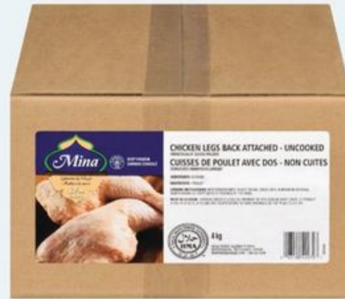
Mina Halal chicken legs frozen 4 kg 21549860_C01