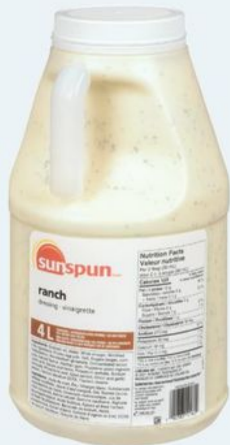
sunspun™ ranch salad dressing 4 L 20297350_EA