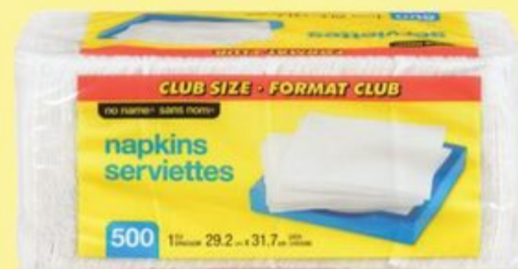
no name® napkins club size, 500 ct 20306897_EA