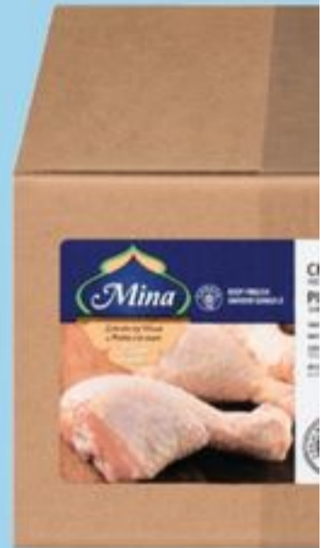
Mina Halal chicken drumsticks frozen, 4 kg 21549956_C01