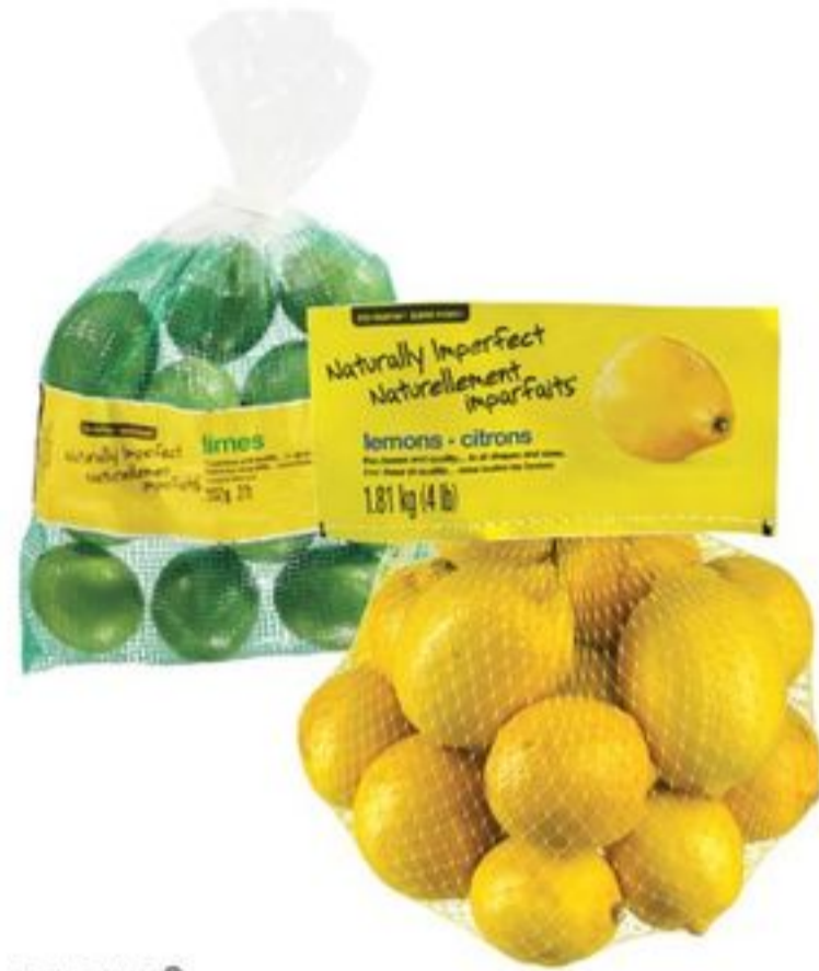
no name® Naturally Imperfect™ lemons 4 lb bag product of South Africa or limes 2 lb bag product of Mexico 21124488001_EA/21124368001_EA