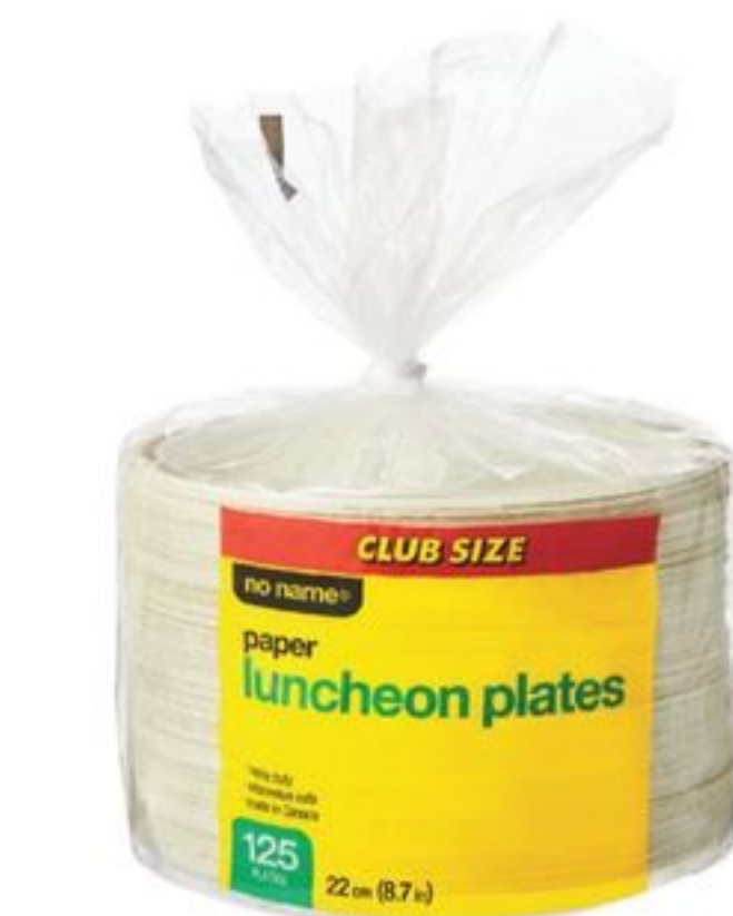
no name® paper luncheon plates 125 ct 21384159_EA