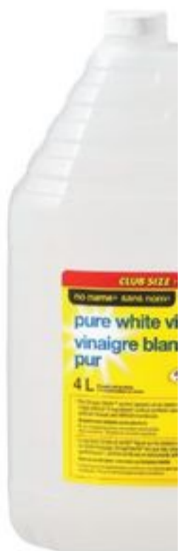
no name® white vinegar club size, 4 L 20102756_EA