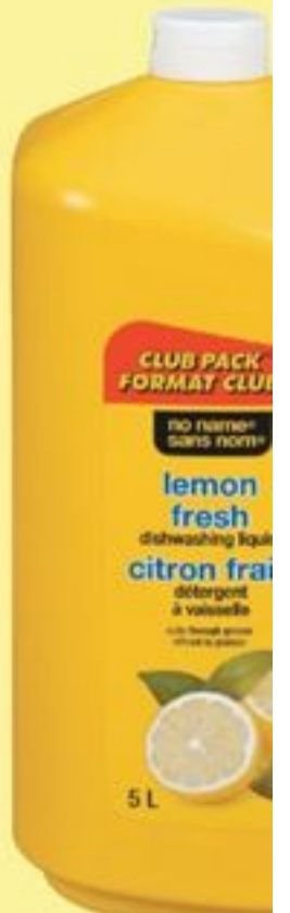
no name® dishwashing liquid lemon, club size, 5 L 21012774_EA