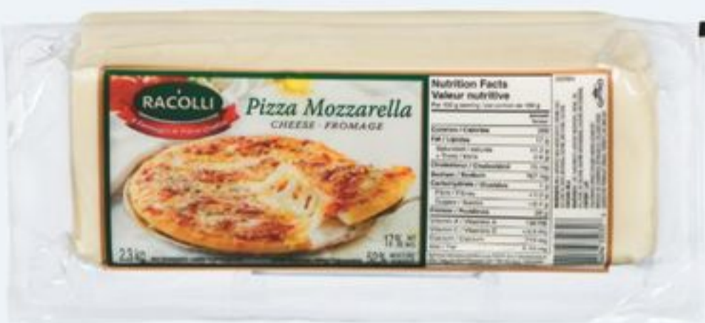
Racolli pizza mozzarella cheese 17% M.F. 2.3 kg 20013378_EA