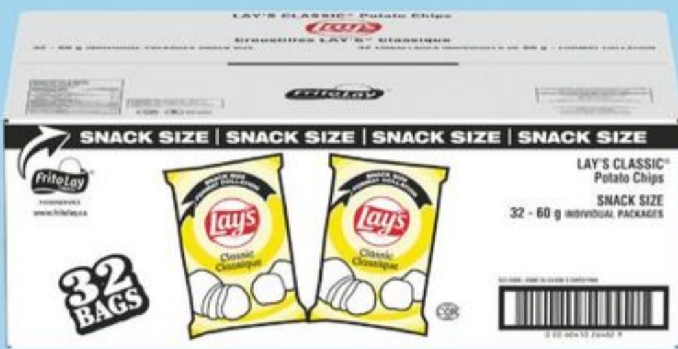
Frito Lay potato or Doritos chips selected varieties 32 ct 20309559001_EA