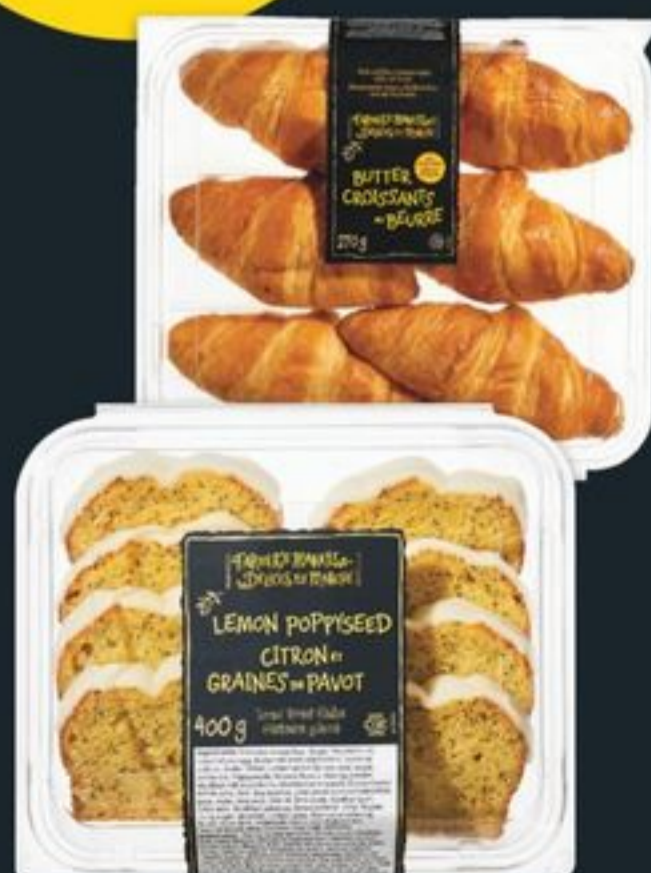
FARMER'S MARKET ™ BUTTER CROISSANTS or LOAF CAKES selected varieties 260-400 g 20973942_8A/21488954_8A