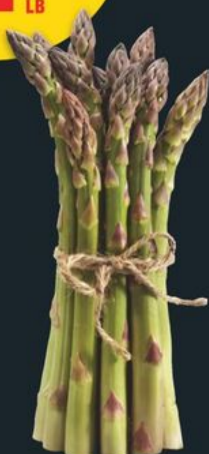
ASPARAGUS product of Mexico, no. 1 grade 6.55/lb 20174381001_80