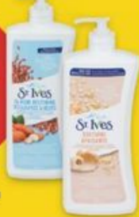
ST. IVES BODY LOTION selected varieties, 400 mL lotion pour le corps 21064101 EA/21064107 EA