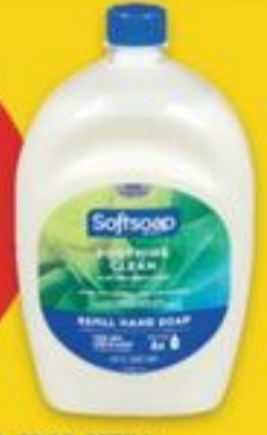
SOFTSOAP LIQUID HAND SOAP REFILL selected varieties, 1.47 L recharge de savon liquide pour les mains 2110714 EA