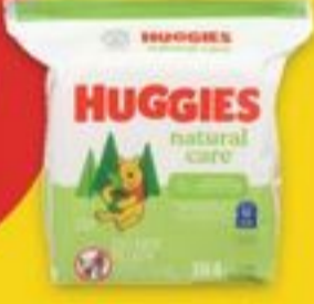
HUGGIES 3X BABY WIPES selected varieties, 148-192x lingettes pour bébé 2010624 EA