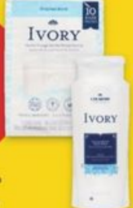
IVORY BAR SOAP or BODY WASH 421 mL selected varieties pain de savon ou nettoyant pour le corps 202487982 EA/202487981 EA