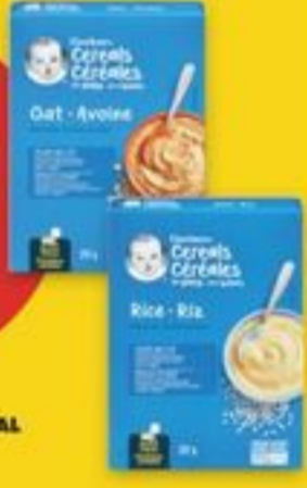
GERBER INFANT CEREAL selected varieties, 227 g céréales pour bébé 202241404 EA/202241407 EA