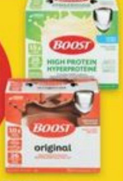
BOOST READY TO DRINK SHAKES selected varieties, 4x337 mL bois frappés 202487982 EA/202487981 EA