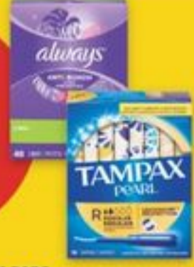
ALWAYS or TAMPAX 1X PADS, LINERS or TAMPONS , selected varieties, 10-72x serviettes ou protège-dames ou tampons 2144084 EA/2144084 EA