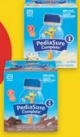
PEDIASURE COMPLETE selected varieties, 4x233 mL boisson nutritive pour enfants 202241401 EA/202241402 EA