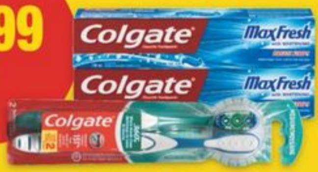
COLGATE TOOTHPASTE 70-133 mL, 2x120/150 mL or MANUAL TOOTHBRUSH 2x selected varieties dentifrice ou brosse à dents 20110027003 EA/21144430 EA