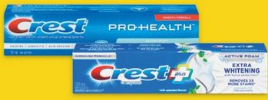
CREST PRO-HEALTH or COMPLETE TOOTHPASTE selected varieties 100-130 mL dentifrice 2104120 EA/2135403 EA