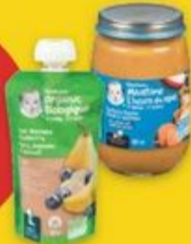
GERBER BABY FOOD JARS 129-162 mL or ORGANIC BABY FOOD POUCHES 99 g/128 mL, selected varieties aliments pour bébé 2102894 EA/2102894 EA