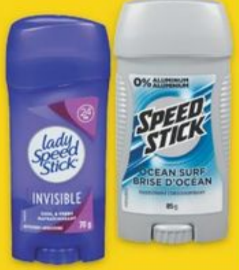
LADY or MEN'S SPEEDSTICK DEODORANT selected varieties 43-85 g déodorant 2034823001 EA/20347071 EA