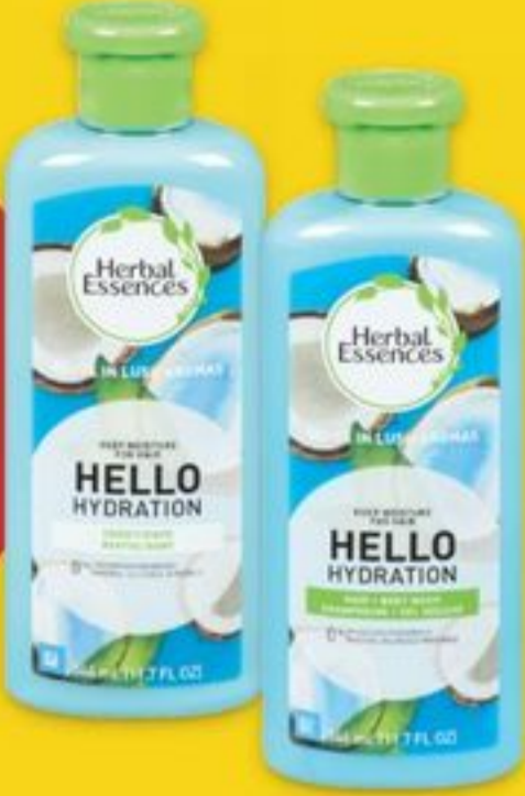
HERBAL ESSENCES HAIR CARE selected varieties 346 mL soins capillaires 2134709 EA/2134709Y EA