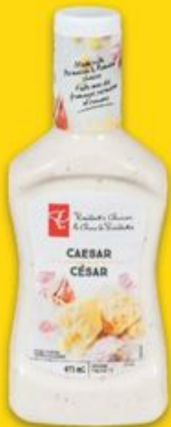
PC® SALAD DRESSING selected varieties 473 mL vinaigrette 20626488001 EA