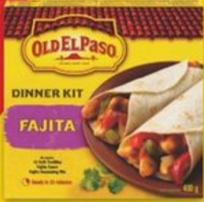
OLD EL PASO DINNER KITS selected varieties 250-510 g troussees-repas 20795300 EA