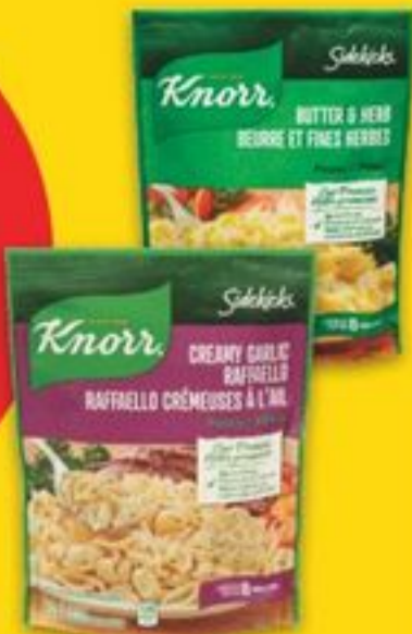
KNORR SIDEKICKS selected varieties 170-162 g plats d'accompagnement 2022143000P_EA/20221430012 EA