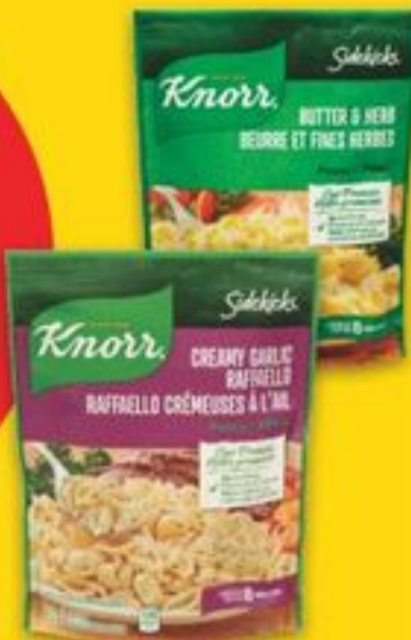
KNORR SIDEKICKS selected varieties 170-162 g plats d'accompagnement 2022143000P_EA/20221430012 EA