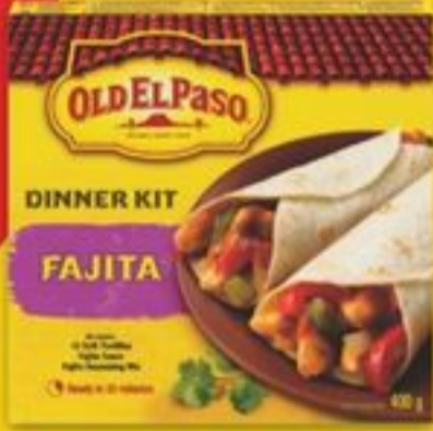
OLD EL PASO DINNER KITS selected varieties 250-510 g troussees-repas 20795300 EA