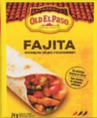
OLD EL PASO SEASONINGS selected varieties 24 g mélange d'assaisonnements 21049482 EA