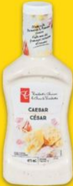
PC® SALAD DRESSING selected varieties 473 mL vinaigrette 20626488001 EA