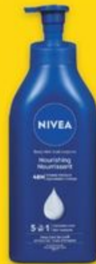
NIVEA HAND or BODY LOTION selected varieties 200-625 mL 20482737 EA