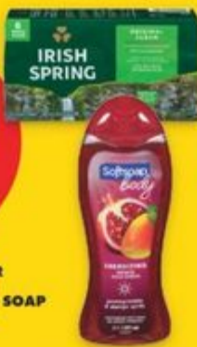
IRISH SPRING BAR SOAP 6x104 g, BODY WASH 391 mL or SOFT SOAP BODY WASH 391 mL selected varieties 2121973 EA/21434677 EA