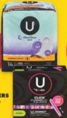
U BY KOTEX LINERS 40-50's, PADS 14-22's or TAMPONS 16's selected varieties 20992780 EA/21387976 EA