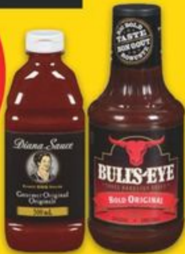
DIANA 500 mL or BULL'S-EYE 425 mL SAUCE selected varieties 20247834002 EA/21194617 EA