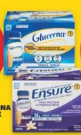
ENSURE or GLUCERNA READY-TO-DRINK SHAKES 6's 20180283003 EA/20308731001 C06