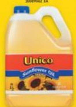
UNICO SUNFLOWER OIL 3 L 20089042 SA