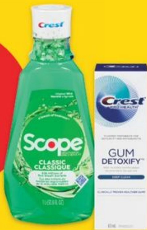
CREST GUM TOOTHPASTE 63 mL or SCOPE 1 L selected varieties 20482747 EA/21334490 EA