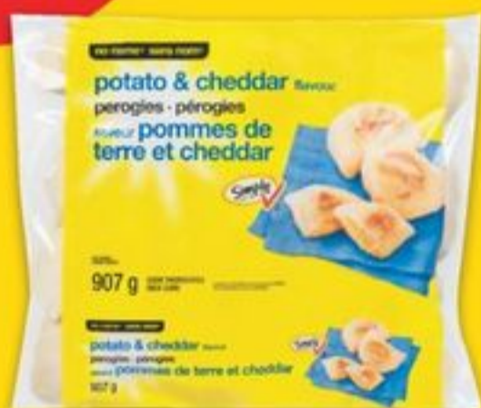
NO NAME® PEROGIES selected varieties, frozen 907 g 20811340 EA