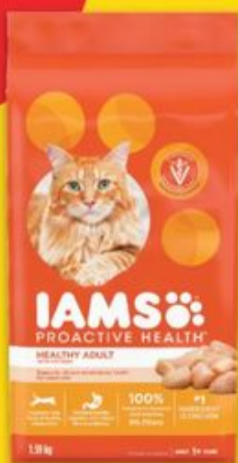
IAMS DRY CAT FOOD selected varieties 1.36-1.65 kg 21027532 SA