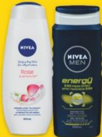
NIVEA BODY WASH selected varieties 500 mL 21148999 EA/21148901 EA