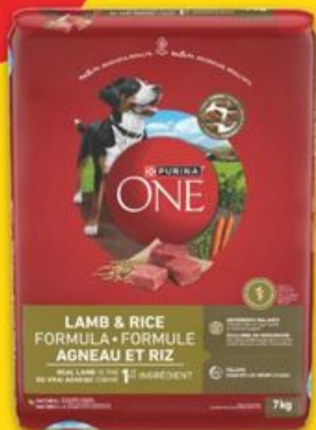
PURINA ONE DRY DOG FOOD 7 kg or TIDY CATS LIGHTWEIGHT CAT LITTER 7.71 kg selected varieties 20239412 SA