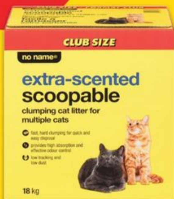
NO NAME® CAT LITTER selected varieties 18 kg 2017714901 SA