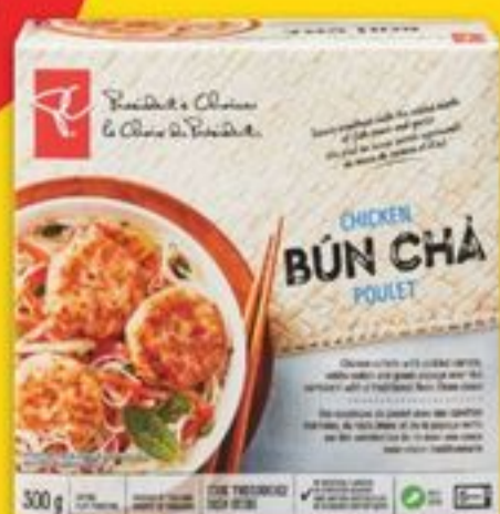
PC® ASIAN SOUPS or ENTRÉES selected varieties, frozen 300 g 21540048 EA