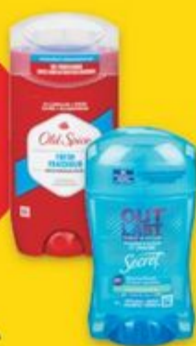
OLD SPICE or SECRET DEODORANT selected varieties 45-107 g 20554235002 EA/20643349901 EA