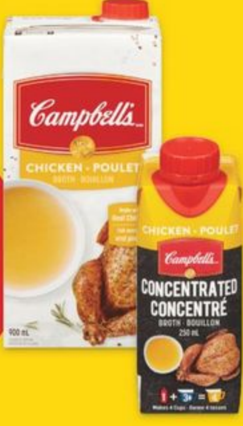
CAMPBELL'S BROTH selected varieties 250/900 mL 2022248002 EA/21347343 EA