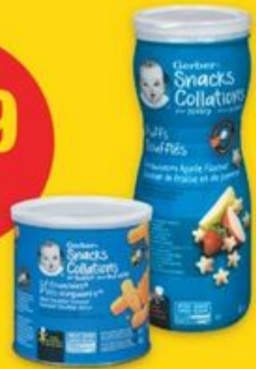
GERBER SNACKS or ENTRÉES selected varieties 42-187 g 20304618003 EA 20304618007 EA