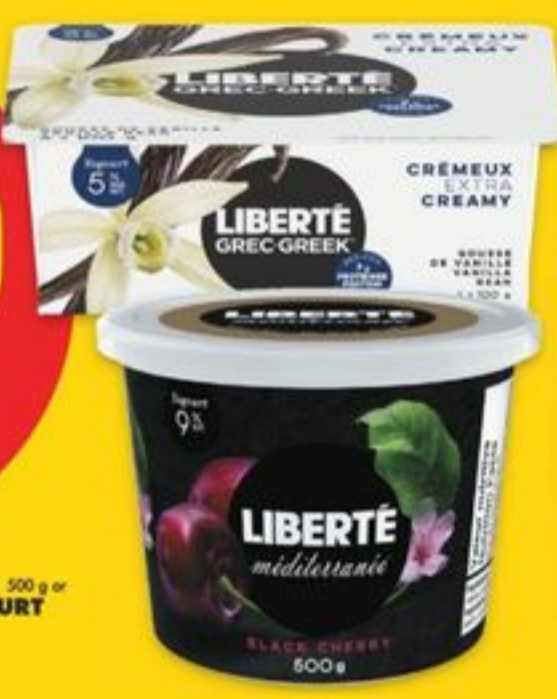
LIBERTÉ MÉDITERRANÉE 4% or GREEK 4% or CRUNCH 2% YOGURT selected varieties 20788062001 SA/20801732003 SA