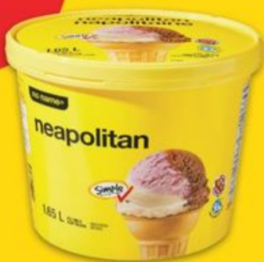
NO NAME® ICE MILK selected varieties, frozen 1.65 L 21410174 EA