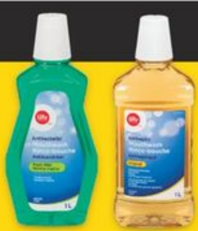
LIFE BRAND® MOUTHWASH selected varieties 1 L 21201384 EA/21201405 EA