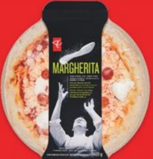
PC®, PC® BLACK LABEL or NO NAME® PIZZA all sizes and varieties 21531415 EA

APP EXCLUSIVE OFFER* Optimum® EARN 1,000 pts = $1 Value for every $5* spent on