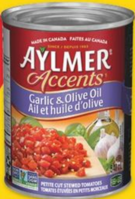
AYLMER ACCENTS or RO-TEL DICED TOMATOES selected varieties 283-540 mL 21207587 SA