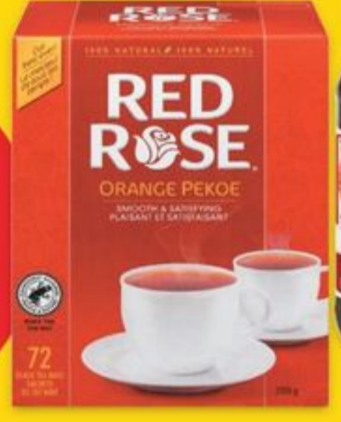
RED ROSE ORANGE PEKOE TEA 72's 21393431 EA