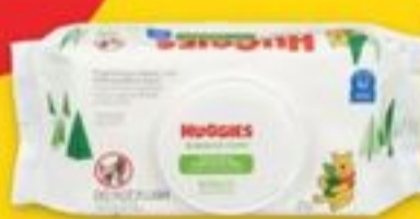
HUGGIE'S 1X WIPES selected varieties 56/64's 20557344 EA