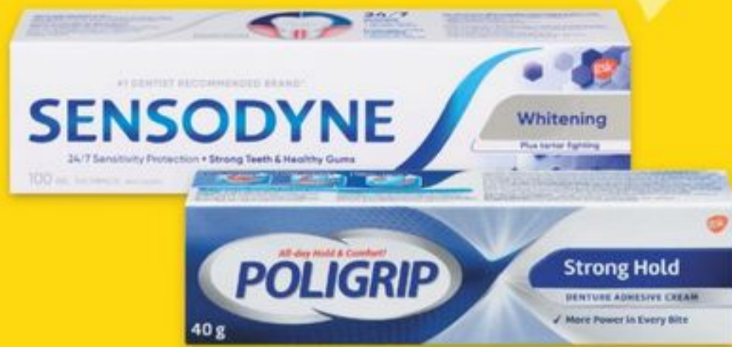
SENSODYNE or PRONAMEL TOOTHPASTE 75/100 mL or POLIGRIP 40 g selected varieties 20301179001 EA/20734073 EA