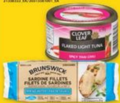
BRUNSWICK FILLETS or CLOVER LEAF FLAVOURED TUNA 85 g selected varieties 21358323 SA/20213581001 SA