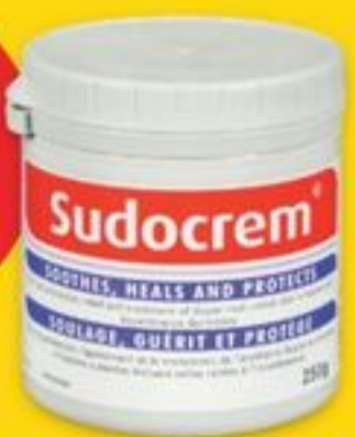
SUDOCREM 250 g 20147213 EA