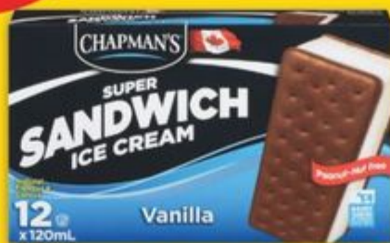
CHAPMAN'S SUPER NOVELTIES selected varieties, frozen 8-18's 20111532 EA