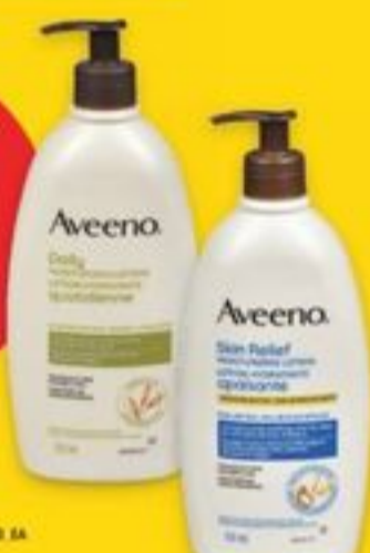
AVEENO LOTION selected varieties 532 mL 20102823001 EA/20102023003 EA