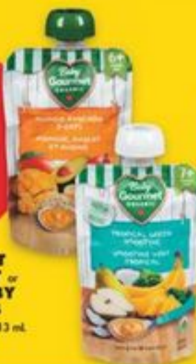
BABY GOURMET ORGANIC FRUIT or VEGETABLE BABY FOOD POUCHES 112/128 mL or JARS 113 mL selected varieties 21123293 EA/21291341 EA