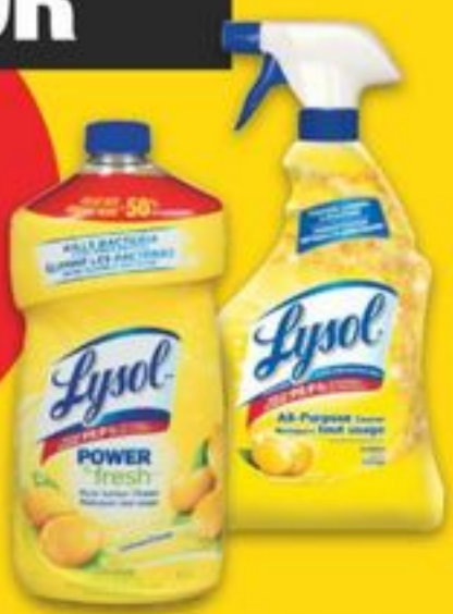
LYSOL MULTI SURFACE CLEANER 1.2 L or SPRAYS 650-950 mL selected varieties 20309872002 EA/20210479001 EA