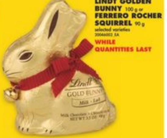
LINDY GOLDEN BUNNY 100 g or FERRERO RÖCHER SQUIRREL 90 g selected varieties 20044002 EA WHILE QUANTITIES LAST