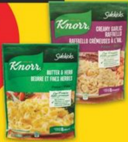
KNORR SIDEKICKS selected varieties 121-162 g 2021430007 EA/2021430012 EA