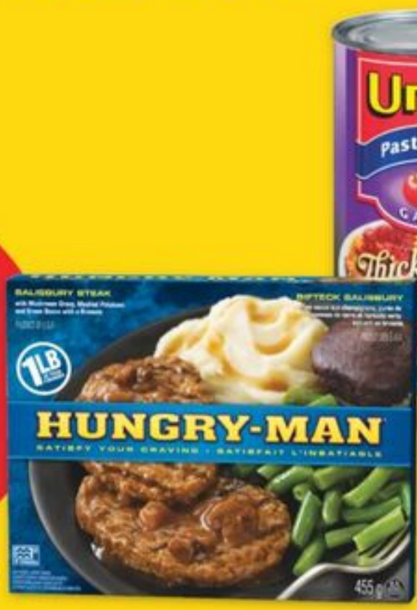
SWANSON HUNGRY-MAN DINNER ENTRÉES selected varieties, frozen 360-455 g 20294014002 SA