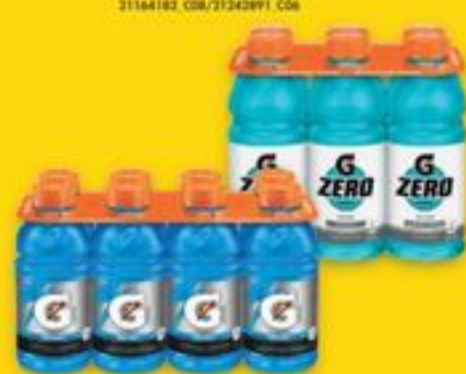
GATORADE SPORT DRINKS selected varieties 6x591/8x355 mL 21144182 C08/21242891 C04