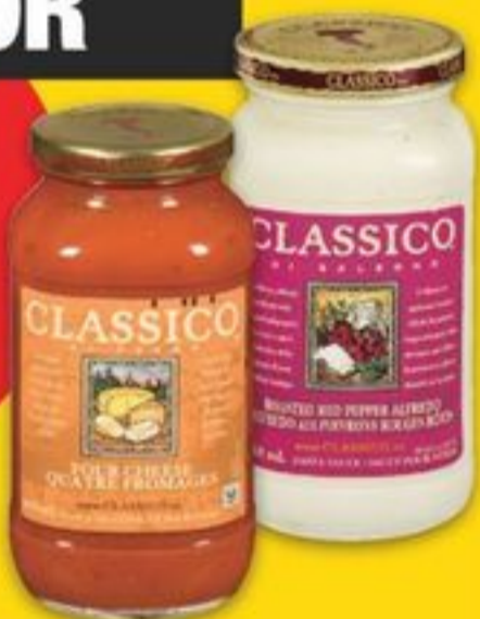
CLASSICO PASTA SAUCE 410/600 mL 2022609006 EA/21618218 EA