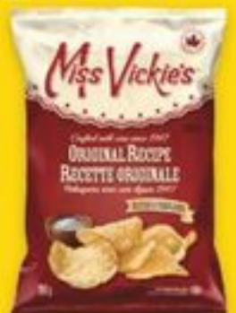
MISS VICKIE'S KETTLE COOKED POTATO CHIPS selected varieties 190/200 g 21240702 SA