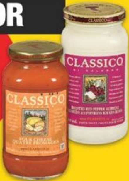
CLASSICO PASTA SAUCE 410/600 mL sauce pour pâtes 2022360906 EA/21618218 EA