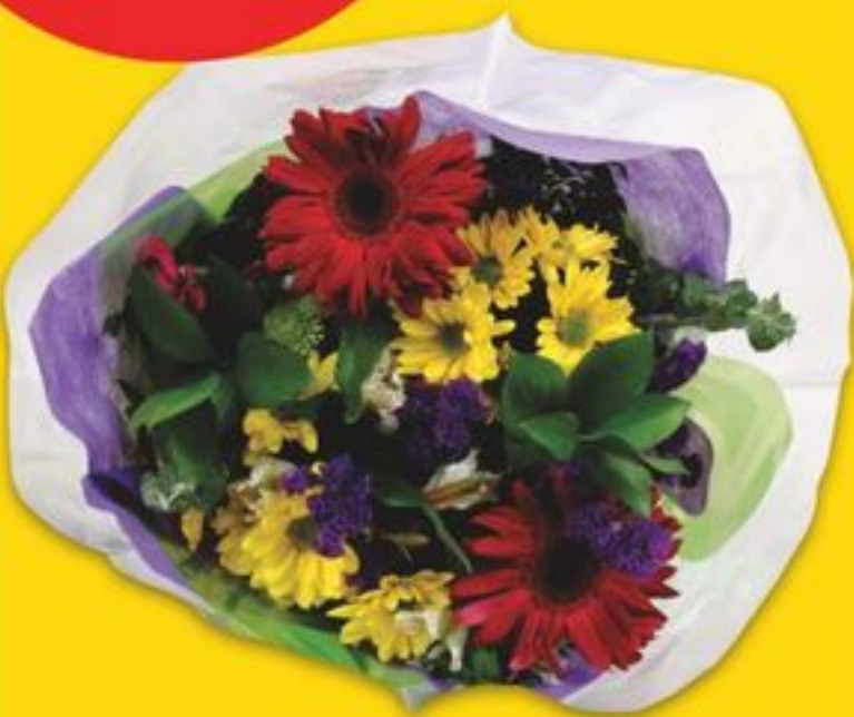
INTERNATIONAL WOMEN'S DAY BOUQUET assorted colours bouquet 2139756 EA