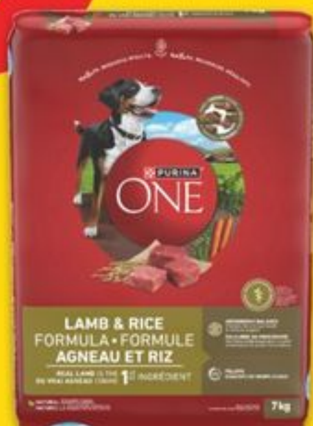
PURINA ONE DRY DOG FOOD 7 kg or TIDY CATS LIGHTWEIGHT CAT LITTER 7.71 kg selected varieties nourriture sèche pour chiens ou litière pour chats 20239412 EA