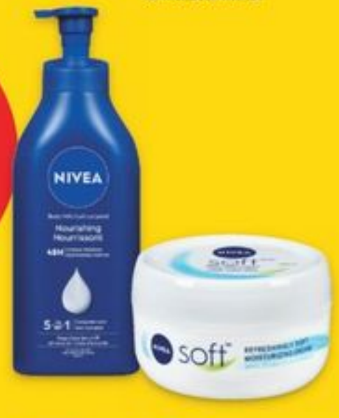
NIVEA HAND or BODY LOTION selected varieties, 200-625 mL lotion pour les mains ou le corps 20448737 EA/20700027 EA