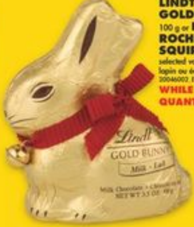
LINDT GOLDEN BUNNY 100 g or FERRERO ROCHER SQUIRREL 90 g selected varieties lapin ou écureuil en chocolat 20044002 EA WHILE QUANTITIES LAST