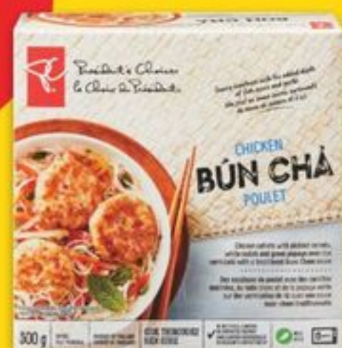
PC® ASIAN SOUPS or ENTRÉES selected varieties, frozen 300 g soups ou plats cuisinés 21565869 EA