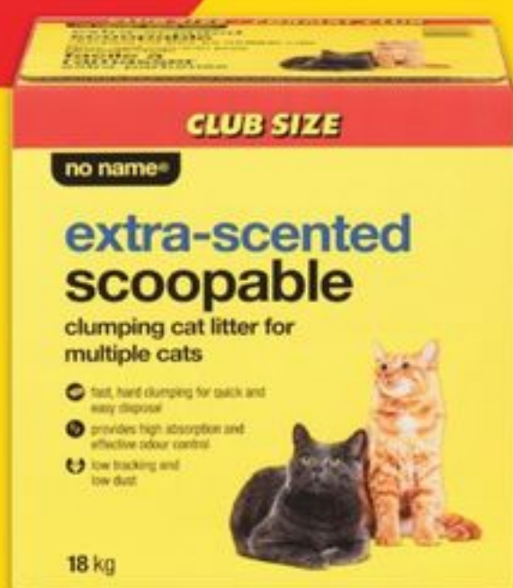
NO NAME® CAT LITTER selected varieties 18 kg litière pour chats 20177149001 EA