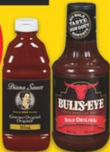
DIANA 500 mL or BULL'S-EYE 425 mL SAUCE selected varieties 30008 20247834001 EA/21184617 EA