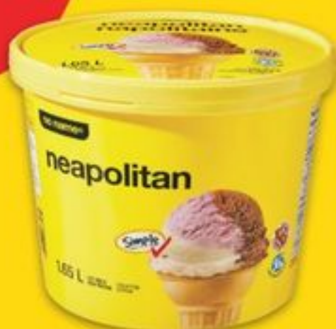
NO NAME® ICE MILK selected varieties, frozen 1.65 L lait glacé 21610174 EA