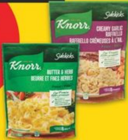
KNORR SIDEKICKS selected varieties 121-162 g plats d'accompagnement 2021430907 EA/2021430912 EA