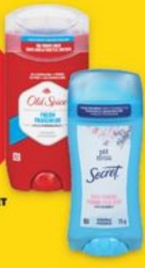
OLD SPICE or SECRET DEODORANT selected varieties 45-107 g déodorant 20448094 EA/2044349001 EA