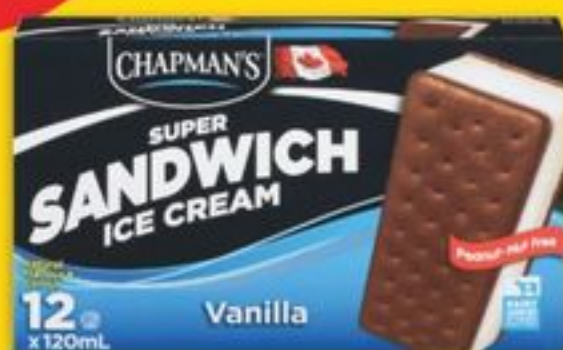
CHAPMAN'S SUPER NOVELTIES selected varieties, frozen 8-12's friandises glacées 20111532 EA