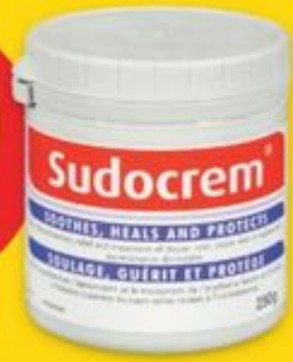
SUDOCREM 250 g crème contre l'érythème fessier 20147213 EA