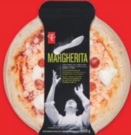
PC®, PC® BLACK LABEL or NO NAME® PIZZA all sizes and varieties pizza 21521411 EA

APP EXCLUSIVE OFFER* Optimum® EARN 1,000 pts =$1 Value for every $5* spent on