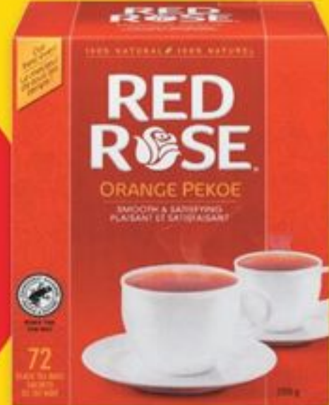
RED ROSE ORANGE PEKOE TEA 72's thé 21593421 EA