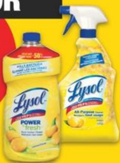
LYSOL MULTI SURFACE CLEANER 1.2L or SPRAYS 650-950 mL selected varieties mellroynt 20209872002 EA/2021047901 EA