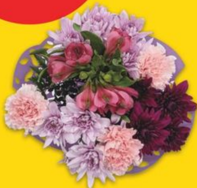
SEASONAL BOUQUET assorted colours bouquet 2161994 EA