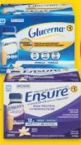
ENSURE or GLUCERNA READY TO DRINK SHAKES selected varieties 9's Sole Ingrédients 20140104003 EA/20140721001 EA