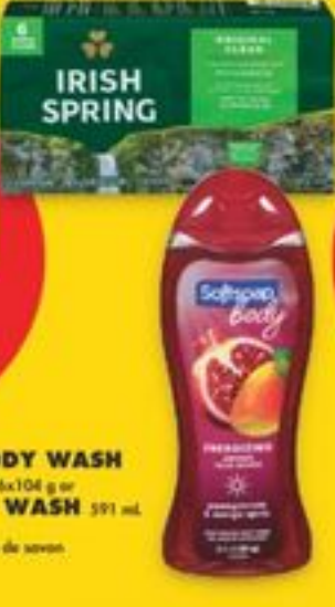
IRISH SPRING BODY WASH 391 mL or BAR SOAP 6x104 g or SOFTSOAP BODY WASH 391 mL selected varieties nettoyant pour le corps ou pain de savon 21214273 EA/21436477 EA