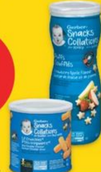
GERBER SNACKS or ENTRÉES selected varieties 43-187 g collations ou plats cuisinés 20140104003 EA/20140410007 EA