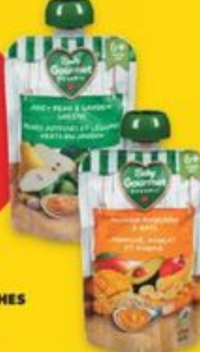
BABY GOURMET ORGANIC FRUIT or VEGETABLE BABY FOOD POUCHES selected varieties 113/128 mL aliments pour bébé en sachets 20140104001 EA/21123002 EA