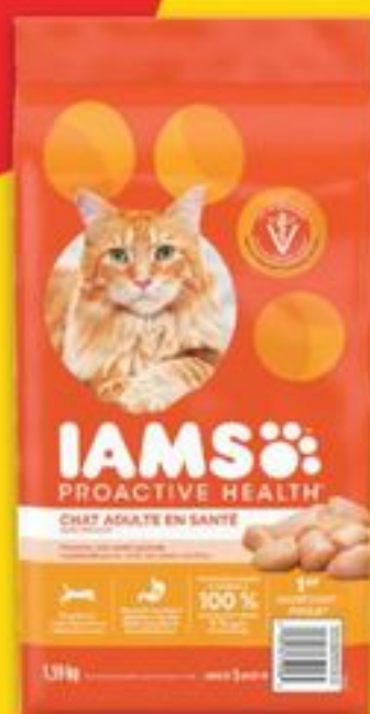
IAMS DRY CAT FOOD selected varieties 1.36-1.65 kg nourriture sèche pour chats 11027550 EA