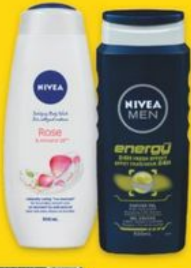
NIVEA BODY WASH selected varieties 500 mL nettoyant pour le corps 21149999 EA/21149901 EA