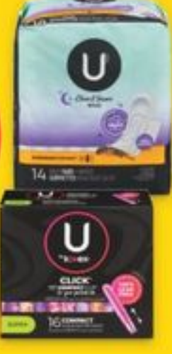
U BY KOTEX LINERS 40-50's, PADS 14-22's or TAMPONS 14's selected varieties protège-dos ou serviettes ou tampons 20447090 EA/21307970 EA