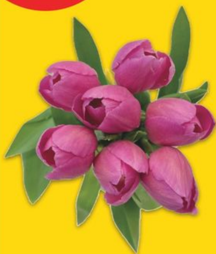
CUT TULIPS 9 inches, assorted colours tulips 2160811 EA