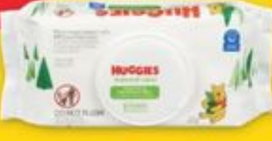
HUGGIES 1X WIPES selected varieties 56/64's Singles 20027794 EA