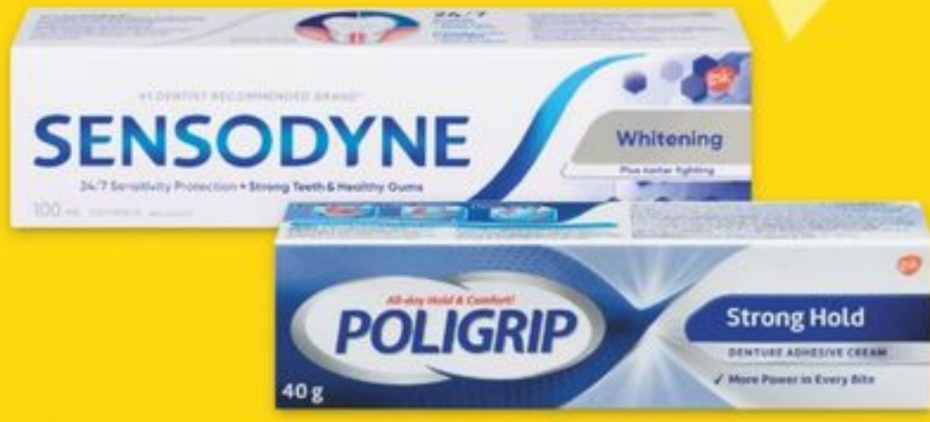
SENSODYNE or PRONAMEL TOOTH PASTE 75/100 mL or POLIGRIP 40 g selected varieties dentifrice ou adhésif pour prothèses dentaires 20301179001 EA/20734073 EA