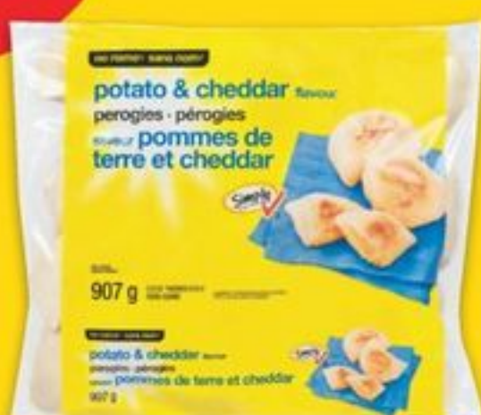
NO NAME® PEROGIES selected varieties, frozen 907 g perogies 20811340 EA