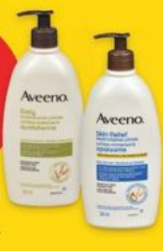
AVEENO LOTION selected varieties 532 mL lotion 20170023001 EA/2010002002 EA