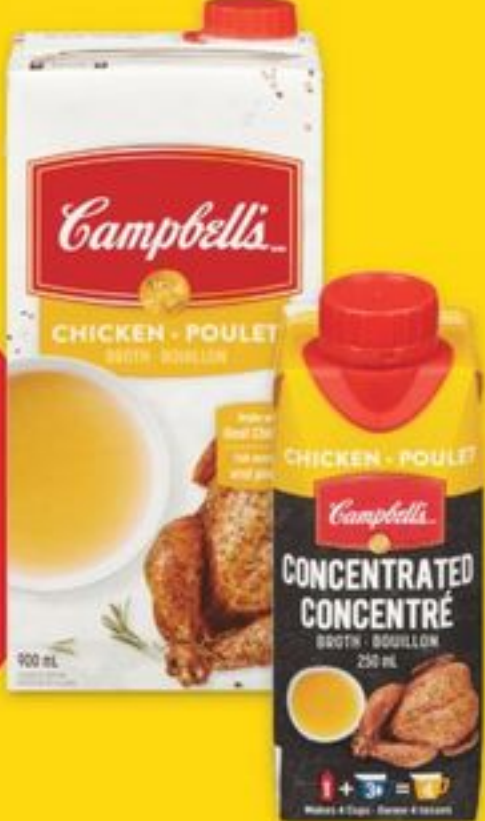
CAMPBELL'S BROTH selected varieties 250/900 mL bouillon 2022348002 EA/21147343 EA