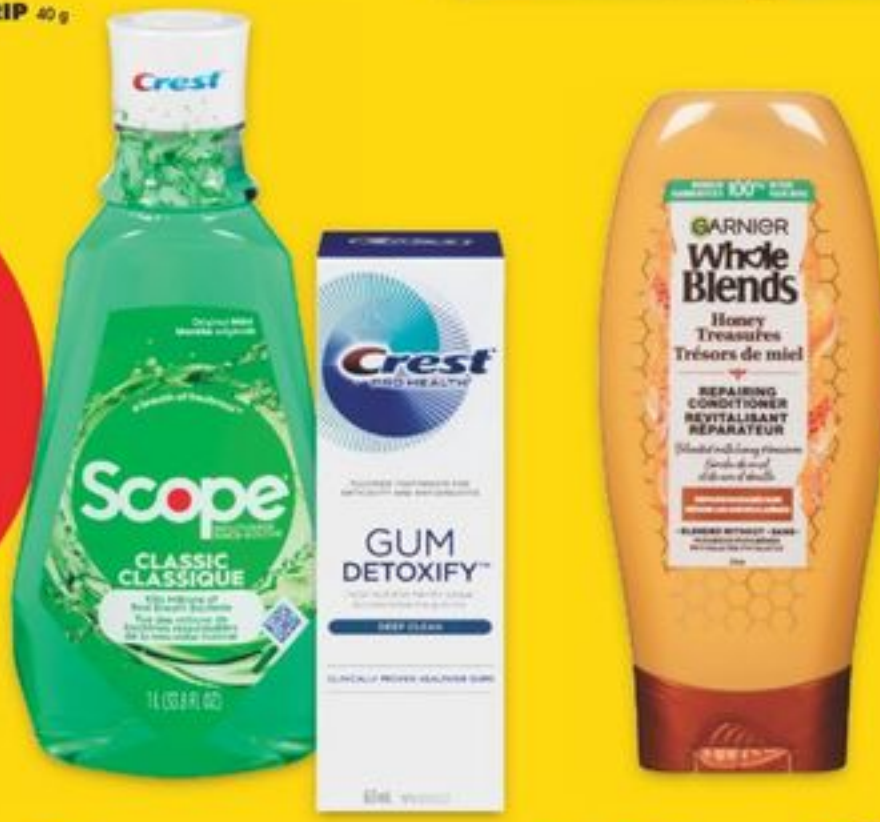
CREST GUM TOOTH PASTE 63 mL or SCOPE MOUTHWASH 1 L selected varieties dentifrice ou rinçage-bouche 20448747 EA/21334490 EA