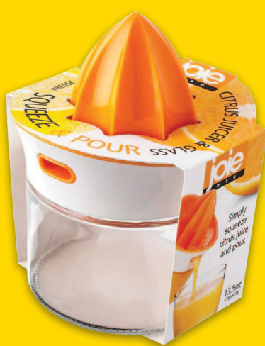
JOIE ORANGE JUICER 21179934_EA