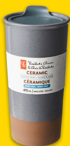
PC® CERAMIC COFFEE MUG blue, 415 mL 21217642_EA