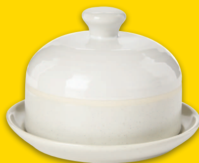
PC® ARTISANAL BUTTER DISH 21351525_EA