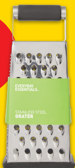
EVERYDAY ESSENTIALS™ 4-SIDED GRATER 21343405_EA