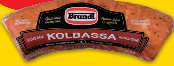
BRANDT KOLBASSA selected varieties, 250 g kolbassa 20353446_EA