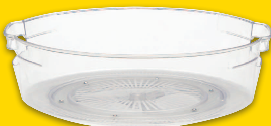
EVERYDAY ESSENTIALS™ SPICE STORAGE TURNTABLE 21161822_EA