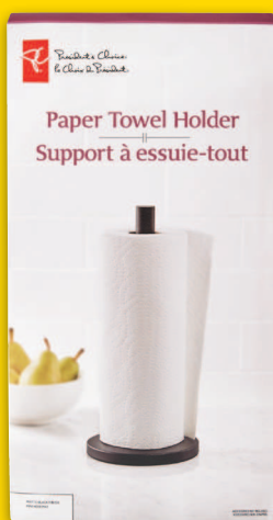
PC® PAPER TOWEL HOLDER black 21344969_EA