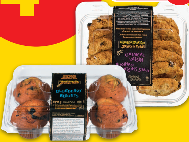
FARMER'S MARKET™ MUFFINS 6's or COOKIES 12's selected varieties muffins ou biscuits 20566295_EA/21283356_EA