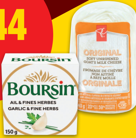
PC® GOAT CHEESE LOGS 140 g or BOURSIN CHEESE 150-220 g selected varieties fromage de chèvre ou fromage 20000584_EA/20116794_EA