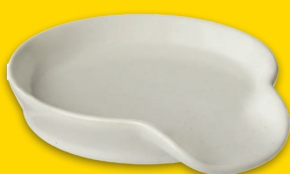
PC® FARMHOUSE SPOON REST 21351052_EA