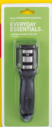
EVERYDAY ESSENTIALS™ DUAL KNIFE SHARPENER 20218999_EA