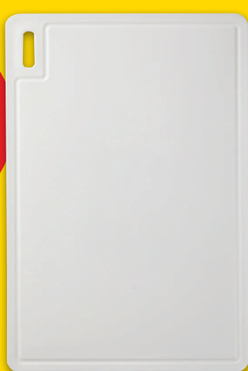
EVERYDAY ESSENTIALS™ LARGE PREP BOARD 21122552_EA