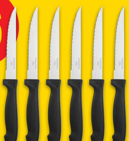
EVERYDAY ESSENTIALS™ 6-PIECE STEAK KNIFE SET 20113389_EA