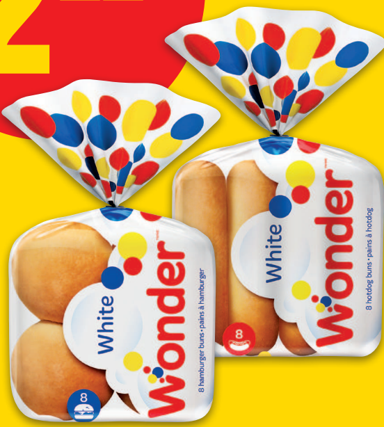
WONDER BUNS selected varieties, 8's petits pains 20297455_EA/20305135_EA