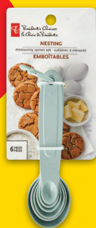
PC® 6-PIECE MEASURING SPOON SET 21345387_EA