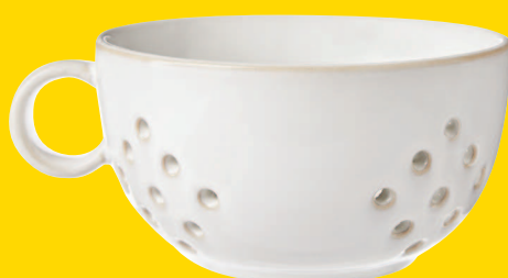
PC® ARTISANAL BERRY PINT 21445203_EA