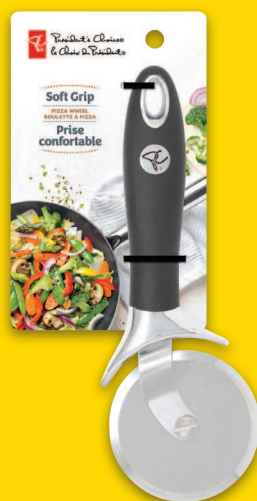
PC® SOFT GRIP PIZZA WHEEL 21190094_EA