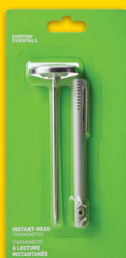
EVERYDAY ESSENTIALS™ INSTANT-READ THERMOMETER 21218245_EA