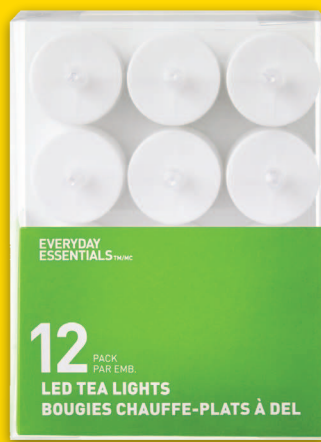
EVERYDAY ESSENTIALS™ LED TEALIGHTS 12's 21415653_EA