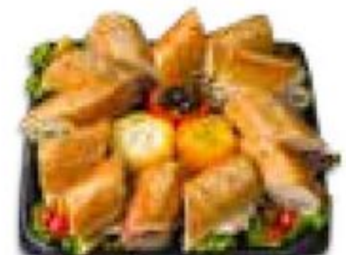
Hoagie Sandwich Tray 16-inch serves 12-14