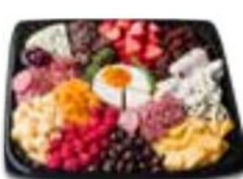
Sweet Treat Tray 12-inch serves 15-20