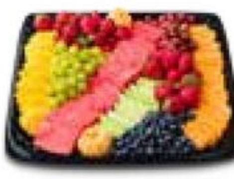
Fruit Tray 16-inch serves 20-25 18-inch serves 25-30