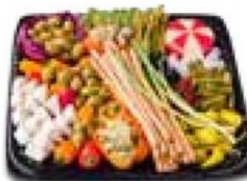
Cocktail Tray 12-inch serves 15-20