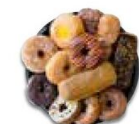
Donut Platter Serves 12