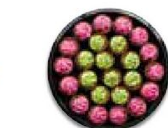
Brownie Bite Platter Serves 20-24