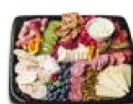
Elegant Charcuterie Tray 12-inch serves 15-20