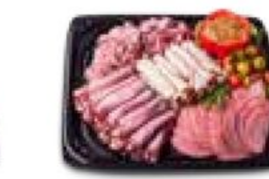
Meat Lover's Tray 12-inch serves 12-16 16-inch serves 20-25 18-inch serves 25-30