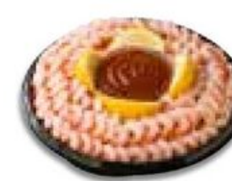
Bounty Shrimp Party Tray Serves 8-12