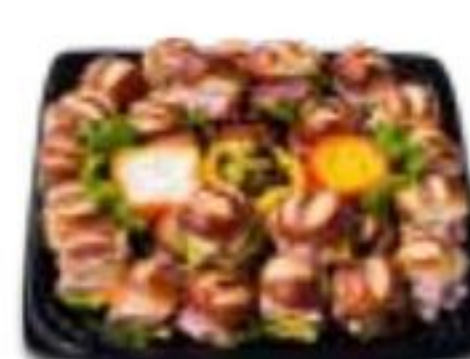
Pretzel Roll Slider Tray 16-inch serves 25-27 18-inch serves 40-45