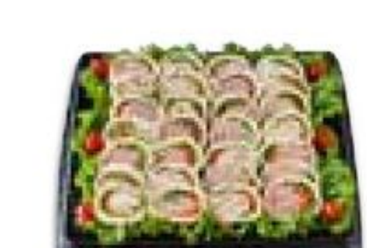
Pinwheel Tray 16-inch serves 12-16 18-inch serves 16-18