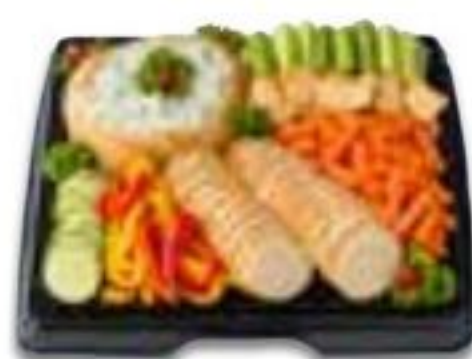
Big Dipper Tray 16-inch serves 15-20