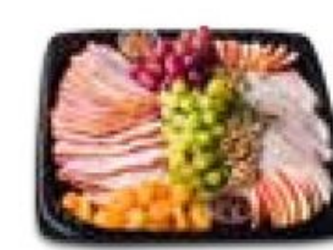
Carving Tray 16-inch serves 18-20