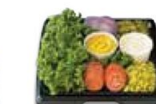
Condiment Tray 16-inch serves 12-16