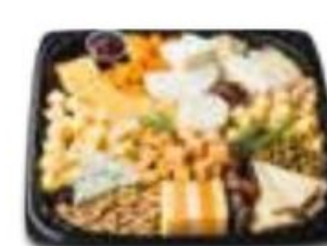
European Cheese Tray 12-inch serves 15-20