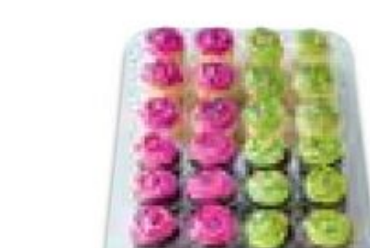
Cupcake Tray Serves 24