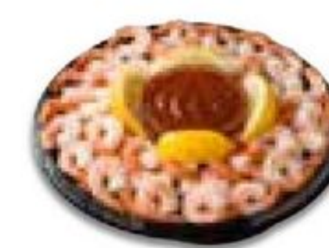
Admiral's Feast Party Tray Serves 6-8