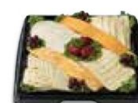
Sliced Cheese Tray 16-inch serves 20-25 18-inch serves 25-30