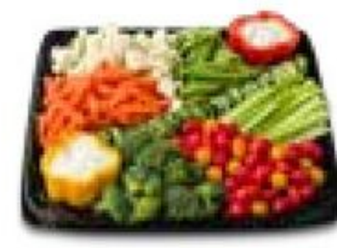
Vegetable & Dip Tray 16-inch serves 20-25 18-inch serves 25-30