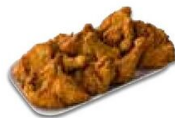
Fried Chicken Party Pack 50 Pieces, 100 Pieces 150 Pieces