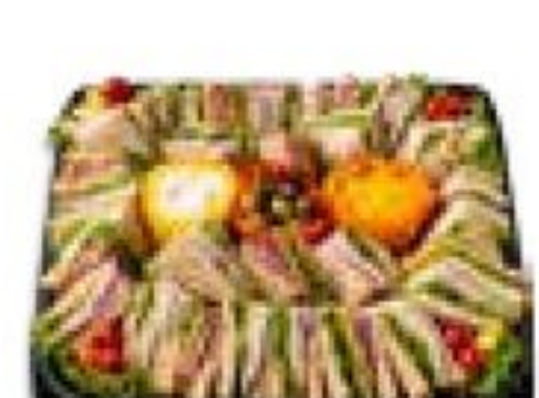
Finger Sandwich Tray 16-inch serves 12-16 18-inch serves 18-24