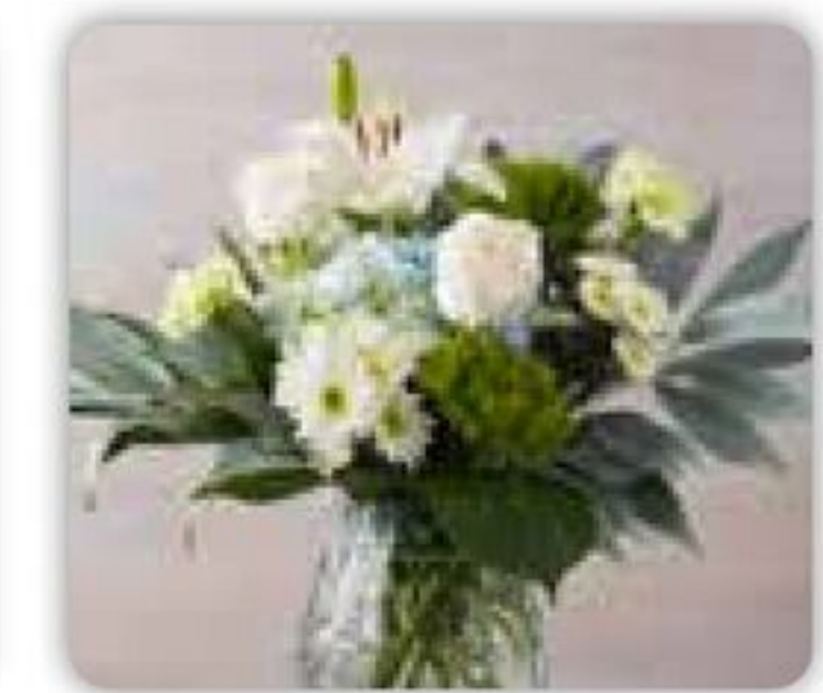
Elegant Romance Bouquet