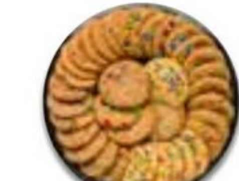
Cookie Platter Serves 36-50