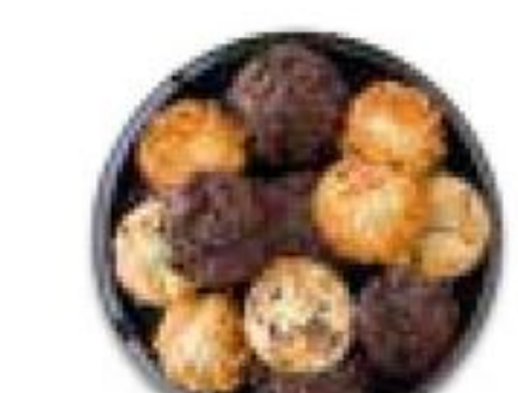
Muffin Platter Serves 12