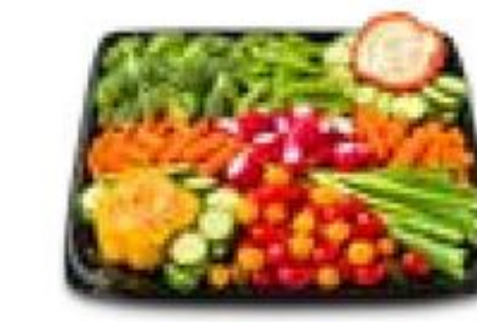
Vegetable & Hummus Tray 16-inch serves 20-25 18-inch serves 25-30