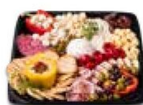
Mediterranean Tray 12-inch serves 15-20