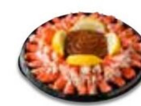
Alaskan Snow Leg Surimi Party Tray Serves 6-8