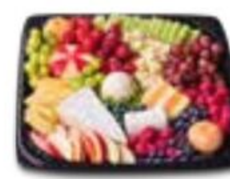
Fine Cheese & Fruit Tray 16-inch serves 15-20