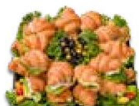
Mini Salad Croissant Tray 16-inch serves 12-16 18-inch serves 16-24