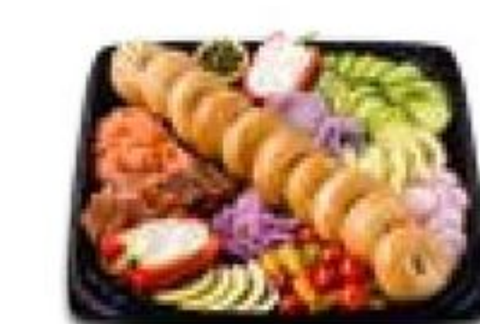
Lox & Bagel Tray 16-inch serves 10-12