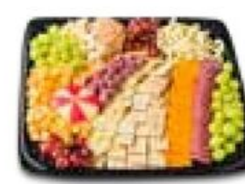
Classic Party Pack 16-inch serves 15-20