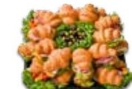
Mini Croissant Tray 16-inch serves 12-16 18-inch serves 16-24