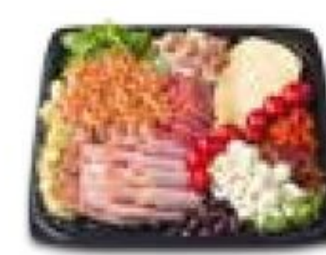
Italian Tray 16-inch serves 15-20