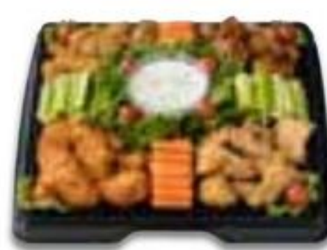
Wing Fling Tray 16-inch serves 12-16