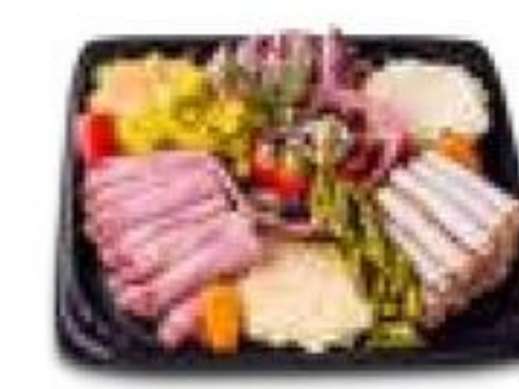
Classic Meat & Cheese Tray 12-inch serves 15-20 16-inch serves 20-30 18-inch serves 30-40