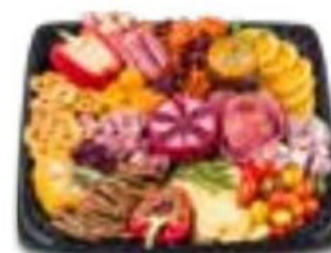
Harvest Tray 12-inch serves 15-20