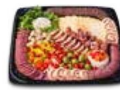
Italian Sampler 16-inch serves 15-20