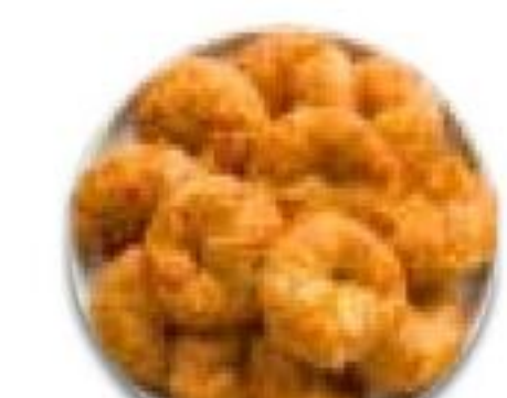
Croissant Platter Serves 12