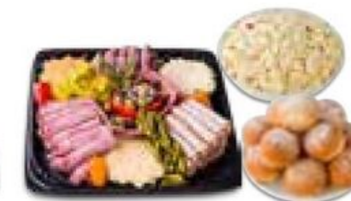
Deli Party Pack serves 20-24