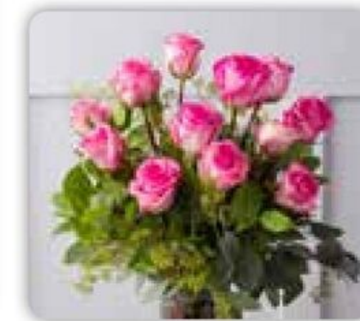
Illusion Rose Bouquet