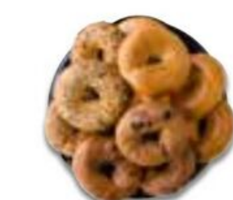
Bagel Platter Serves 12