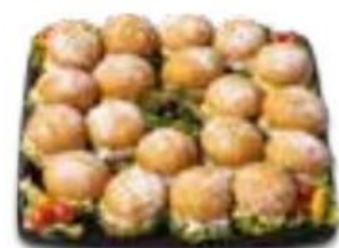
Salad Sandwich Tray 12-inch serves 10-12 16-inch serves 16-24