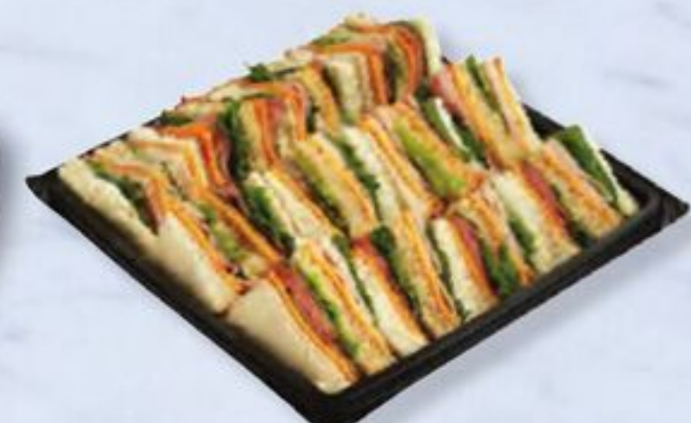
Mini Club Sandwich serves 4-6