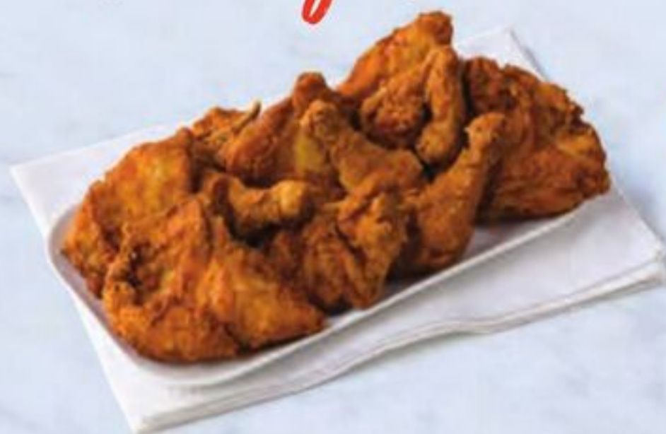
Fried Chicken Party Pack 50pc. - 500pc.