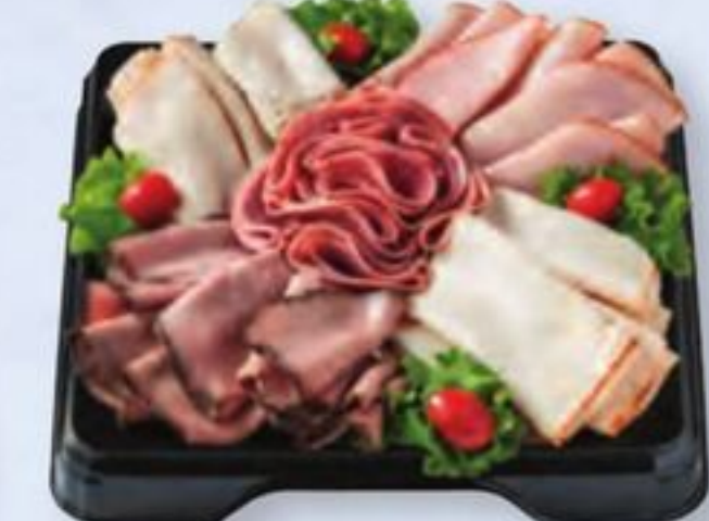
Meat Lover's Tray