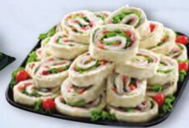
Hye Roller serves 4-6