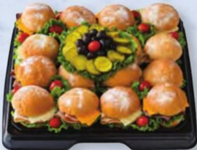
Party Roll Sandwich Tray 16" serves 8-12 18" serves 12-16