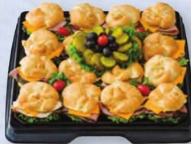
Croissant Sandwich Tray 16" serves 8-12 18" serves 12-16