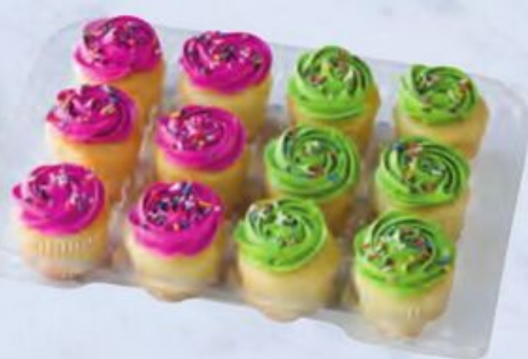
Cupcakes servings vary