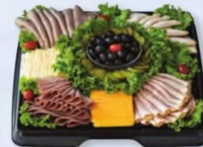
16" Ecomm Meat & Cheese Tray