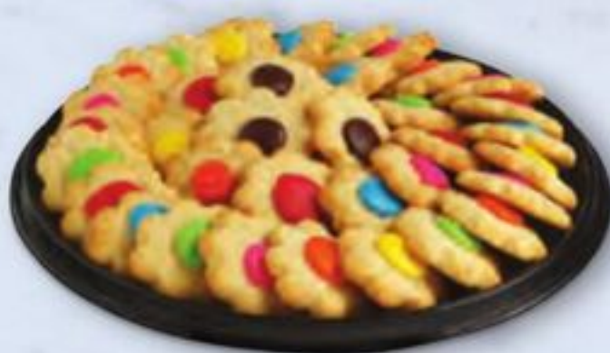
Butter Cookies serves 36