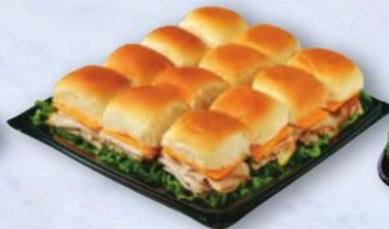
Sliders serves 4-6