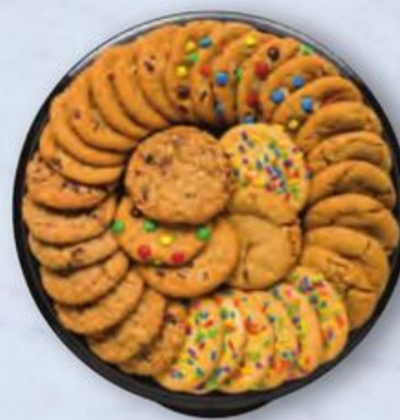
Cookie Platter serves 36