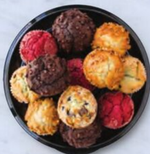
Muffin Platter serves 16