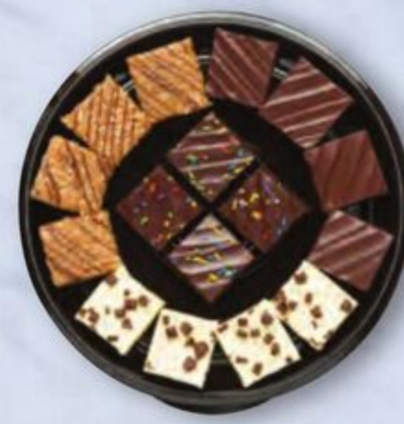
Brownie Platter serves 16