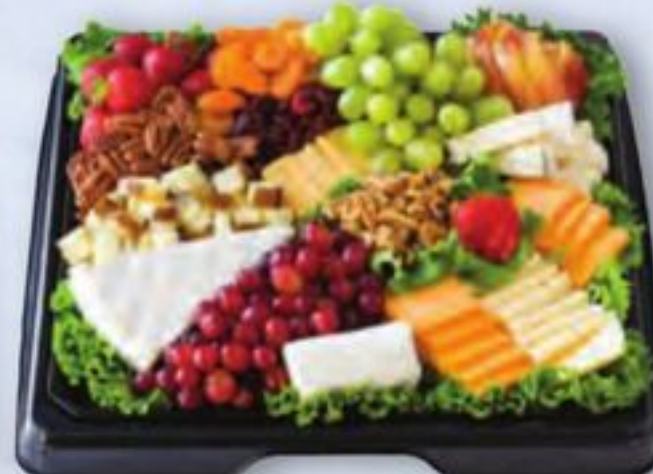
Gourmet Cheese Tray