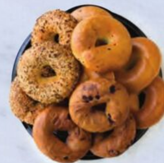
Bagel Platter serves 16