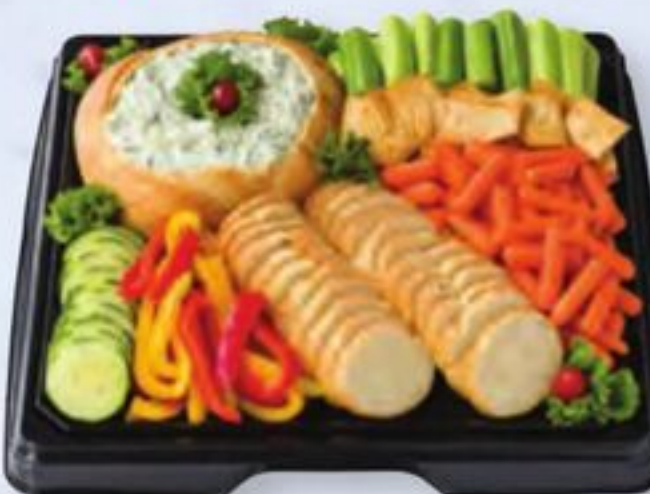
Big Dipper Tray