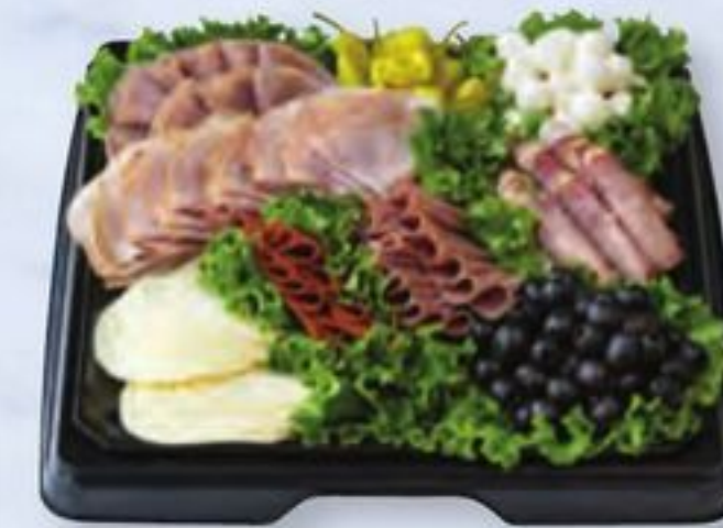
Italian Meat & Cheese Tray