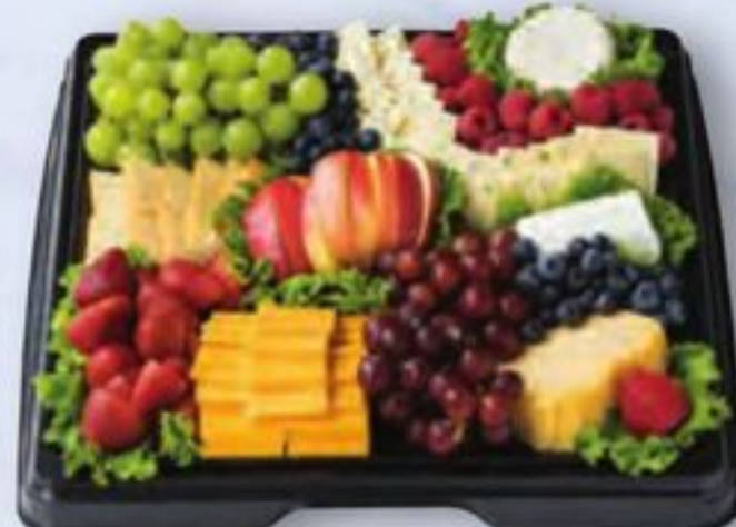
Fruit & Cheese Tray