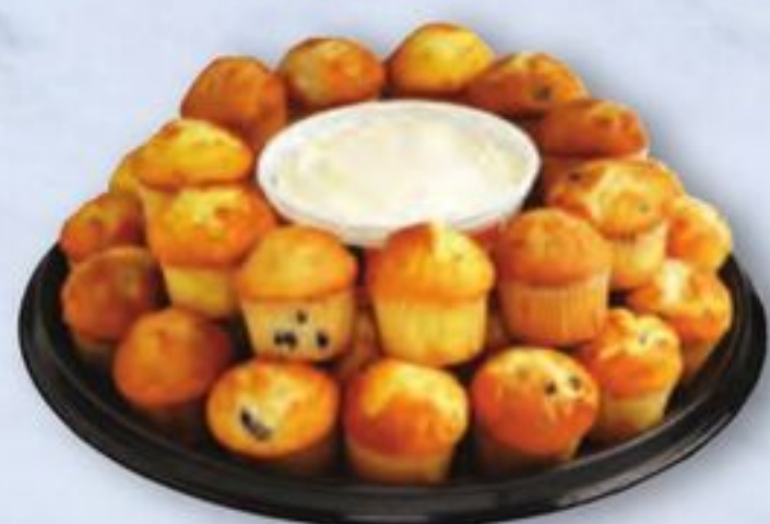
Mini-Muffin Tray serves 24