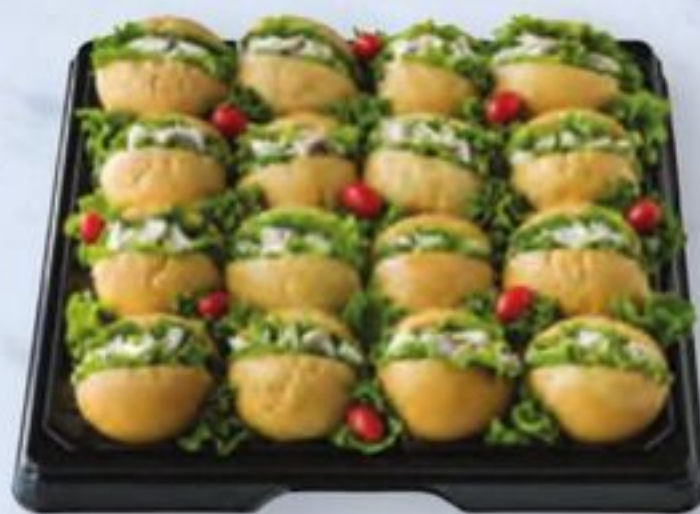
Club Salad Sandwich Tray 18" serves 8-12