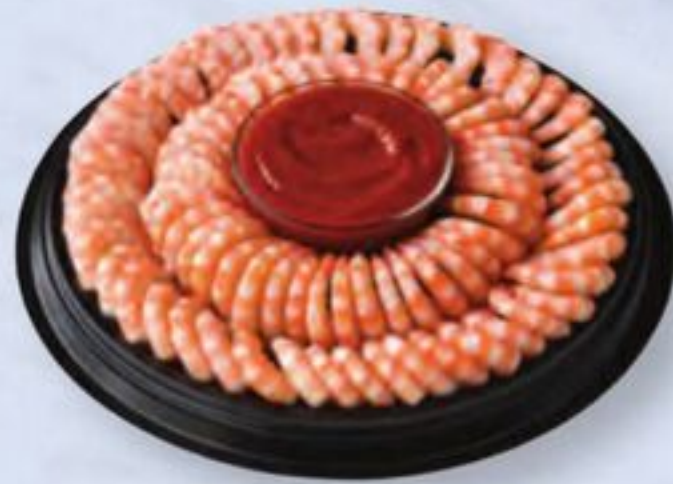
Waterfront Bistro Double Shrimp Ring 32 oz. serves 12-14