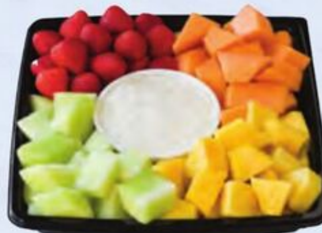
Fruit Tray serves 6-8