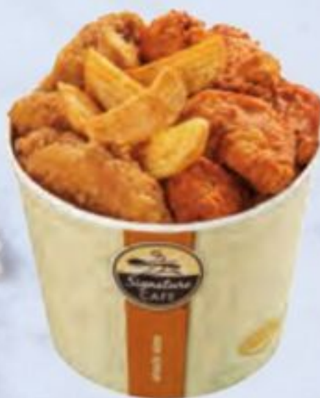
Party Bucket serves 4-6