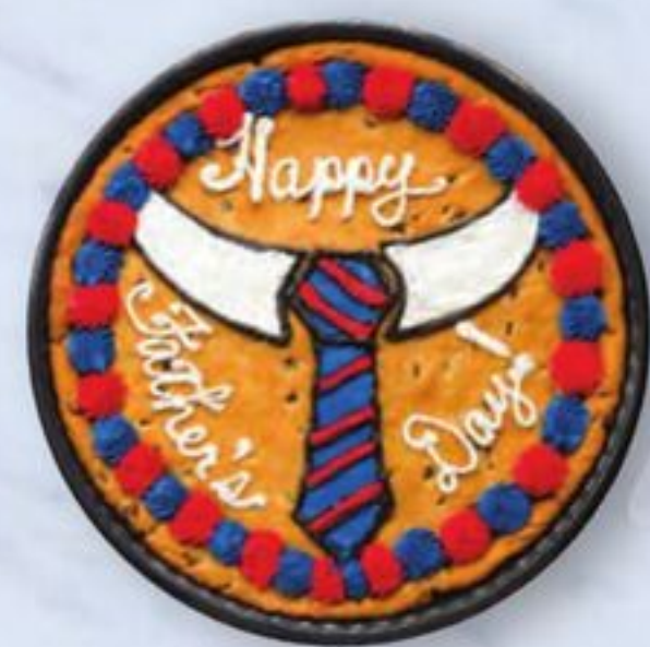
Message Cookies serves 8-12