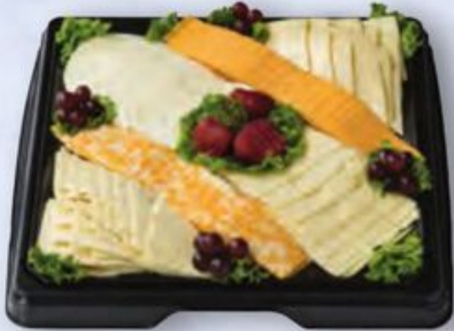
Sliced Cheese Tray