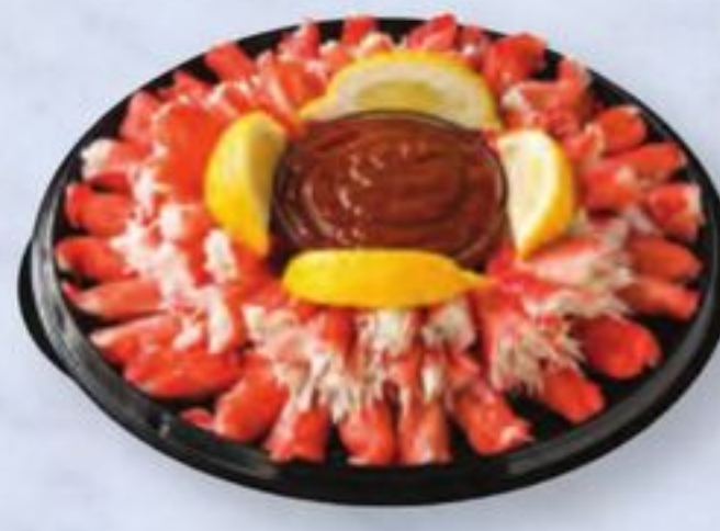
Alaskan Snow Crab Party Tray 32 oz. serves 8-12