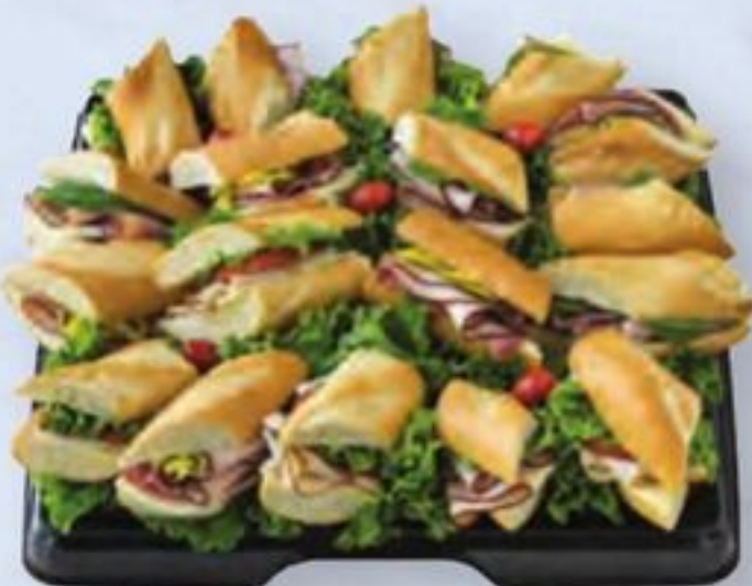
Baguette Sandwich Tray 16" serves 10-14