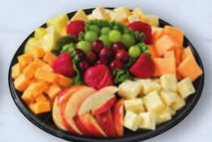
Fruit & Cheese Nibbler