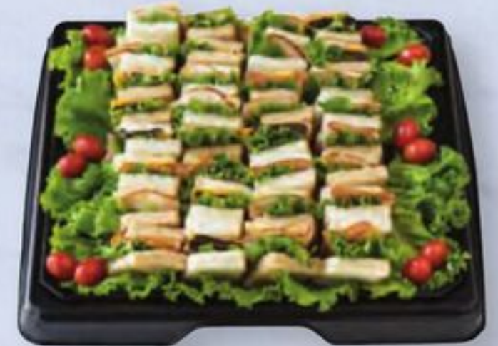
Finger Sandwich Tray 16" serves 12-16