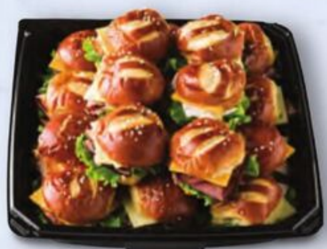
Pretzel Slider Tray serves 10-12