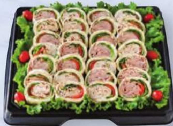
Pinwheel Sandwich Tray 12" serves 8-12 16" serves 12-16