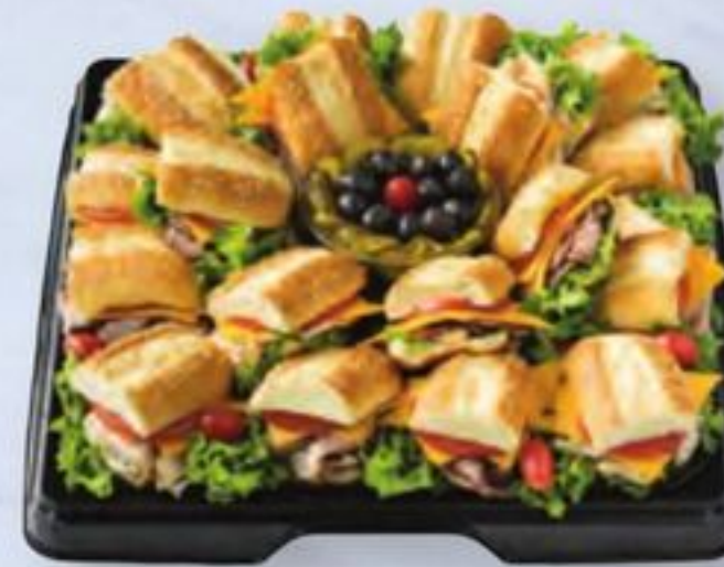
Hoagie Sandwich Tray 16" serves 10-14