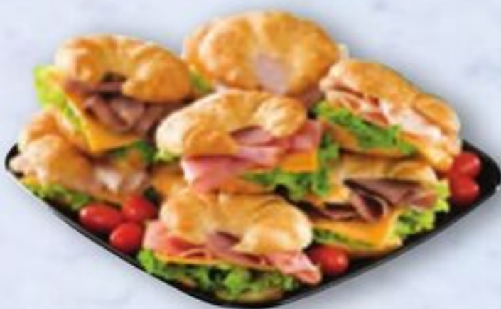
Croissant Sandwiches serves 4-6