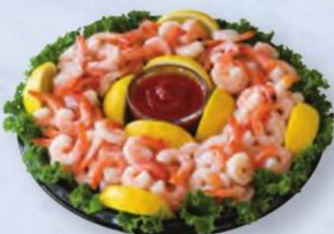
Cooked Shrimp Tray 12" serves 12-14