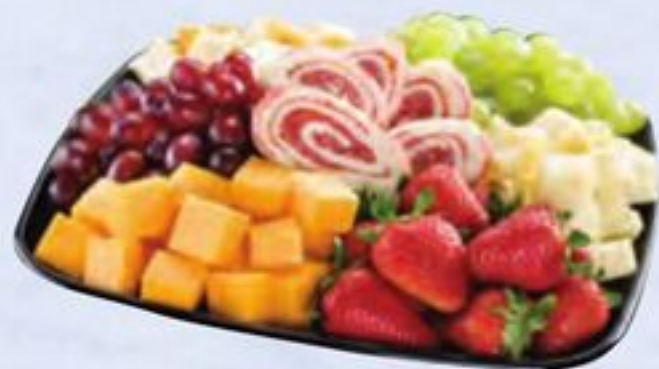
Fruit & Cheese serves 6-8