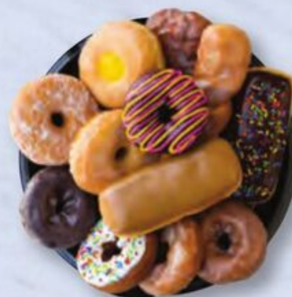
Donut Platter serves 12