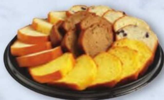
Sliced Sweet Loaf Tray serves 20