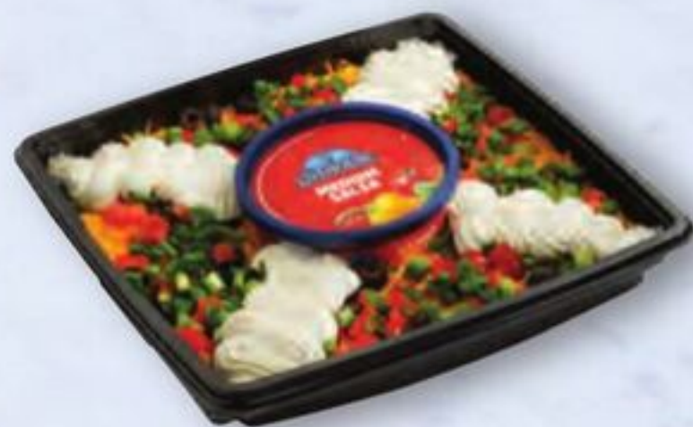
Bean Dip Tray serves 6-8