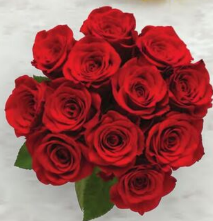
debi lilly™ Red Rose