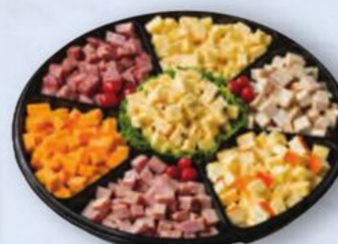
Meat & Cheese Nibbler