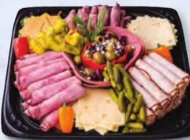
Meat & Cheese Tray