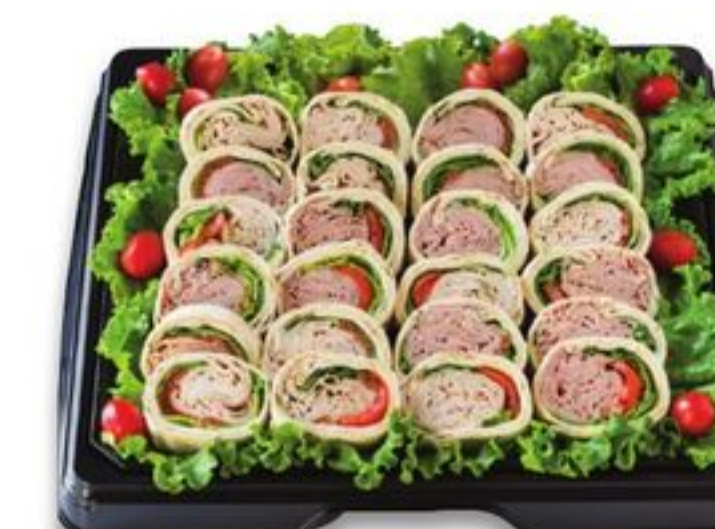
Pinwheel Tray An assortment of turkey, ham and roast beef pinwheels on green leaf lettuce made with herb cheese spread 16-inch serves 12-16 18-inch serves 16-18