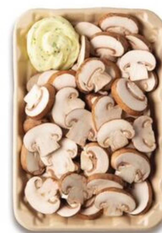
Mushrooms with Roasted Garlic Butter Tray 8.75-oz.