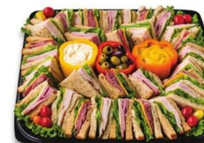
Finger Sandwich Tray Turkey and American, roast beef and cheddar, ham and swiss served on multigrain bread with mayo and mustard with assorted olives 16-inch serves 12-16 18-inch serves 18-24