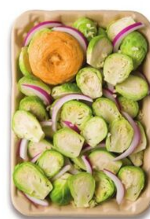
Brussels Sprouts with Tomato Chipotle Butter Tray 11-oz.