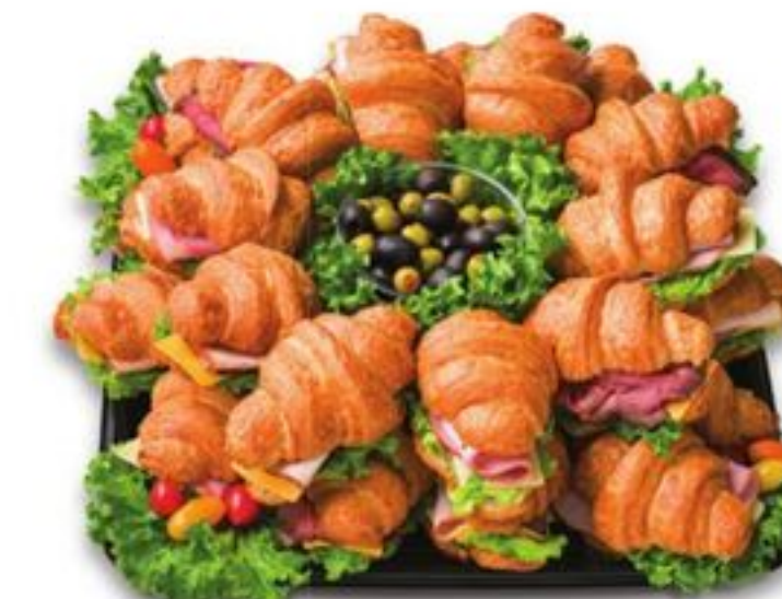
Mini Croissant Tray Mini croissants, turkey breast, ham, roast beef, cheddar cheese, swiss cheese, mayo and mustard on green leaf lettuce with assorted olives 16-inch serves 12-16 18-inch serves 16-24