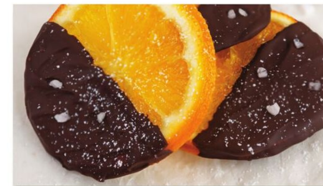
Hand-dipped dried fruit.

Step into our Patisserie where you'll discover our team has been busy creating masterpieces just for you. Indulge in the most delicious hand-dipped apples, truffles, dried fruit and candy— all crafted with premium chocolate.