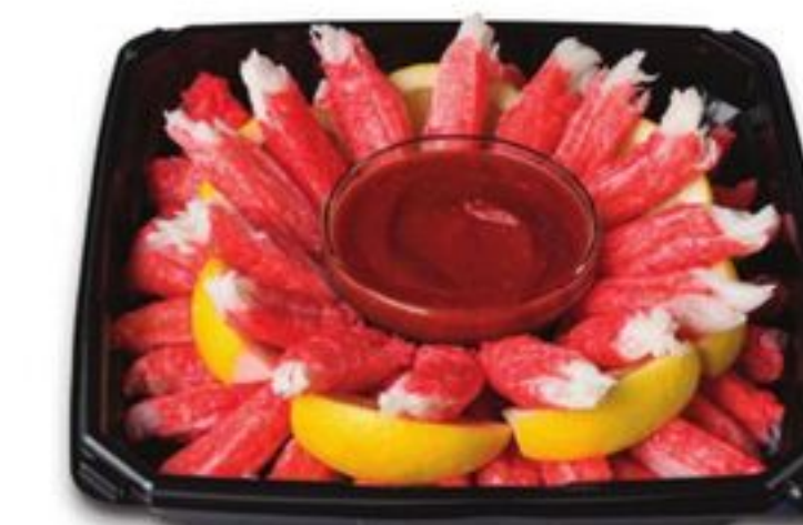
Kick'd Up Alaskan Snow Leg Surimi Party Tray 2-lb. Includes cocktail sauce and lemon.