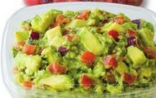
Guacamole Mild or Spicy. 14-oz.