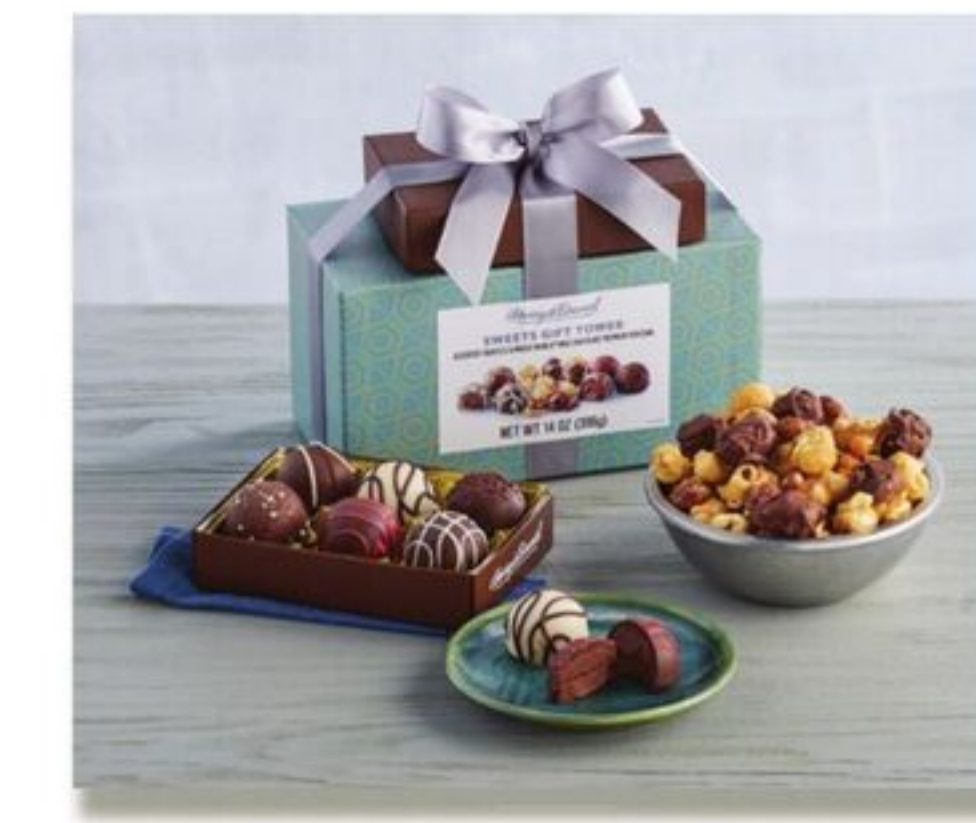
Harry & David Crafty Box Snacks