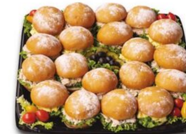
Salad Sandwich Tray Chicken salad, tuna salad, egg salad served on potato rolls 12-inch serves 10-12 16-inch serves 16-24