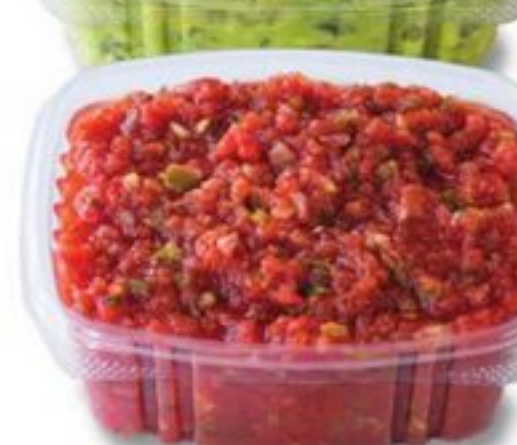
Salsa Mild or Spicy. 12-oz.