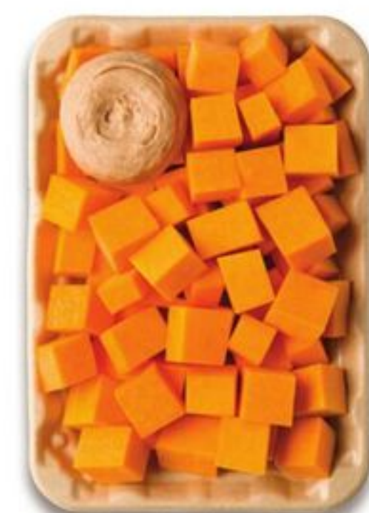
Butternut Squash with Cinnamon Sugar Butter Tray 15-oz.