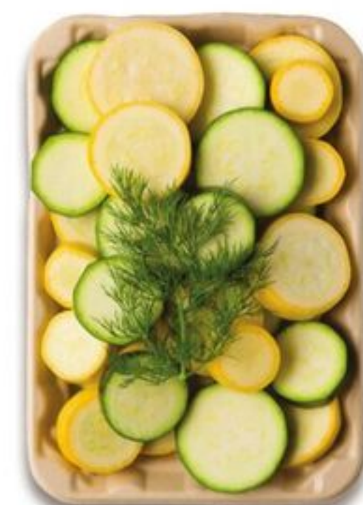
Squash Mix with Dill Tray 12.04-oz.