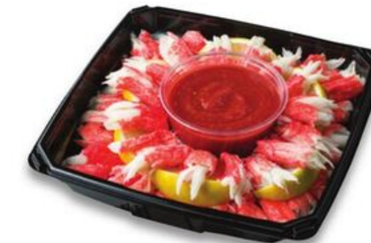
Kick'd Up Alaskan Snow Leg Surimi Party Tray 1-lb. Includes cocktail sauce and lemon.