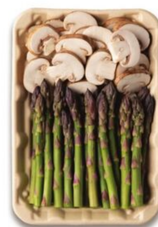
Mushroom and Asparagus Tray 8.5-oz.

Looking for the perfect side dish or to get a head start. Our veggies come pre-packaged, pre-cut and full of delicious flavoring. Just cook and enjoy.