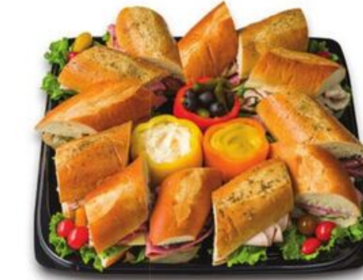
Hoagie Sandwich Tray A delicious variety of meats and cheeses served on hero bread and green leaf lettuce with mayo and mustard 16-inch serves 18-24