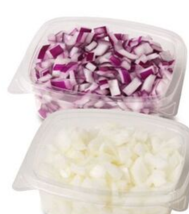
Chopped Onions Red or Yellow. 6-oz.