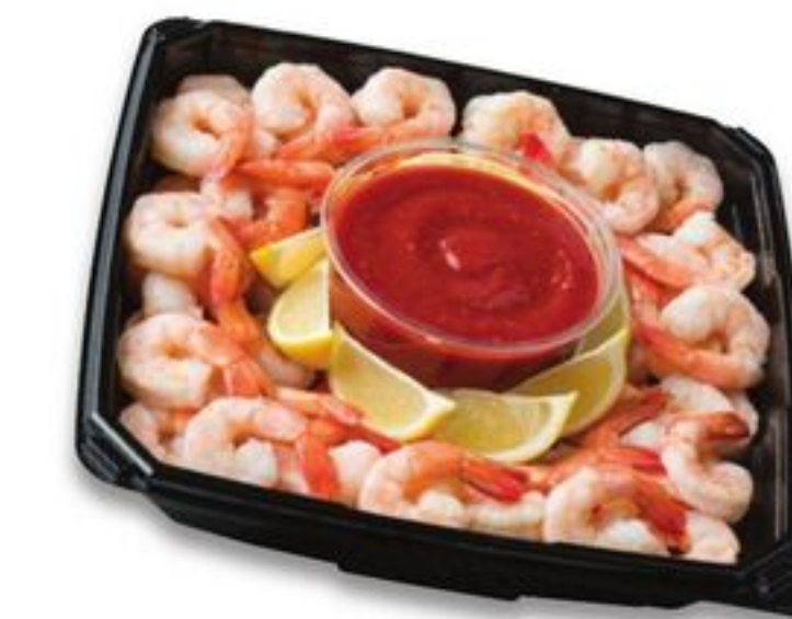
Kick'd Up Bounty Shrimp Party Tray 2-lb. 31/40-ct. Cooked Shrimp. Includes cocktail sauce and lemon.