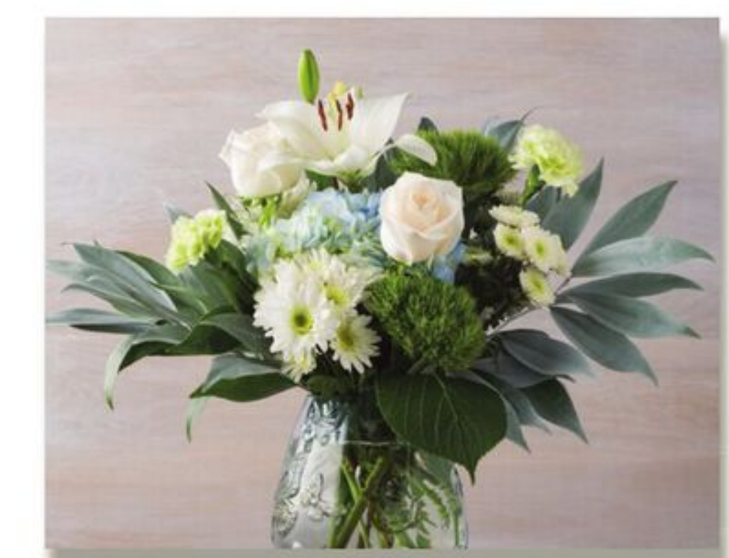
Elegant Romance Bouquet