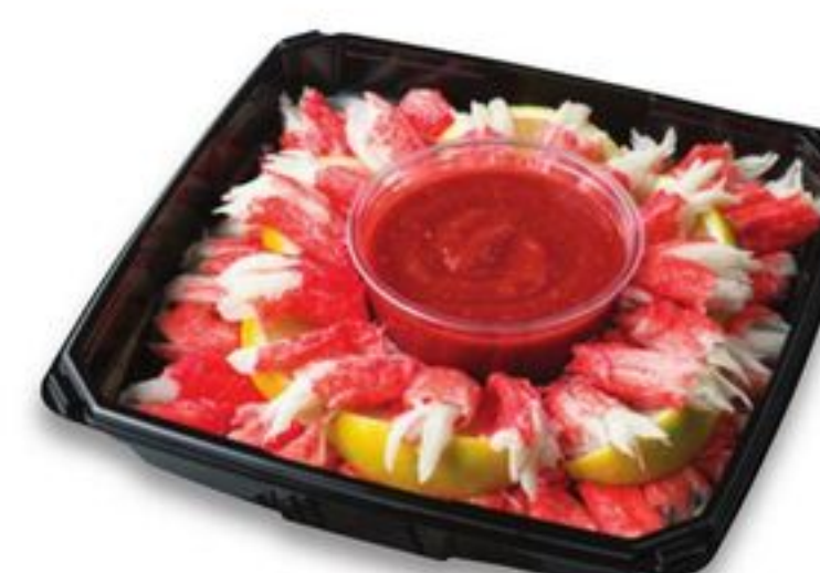
Kick'd Up Combo Party Tray 1-lb. Alaskan Snow Leg Surimi 1-lb. 31/40-ct. Cooked Shrimp. Includes cocktail sauce and lemon.