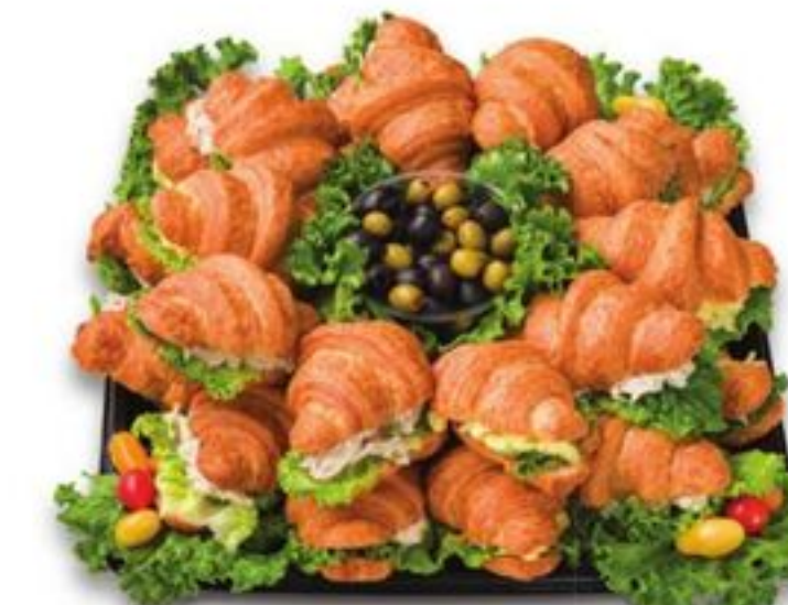
Mini Salad Croissant Tray Chicken salad, tuna salad, egg salad served on mini croissants 16-inch serves 12-16 18-inch serves 16-24