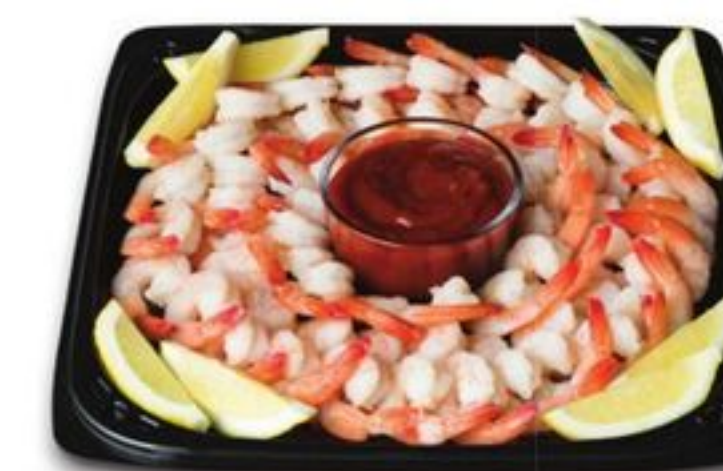
Kick'd Up Admirals Feast Party Tray 2-lb. 21/25-ct. Cooked Shrimp. Includes cocktail sauce and lemon.