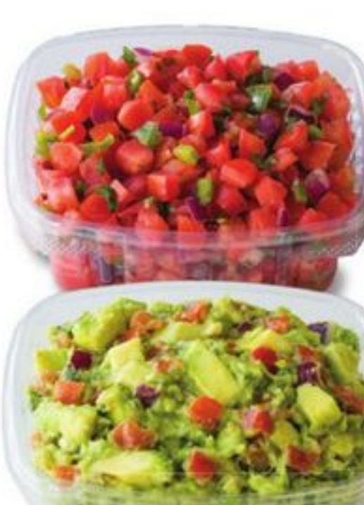
Pico de Gallo 6 or 10-oz.