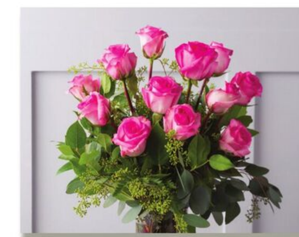
Illusion Rose Bouquet