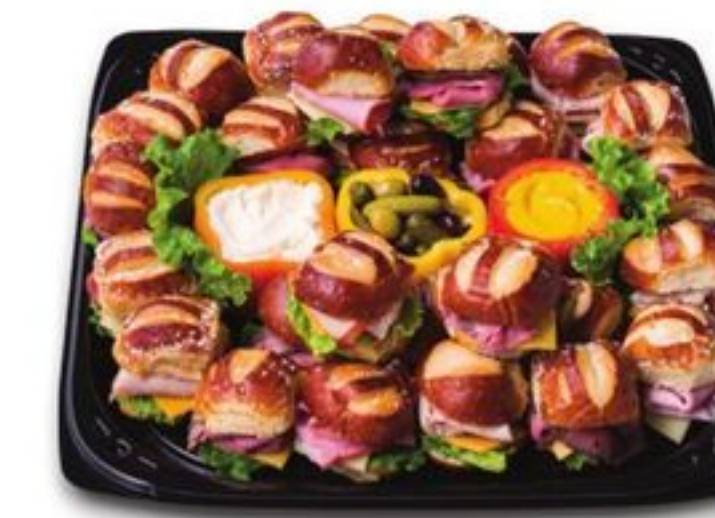
Pretzel Roll Slider Tray Turkey, ham, roast beef, swiss, American, cheddar cheese served on pretzel roll with green leaf lettuce with mayo and mustard and assorted olives 16-inch serves 25-27 18-inch serves 40-45

Whether you're hosting an office lunch or having friends over to watch the game, our sandwiches are made to order with only the freshest ingredients, and thoughtfully prepared to impress your guests.