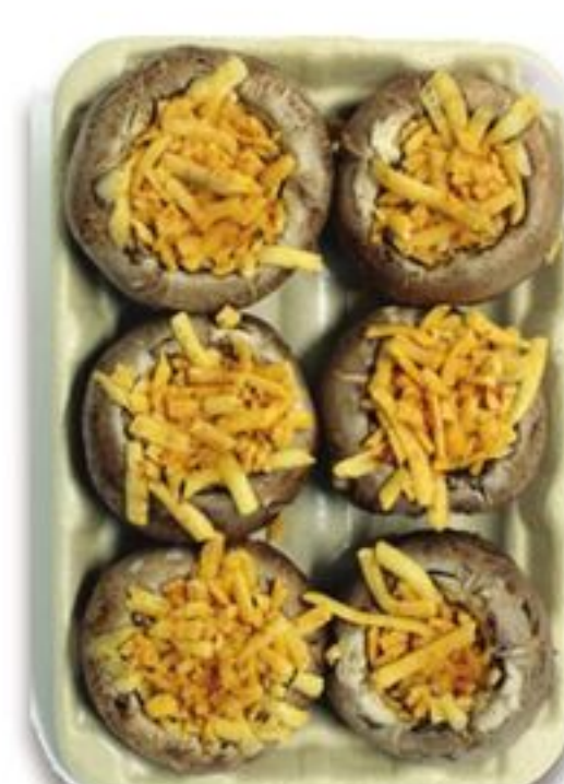
Stuffed Mushrooms Tray 8-oz.