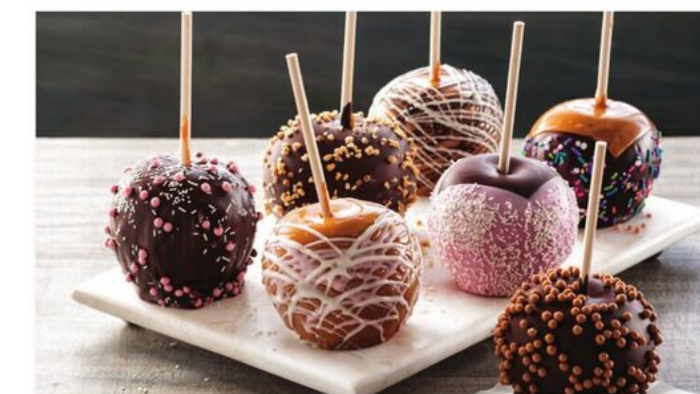
Hand-dipped Caramel Apples