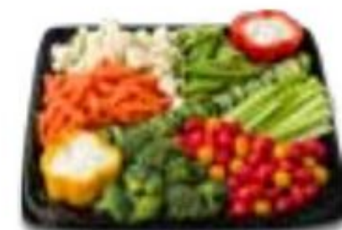
Vegetable & Dip Tray 16-inch serves 20-25 18-inch serves 25-30