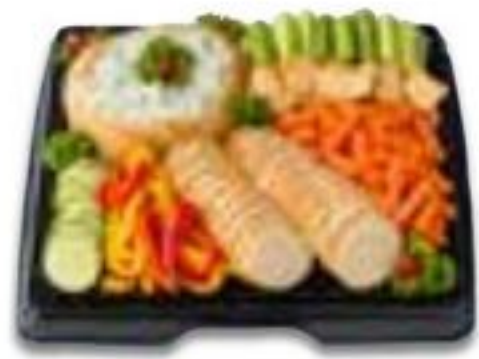
Big Dipper Tray 16-inch serves 15-20