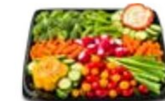
Vegetable & Hummus Tray 16-inch serves 20-25 18-inch serves 25-30