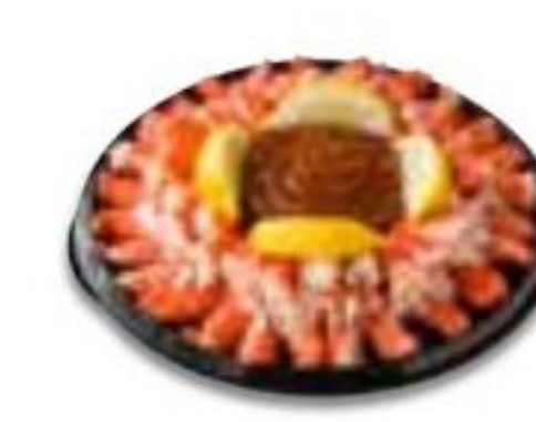
Alaskan Snow Leg Surimi Party Tray Serves 6-8