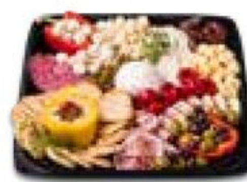
Mediterranean Tray 12-inch serves 15-20