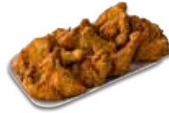
Fried Chicken Party Pack 50 Pieces, 100 Pieces 150 Pieces