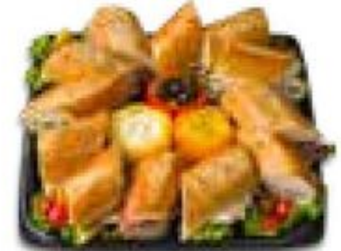
Hoagie Sandwich Tray 16-inch serves 12-14