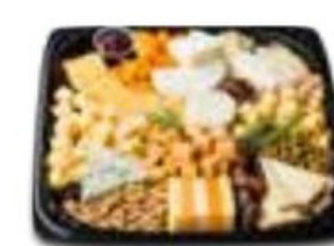
European Cheese Tray 12-inch serves 15-20