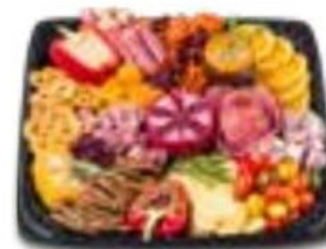
Harvest Tray 12-inch serves 15-20