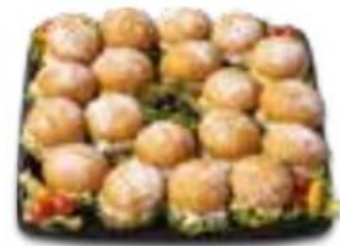
Salad Sandwich Tray 12-inch serves 10-12 16-inch serves 16-24