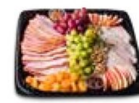
Carving Tray 16-inch serves 18-20