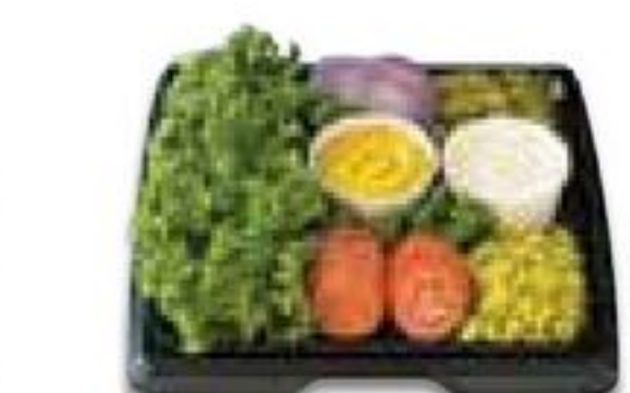
Condiment Tray 16-inch serves 12-16