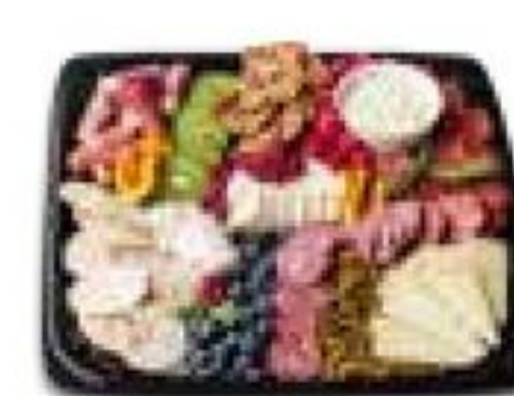
Elegant Charcuterie Tray 12-inch serves 15-20