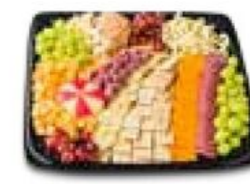
Classic Party Pack 16-inch serves 15-20