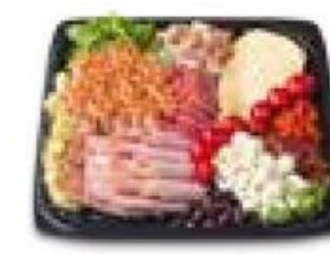
Italian Tray 16-inch serves 15-20