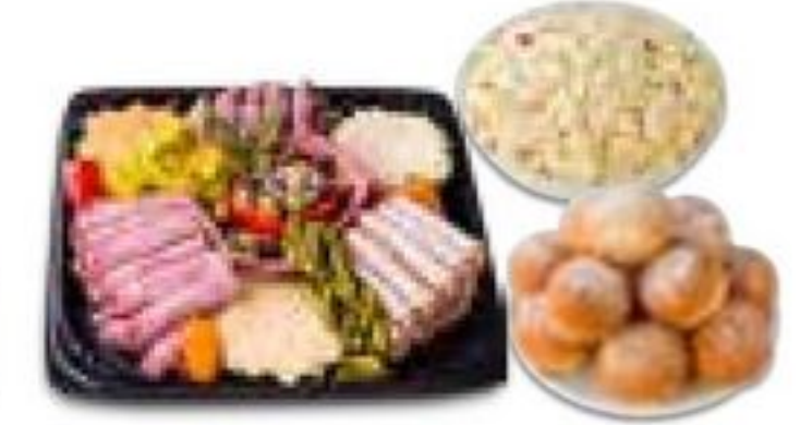
Deli Party Pack serves 20-24