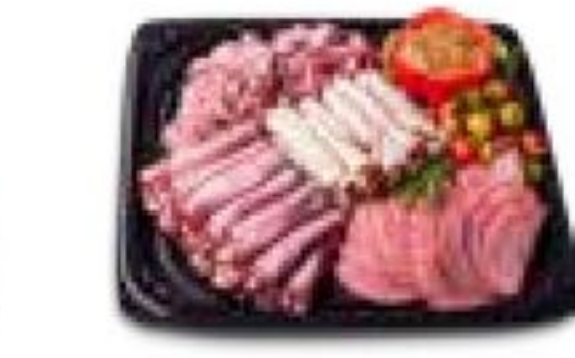
Meat Lover's Tray 12-inch serves 12-16 16-inch serves 20-25 18-inch serves 25-30