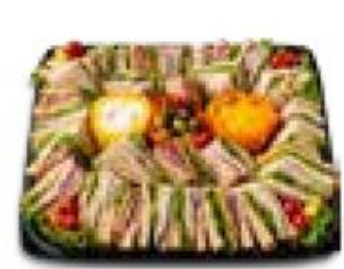
Finger Sandwich Tray 16-inch serves 12-16 18-inch serves 18-24