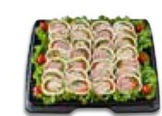
Pinwheel Tray 16-inch serves 12-16 18-inch serves 16-18