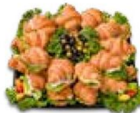
Mini Salad Croissant Tray 16-inch serves 12-16 18-inch serves 16-24