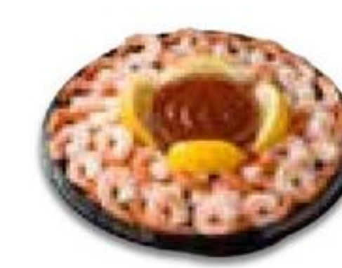
Admiral's Feast Party Tray Serves 6-8