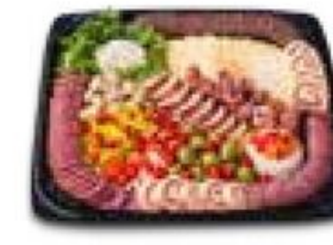
Italian Sampler 16-inch serves 15-20