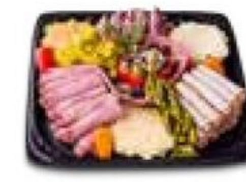
Classic Meat & Cheese Tray 12-inch serves 15-20 16-inch serves 20-30 18-inch serves 30-40