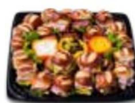
Pretzel Roll Slider Tray 16-inch serves 25-27 18-inch serves 40-45