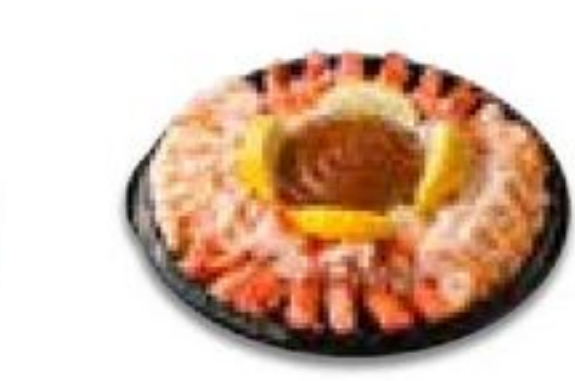
Kick'd Up Combo Party Tray Serves 4-6