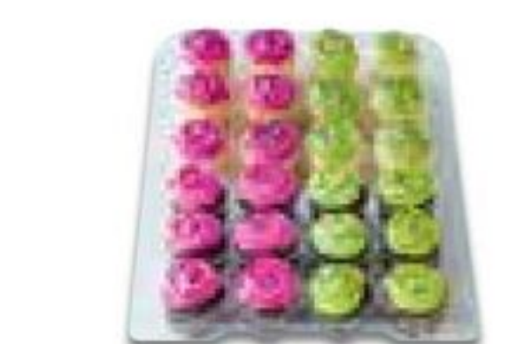
Cupcake Tray Serves 24