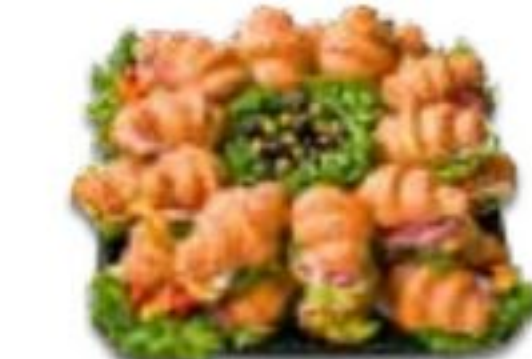
Mini Croissant Tray 16-inch serves 12-16 18-inch serves 16-24