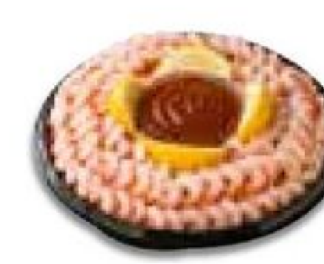
Bounty Shrimp Party Tray Serves 8-12