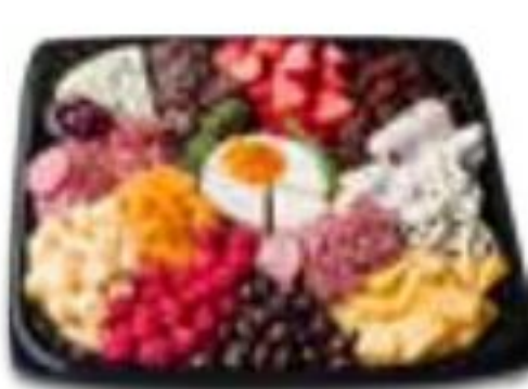
Sweet Treat Tray 12-inch serves 15-20