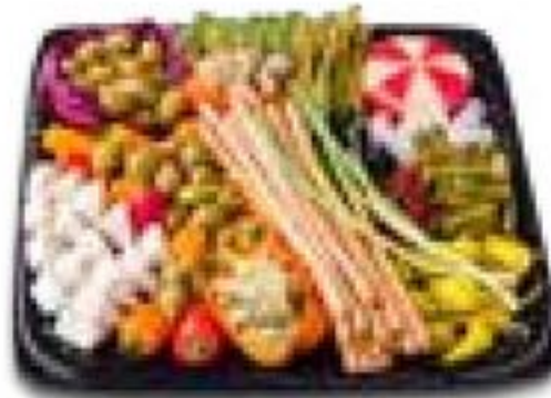
Cocktail Tray 12-inch serves 15-20