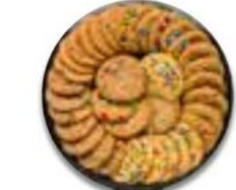
Cookie Platter Serves 36-50