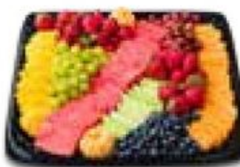
Fruit Tray 16-inch serves 20-25 18-inch serves 25-30