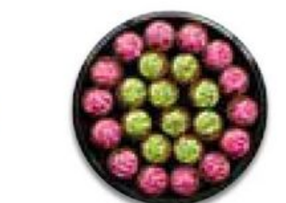
Brownie Bite Platter Serves 20-24