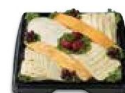
Sliced Cheese Tray 16-inch serves 20-25 18-inch serves 25-30