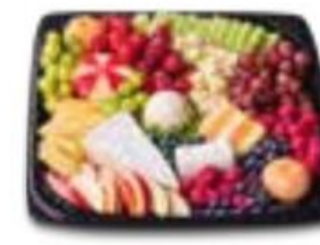
Fine Cheese & Fruit Tray 16-inch serves 15-20