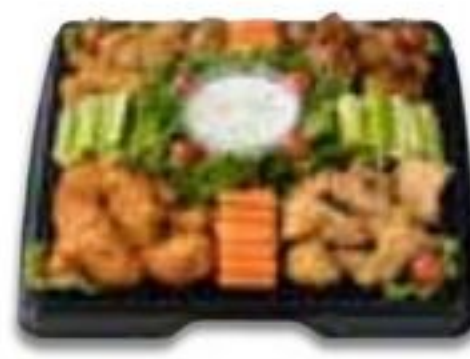
Wing Fling Tray 16-inch serves 12-16