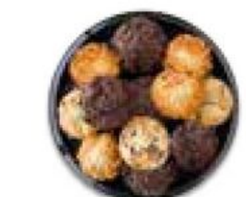
Muffin Platter Serves 12