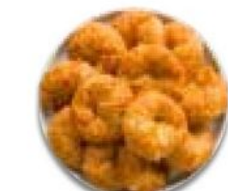
Croissant Platter Serves 12