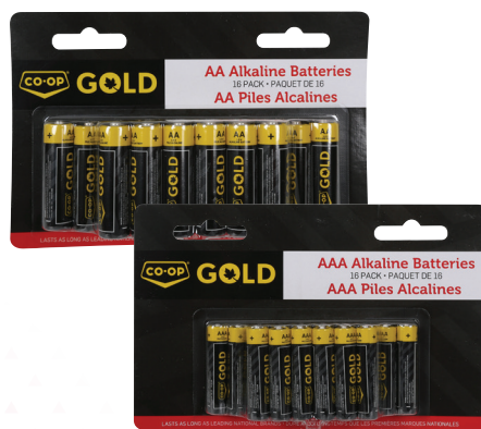
CO-OP GOLD ALKALINE BATTERIES Alkaline Battery AAA, 16-pk. (4710 158), Alkaline Battery AA, 16-pk. (4710 133), Alkaline Battery, C 4-pk. (4710 190), Alkaline Battery D, 4-pk. (4710 208) or Alkaline Battery 9-V, 2-pk. (4710 117)