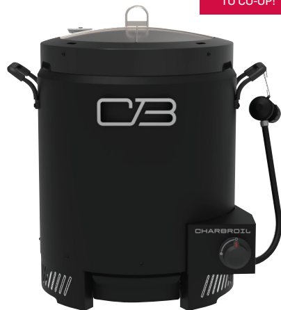
CHAR-BROIL OUTDOOR AIR FRYER (4879 474)