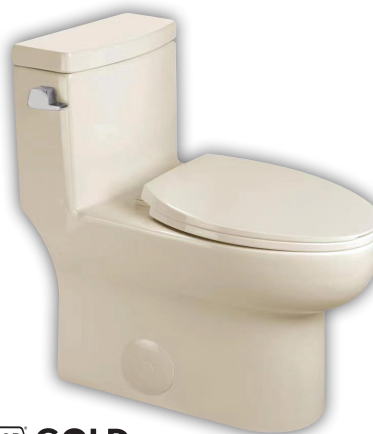
CO-OP GOLD SAPHIA TOILET One piece toilet with hidden trapway. Elongated bowl with 16-1/2" height. 4.8 L. Bone (5262 191)