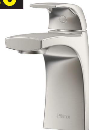
PFISTER KARCI LAVATORY FAUCET Spot-resistant finish. No need for putty or silicone. No tools installation. Nickel (5259 791) Matte Black (5259 783)..... 119 97