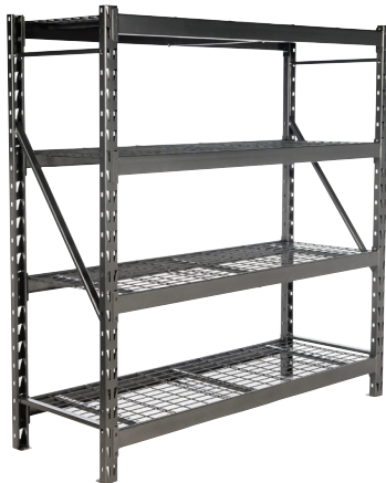
CO-OP GOLD METAL SHELVING UNIT, 4-TIER Wire shelves with rigid steel braces. Weight capacity: 1200 lb. per shelf. Hammer tone finish. (4492 302)