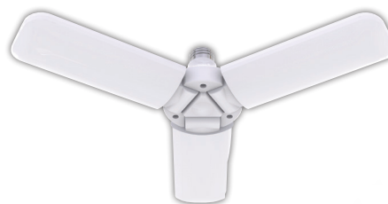
LED GARAGE LIGHT, 3000 LUMEN Ultra Performance with three 90 degree panels. 120-v, 60-Hz, 25-w (5186 002)