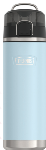
THERMOS ICON WATER BOTTLE GLACIER, 24-OZ. Non-slip. Durable finish. Not for use with hot liquids. Top rack dishwasher safe. Glacier (4709 853) or Granite (4709 861) Food jar with spoon, 16-oz. .... 22 47 Glacier (4709 879) or Granite (4709 887)..... 28 97 Beverage Bottle, 40-oz. (4709 846) .....