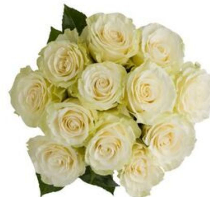
Overjoyed Boutique ™ White Rose