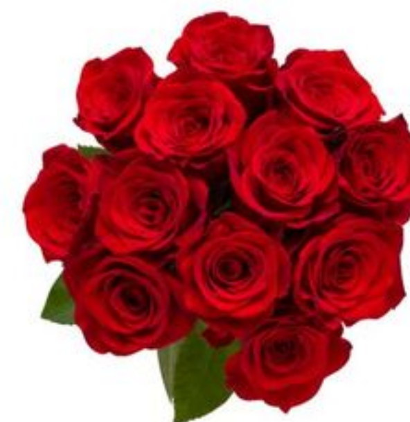
Overjoyed Boutique ™ Red Rose