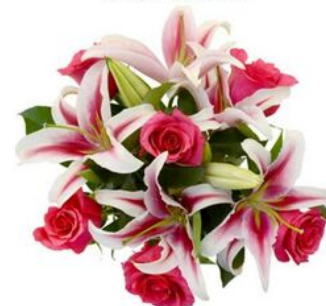
Overjoyed Boutique ™ Fragrant Rose Bouquet