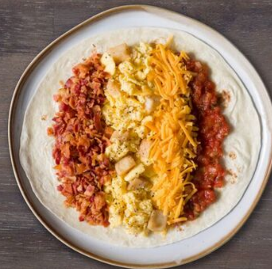
Oven roasted bacon