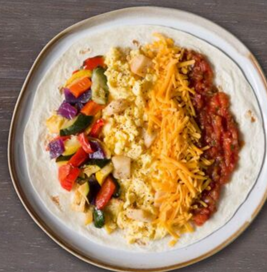
Grilled mixed vegetables