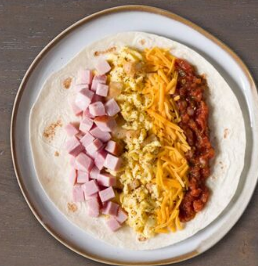
Applewood smoked ham