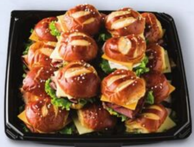
Pretzel Slider Tray serves 4-6