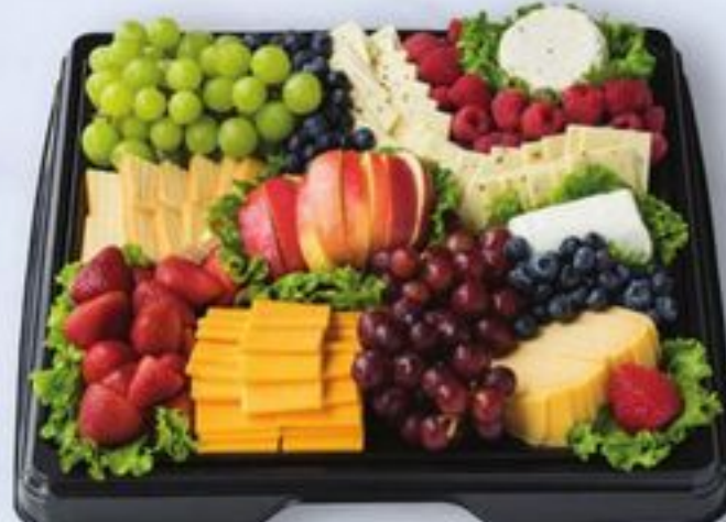
Fruit & Cheese Tray