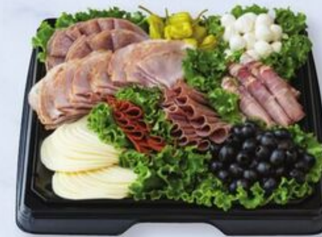
Italian Meat & Cheese Tray