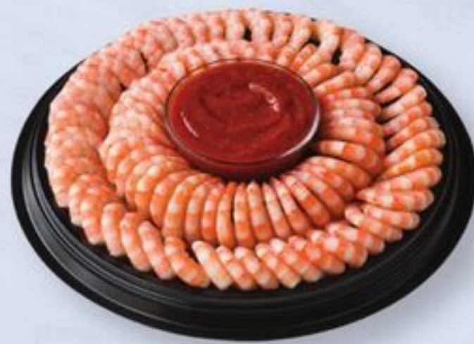
Waterfront Bistro Double Shrimp Ring 32 oz. serves 12-14