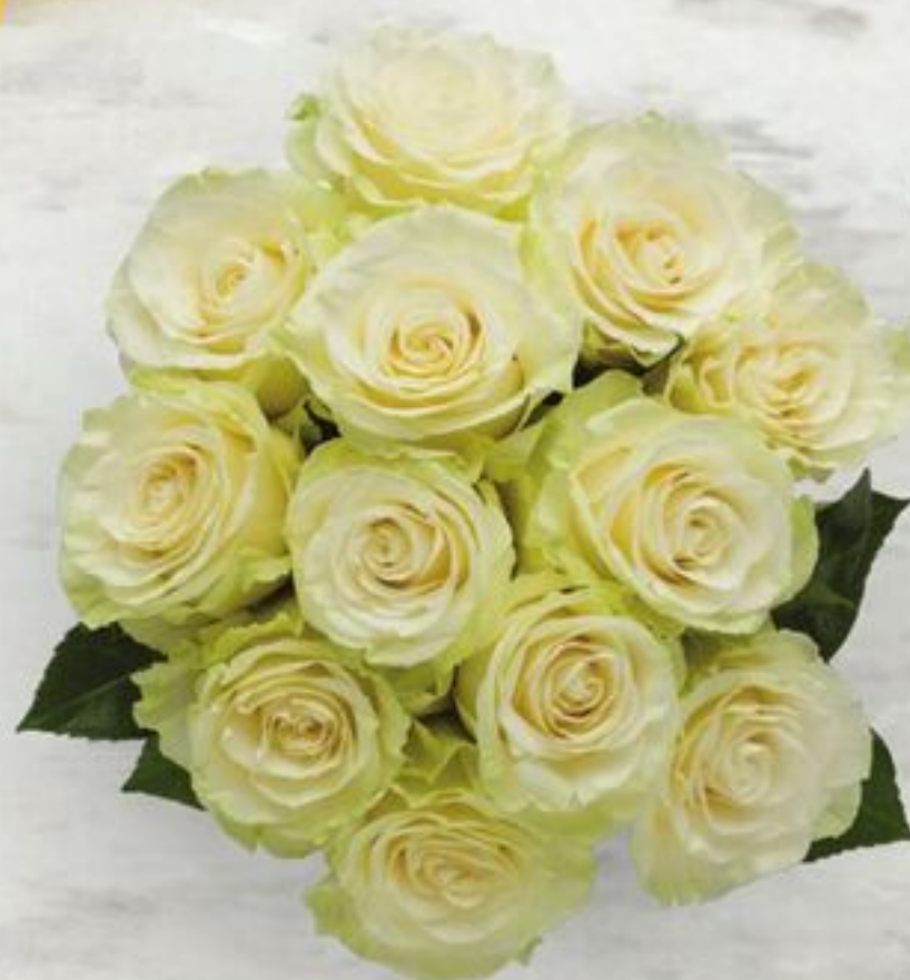
Overjoyed Boutique™ White Rose