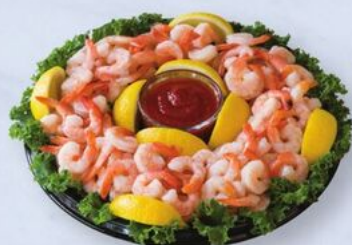
Cooked Shrimp Tray 12" serves 12-14