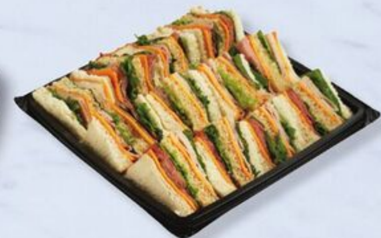
Mini Club Sandwich serves 4-6