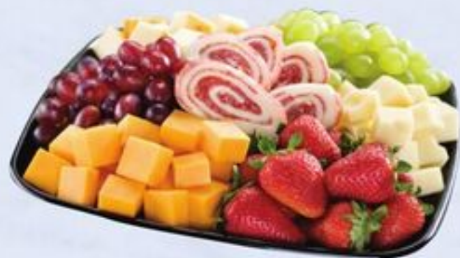
Fruit & Cheese serves 6-8