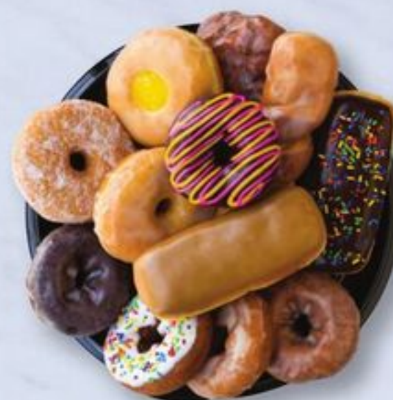
Donut Platter serves 12