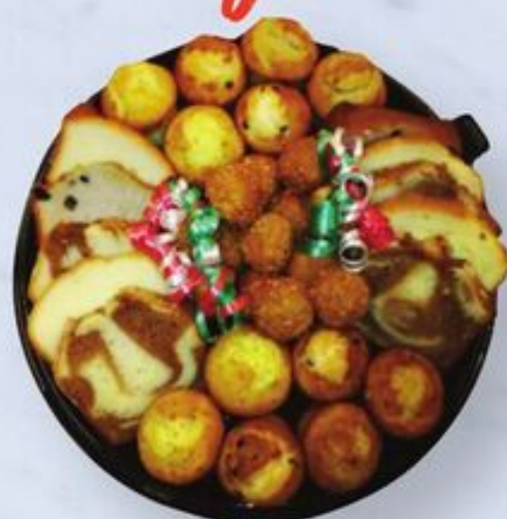
Breakfast Platter serves 12