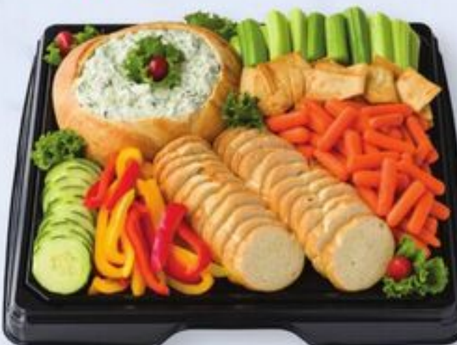
Big Dipper Tray