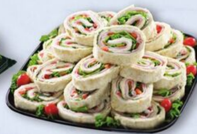
Hye Roller serves 4-6