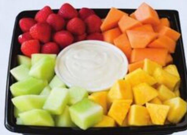
Fruit Tray serves 6-8