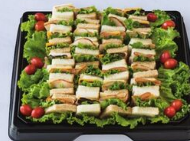
Finger Sandwich Tray 16" serves 12-16