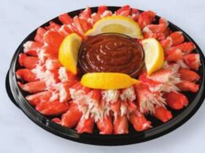
Alaskan Snow Crab Party Tray 32 oz. serves 8-12