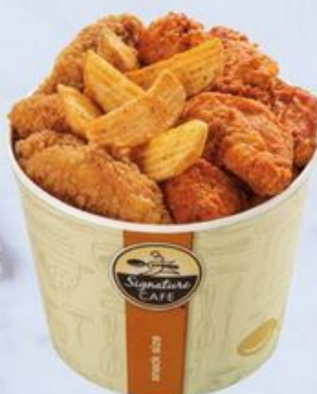
Party Bucket serves 4-6