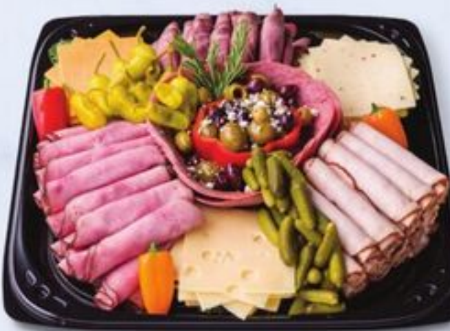
Meat & Cheese Tray