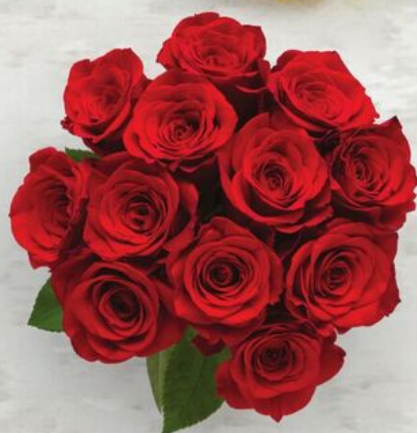
Overjoyed Boutique™ Red Rose