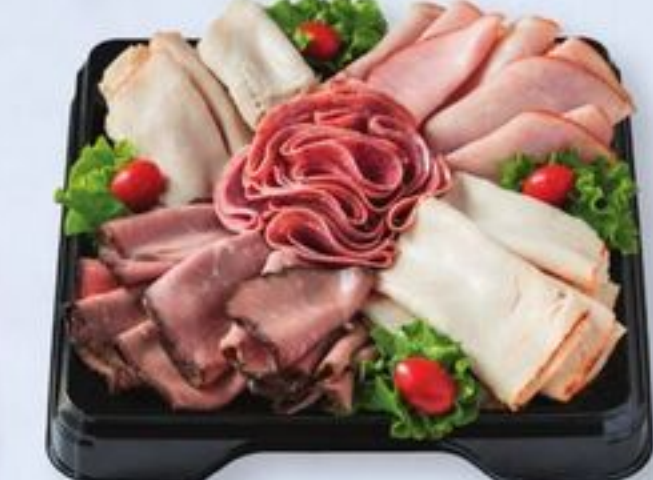
Meat Lover's Tray