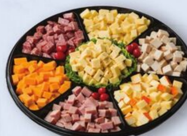
Meat & Cheese Nibbler