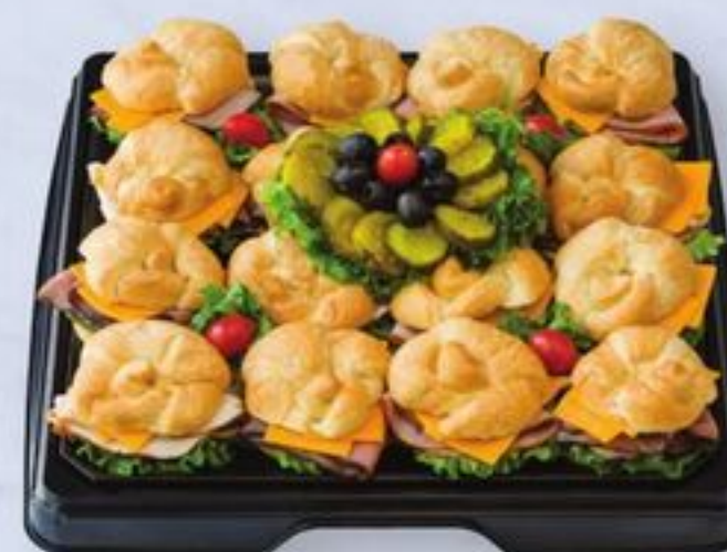
Croissant Sandwich Tray 16" serves 8-12 18" serves 12-16