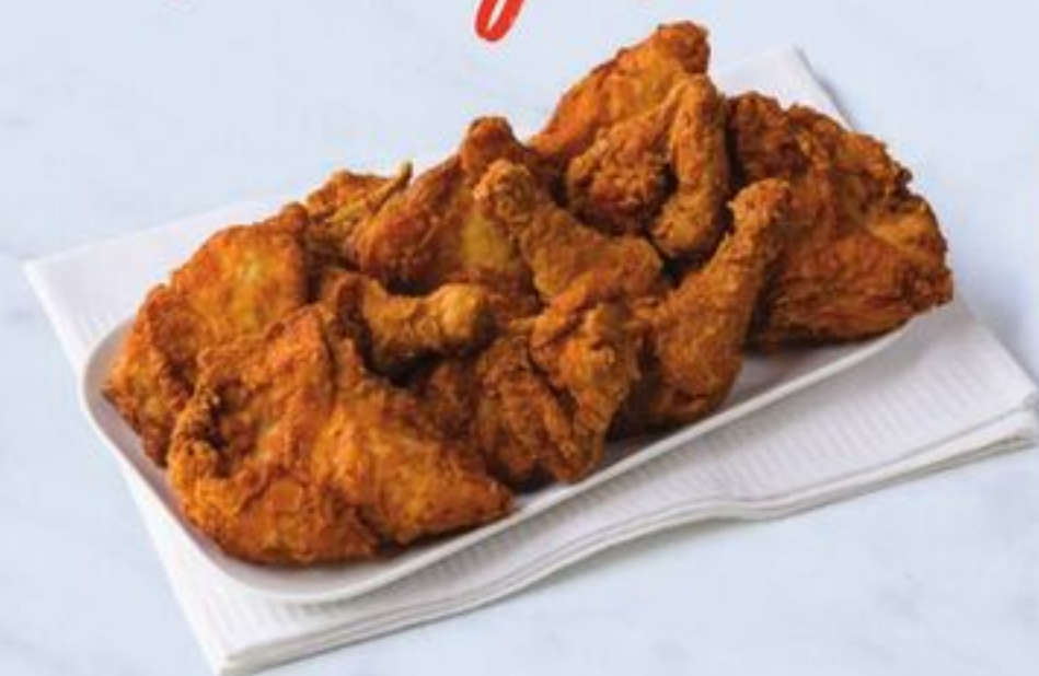
Fried Chicken Party Pack 50pc. - 500pc.