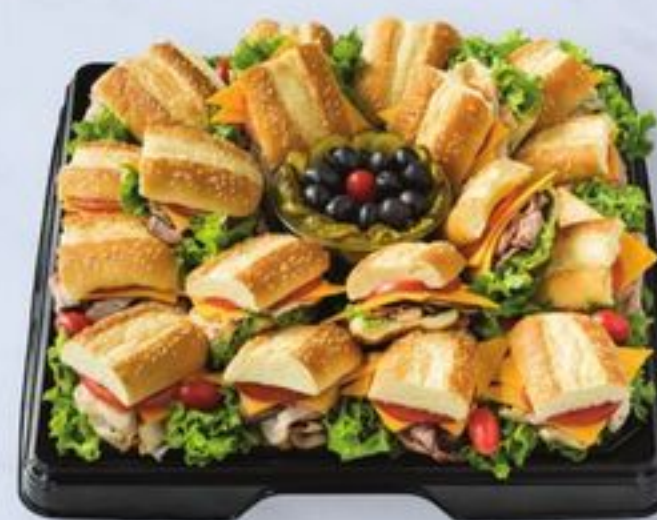
Hoagie Sandwich Tray 16" serves 10-14