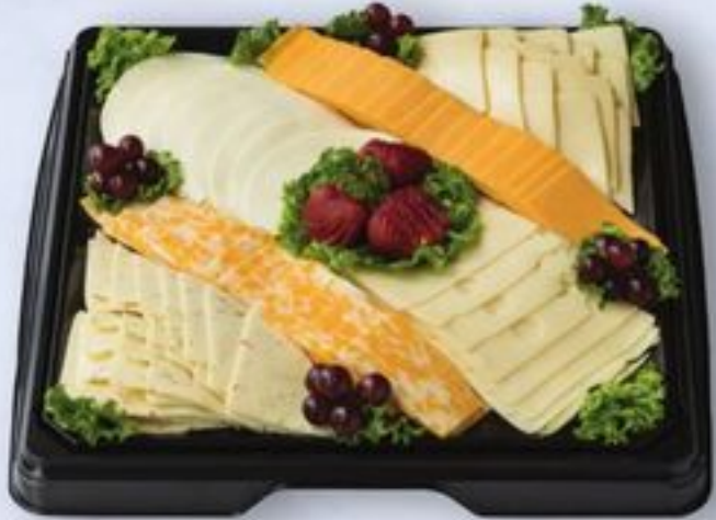
Sliced Cheese Tray