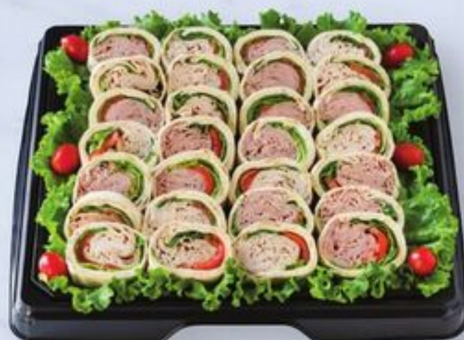
Pinwheel Sandwich Tray 12" serves 8-12 16" serves 12-16