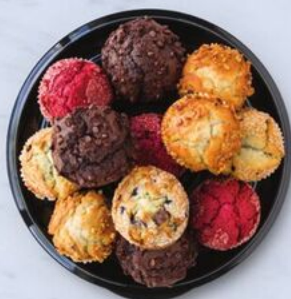
Muffin Platter serves 9