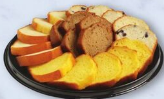
Sliced Sweet Loaf Tray serves 20