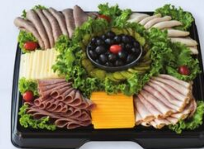
16" Ecomm Meat & Cheese Tray