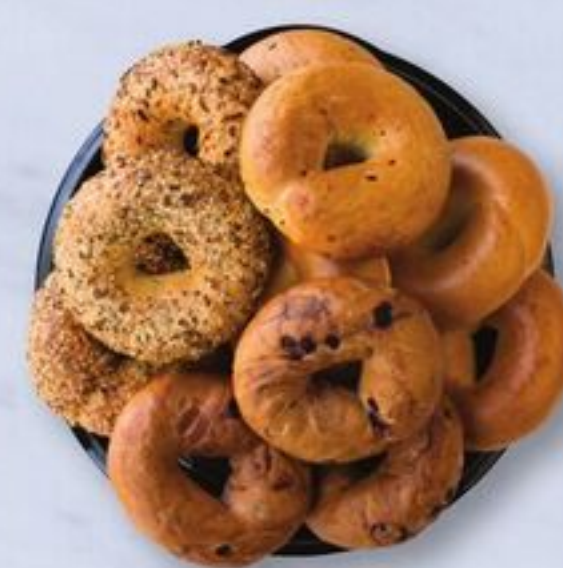
Bagel Platter serves 12