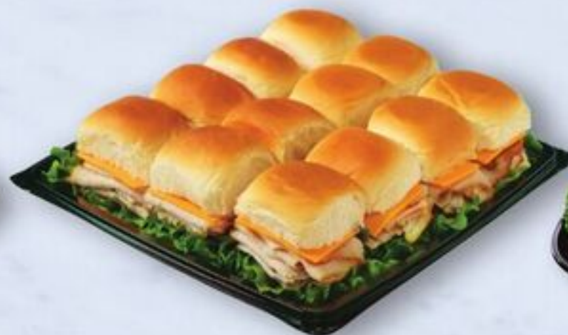
Sliders serves 4-6