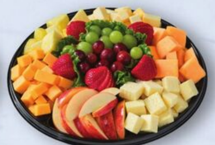
Fruit & Cheese Nibbler