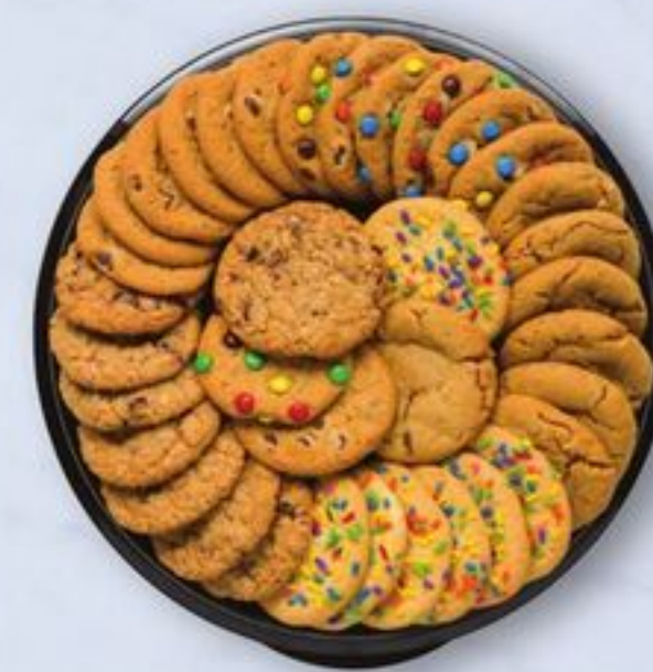
Cookie Platter serves 36