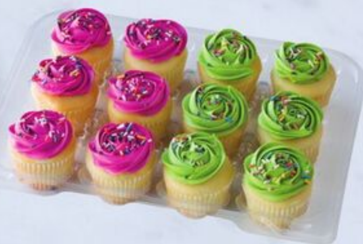
Cupcakes servings vary