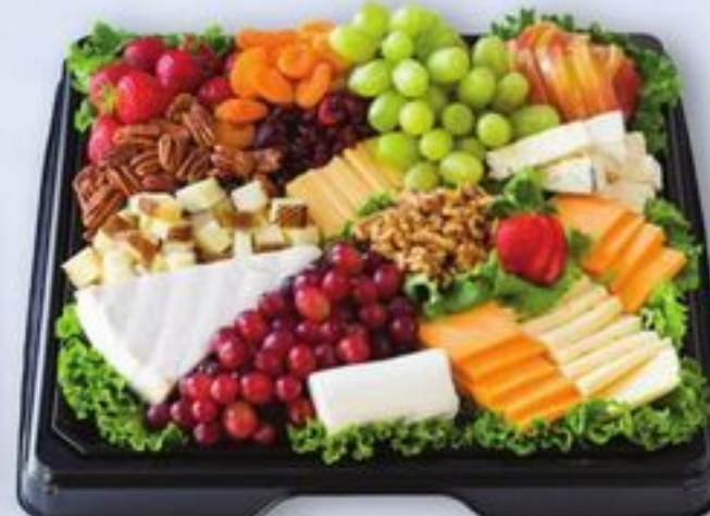
Gourmet Cheese Tray