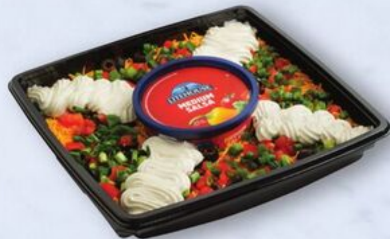
Bean Dip Tray serves 6-8