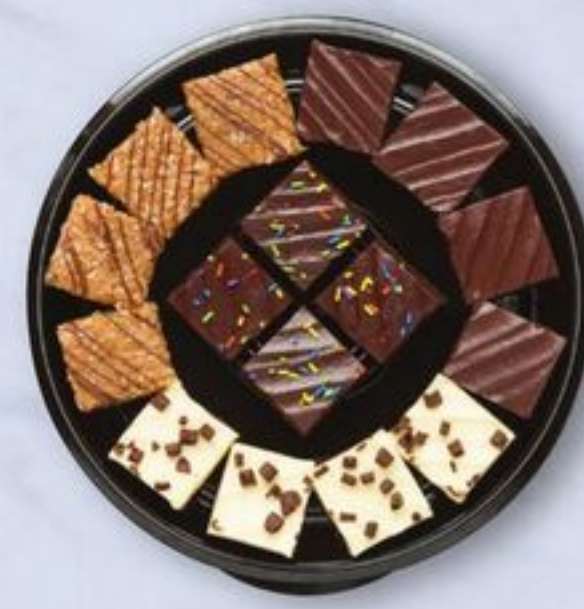
Brownie Platter serves 16