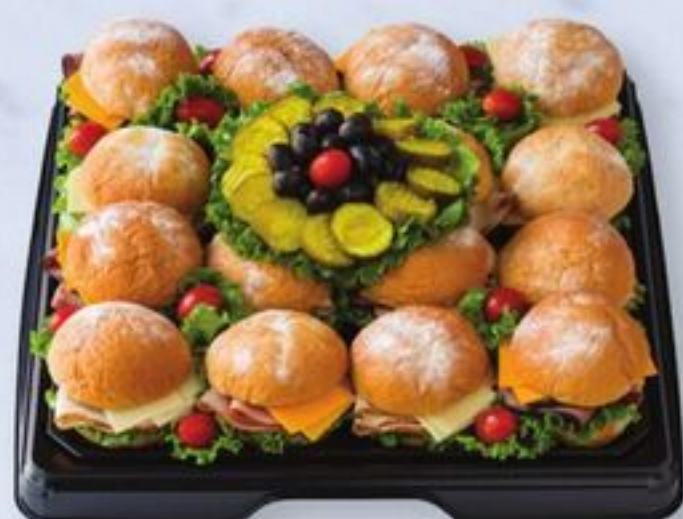
Party Roll Sandwich Tray 16" serves 8-12 18" serves 12-16