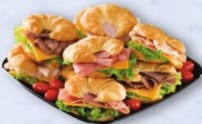
Croissant Sandwiches serves 4-6