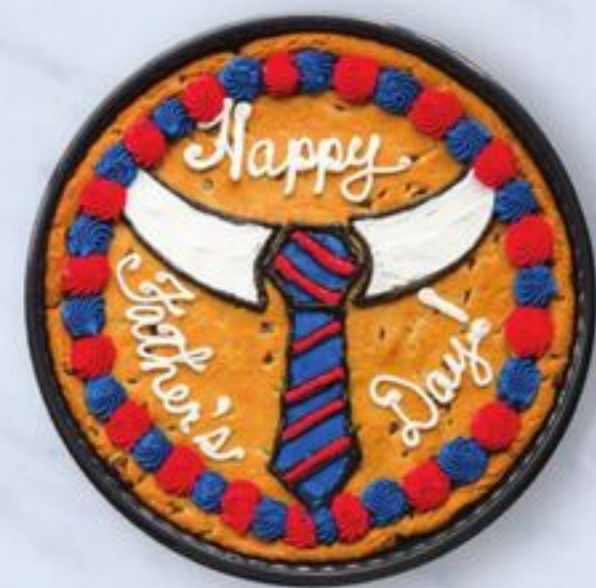
Message Cookies serves 8-12