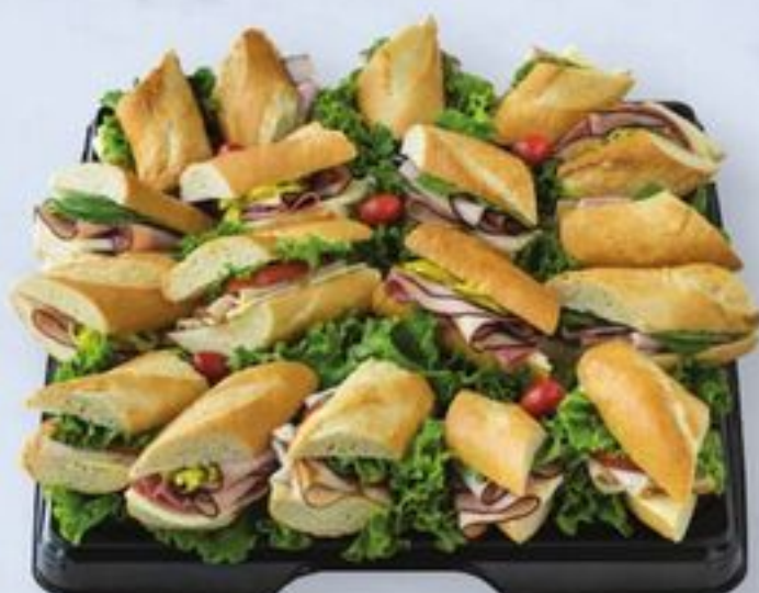
Baguette Sandwich Tray 16" serves 10-14