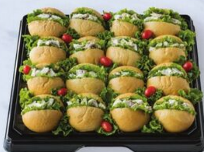
Club Salad Sandwich Tray 18" serves 8-12