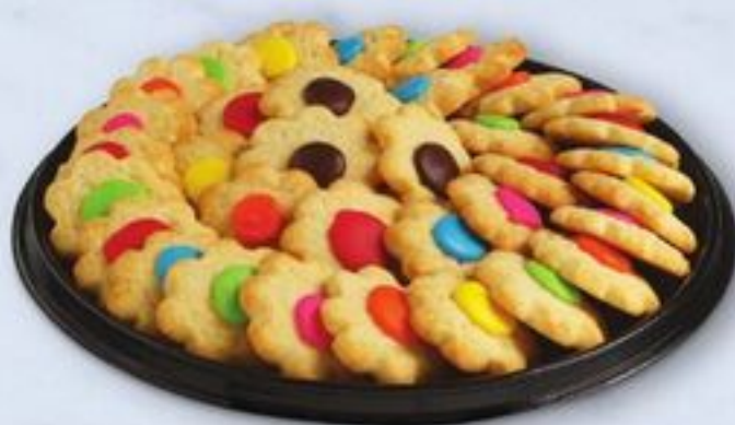
Butter Cookies serves 36