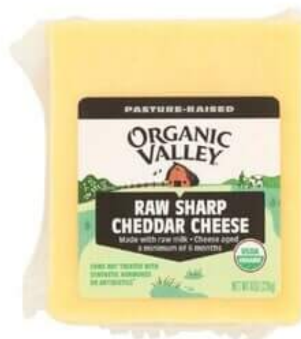
Organic Valley Organic Cheese selected varieties

They're made from organic pasture-raised milk, with no antibiotics or GMOs. So, whatever the occasion, our cheeses are always here to make a delicious impression.