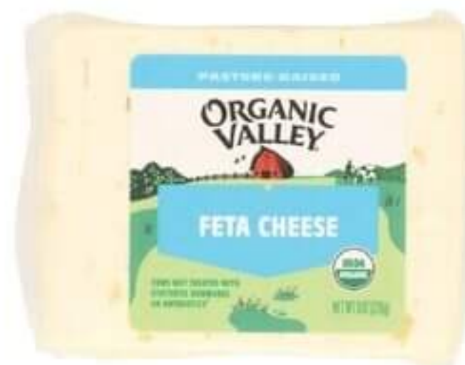
Organic Valley Organic Feta Cheese