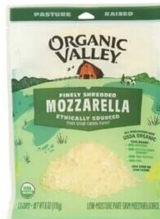
Organic Valley Organic Shredded Cheese selected varieties