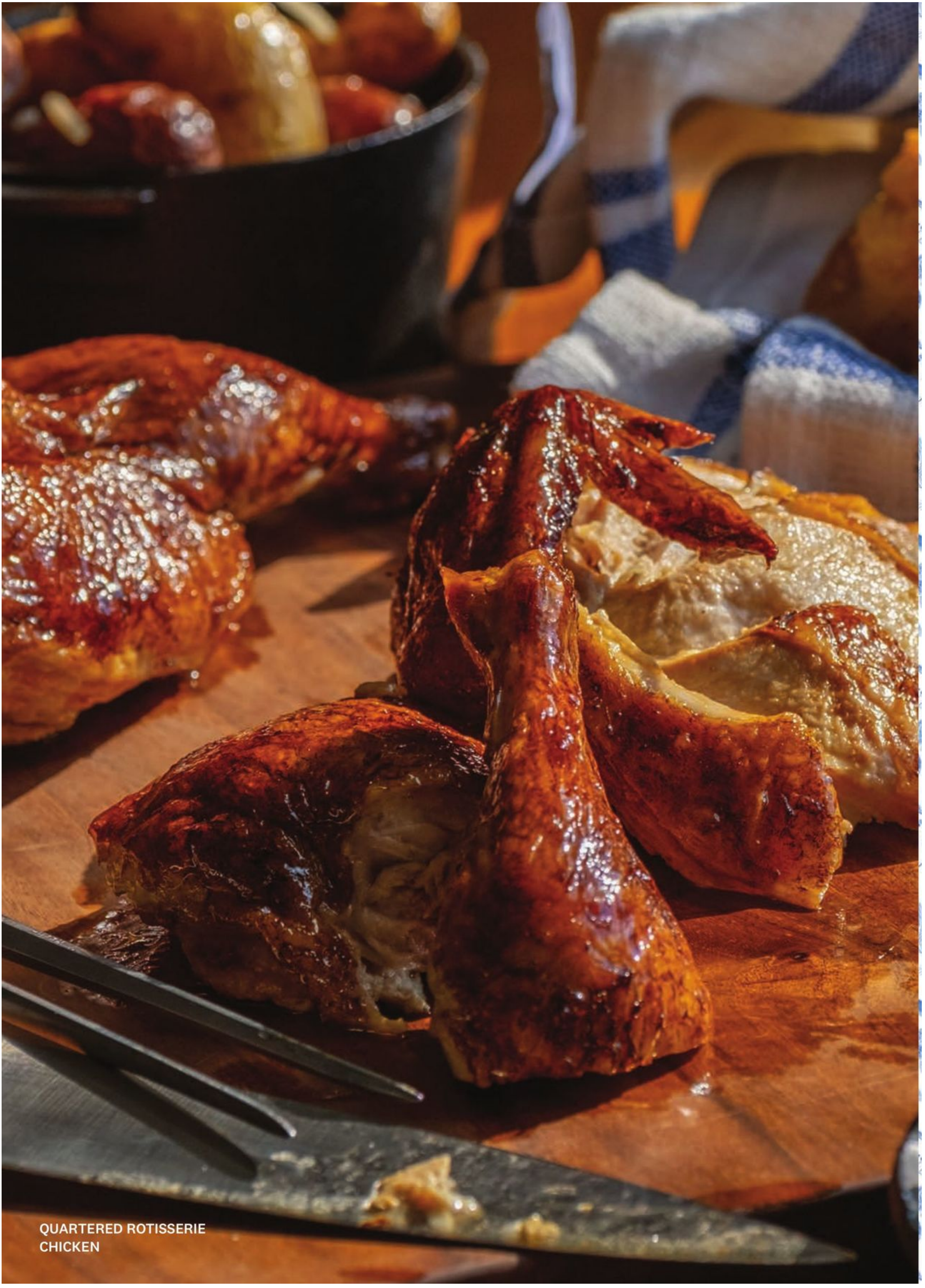
QUARTERED ROTISSERIE CHICKEN