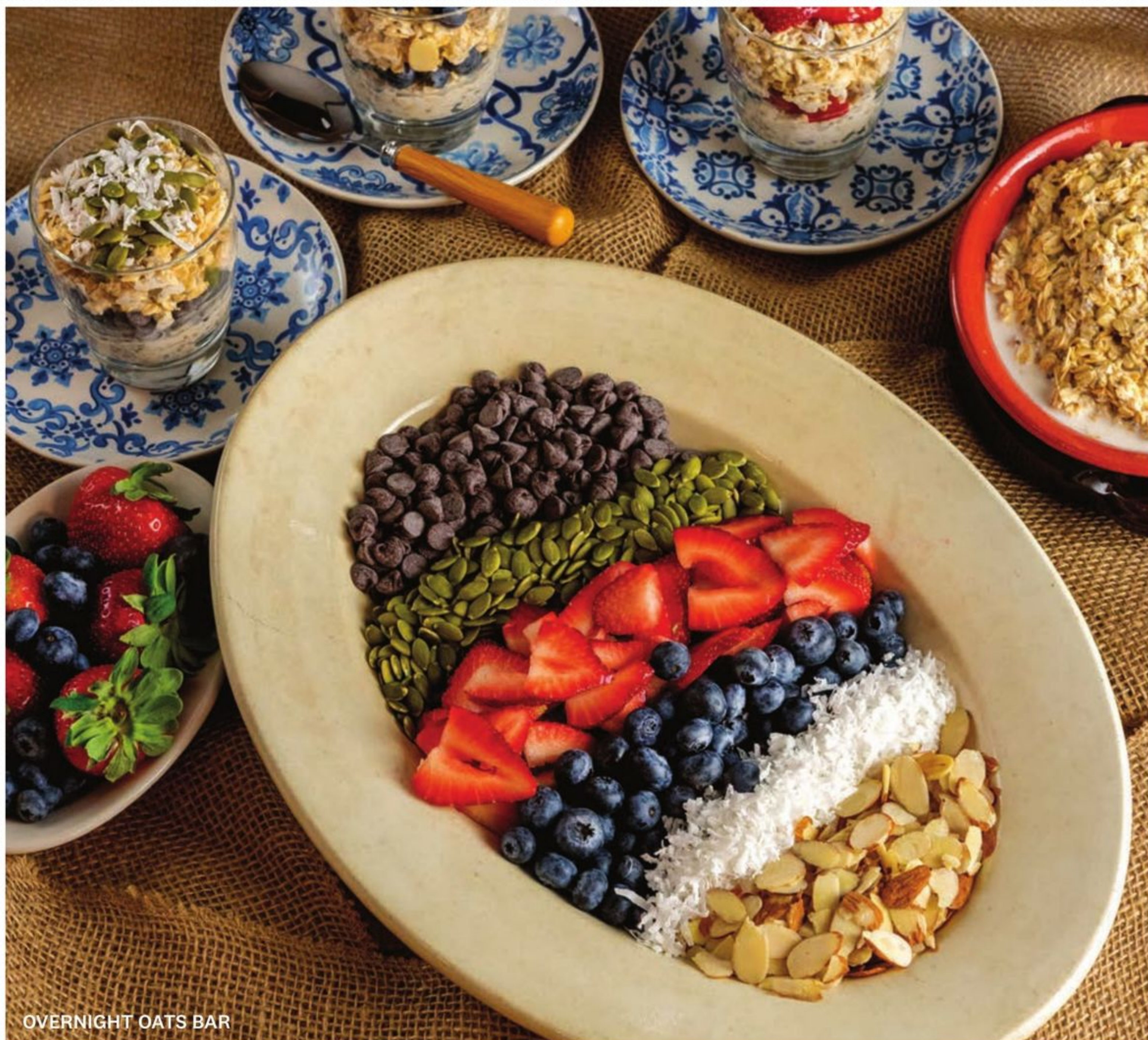
OVERNIGHT OATS BAR