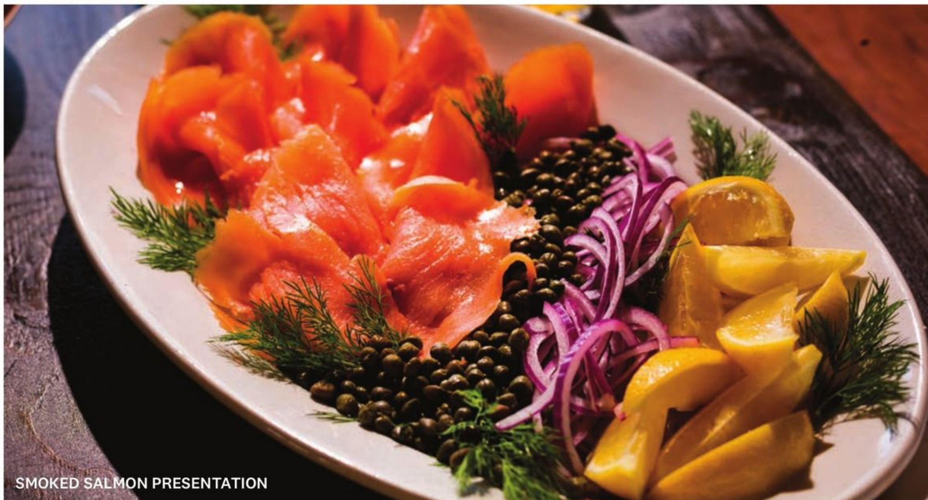
SMOKED SALMON PRESENTATION