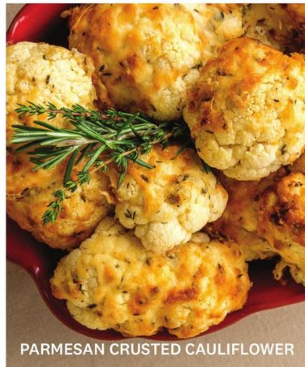
PARMESAN CRUSTED CAULIFLOWER