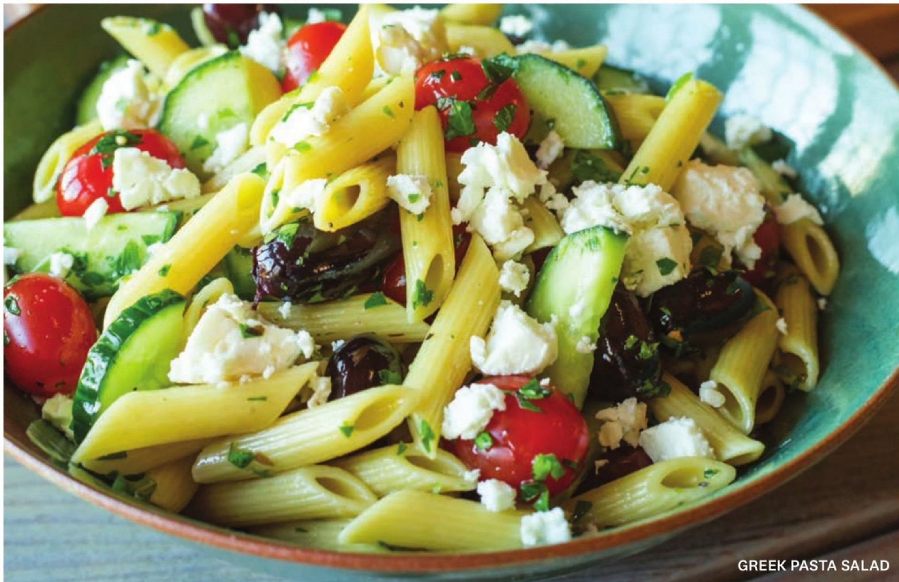
GREEK PASTA SALAD