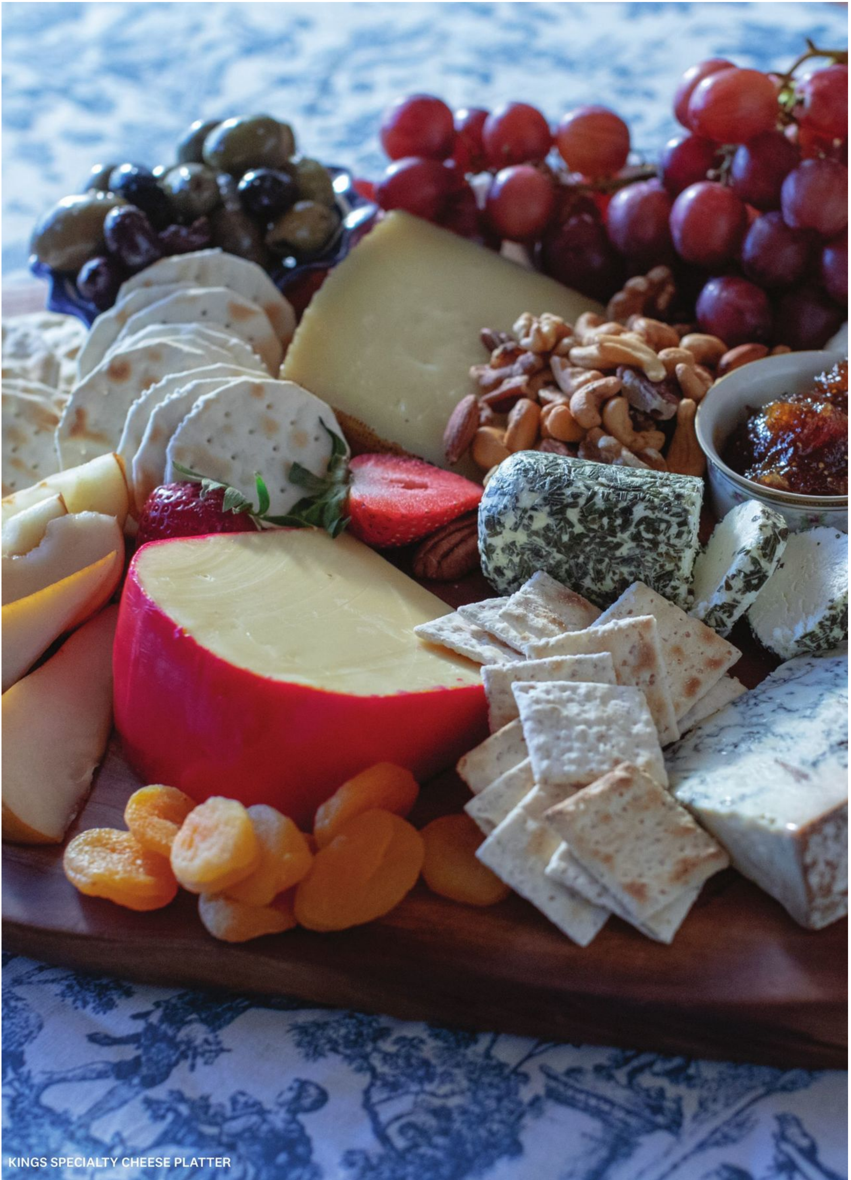
KINGS SPECIALTY CHEESE PLATTER