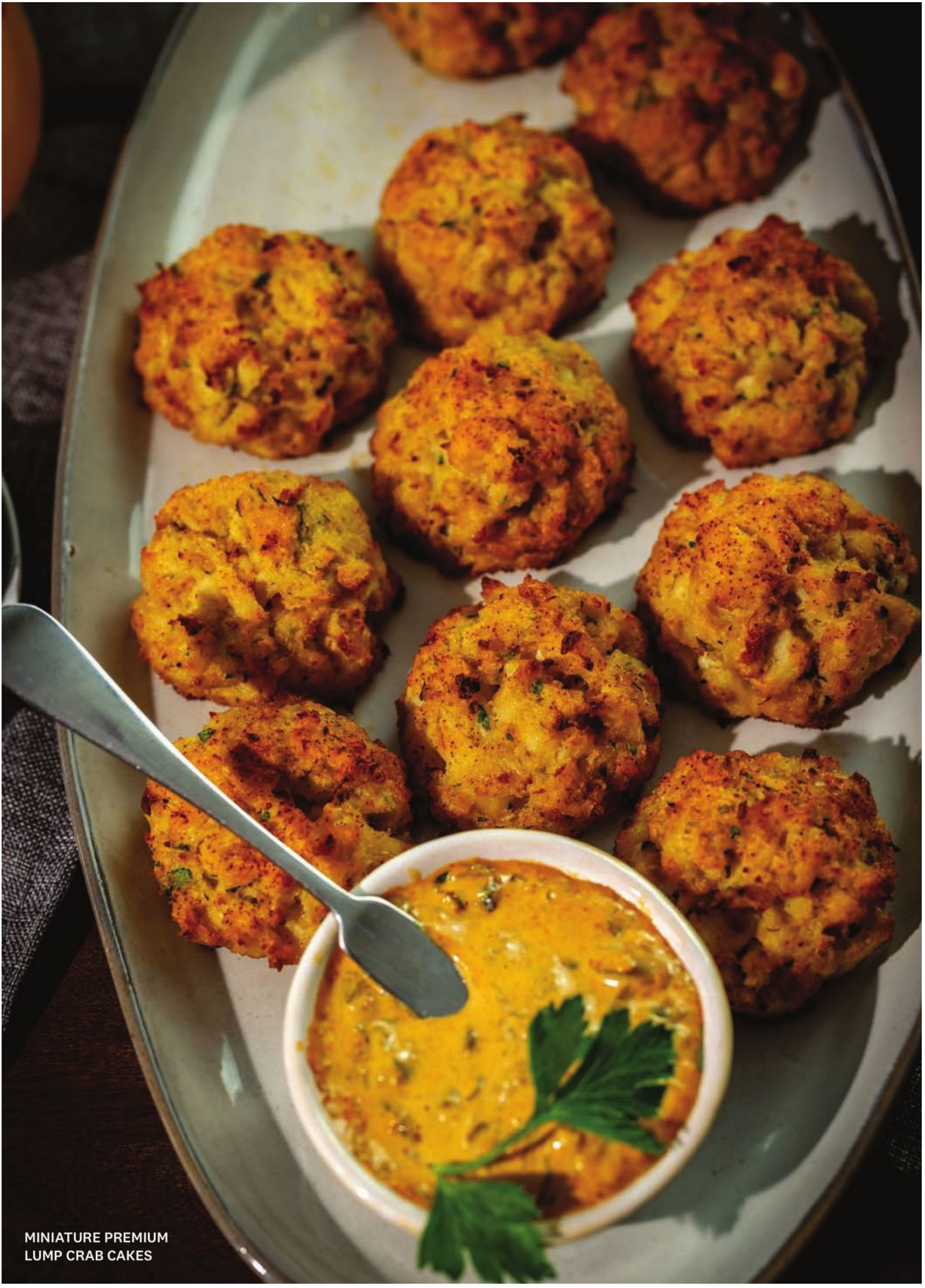
MINIATURE PREMIUM LUMP CRAB CAKES