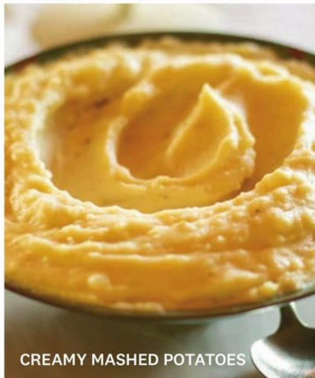
CREAMY MASHED POTATOES