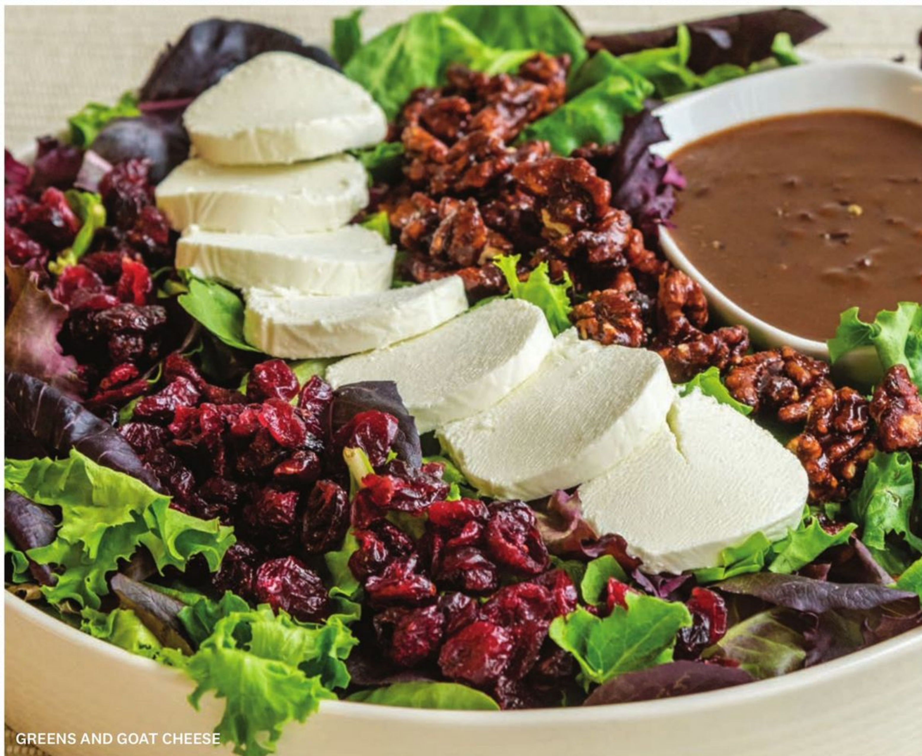
GREENS AND GOAT CHEESE