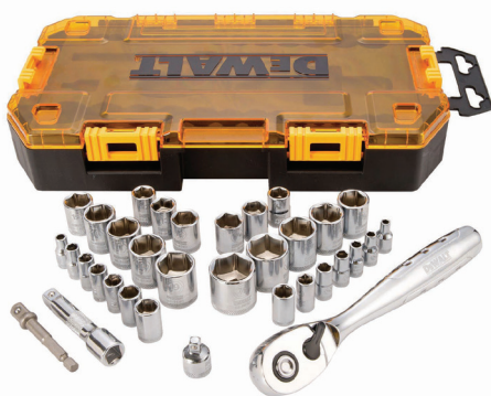
DEWALT 34-PIECE TOUGH BOX SOCKET SET SAE/metric. Sizes from 1/4" to 3/8". Includes lockable stacking case with transparent lid. (4180 899)