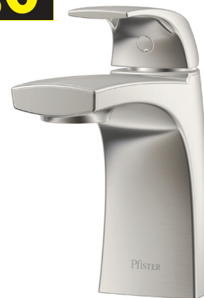
PFISTER KARCI LAVATORY FAUCET Spot-resistant finish. No need for putty or silicone. No tools installation. Nickel (5259 791) Matte Black (5259 783)..... 119 97