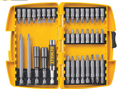
DEWALT INSERT BIT SET, 37-PC. Includes nut drivers and assorted bits. (4157 624)