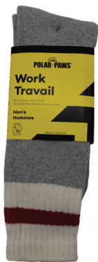
POLAR PAWS WORK SOCKS Boot length. Ravel-free top. Sizes 9 - 12. (4721 551)