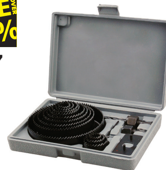
STEELCORE HOLE SAW SET, 16-PC. Includes steel cutting cups, mandrel, drill bit with mandrel, drive plate and hex wrench. (4103 511)