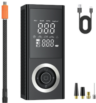
ULTRA PERFORMANCE PORTABLE LI-ION AIR PUMP POWER BANK 7.4-V. 100-W. 19-mm cylinder diameter. 150 psi. (5046 859)