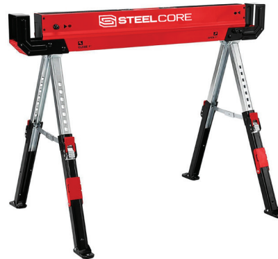
STEELCORE ADJUSTABLE FOLDING STEEL SAWHORSE Supports up to 1300 lb. Nine height adjustments from 24-1/4" to 32". Powder coated and zinc plated surfaces. (4103 727)