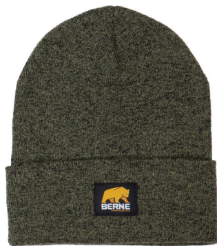
BERNE KNIT CUFF TOQUE 100% acrylic rib knit. One size fits most. Cedar (4086 567), Black (4086 575), Brown (4086 583) or Blue (4086 591)