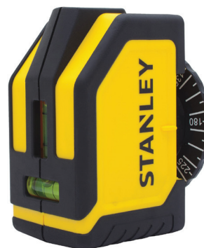
STANLEY WALL LASER LEVEL MANUAL, 10-FT. Bubble vials allows visual levelling. Laser offers a 360 degree rotating wall attachment and can measure up to 10' away. (4183 281)