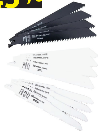
STEELCORE RECIPROCATING SAW BLADE, 12-PC. Includes 4-6"x 6, 4-6"x 14 and 4-6"x 5-8 blades (4103 362)