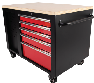
HOMEBASE® ROLLING TOOL CHEST, 45-IN. 4102 570)