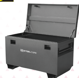
STEELCORE JOBSITE TOOLBOX, 45 X 24 X 27-1/2IN. Steel construction with rust-resistant powder-coat finish and with gas lid strut. Forklift channels for easy maneuverability. (4103 354)