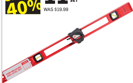
HOMEBASE® LEVEL AND TAPE MEASURE SET, 3-PC. Includes 25' tape measure, 9" torpedo level and 48" level. (4190 344)