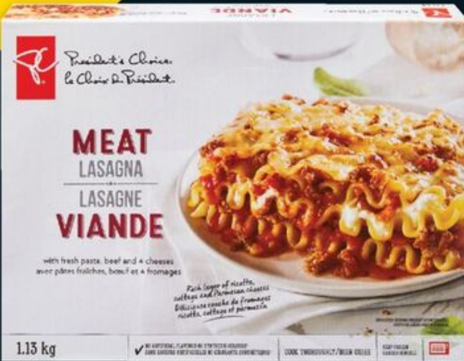
PC® DINNER ENTRÉES selected varieties, frozen 907 g-1.13 kg plats cuisinés 20326534 EA

APP EXCLUSIVE OFFER* Optimum EARN 2,000 pts = $2 Back in points