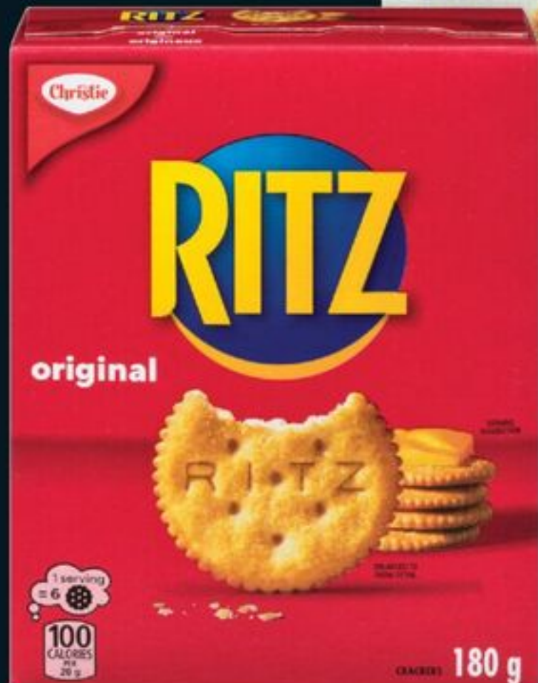
CHRISTIE CRACKERS selected varieties 180-200 g craquelins 21030647 EA/21547034 EA