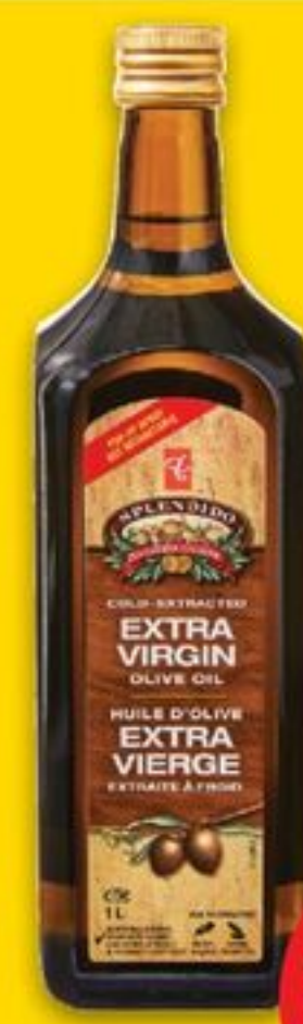
PC® SPLENDIDO® OLIVE OIL 1 L huile d'olive