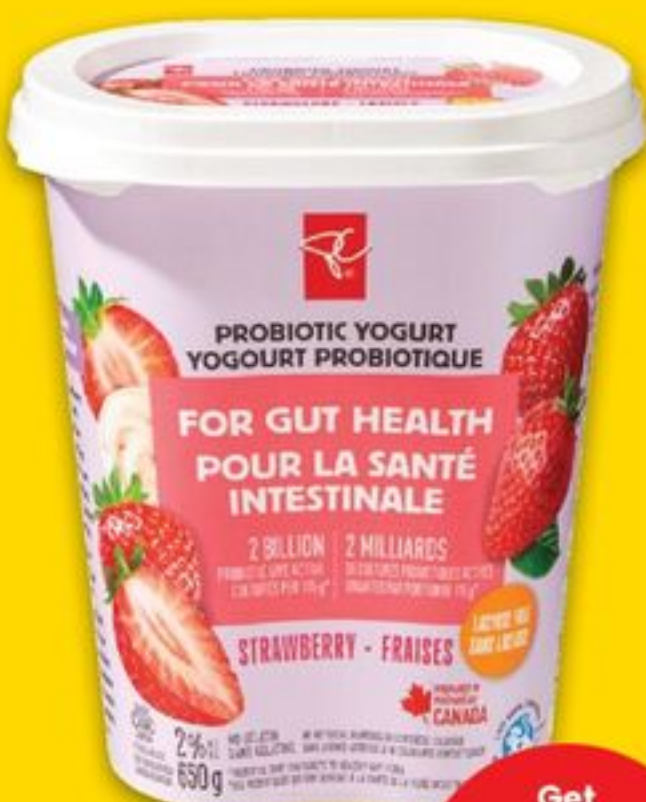
PC® PROBIOTIC YOGURT 650 g yogourt aux probiotiques