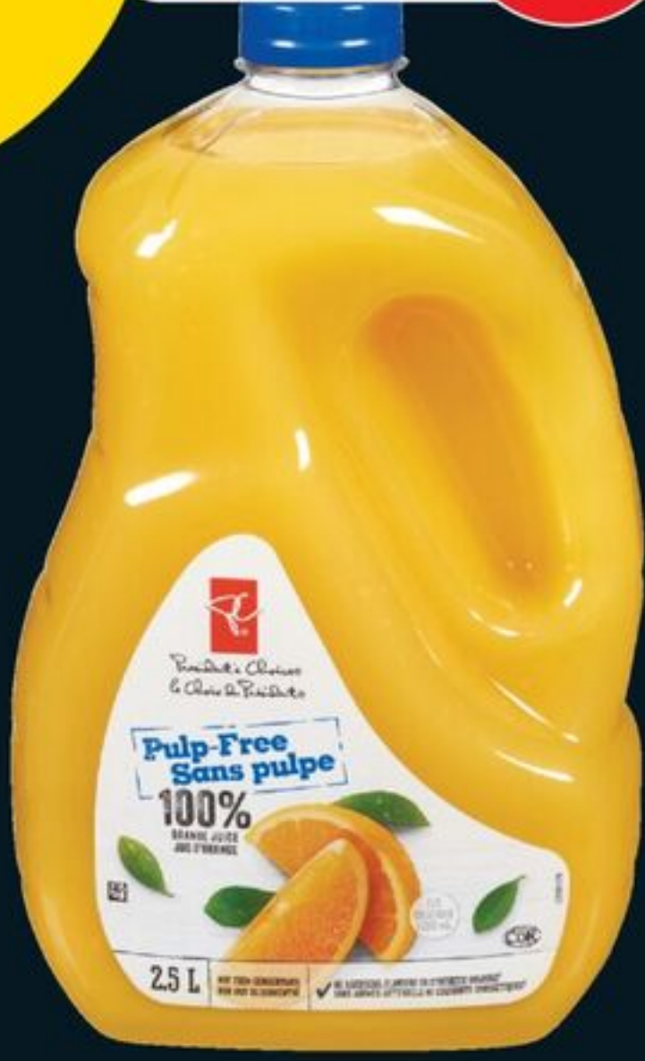
PC® ORANGE JUICE selected varieties, refrigerated 2.5 L jus d'orange 21531644 EA

APP EXCLUSIVE OFFER* Optimum EARN 1,000 pts = $1 Back in points