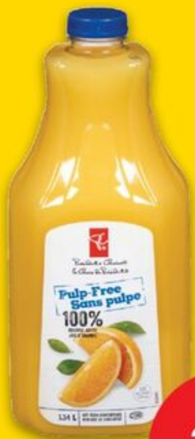
PC® ORANGE JUICE 1.54 L jus d'orange