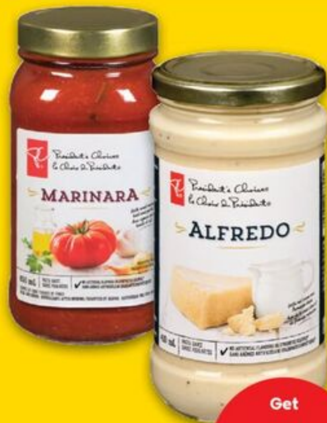
PC® PASTA SAUCE 410/650 mL sauce pour pâtes