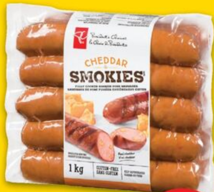
PC® SMOKIES 1 kg saucisses fumées