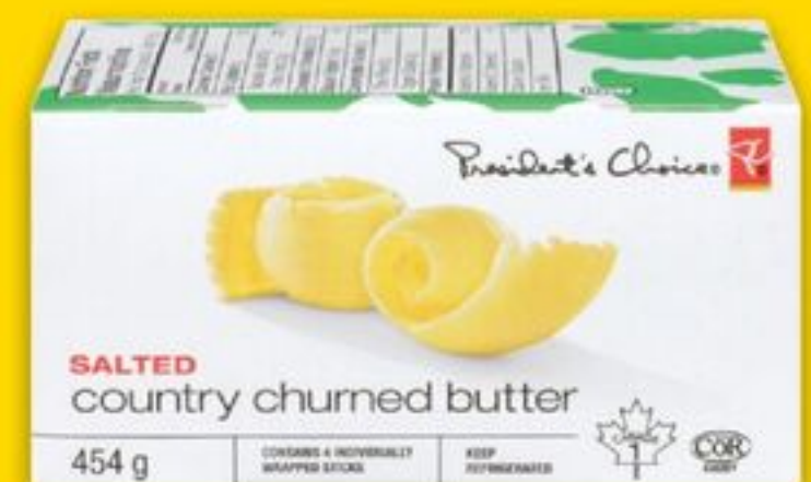
PC® BUTTER QUARTERS 454 g bâtonnets de beurre