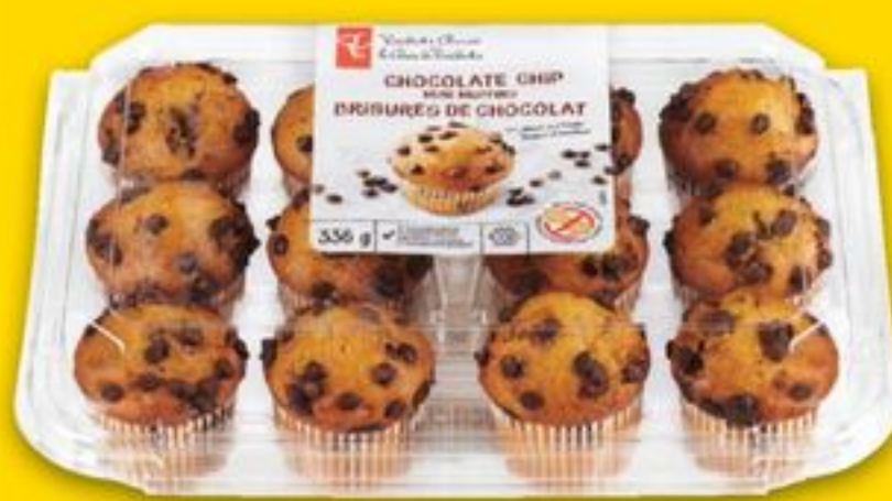
PC® MINI MUFFINS 336 g mini-muffins