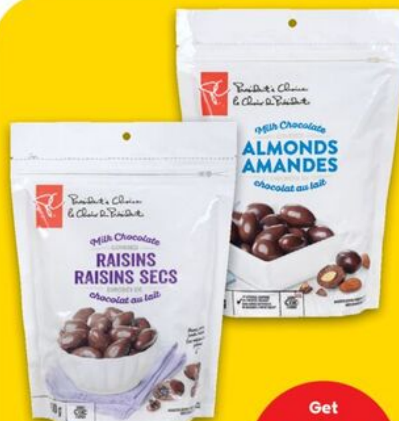
PC® CHOCOLATE COVERED NUTS 340-400 g noix enrobées de chocolat