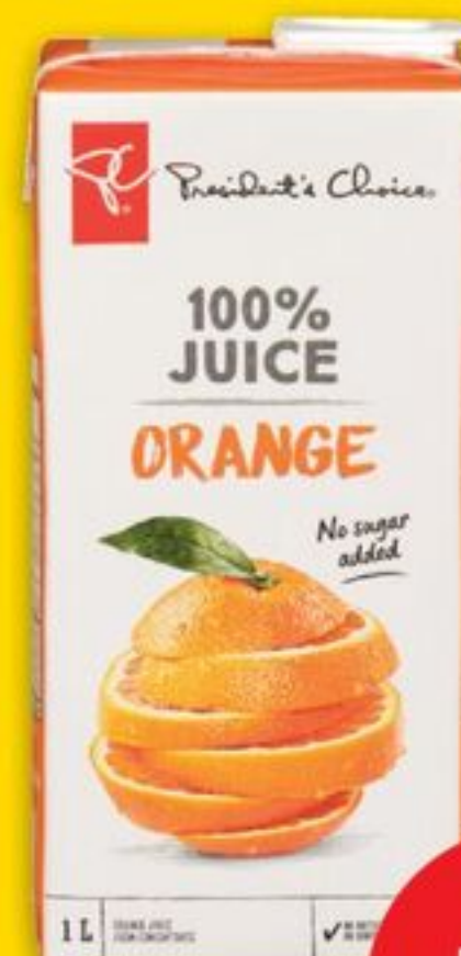
PC® 100% JUICE 1 L jus