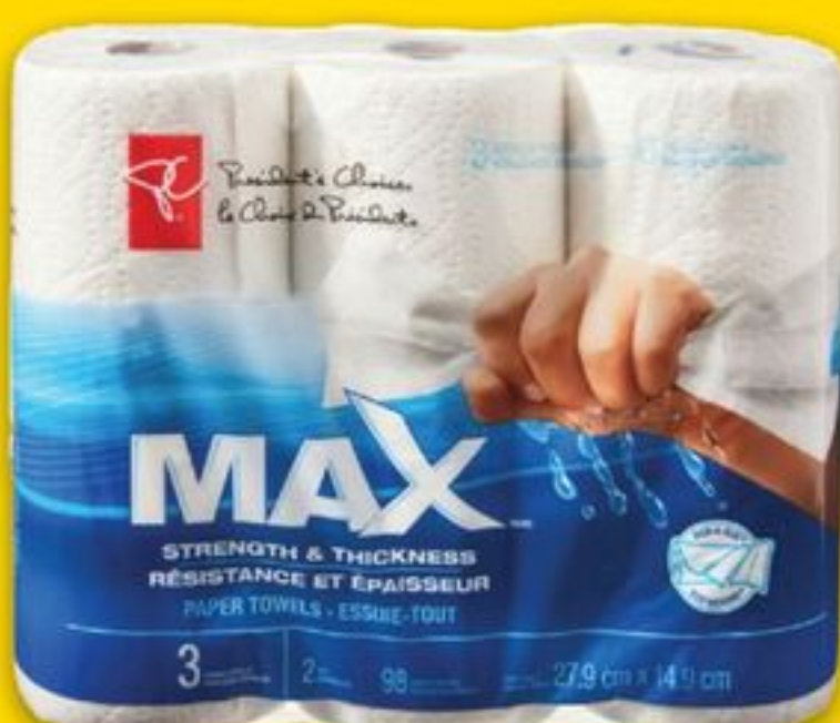
PC® MAX STRENGTH AND THICKNESS PAPER TOWELS 3 = 6 Rolls essuie-tout