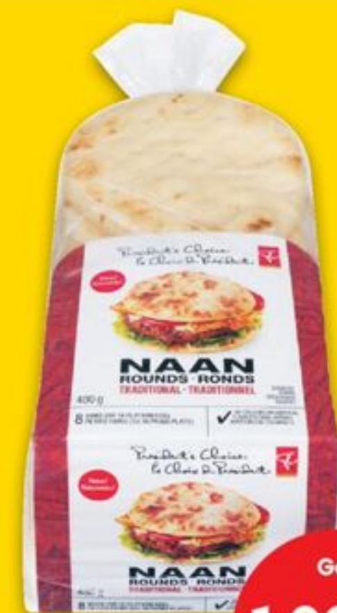
PC® NAAN ROUNDS 480 g naan