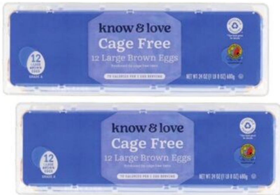
Know & Love Cage Free Large Brown Eggs Dozen Save up to 50¢