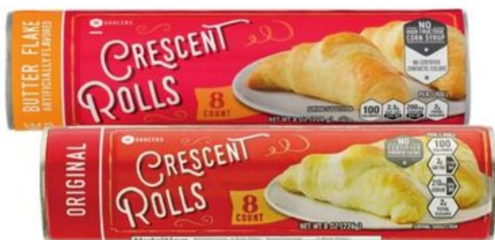
SE Grocers Crescents 8 ct Save up to 98¢ on 2