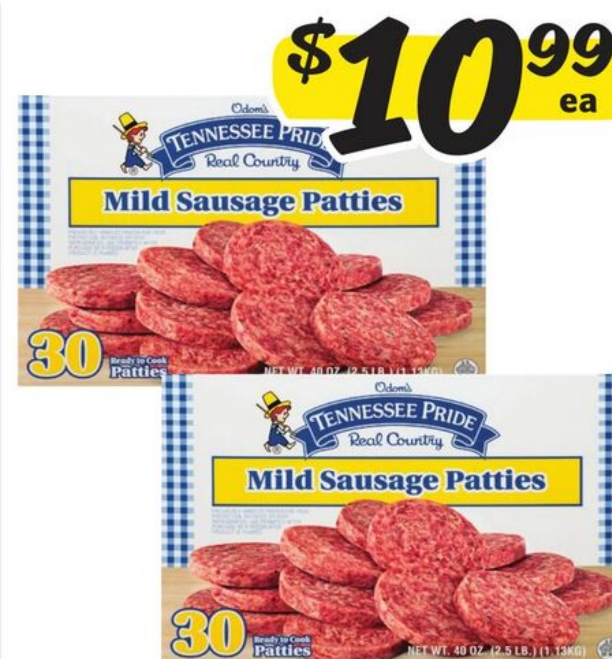
Tennessee Pride Patties 30 ct Save up to $2.70