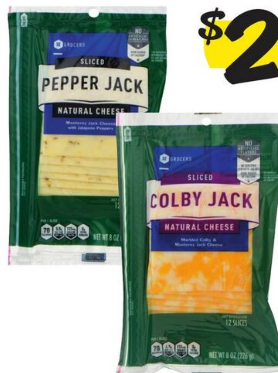
SE Grocers Natural Sliced Cheese 6.6-8 oz Save up to 80¢