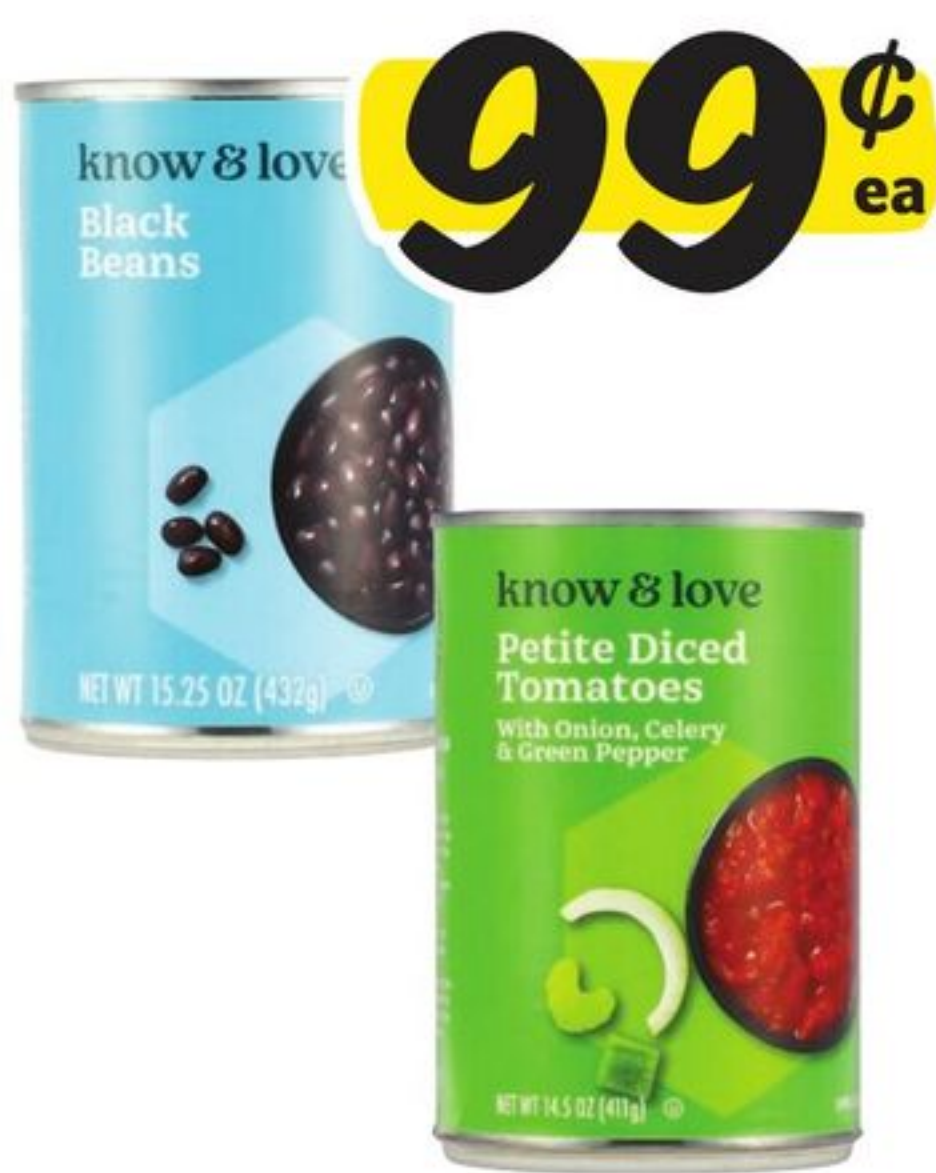
Know & Love Diced Tomatoes, Tomato Sauce or Variety Beans 10-15.5 oz Save up to 30¢