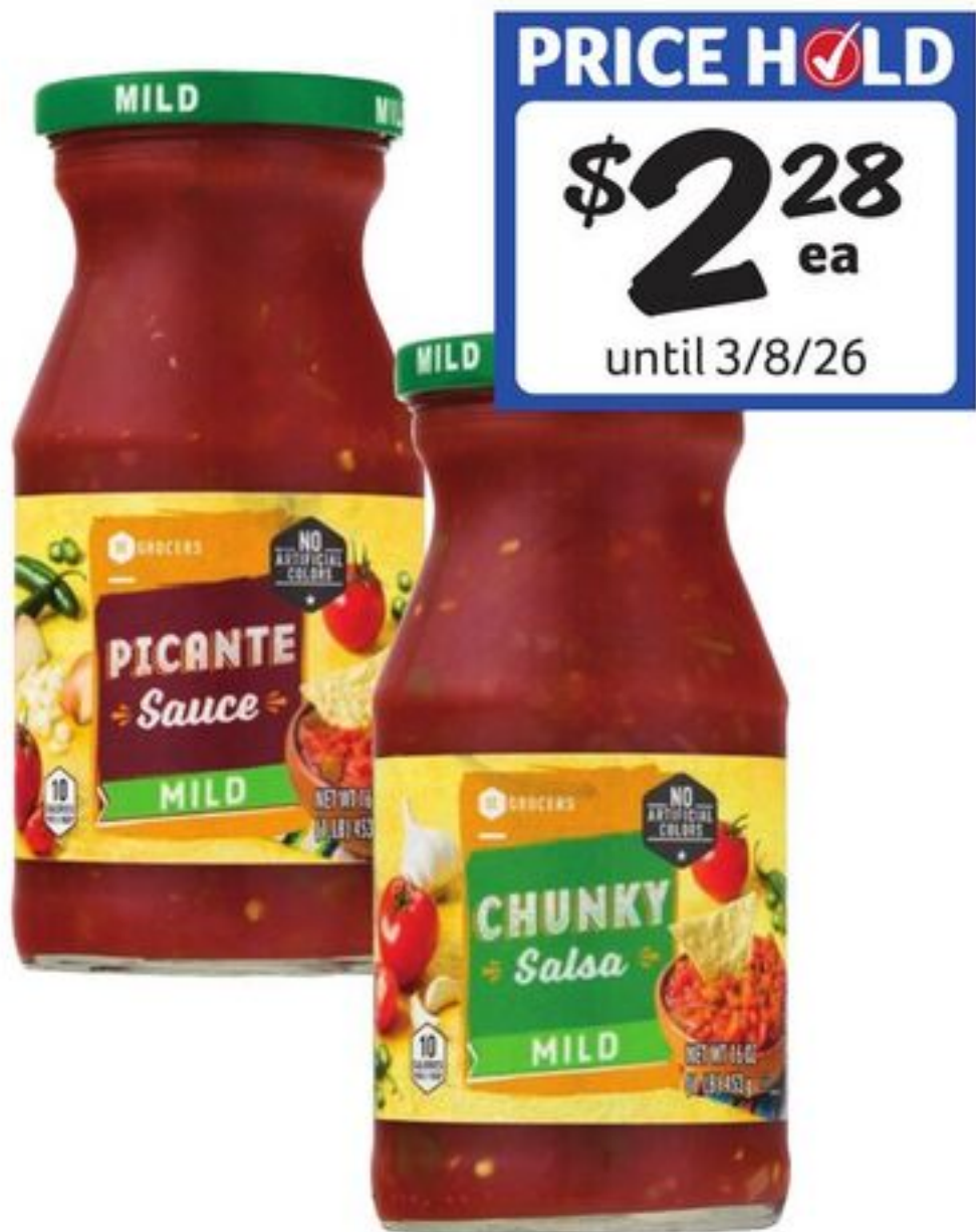
SE Grocers Salsa or Picante Sauce 16 oz Save up to 71¢