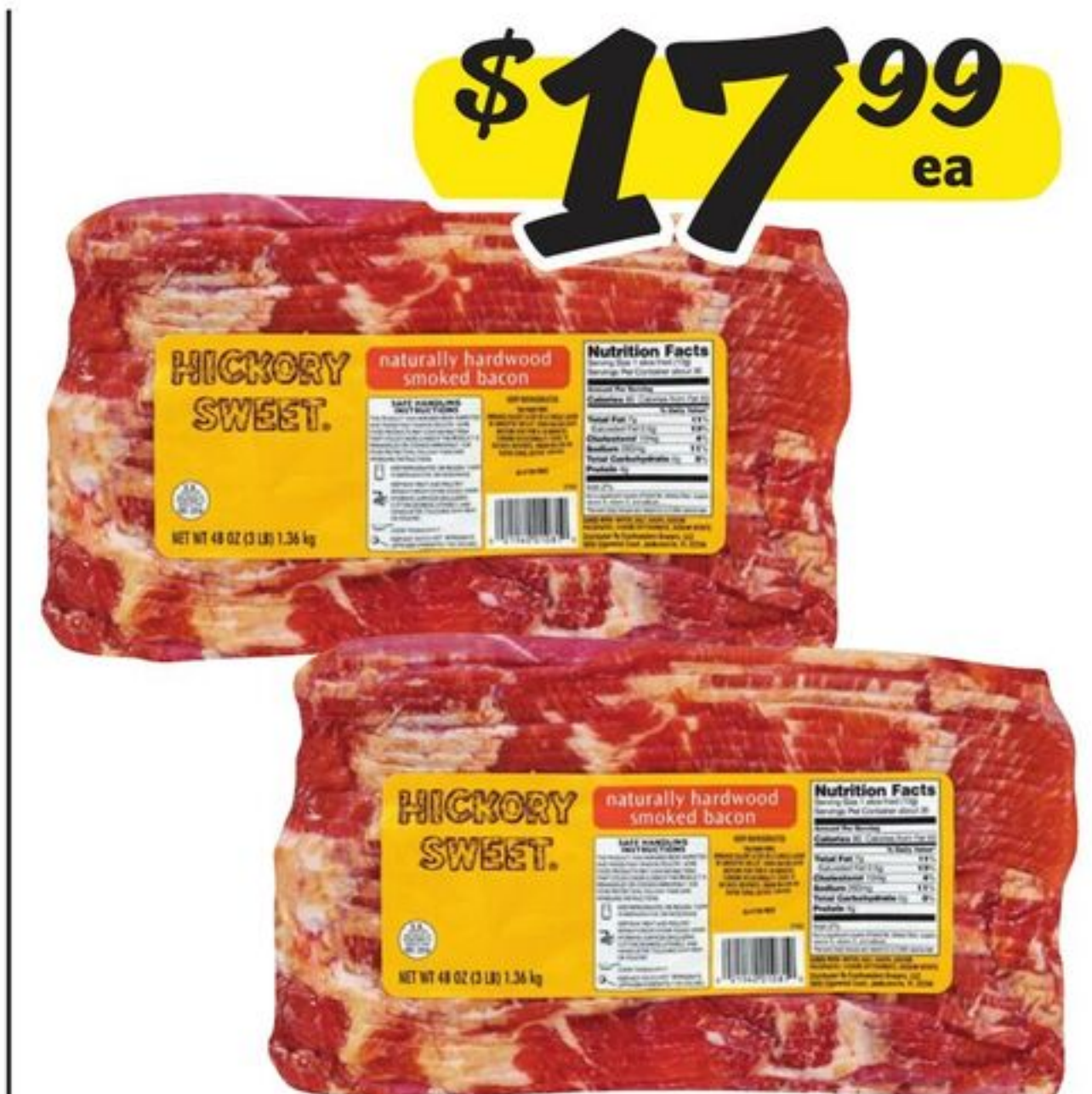
Hickory Sweet Bacon 3 lb Save up to $5