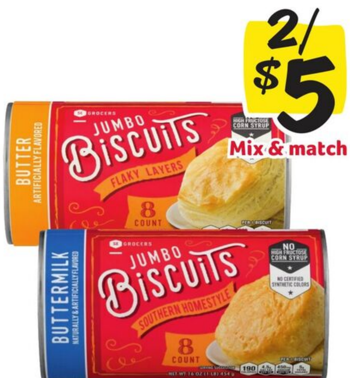
SE Grocers Jumbo Biscuits 8 ct Save up to 98¢ on 2