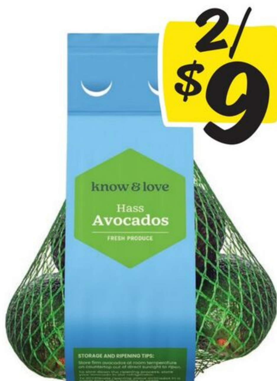
SE Grocers Avocados 4 ct Save up to $1.98 on 2