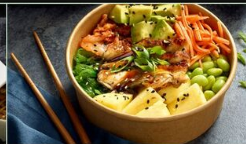
new Urban Fare Poké Bowl Selected Varieties