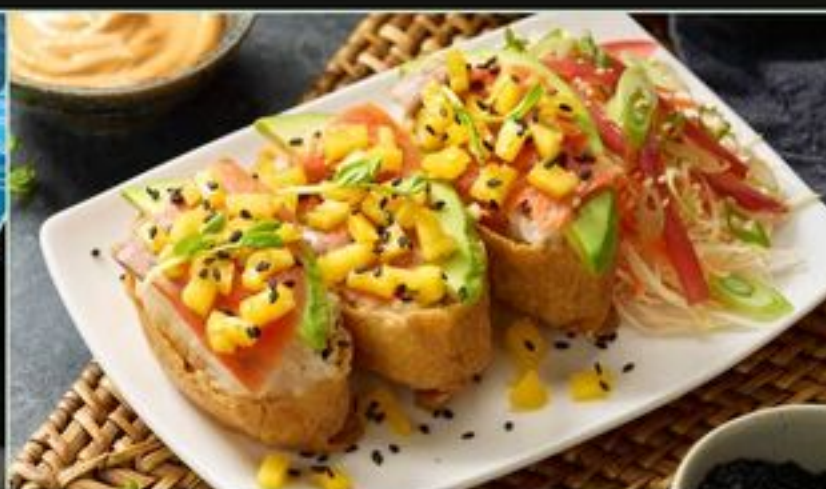
Urban Fare Inari Pocket Selected Varieties