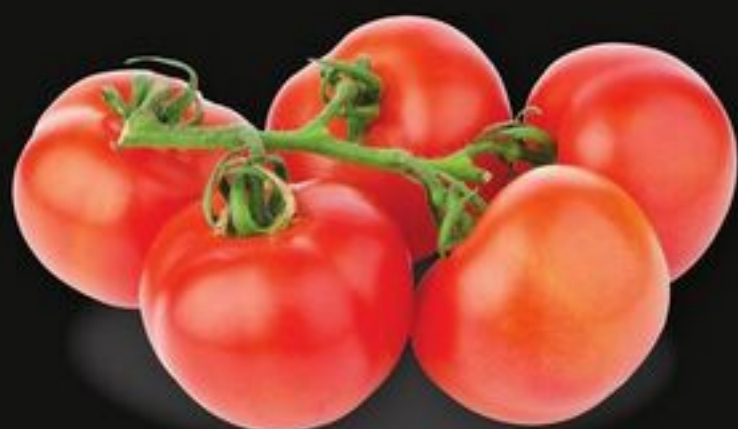
Tomatoes on the Vine BC, 6.59/kg