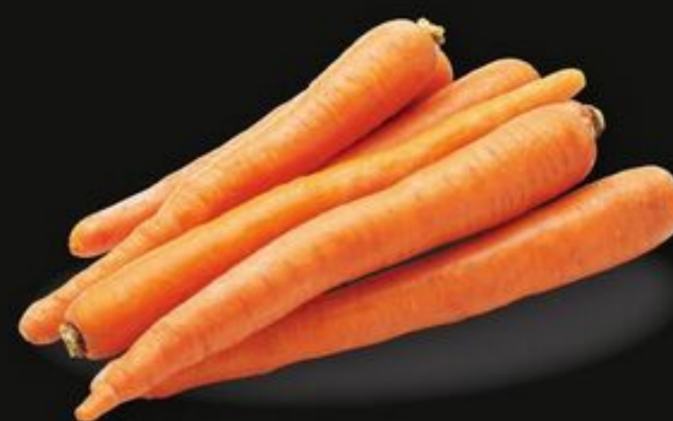
Organic Carrots California, 2 lb Bag