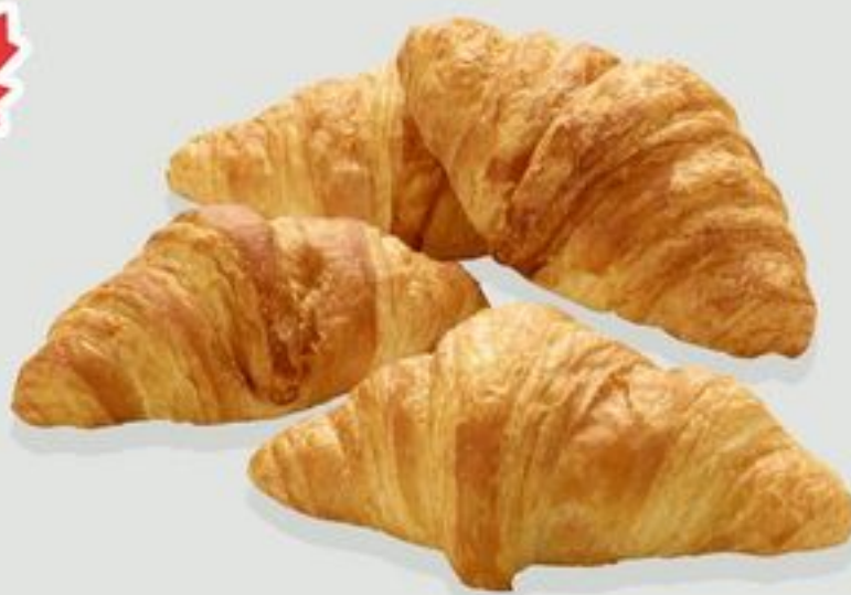
Croissants Baked in Store, Pack of 4 $3 99