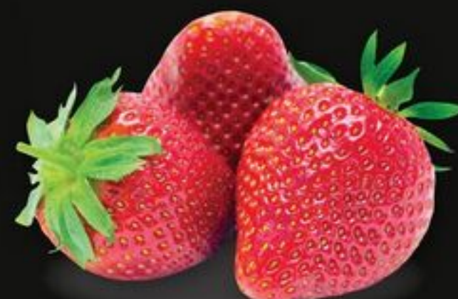
Organic Strawberries USA, 16 oz