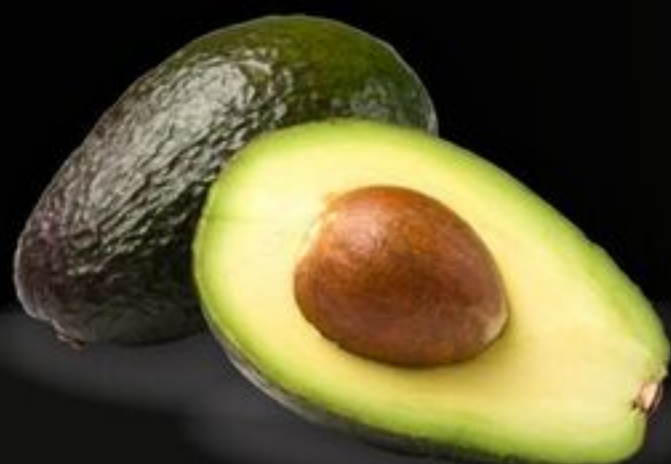
Large Ripe Avocado Mexico