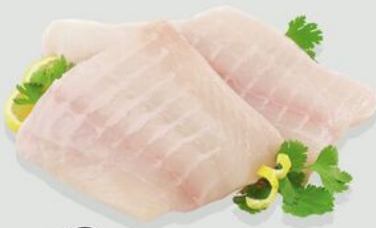
Halibut Fillet Wild, Skin-On, Fresh or Frozen $6 99 /100g