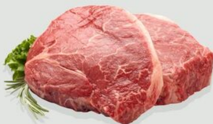
Wagyu Top Sirloin Roast or Steak, Fresh, 52.89/kg $23 99 /lb