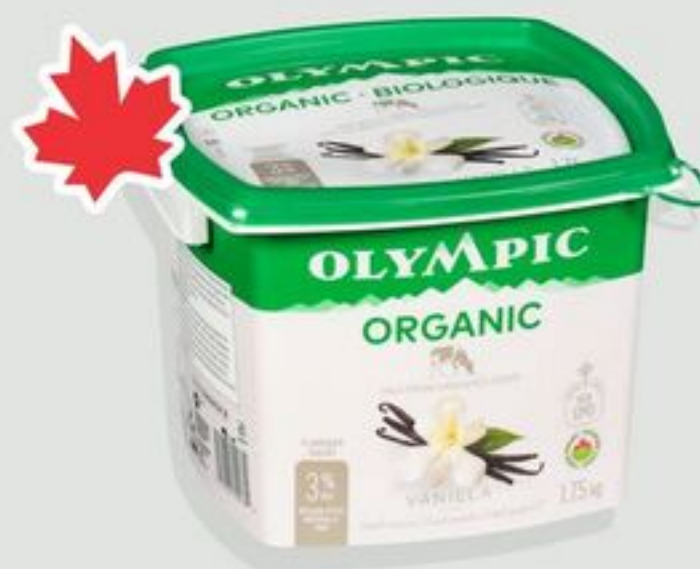
Olympic Organic Yogurt (1.75 kg) or Kefir (2 Litres) $12 99