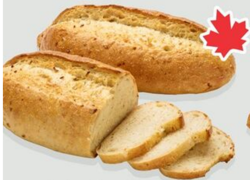
Artisan Bread Sliced, Selected Varieties $4 99