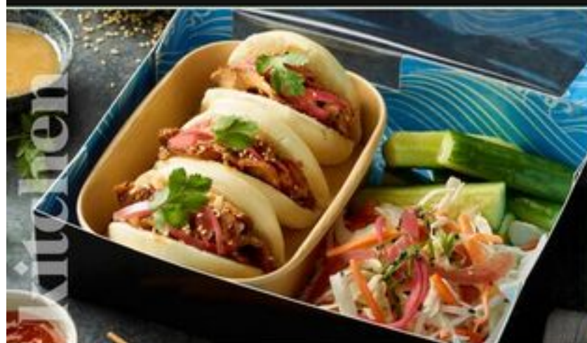
Urban Fare Bento Box