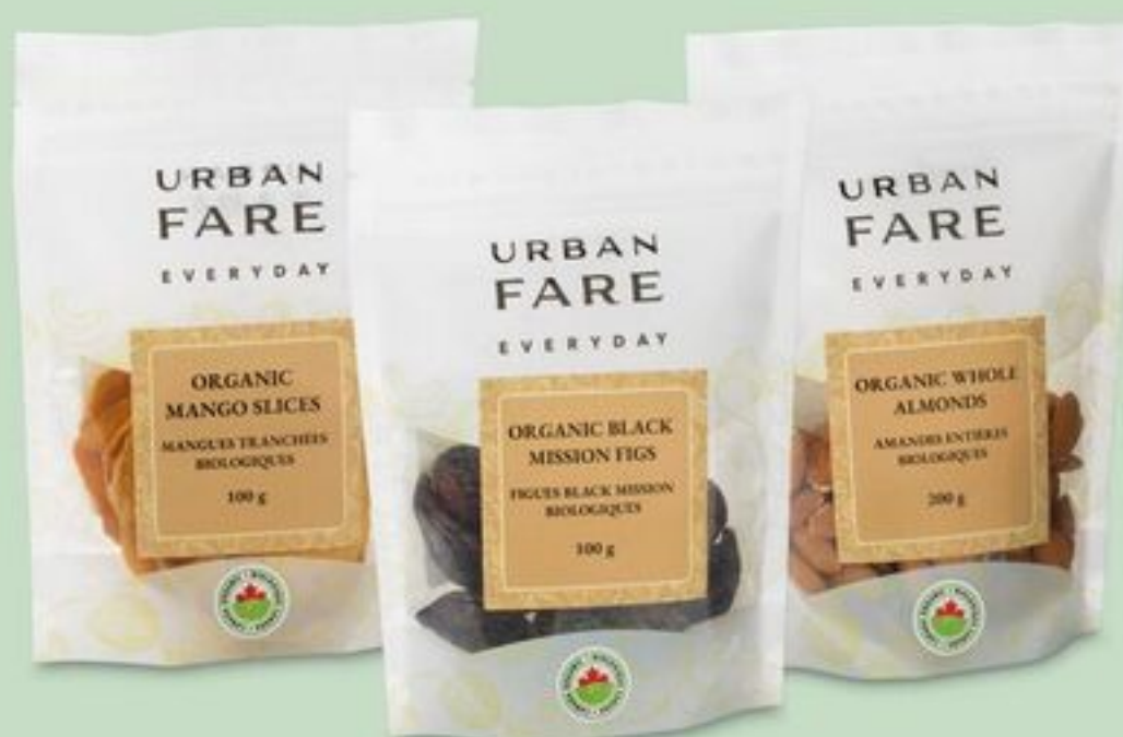
Urban Fare Everyday Bulk Products