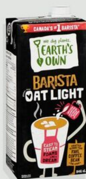
Earth's Own Oat Barista 946 mL $5 49