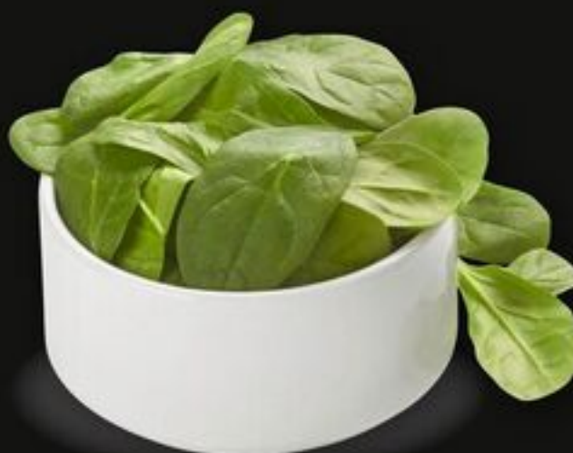
Earthbound Farm Organic Salad USA, 142g