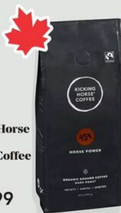
Kicking Horse Organic Ground Coffee 284g $16 99