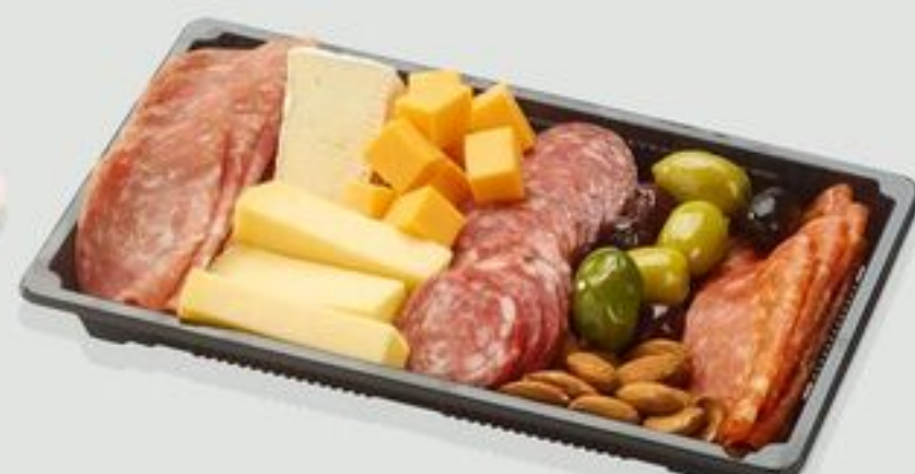
Charcuterie for 2 with Signature Olives or Almonds, Made in Store $9 99