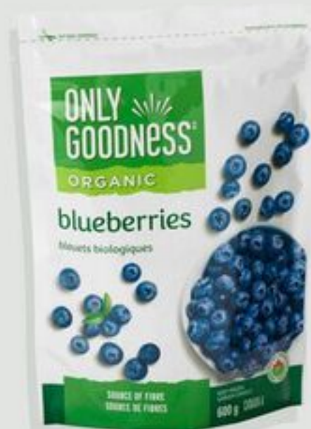
Only Goodness Organic Fruit or Smoothie Blend, Selected Varieties, 600g $5 99