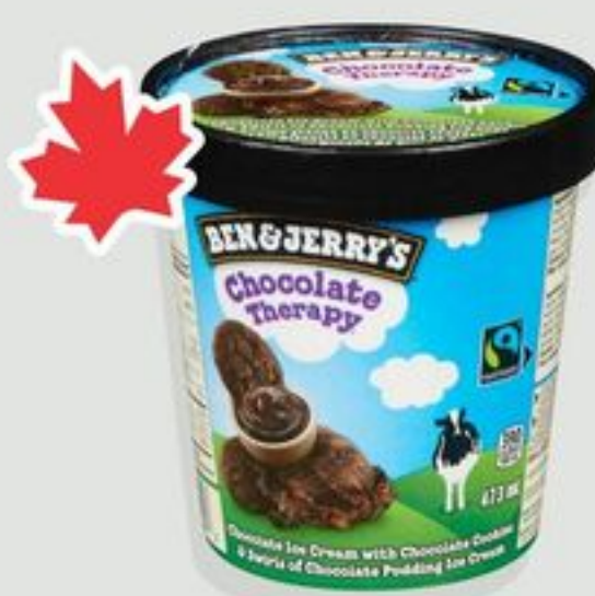
Ben & Jerry's Ice Cream (473 mL), Also Magnum Bars (3 x 90 mL), Selected Varieties $6 49