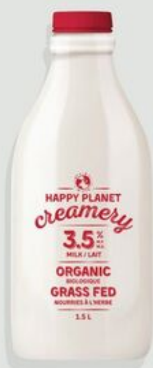
Happy Planet Creamery Milk (1.5 Litres) or Chocolate (750 mL) $7 49