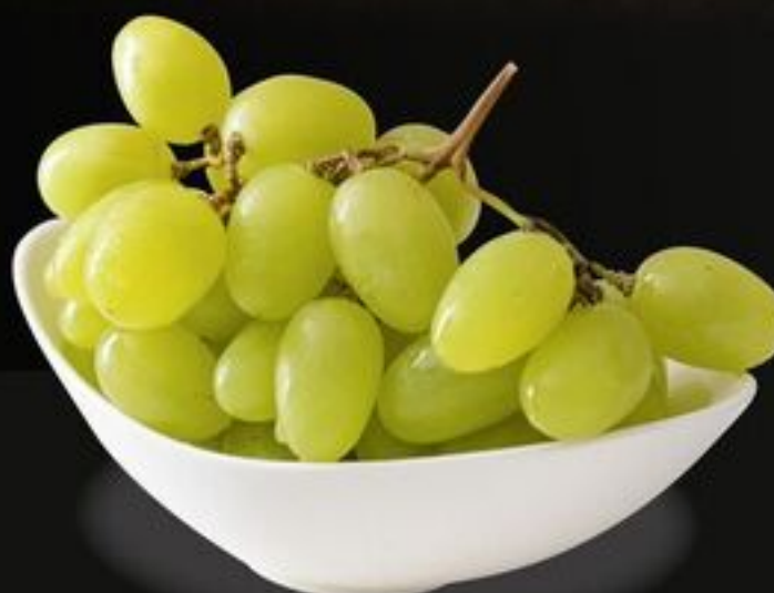
Green Seedless Grapes Peru, 11.00/kg