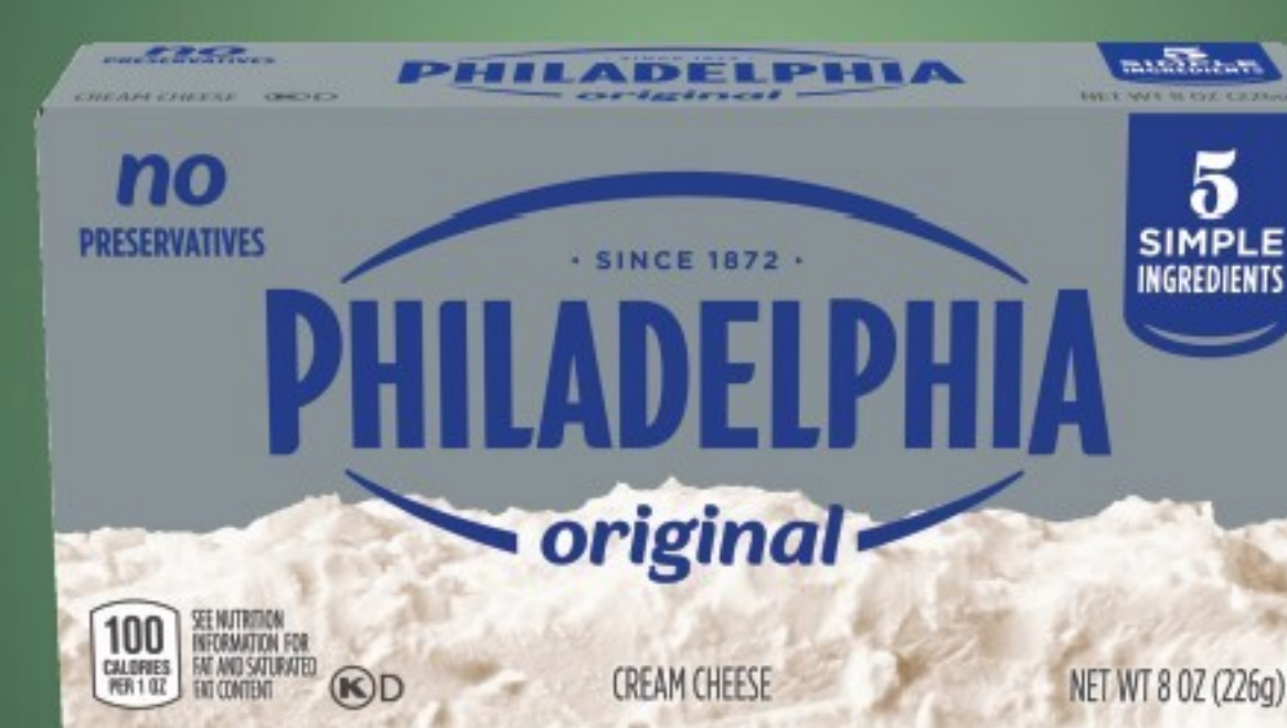
8 oz. Bar, Selected Variety Philadelphia Cream Cheese 2/$5