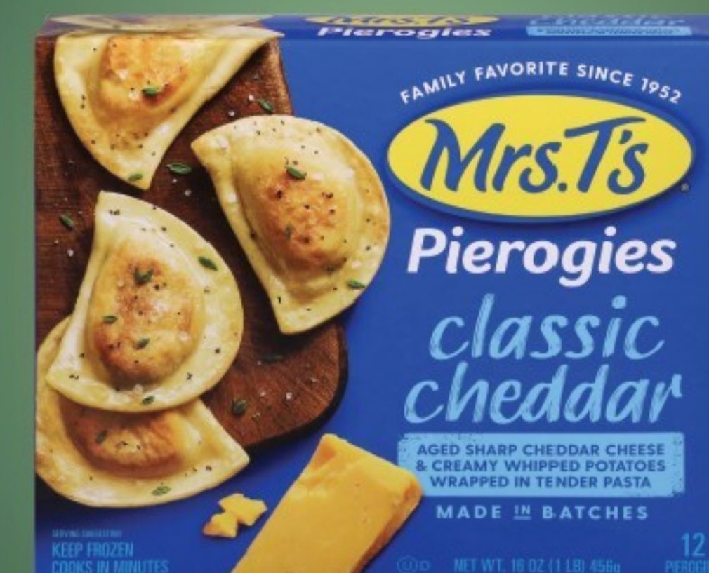
12.84-16 oz. Selected Variety Mrs. T's Pierogies $2 99