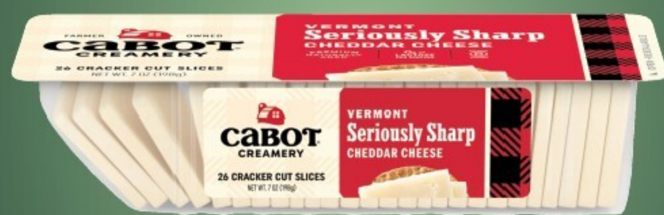
7-8 oz. Selected Variety Cabot Creamery Cheese Cuts or Slices 2/$6