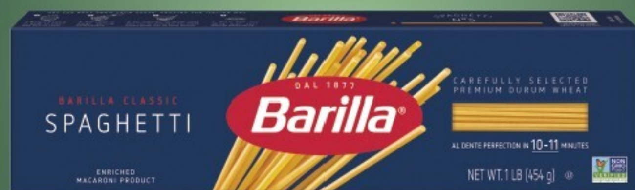
12-16 oz. Selected Variety Barilla Pasta 2/$3