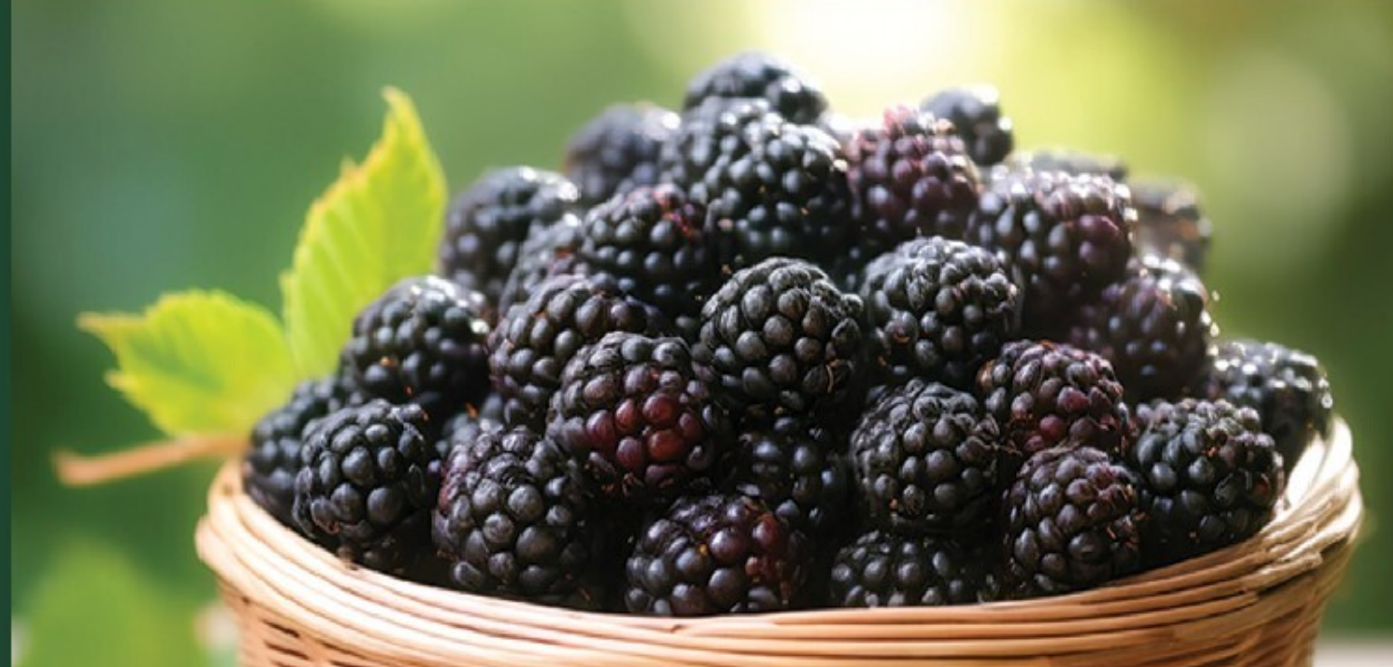
6 oz. Pkg. Blackberries