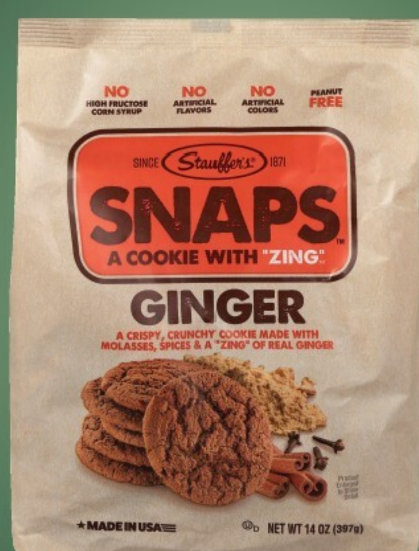
14 oz. Selected Variety Stauffer's Snaps 2/$6