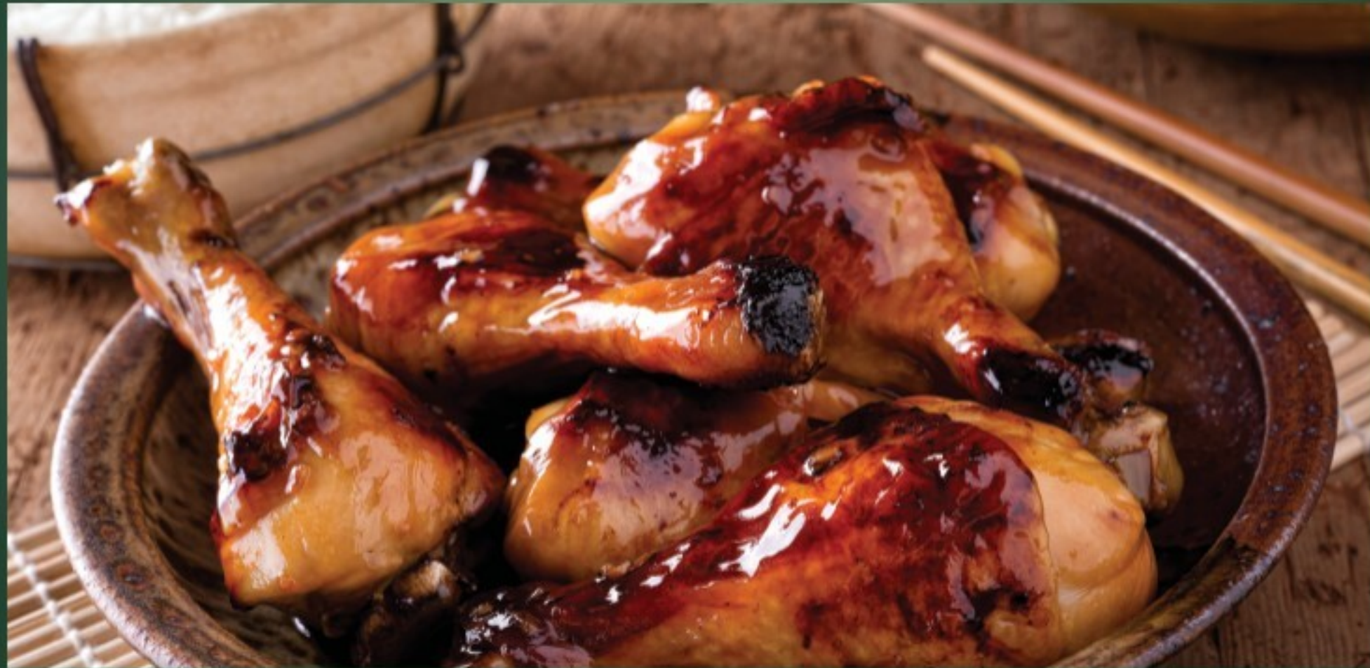
Fresh, Family Pack Chicken Drumsticks

Prices Valid: Saturday, February 14th - Friday, February 20th, 2026