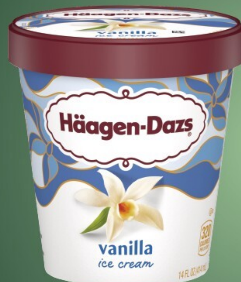
9-14 oz. Sorbet or Selected Variety Häagen-Dazs Bars or Ice Cream 2/$9