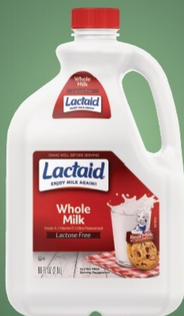
96 oz. Selected Variety Lactaid Milk $5 29