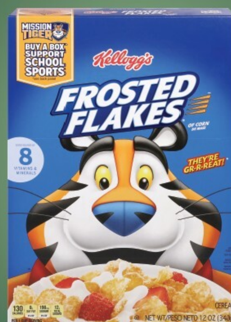
8.8-12.6 oz. Selected Variety Kellogg's Cereal $2 99