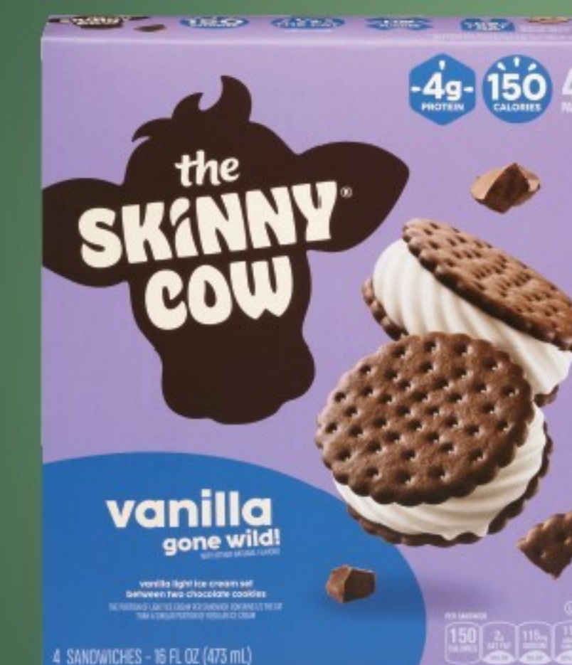
16-24 oz. Selected Variety The Skinny Cow Ice Cream Sandwiches 2/$7