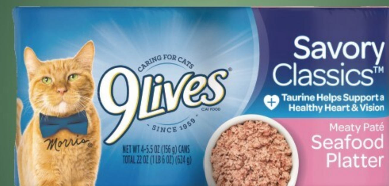
22 oz. 4 Pack, Selected Variety 9Lives Wet Cat Food $3 29