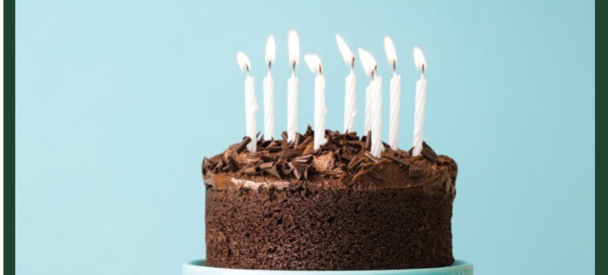
13 oz. Pkg. Selected Variety Zaro's Cakes