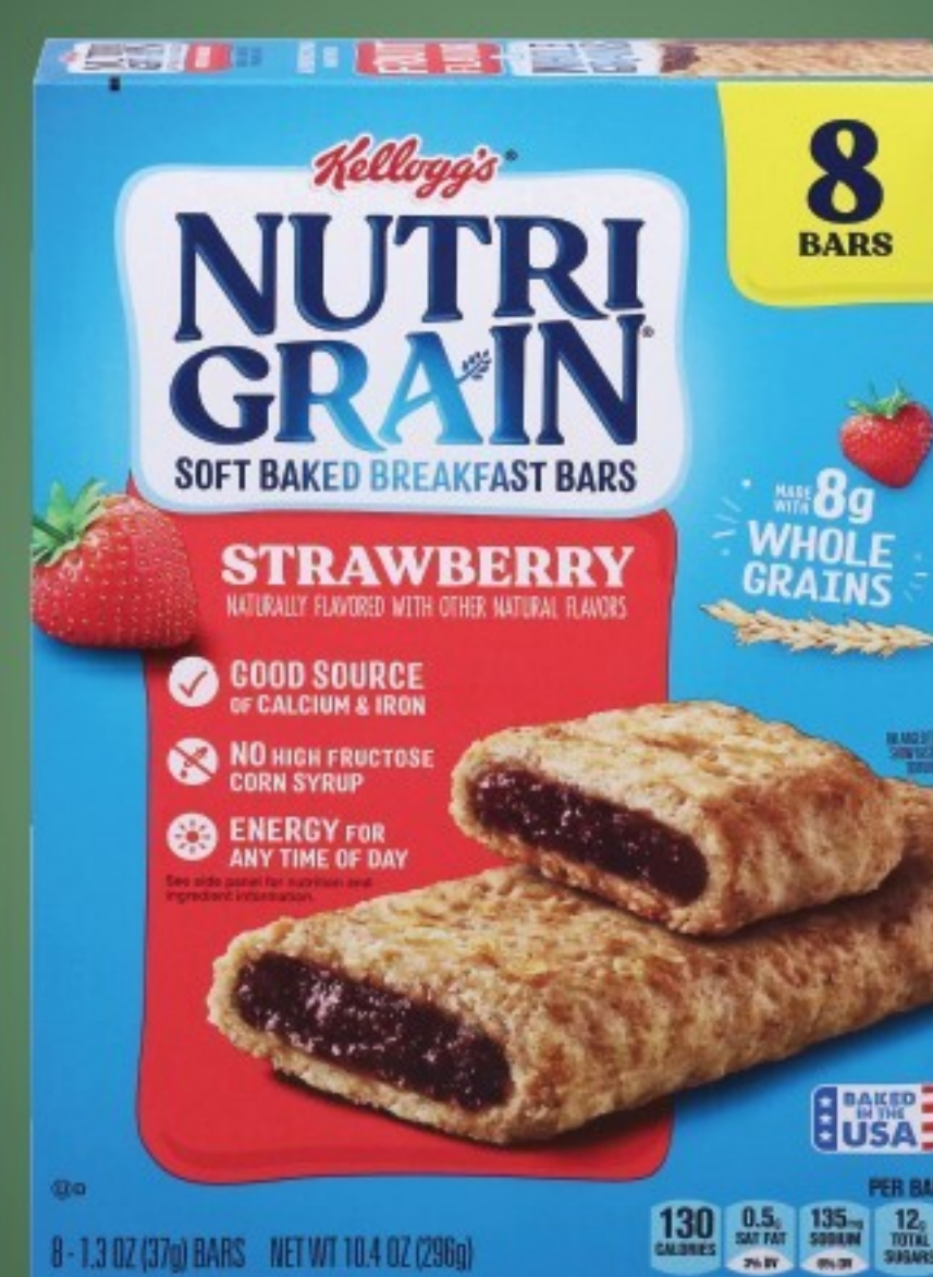
10.4 oz. Selected Variety Kellogg's Nutri-Grain Bars $2 99