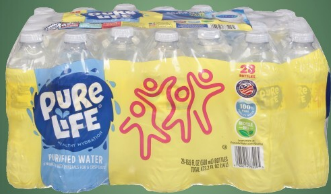
28 Pack, Half Liter Bottles Pure Life Purified Water $5 99