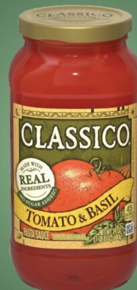
15-24 oz. Selected Variety Classico Pasta Sauce 2/$5