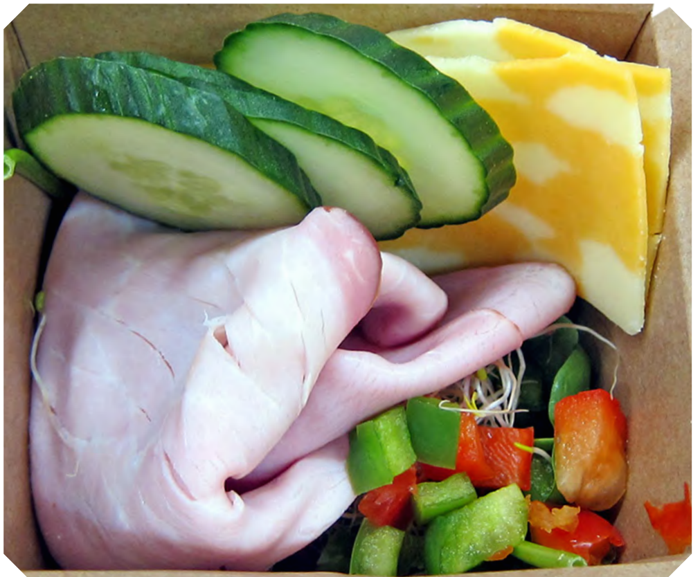
HAM N' CHEESE BOWL