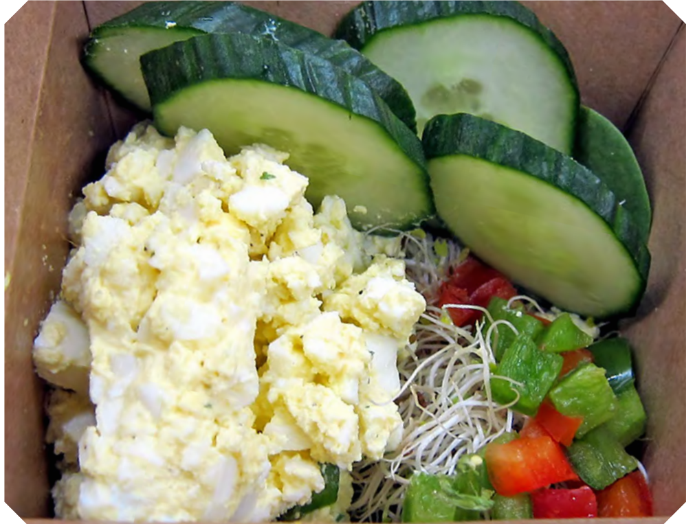
EGG SALAD BOWL