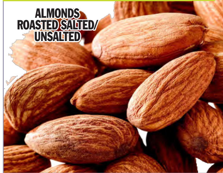
ALMONDS ROASTED SALTED/ UNSALTED