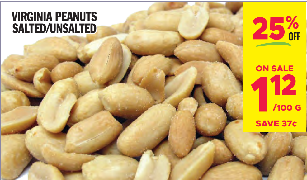
VIRGINIA PEANUTS SALTED/UNSALTED