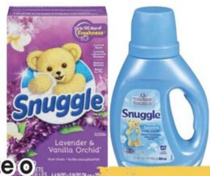
Suavizante o Toallitas Snuggle Fabric Softener, 27.2 oz or Dryer Sheets, 70-80 ct