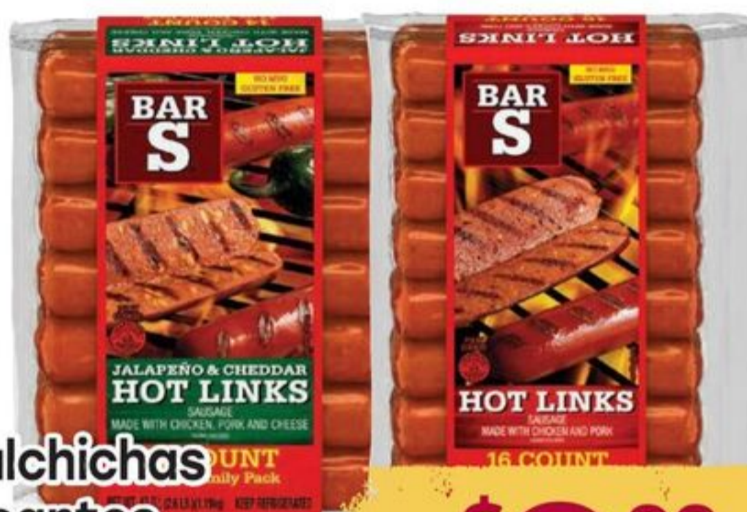
Salchichas Picantes Bar-S Hot Links, 42-48 oz