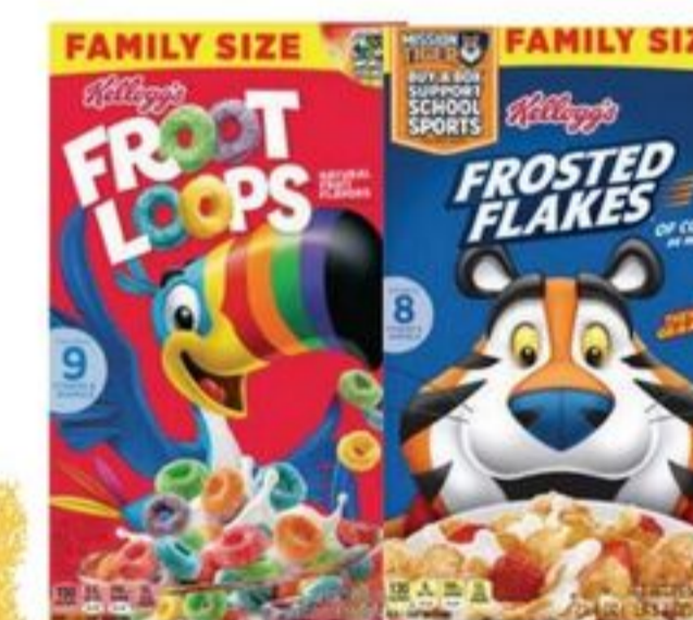
Cereal Kellogg's Selected Varieties 16.6-21.7 oz