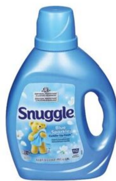
Suavizante Snuggle Blue Sparkle Fabric Softener 74.8 oz