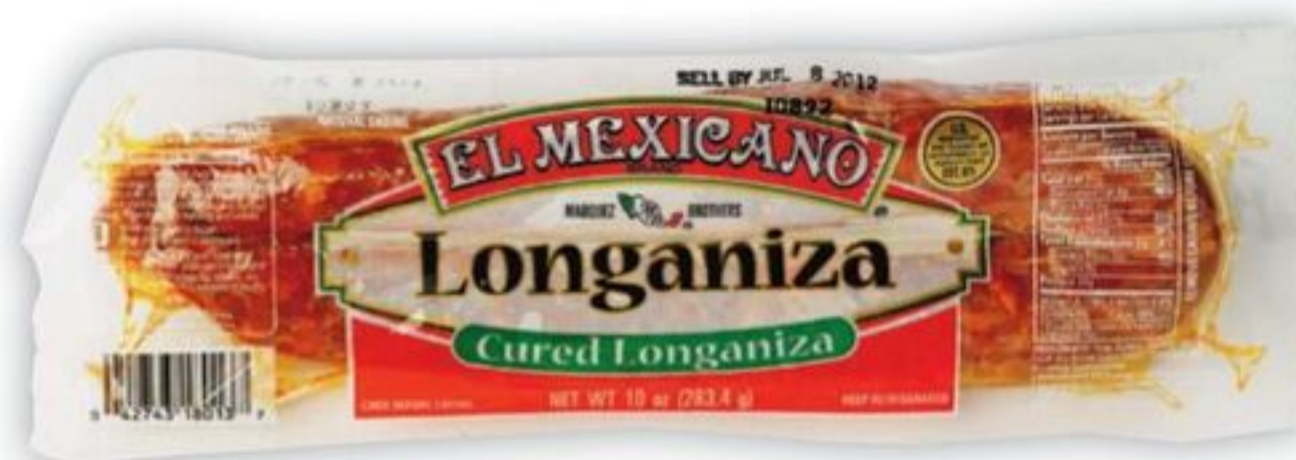
Longaniza El Mexicano Longaniza, 10 oz