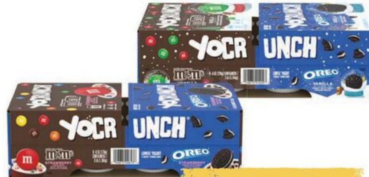
Yogurt YoCrunch Fridge Pack, 8 Pk