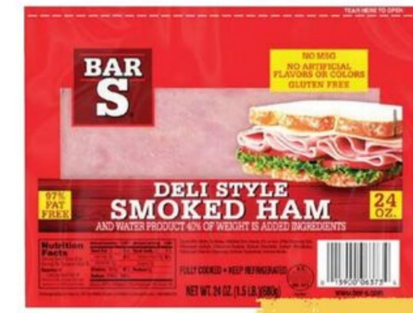
Jamón Bar-S Deli Style Ham, 24 oz