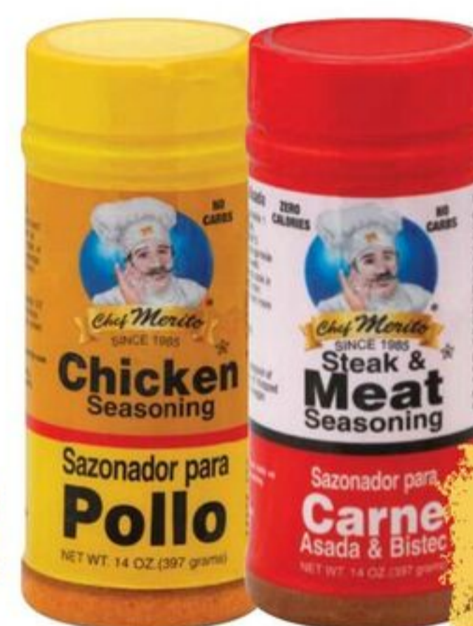
Sazonadores Chef Merito Chicken or Meat Seasoning, 14 oz