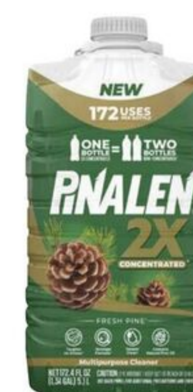
Limpiador Pinalen 2X Multipurpose Cleaner 172.4 oz