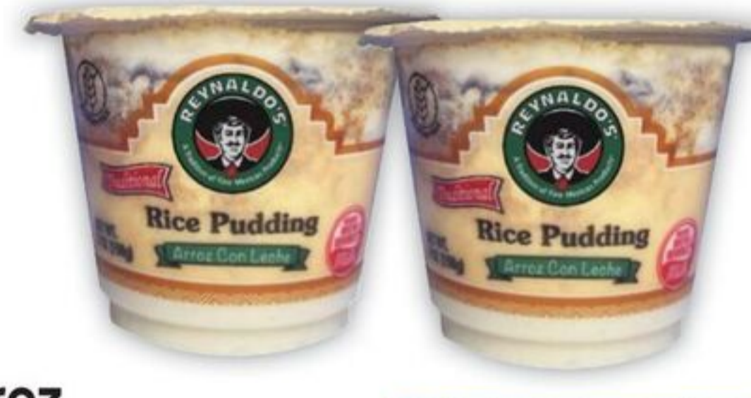
Arroz con Leche Reynaldo's Rice Pudding, 7 oz