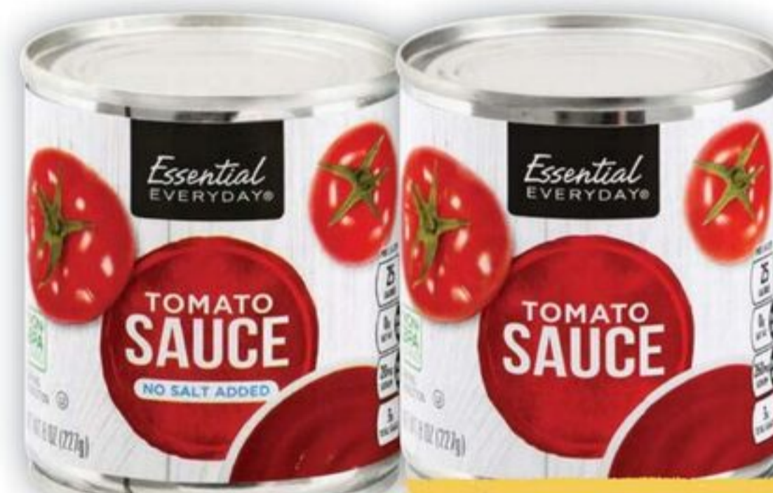
Salsa de Tomate EED Tomato Sauce, 8 oz