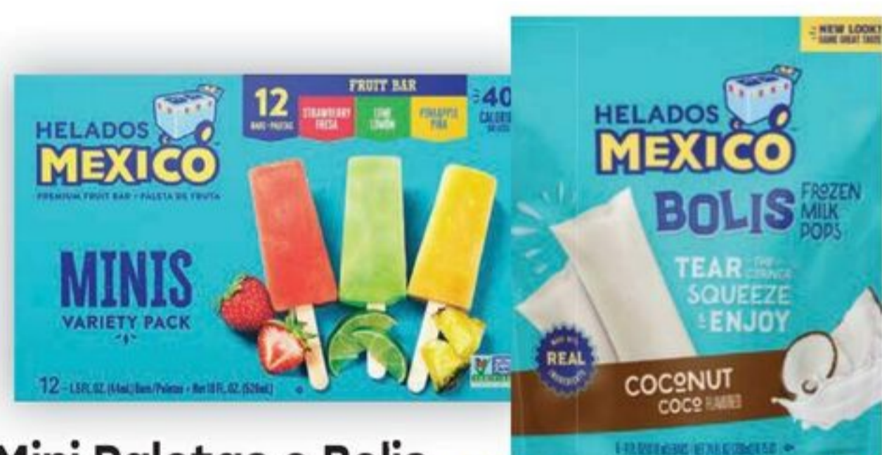
Mini Paletas o Bolis Helados México Mini Ice Cream Bars, 12 ct Bolis, 6 ct