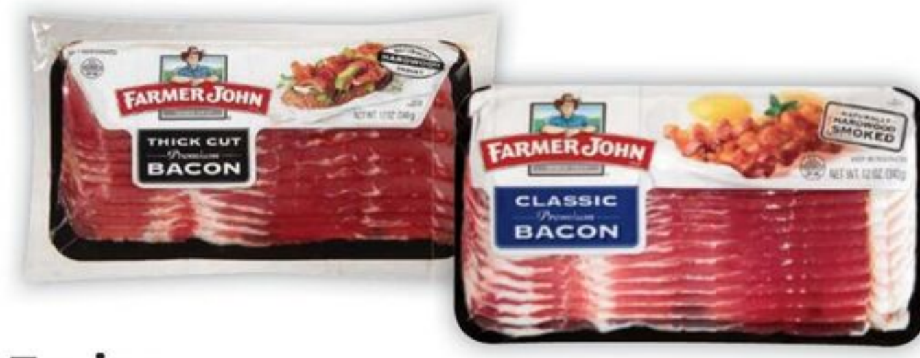
Tocino Farmer John Regular or Thick Cut Smoked Bacon, 12 oz