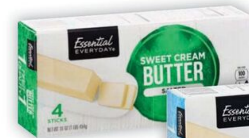
Mantequilla EED Sweet Cream Butter, 16 oz