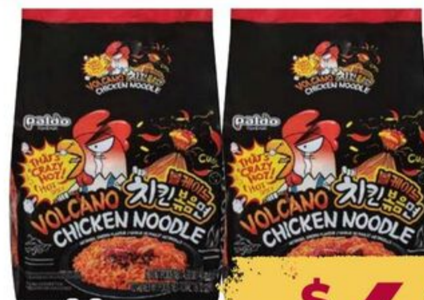
Fideos Paldo Ramen, 4 Pk, 18.3-19.7 oz