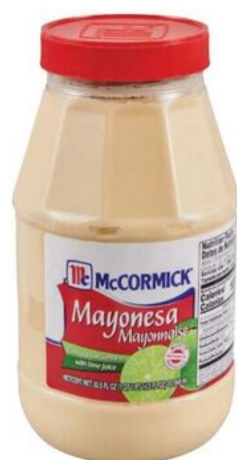
Mayonesa McCormick Mayonnaise with Lime 62.5 oz