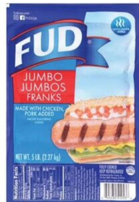
Salchichas FUD Hot Dogs, 5 Lb