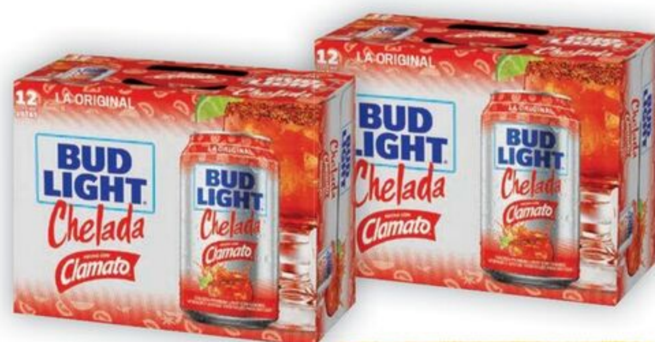
Bud Light Chelada 12 Pk, 12 oz Cans