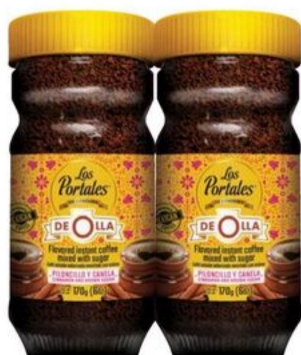
Café de Olla Los Portales Coffee 6 oz