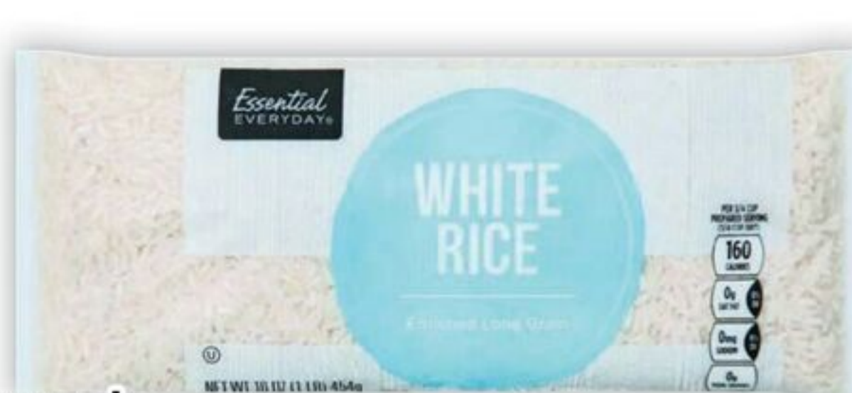
Arroz de Grano Largo Blanco EED Long Grain Rice 16 oz