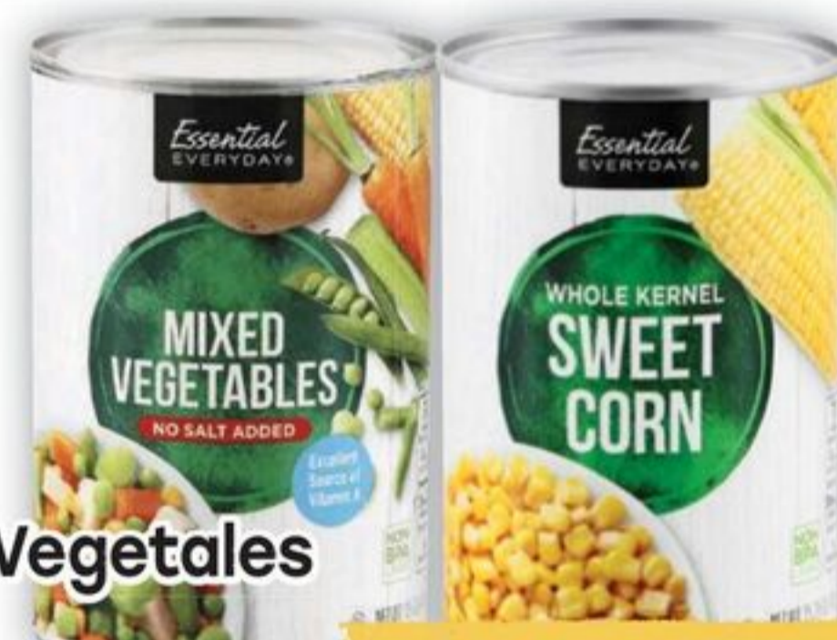
Elote o Vegetales EED Whole Kernel Corn or Mixed Vegetables 15-15.25 oz