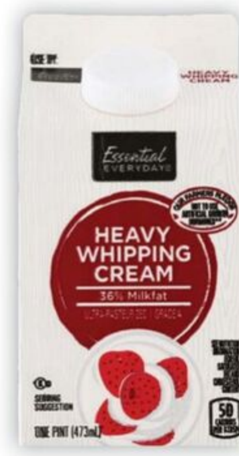
Crema Líquida EED Heavy Whipping Cream, 16 oz