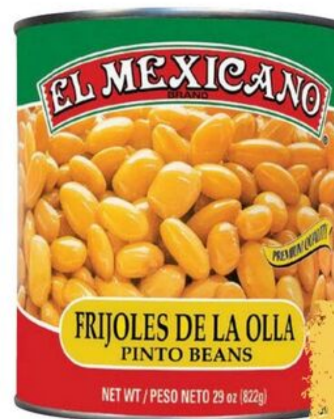
Frijoles Pintos El Mexicano Pinto Beans, 29 oz