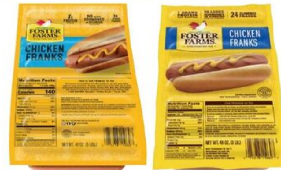
Salchichas Foster Farms Franks, 3 Lb