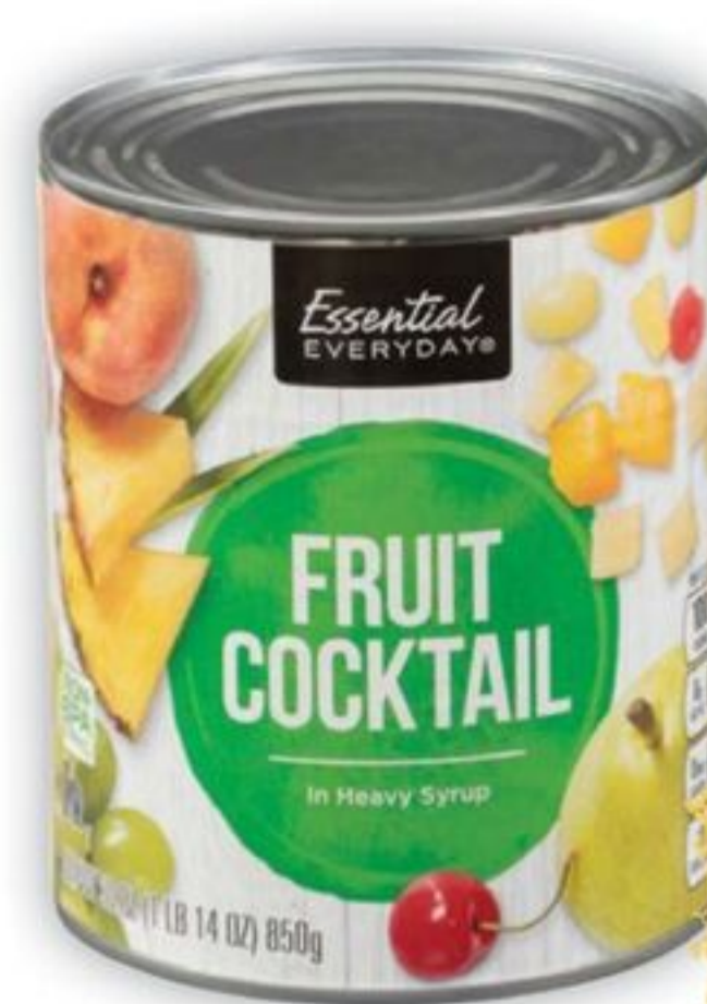
Cóctel de Fruta EED Fruit Cocktail 30 oz