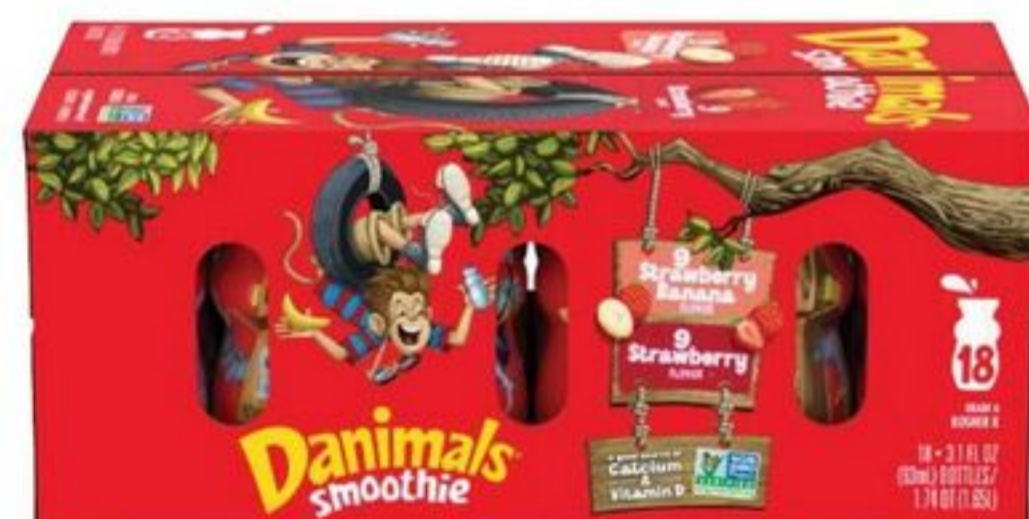
Yogurt Danimals Drinkable Yogurt Club Pack, 18 Pk