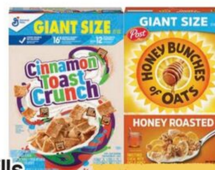
Cereales Post o General Mills Cereal Selected Varieties 23-27 oz