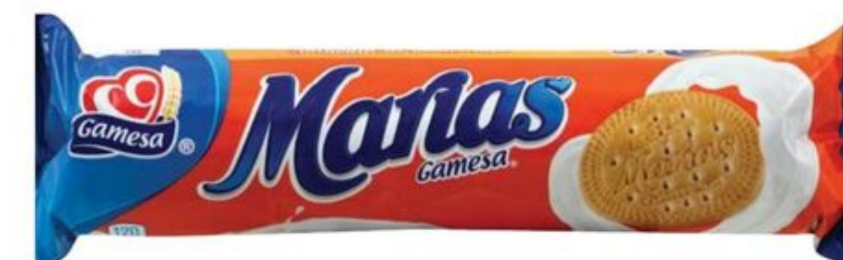
Galletas Marías Gamesa Cookies, 4.9 oz