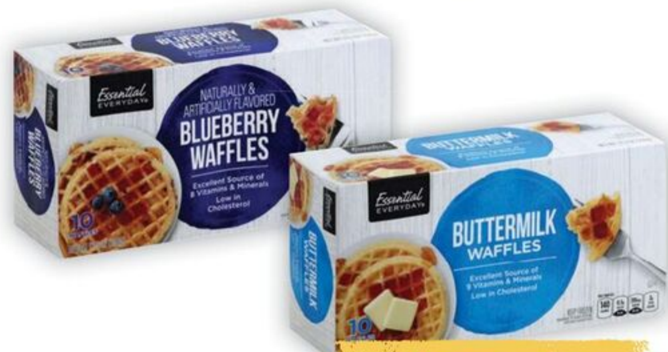
Waffles EED Waffles Assorted Varieties, 10 ct