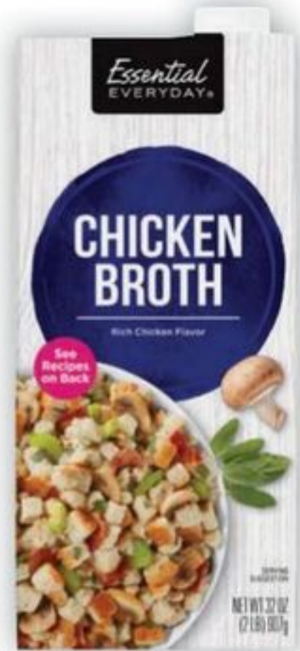
Caldo de Pollo EED Chicken Broth 32 oz