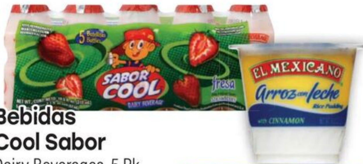
Bebidas Cool Sabor Dairy Beverages, 5 Pk Arroz con Leche El Mexicano Rice Pudding, 8 oz