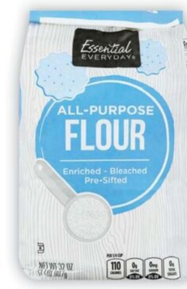
Harina EED All Purpose Flour 2 Lb