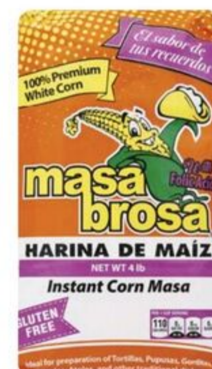
Harina de Maíz Masabrosa Corn Flour 4 Lb