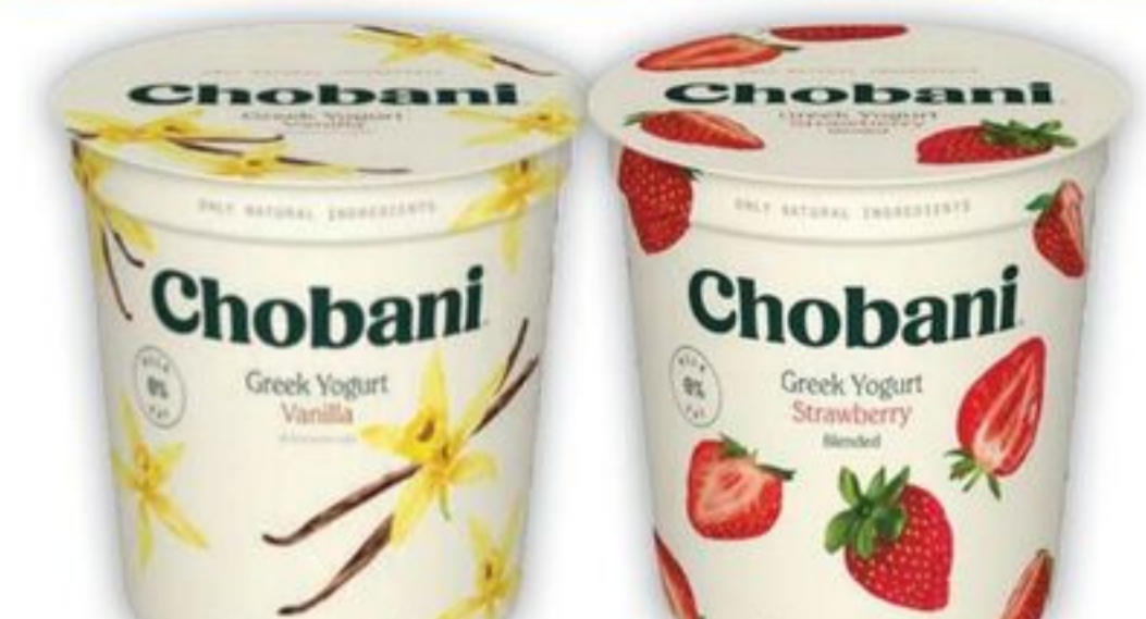
Yogurt Chobani Assorted Varieties, 32 oz