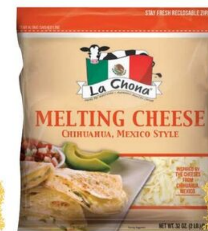
Queso Chihuahua La Chona Shredded Cheese 32 oz