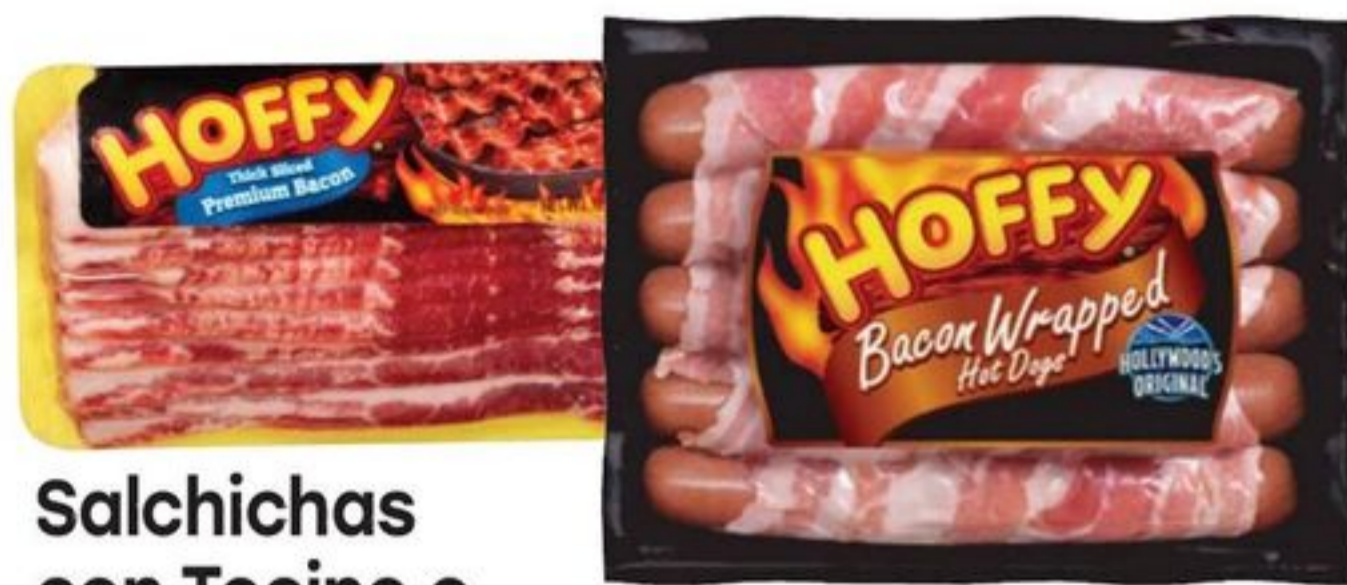
Salchichas con Tocino o Tocino Hoffy Bacon Wrap Wieners, 14 oz Bacon, 12 oz