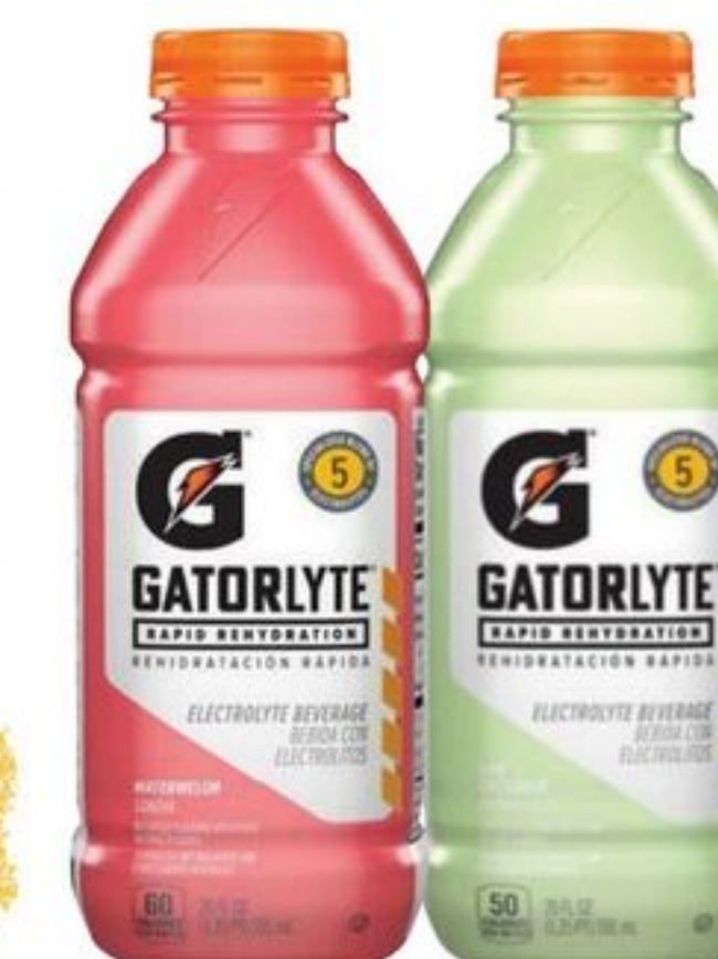
Bebida Gatorlyte Electrolyte Beverage 20 oz