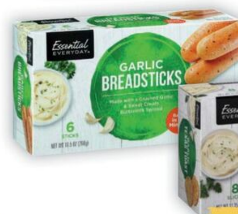
Pan de Ajo EED Garlic Bread, 10.5-16 oz