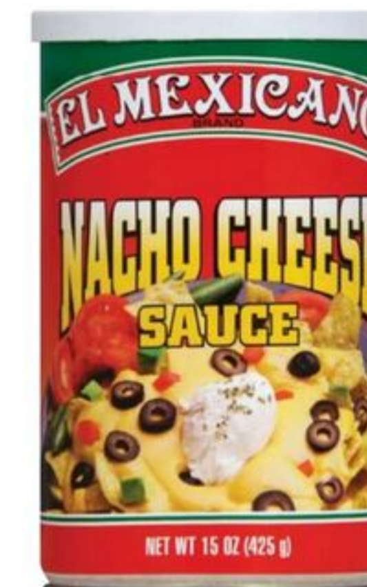
Queso para Nachos El Mexicano Nacho Cheese Sauce, 15 oz