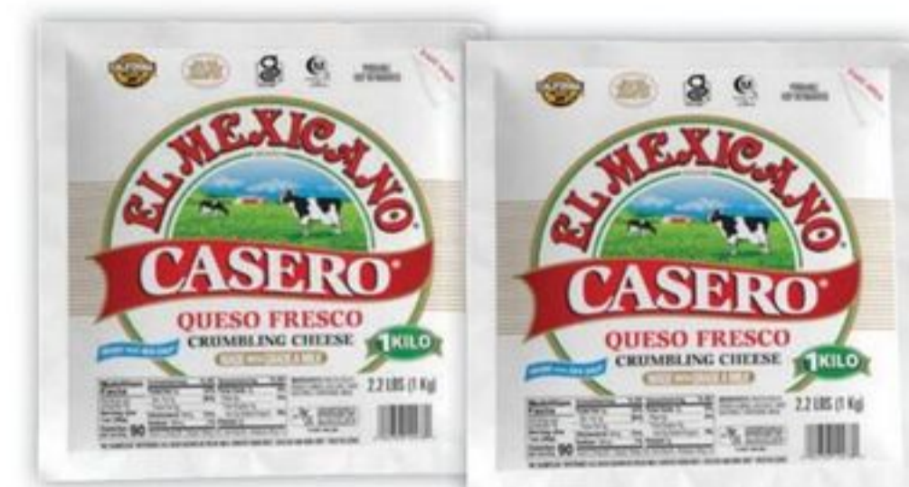
Queso Fresco El Mexicano Fresh Cheese, 2.2 Lb