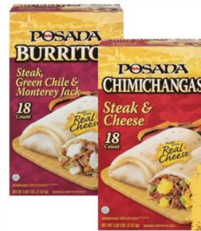
Posada Burritos o Chimichangas Burritos or Chimichangas, 18 Pk