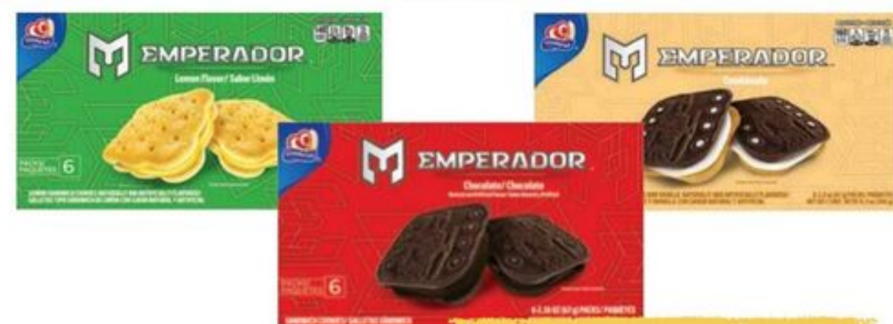
Galletas Gamesa Emperador Cookies Selected Varieties, 12.5-14.3 oz