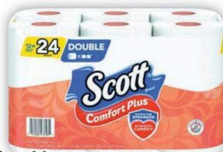
Papel Scott Comfort Plus Scott Comfort Plus Bath Tissue, 12 Rolls