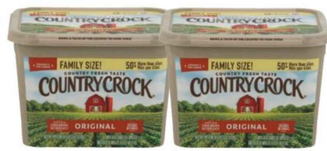
Margarina Country Crock Spread, Family Size, 67.5 oz