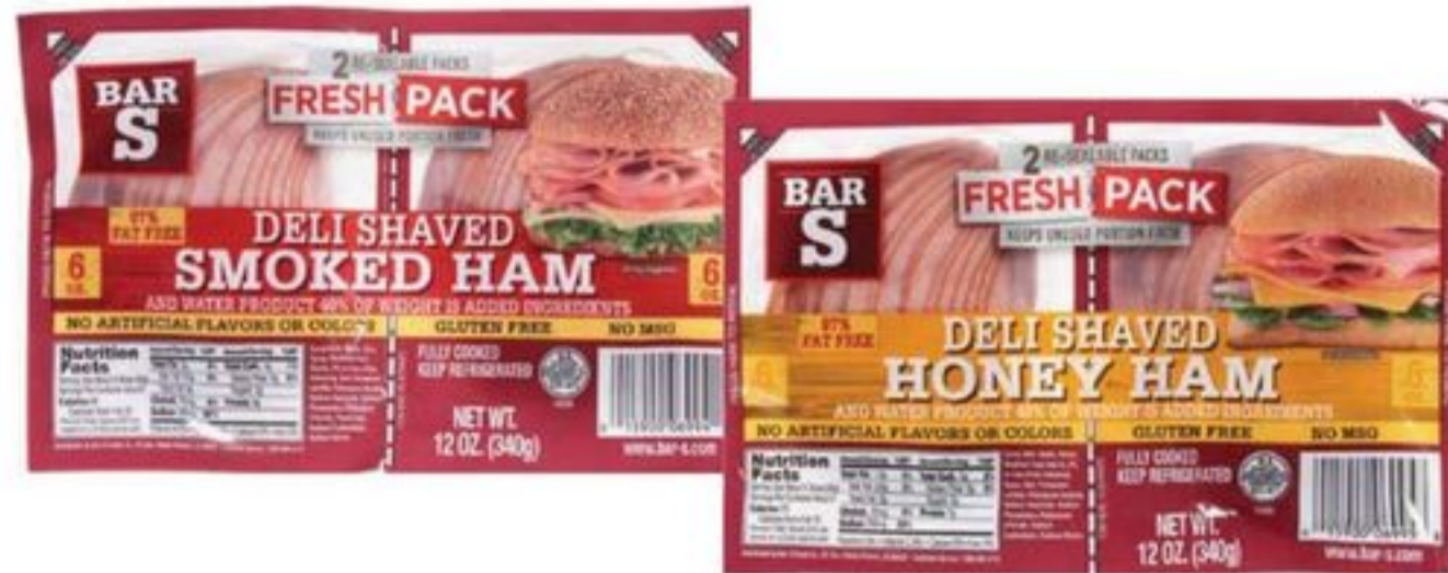
Carnes Frías Bar-S Shaved Ham, 12 oz