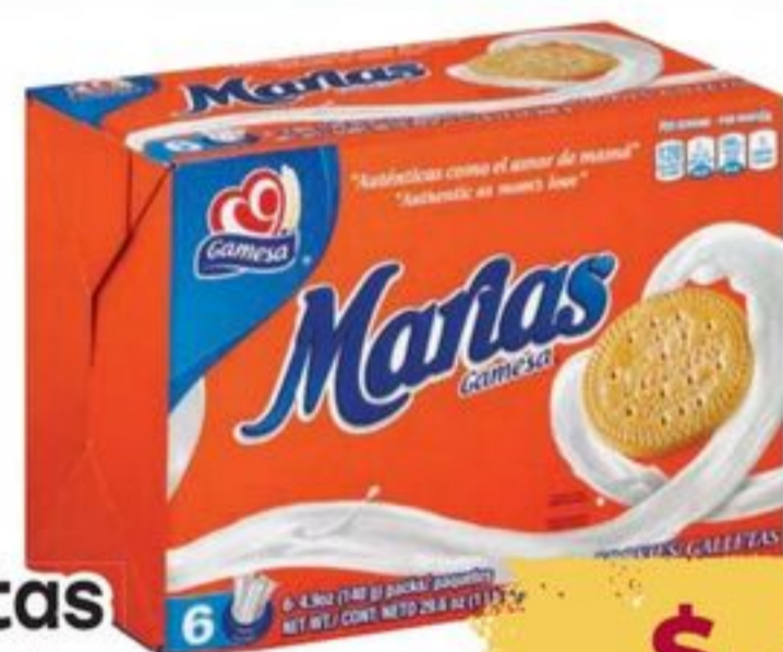
Galletas María Gamesa Cookies, 29.6 oz