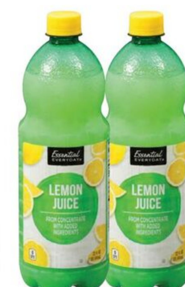
Jugo de Limón EED Lemon Juice 32 oz