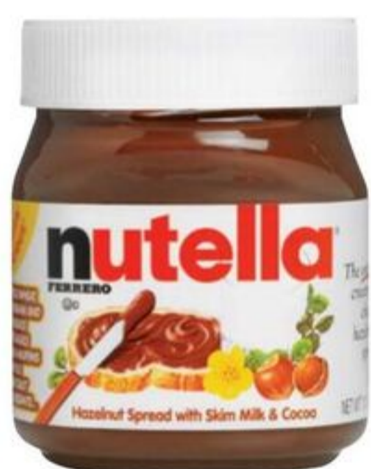
Crema de Avellana Nutella Hazelnut Spread 13 oz