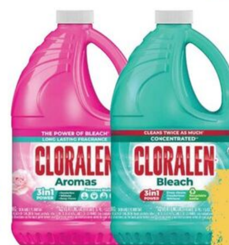
Blanqueador Cloralen Bleach 81 oz