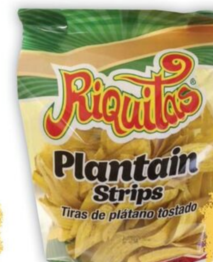
Platanitos Riquitas Plantain Strips, 12 oz