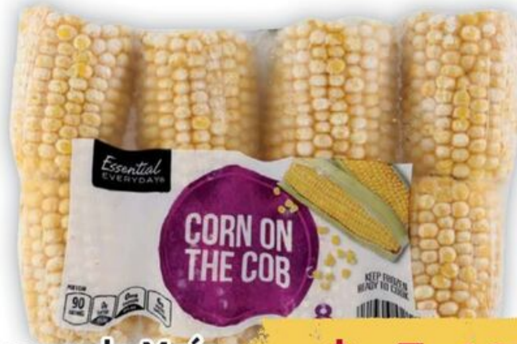
Mazorca de Maíz Congelada EED Mini Corn on the Cob, 8 ct