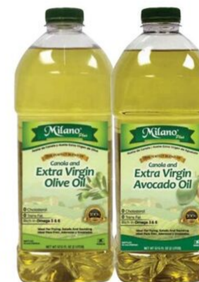
Aceite Milano Cooking Oil 2 Liters