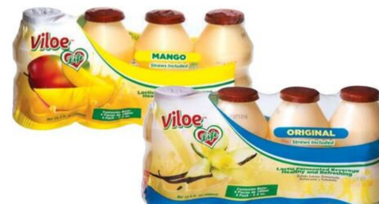
Bebidas Viloe Life Drinks, 4 Pk, 3.3 oz