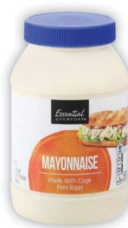
Mayonesa EED Mayonnaise, 30 oz