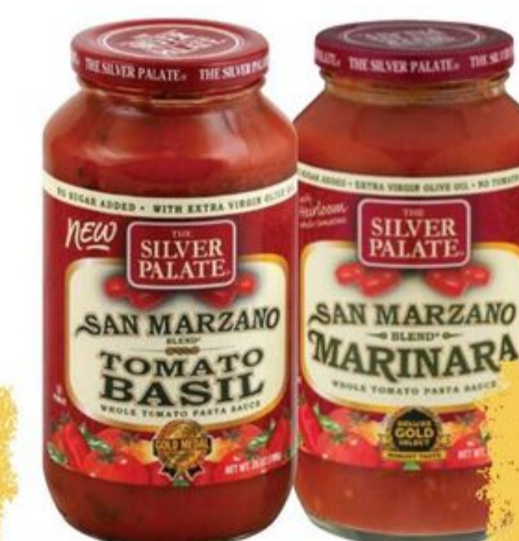
Salsa para Pasta Silver Palate Pasta Sauce 15.5-25 oz