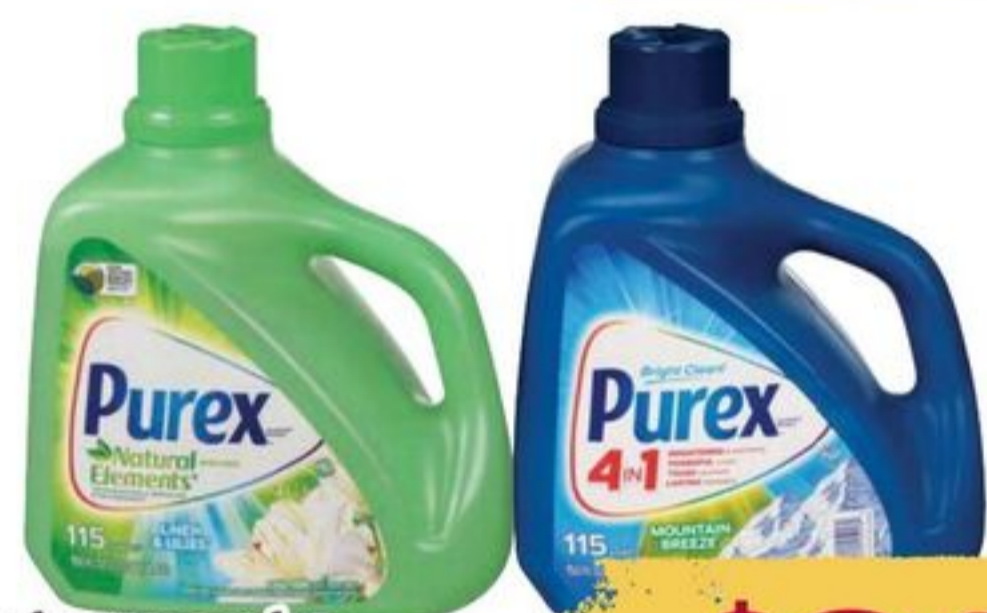
Detergente Purex Purex Liquid Detergent, 150 oz