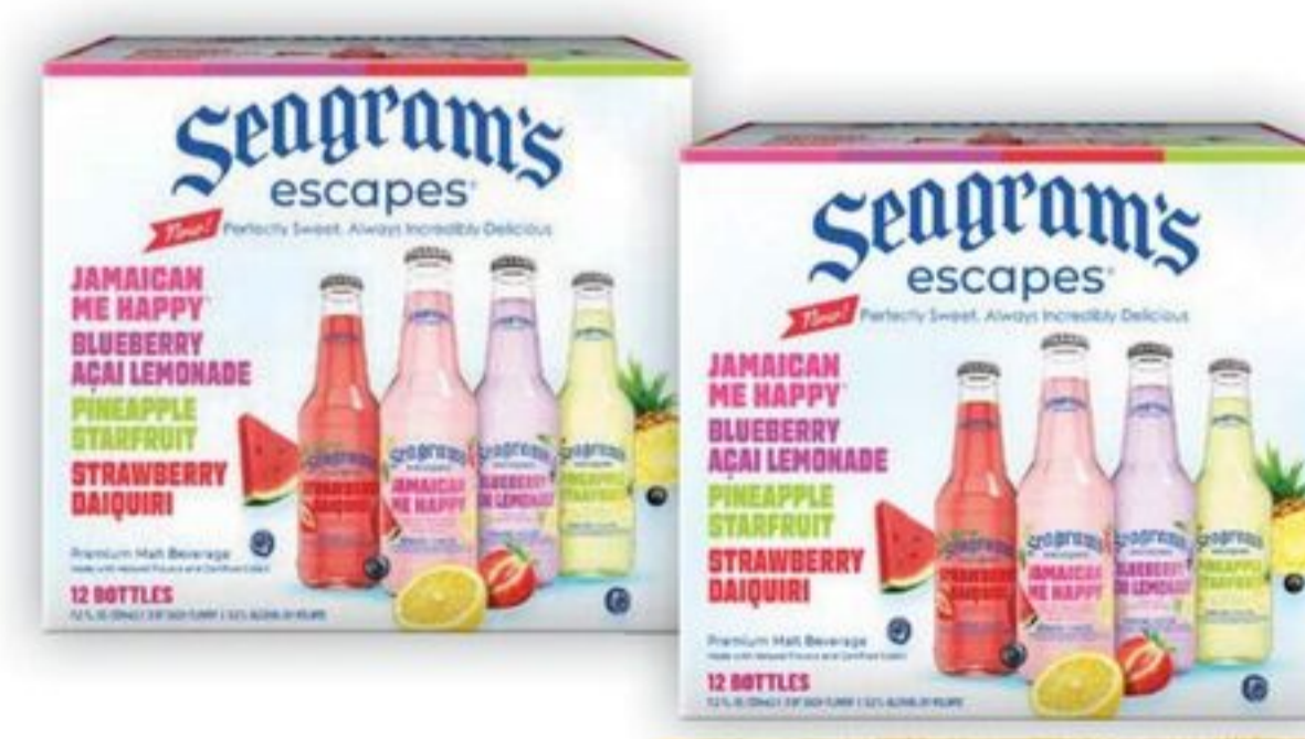
Seagram's 12 Pk, 11.2 oz Bottles