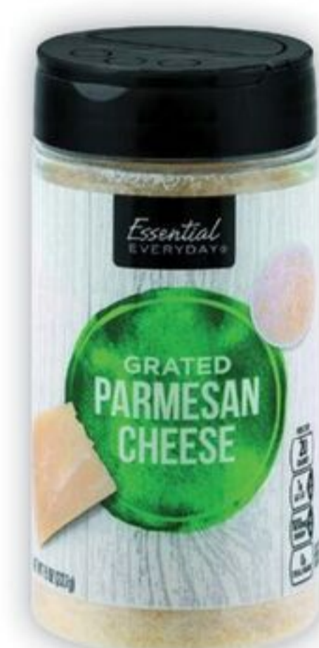
Queso Rallado Parmesano EED Parmesan Grated Cheese, 8 oz