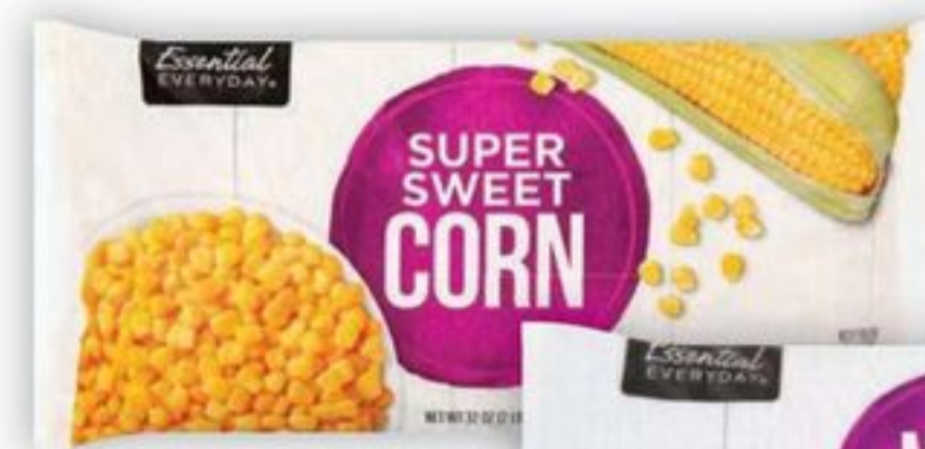
Vegetales Congelados EED Frozen Vegetables, 32 oz