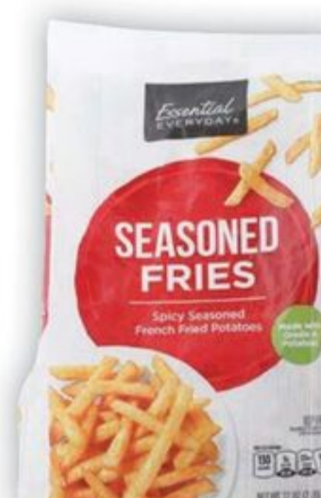
Papas Congeladas EED Frozen Fries, 19.05-32 oz