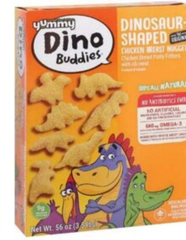
Trocitos de Pollo Yummy Dino Buddies Chicken Breast Nuggets, 56 oz