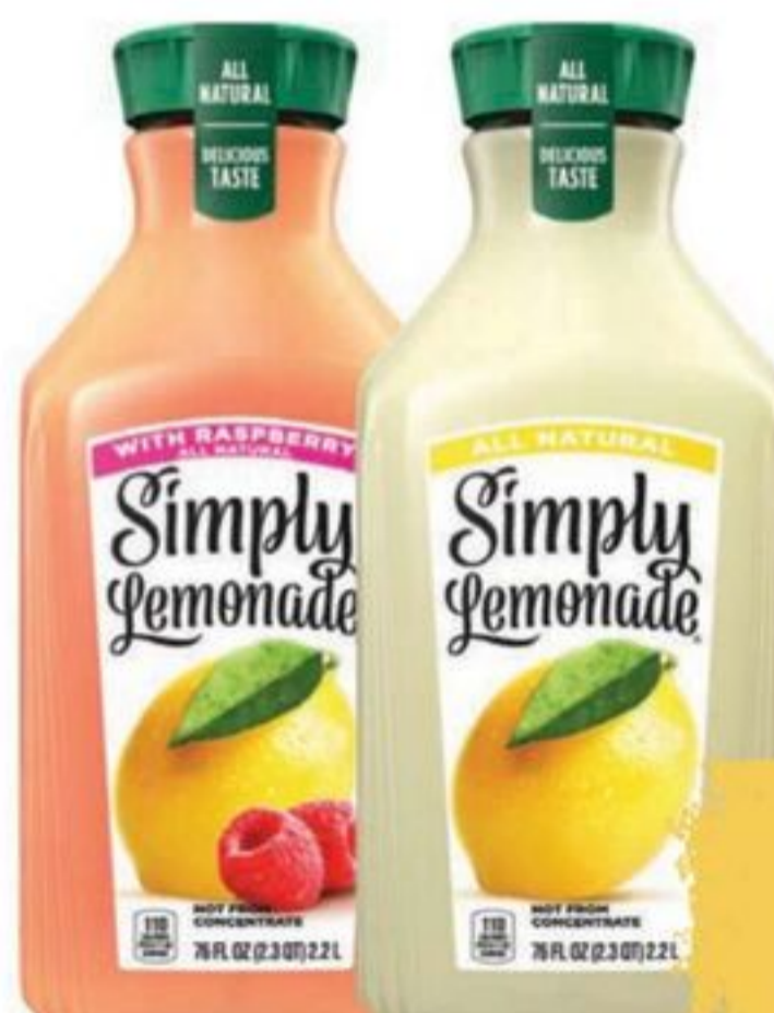
Limonadas Simply Lemonades 76 oz