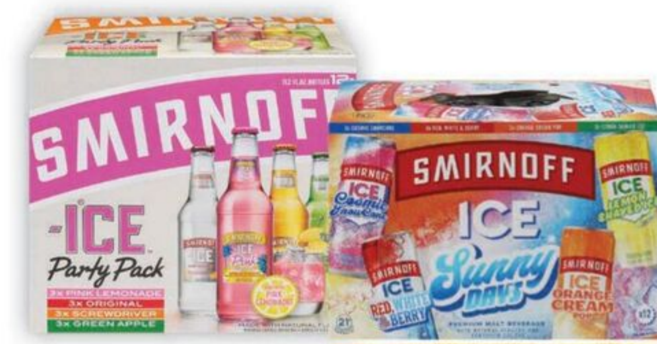
Smirnoff 12 Pk, 11.2-12 oz Cans or Bottles