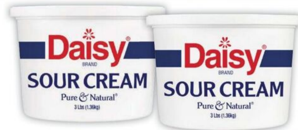
Crema Agria Daisy Sour Cream, 48 oz