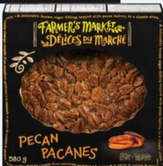
FARMER'S MARKET™ PIES SELECTED VARIETIES 580 G-1 KG 21297359_EA/21297365_EA