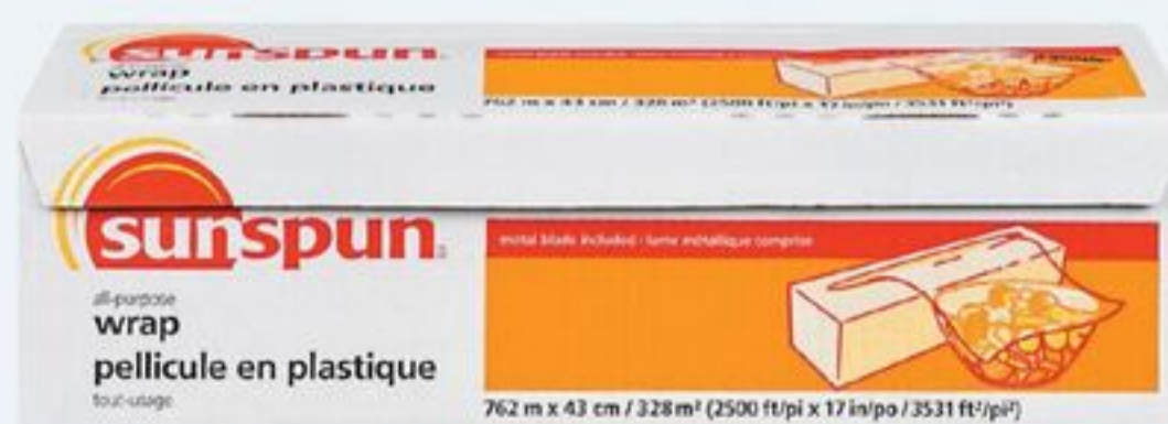
SUNSPUN™ ALL-PURPOSE WRAP 2500' X 17" 20077370_EA