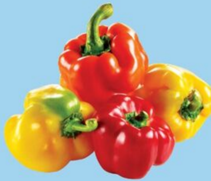
NO NAME® NATURALLY IMPERFECT™ MIXED PEPPERS PRODUCT OF MEXICO 2.5 LB 20921434001_EA