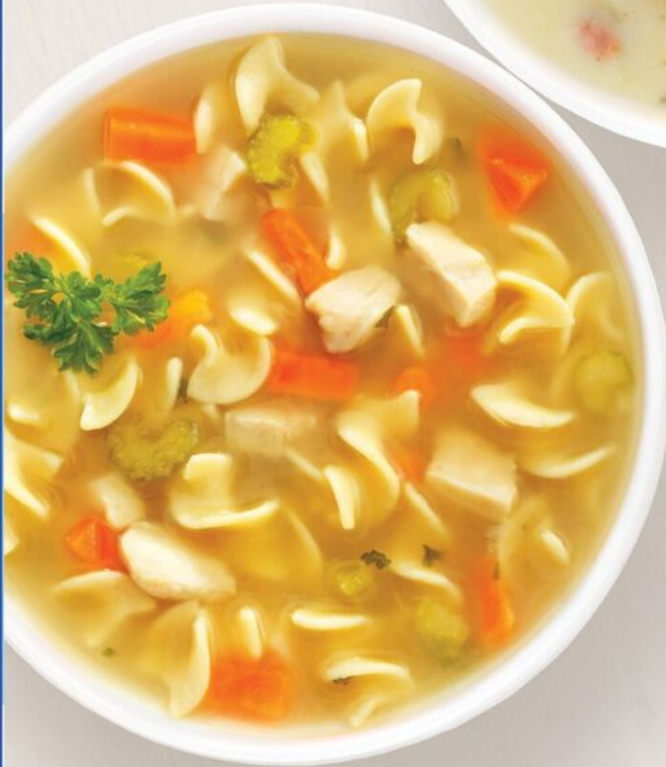
Classic Chicken Noodle