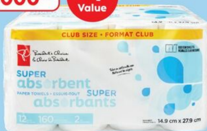
PC® PAPER TOWEL 12 ROLLS 21558605_EA