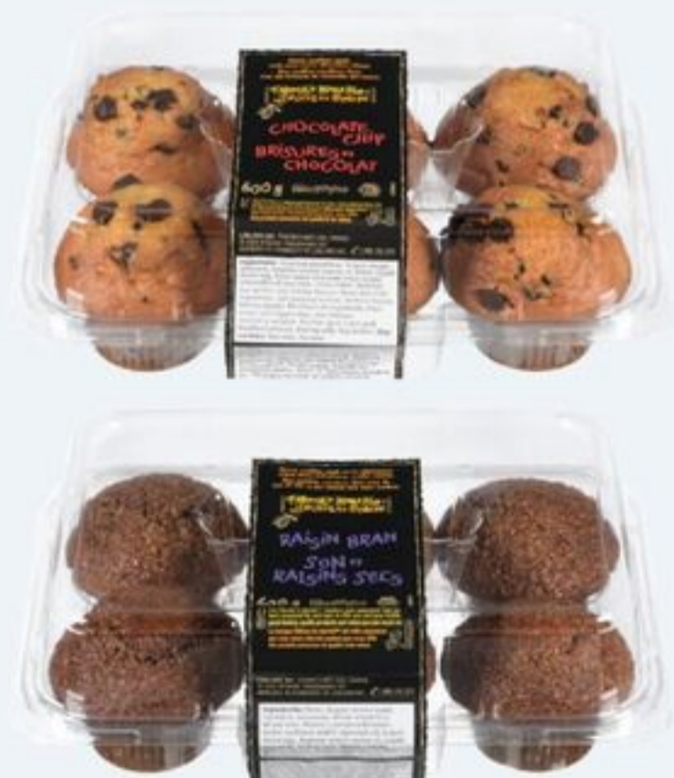
FARMER'S MARKET™ MUFFINS SELECTED VARIETIES 6'S 21283358_EA/21283359_EA