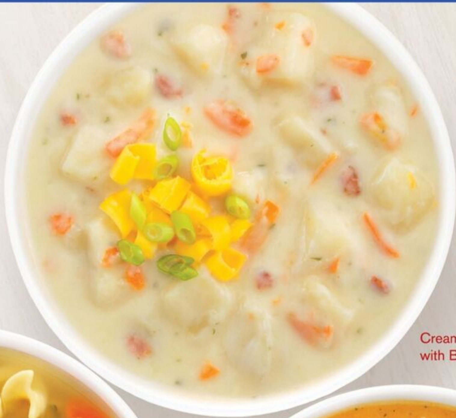
Cream of Potato with Bacon