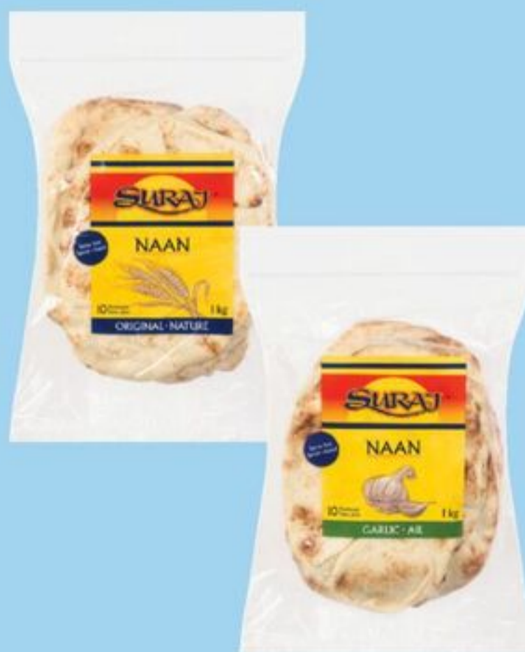
SURAJ® NAAN SELECTED VARIETIES 10'S 20342261_EA/20343319_EA