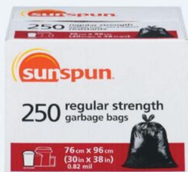
SUNSPUN™ GARBAGE BAGS REGULAR STRENGTH 30" X 38" 250'S 20003027_EA