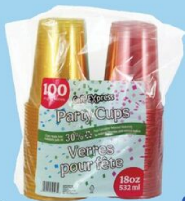
CAFÉ EXPRESS PET PARTY CUPS 18 OZ 21675127_EA