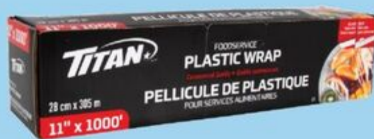
TITAN PLASTIC FOOD WRAP 21725048_EA