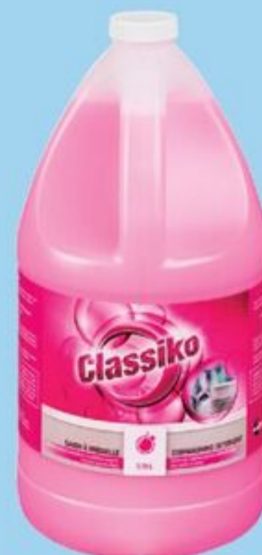
CLASSIKO PINK DISH SOAP 4 L 20170011_EA