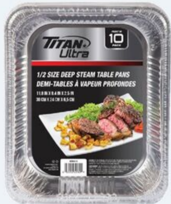
TITAN HALF STEAM PANS 10'S 21667077_EA