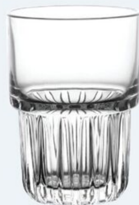
VITREX GLASSES OR TUMBLERS 21714231_EA/21715833_EA