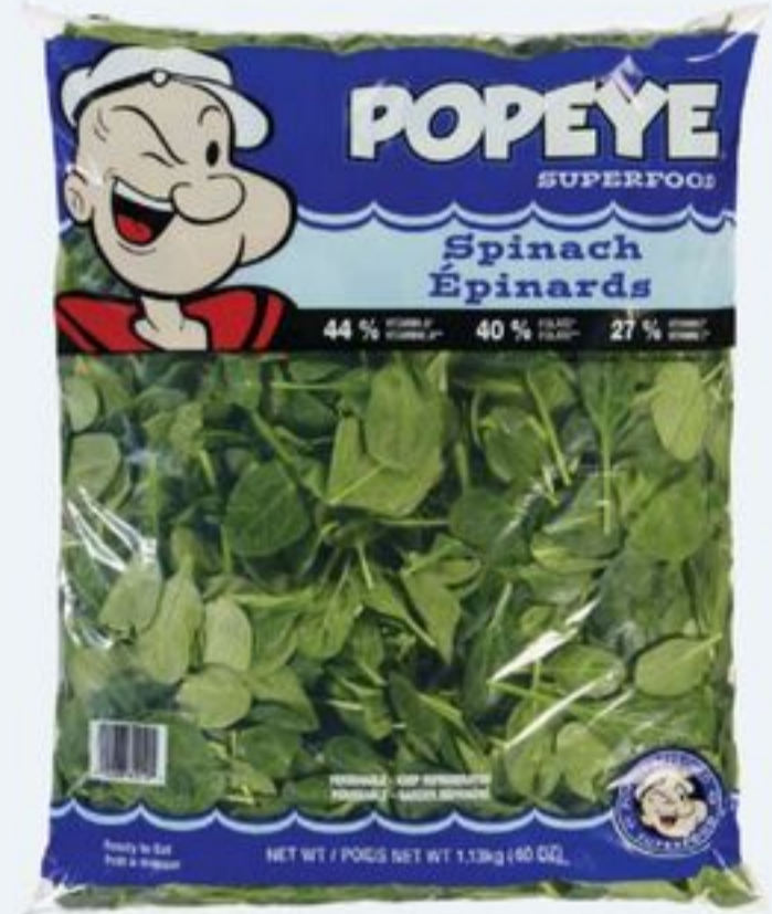
POPEYE SPINACH SELECTED VARIETIES PRODUCT OF U.S.A. 1.13 KG 20104062_EA