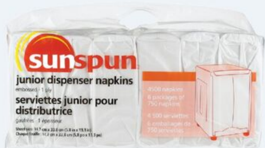
SUNSPUN™ JUNIOR DISPENSER NAPKINS 6 X 750'S 20426996_EA