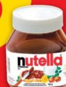
NUTELLA HAZELNUT SPREAD 725 g or NUTELLA & GO HAZELNUT SPREAD WITH BREADSTICKS 208 g tartina de noisettes ou tartina de noisettes avec bâtonnets 20436105_EA