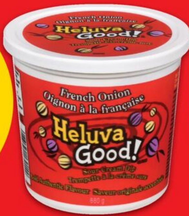
HELUVA GOOD! FRENCH ONION DIP 680 g trempeuse 20312788001_EA