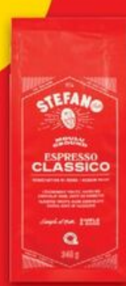
STEFANO GROUND COFFEE selected varieties 340 g café moulu 21729847_EA