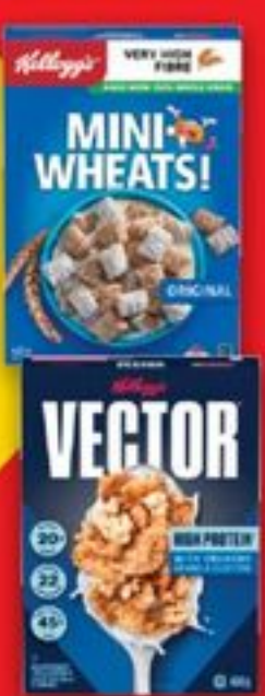
KELLOGG'S ALL BRAN 450/525 g, RAISIN BRAN 425/451 g, VECTOR 306/400 g, SPECIAL K 320-355 g or MINI-WHEATS 377-460 g CEREAL selected varieties céréales 20015041_EA/21607207_EA