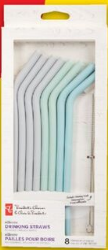
PC® SILICONE DRINKING STRAWS WITH BRUSH 21186435_EA