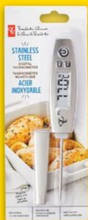
PC® INSTANT READ DIGITAL PEN THERMOMETER 21218258_EA