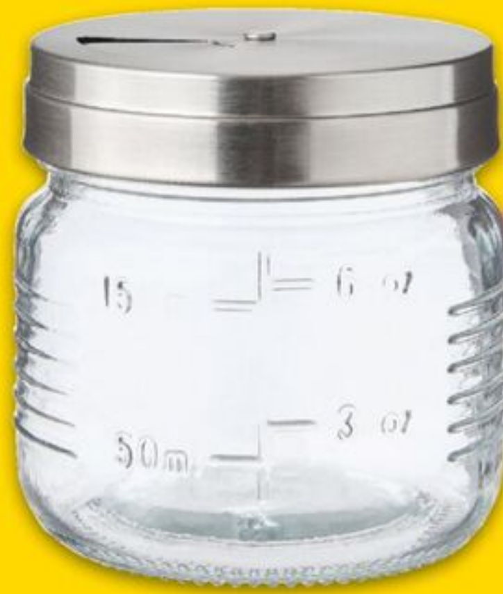
EVERYDAY ESSENTIALS™ SPICE SHAKER large 21162852_EA