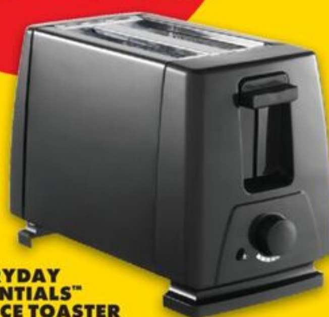
EVERYDAY ESSENTIALS™ 2 SLICE TOASTER 20219347002_EA