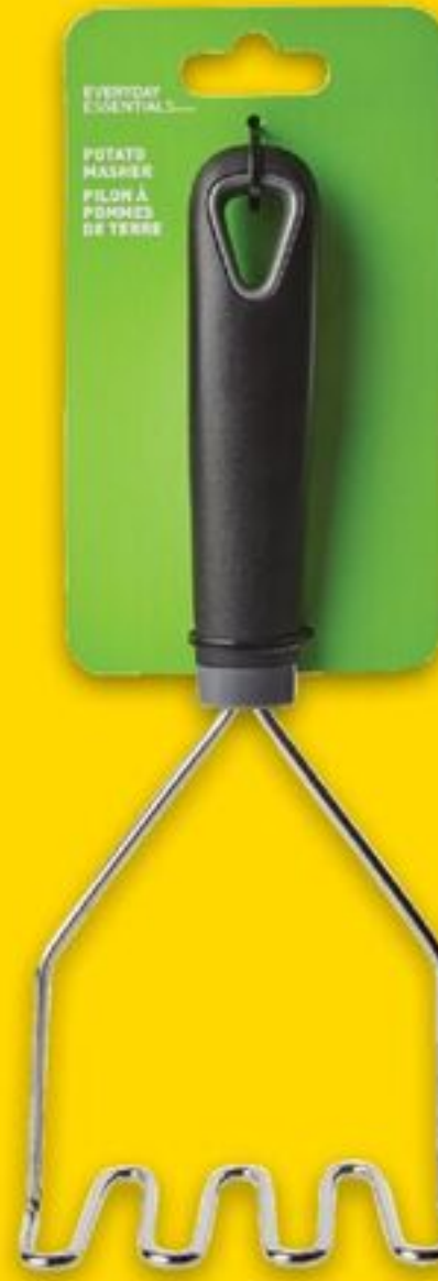
EVERYDAY ESSENTIALS™ POTATO MASHER 21214379_EA