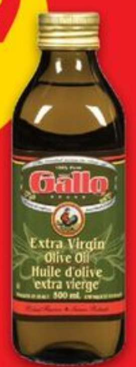
GALLO EXTRA VIRGIN OLIVE OIL 500 mL huile d'olive extra vierge 21189775_EA