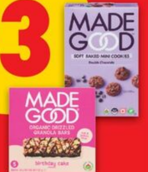
MADEGOOD GRANOLA BARS, COOKIES, MINI'S, CRISPY SQUARES or CRUNCHY SQUARES selected varieties, 110-150 g barres ou biscuits 21107622_EA/21352121_EA