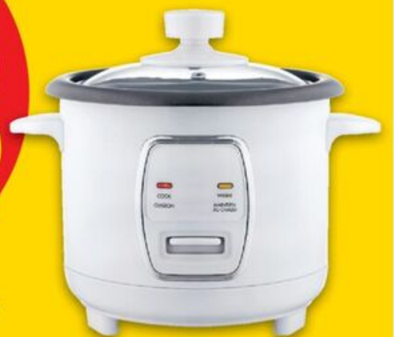
EVERYDAY ESSENTIALS™ 6 CUP RICE COOKER 20053721_EA