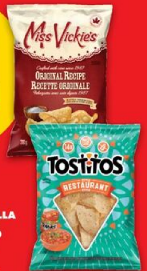
TOSTITOS TORTILLA 215-295 g or MISS VICKIE'S POTATO 190/200 g CHIPS selected varieties croustilles 21050575_EA/21240703_EA