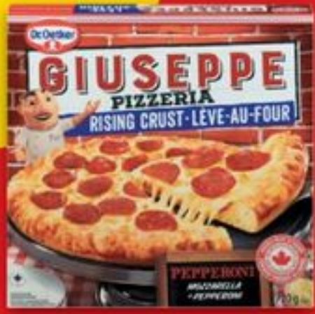
DR. OETKER THIN CRUST or RISING CRUST PIZZA selected varieties, frozen, 439-785 g pizza 21106361_EA