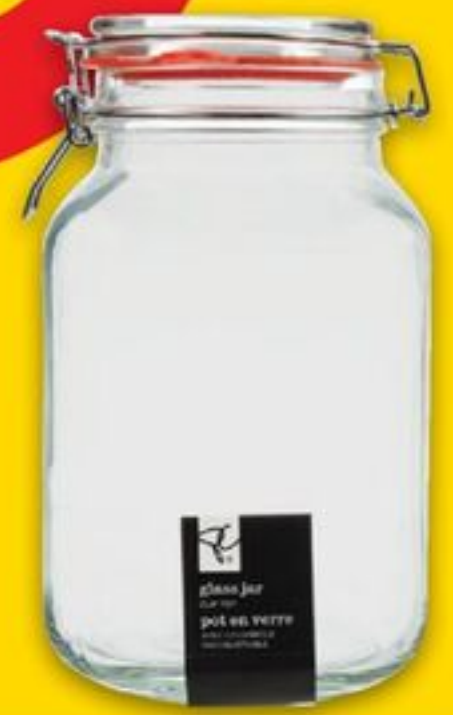
PC® SQUARE CLIP JAR 2.0 L 20774691_EA