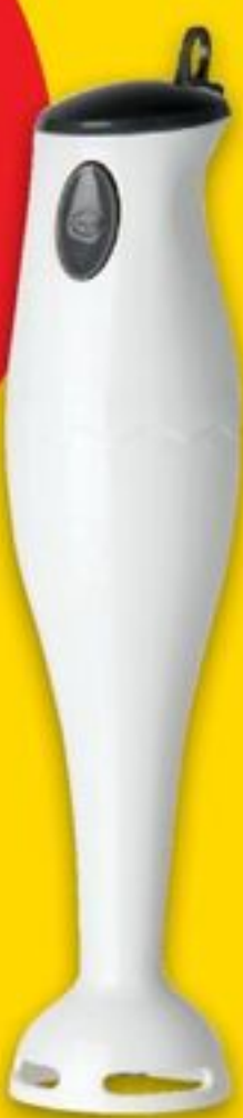
EVERYDAY ESSENTIALS™ HAND BLENDER 20164241_EA