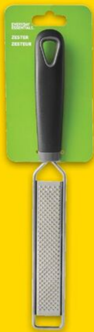
EVERYDAY ESSENTIALS™ HANDHELD ZESTER 21351350_EA