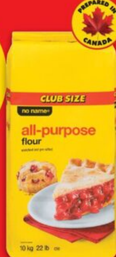
NO NAME® FLOUR Club Size, selected varieties 10 kg farine 20022248_EA