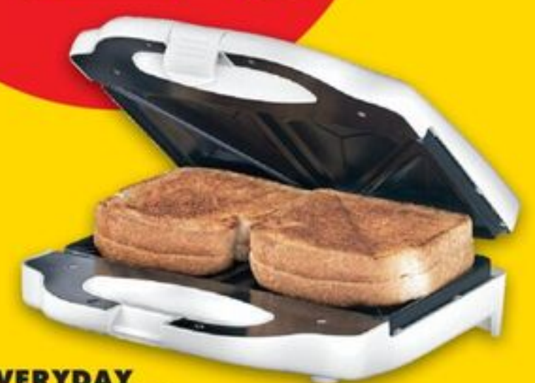
EVERYDAY ESSENTIALS™ SANDWICH MAKER 20164267_EA