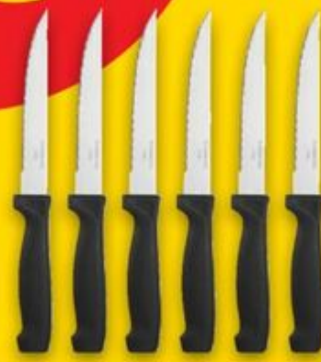
EVERYDAY ESSENTIALS™ 6-PIECE STEAK KNIFE SET 20113389_EA