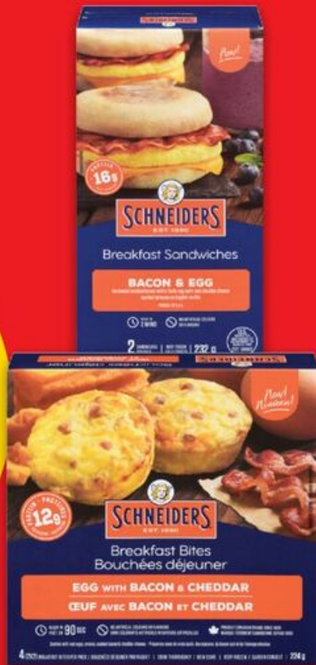
SCHNEIDERS BREAKFAST SANDWICH or EGG BITES selected varieties, frozen 204-288 g sandwich déjeuner ou bouchées aux œufs 21623288_EA/21623323_EA