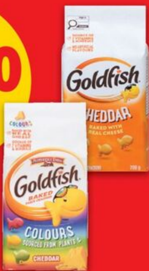
GOLDFISH CRACKERS selected varieties 167-227 g craquelins 20300320_EA/20306994003_EA