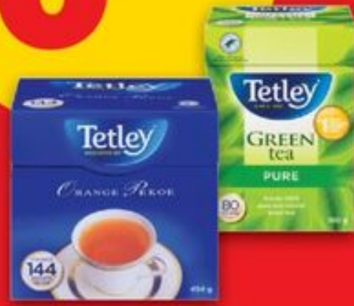
TETLEY TEA selected varieties, 80/144's thé 20711164_EA/21613866_EA