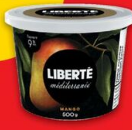
LIBERTÉ MÉDITERRANÉE 500 g, CRUNCH 2's or YOPLAIT PROTEIN 650 g YOGURT selected varieties yogourt 21547567_EA