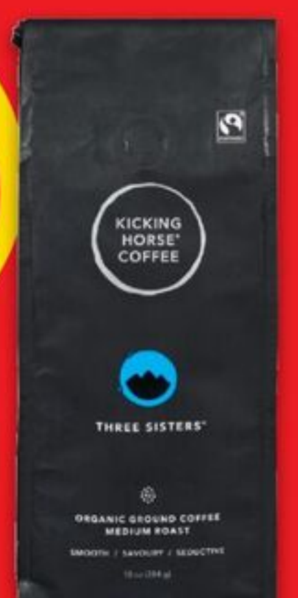
KICKING HORSE ORGANIC GROUND COFFEE selected varieties 284 g café moulu 20805126001_EA