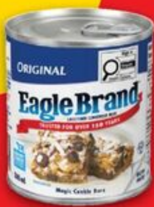
EAGLE BRAND SWEETENED CONDENSED MILK selected varieties, 300 mL lait condensé sucré 21012618_EA