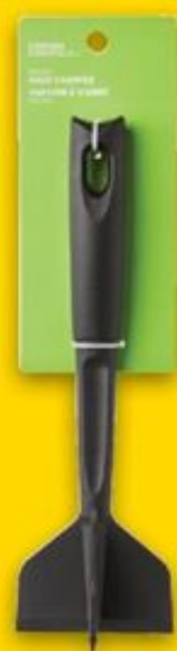
EVERYDAY ESSENTIALS™ GROUND MEAT CHOPPER 21499056_EA