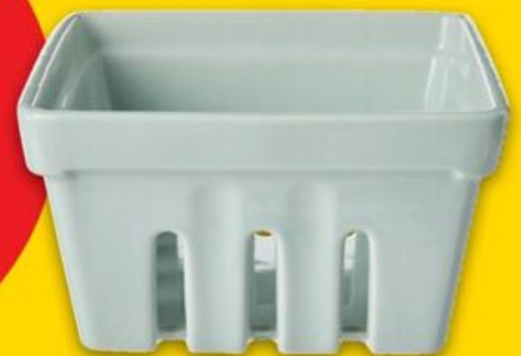
PC® CERAMIC BERRY PINT blue 21351929_EA