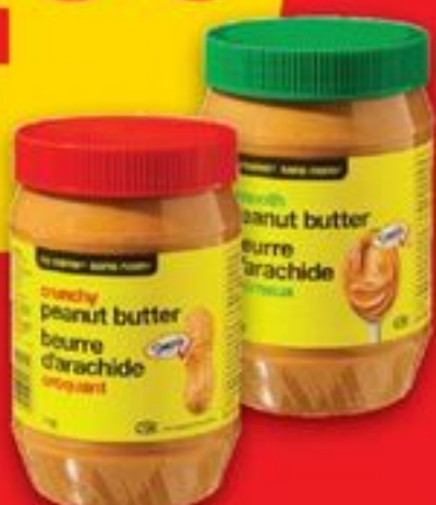
NO NAME® PEANUT BUTTER selected varieties, 1 kg beurre d'arachide 20296985001_EA/20296985002_EA