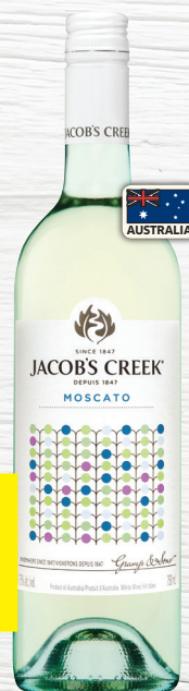
JACOB'S CREEK Moscato 750 mL