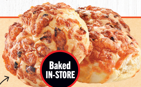
Baked IN-STORE Sourdough Buns 4 pk 315-345 g Made with 100% Canadian Flour