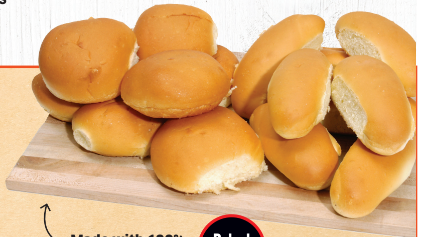
Baked IN-STORE Hot Dog or Burger Buns 8 pk Made with 100% Canadian Flour