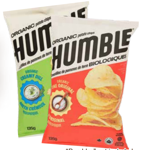
"Rumbles" not included