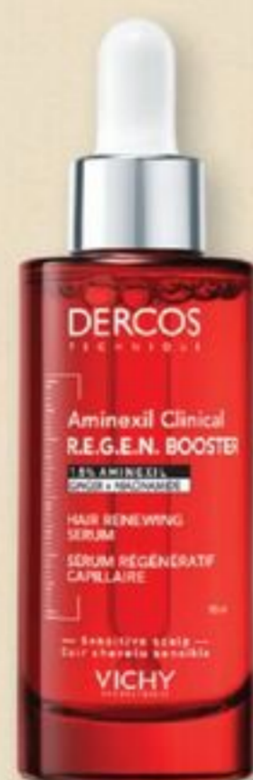
VICHY Dercos Boost Serum Sérum 90 ml