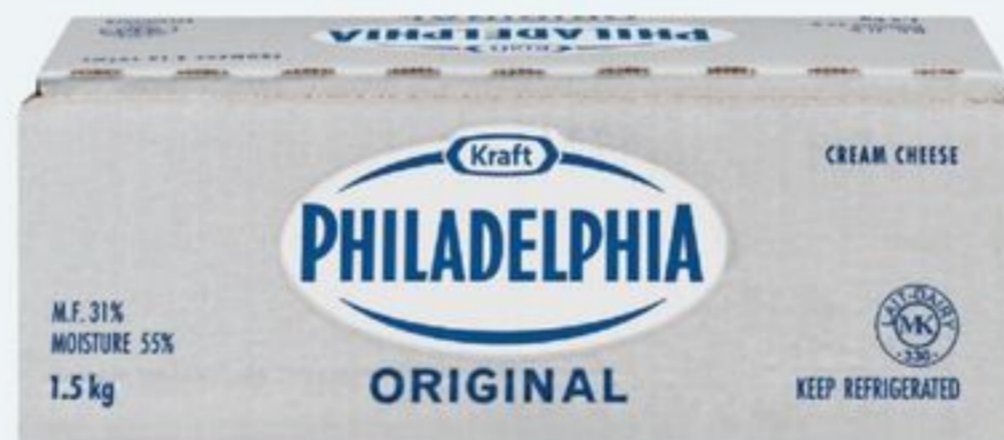
PHILADELPHIA CREAM CHEESE 1.5 KG 20017153002_EA