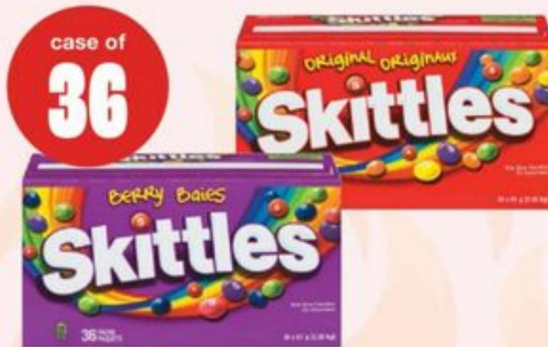
SKITTLES OR STARBUST CANDIES SELECTED VARIETIES 36'S 20686198001_C36/20707917_C36