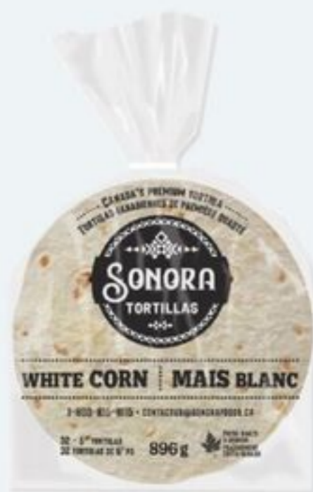
SONORA CORN TORTILLAS WHITE, 896 G 21611146_EA