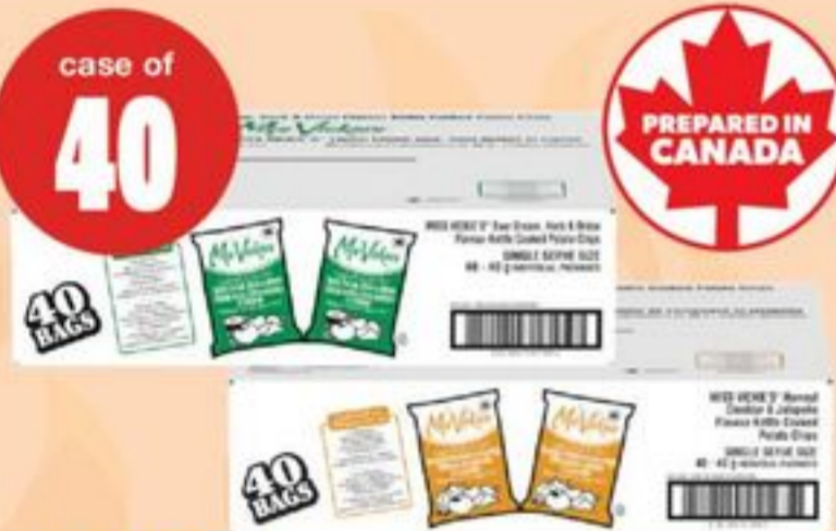
MISS VICKIE'S KETTLE COOKED POTATO CHIPS SELECTED VARIETIES, 40'S 21588060_C40/21677298_C40