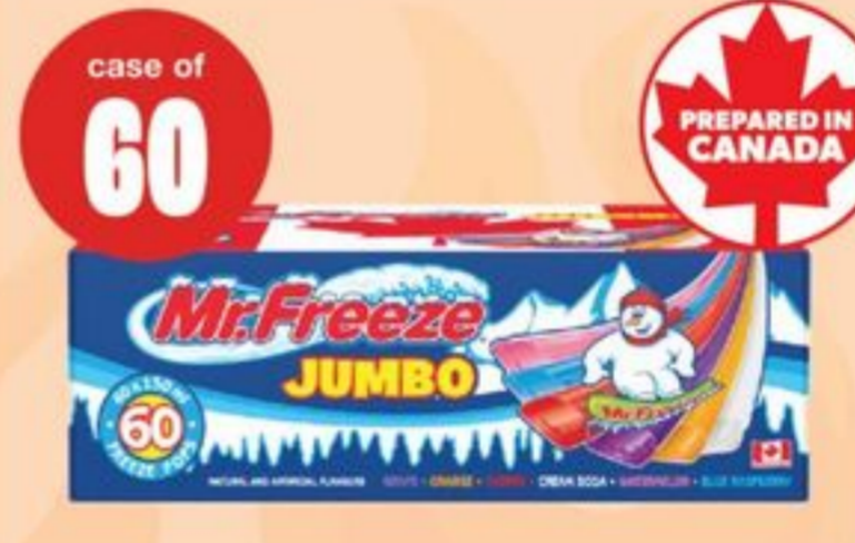
MR. FREEZE JUMBO 60'S 21023268_C60