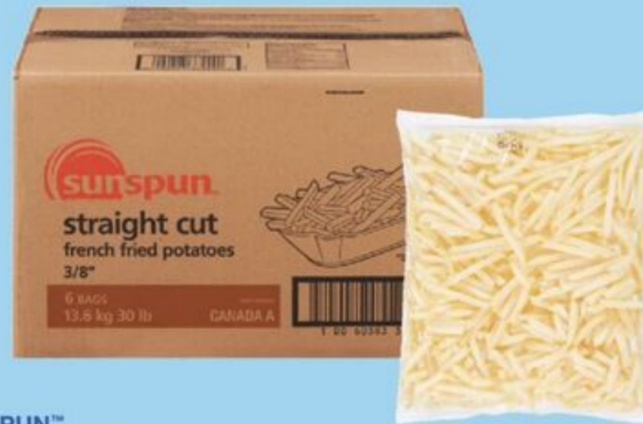
SUNSPUN™ STRAIGHT CUT 3/8 FRENCH FRIES FROZEN, 13.6 KG 20313990001_EA