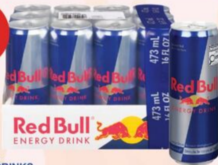
RED BULL ENERGY DRINKS SELECTED VARIETIES 12 X 473 ML 20370365001_C12