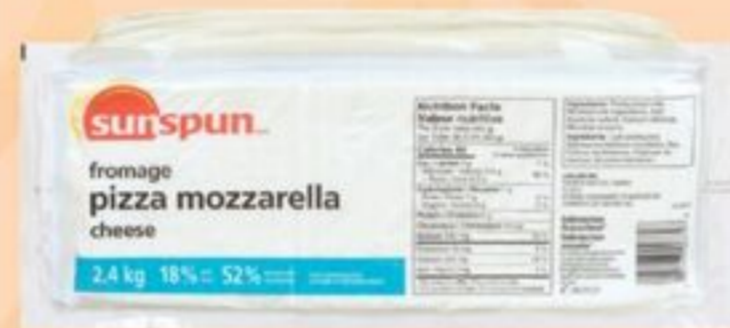
SUNSPUN™ PIZZA MOZZARELLA CHEESE 18% M.F., 2.4 KG 21383785_EA