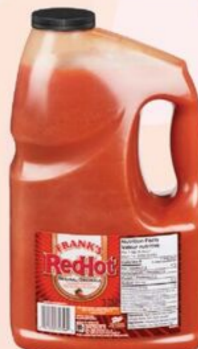
FRANK'S REDHOT SAUCE ORIGINAL 3.78 L 20130877_EA