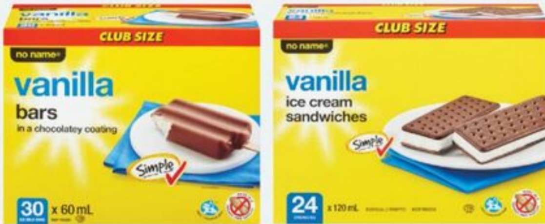
NO NAME® ICE CREAM BARS OR SANDWICHES CLUB SIZE, 24-30'S SELECTED VARIETIES, FROZEN 20347400001_EA/21013432_EA