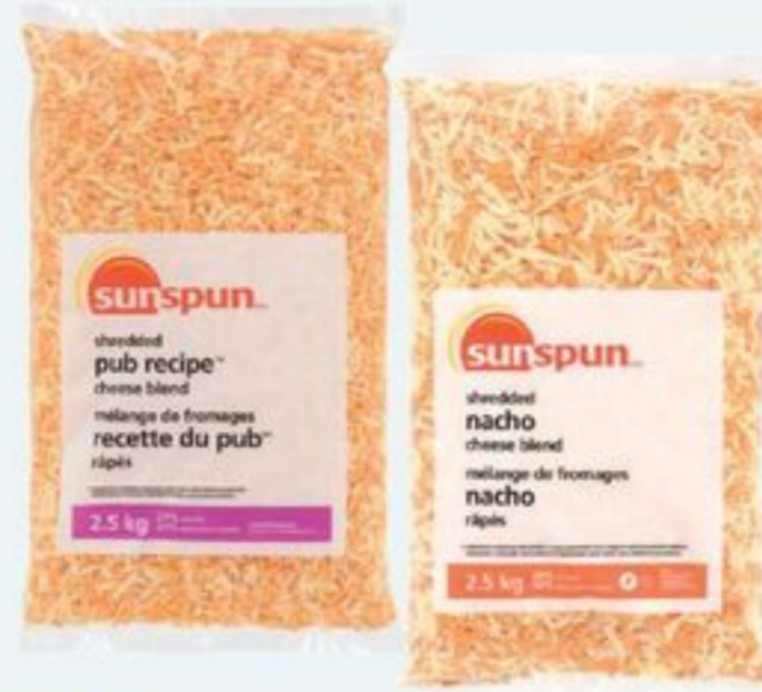
SUNSPUN™ SHREDDED CHEESE SELECTED VARIETIES 2.5 KG 21362802_EA/21362853_EA