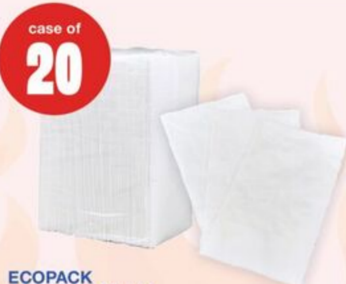
ECOPACK DINNER NAPKINS WHITE, 15 X 17" 20 SLEEVES X 150'S 21734370_C20