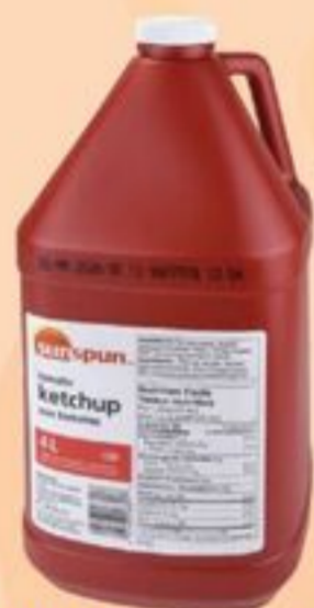
SUNSPUN™ KETCHUP PUMP 4 L 21202857_EA