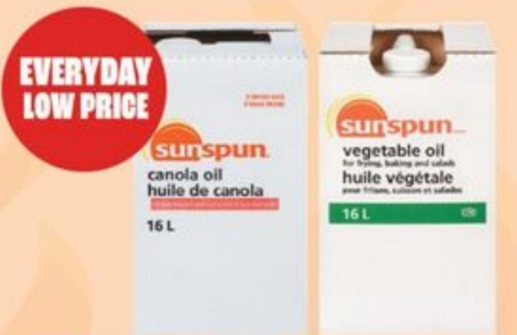
SUNSPUN™ CANOLA OR VEGETABLE OIL SELECTED VARIETIES, 16 L 20024719_EA/20126146_EA