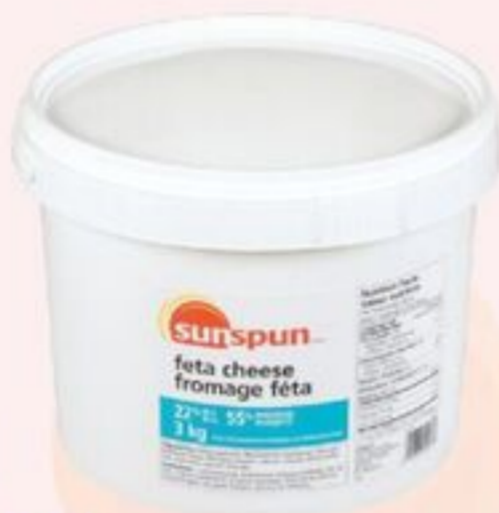
SUNSPUN™ FETA CHEESE 22% M.F., 3 KG 21279915_EA