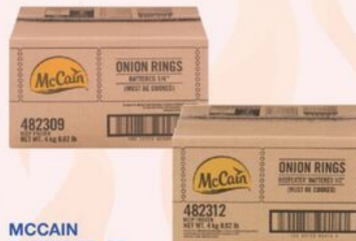
MCCAIN BATTERED OR BEEFEATER ONION RINGS FROZEN, 4 KG 20083180_EA/20779718_EA