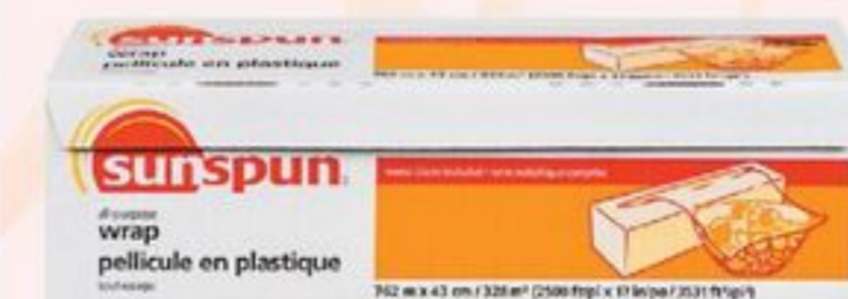
SUNSPUN™ ALL-PURPOSE WRAP 2500' X 17" 20077370_EA