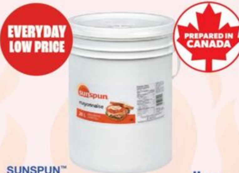
SUNSPUN™ MAYONNAISE 20 L 21123869_EA