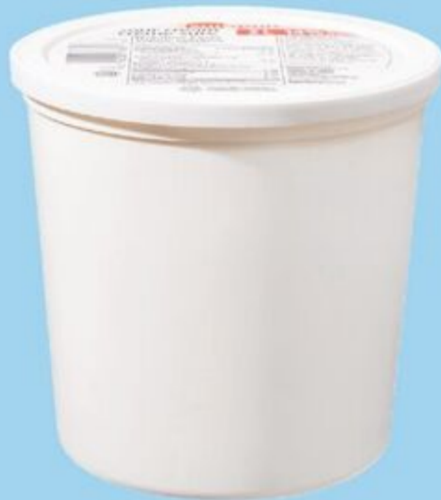
SUNSPUN™ SOUR CREAM 14% M.F., 2 L 20160751_EA