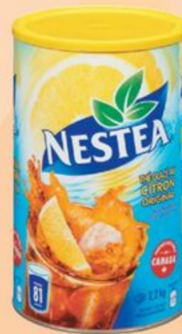
NESTEA DRINK CRYSTALS 2.2 KG 20098328_EA