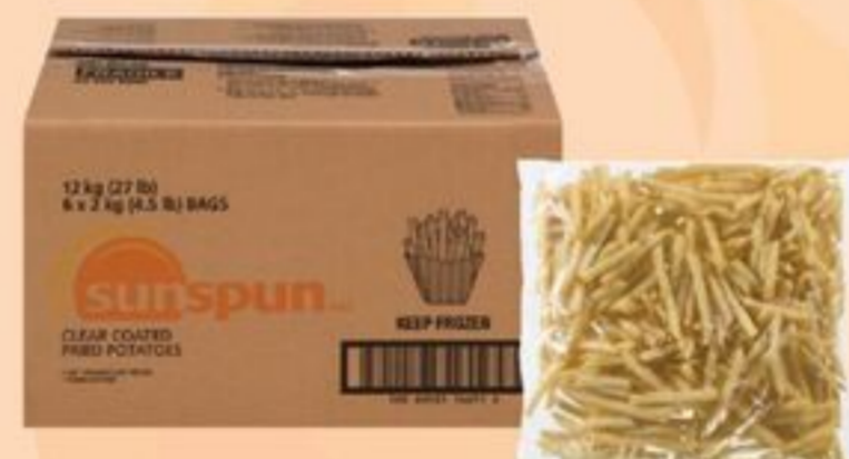
SUNSPUN™ CLEAR COATED FRIES FROZEN, 27 LB 20905111_EA