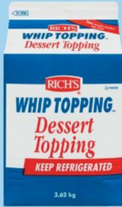
RICH'S WHIP TOPPING DESSERT TOPPING 3.62 KG 20024546_EA