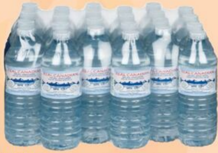
REAL CANADIAN SPRING WATER 24 X 500 ML 20122584_C28